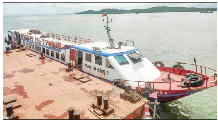
Under the Township COVID-19 Control and Emergency Response Committee Programme, the express water ferry services are being halted from 21 July to 25 July to make COVID-19 disease prevention and control more effectively.

The express water ferry services between Kyungsu and Myeik have been temporarily suspended starting from 21 July to prevent the spreading