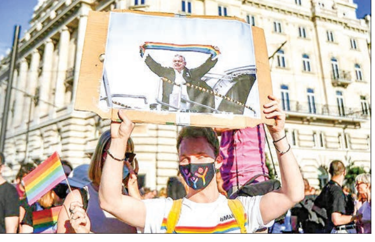
Hungary's Prime Minister Viktor Orban said Wednesday that a referendum would be held to gauge domestic support for a controversial LGBTQ law, after the European Commission launched legal action against Budapest over the measure.

referendum, which he presented European Union would like to as a list of demands that the