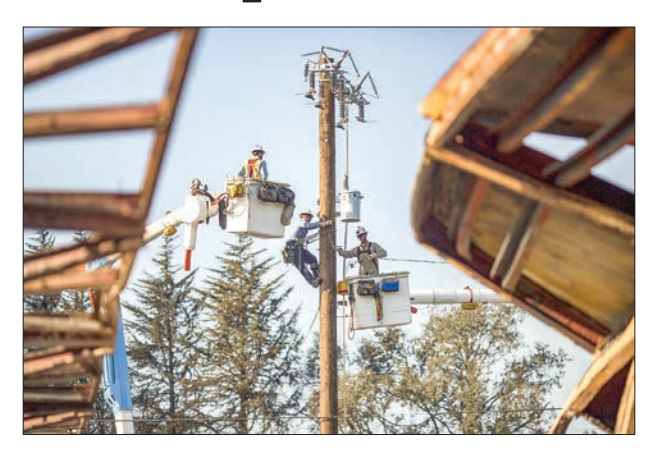
Pacific Gas and Electric Company crews work to restore power near fire-damaged Cardinal Newman High School in Santa Rosa, California on October 14, 2017.