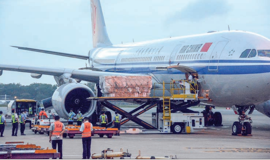
A total of 736,000 doses of COVID-19 vaccines and related materials manufactured by Sinopharm Company and donated from the People's Republic of China arrived yesterday at the Yangon International Airport.

between China and Myanmar and the development of practical cooperation against the pandemic. He added a special route has been opened through Yunnan Provence to provide