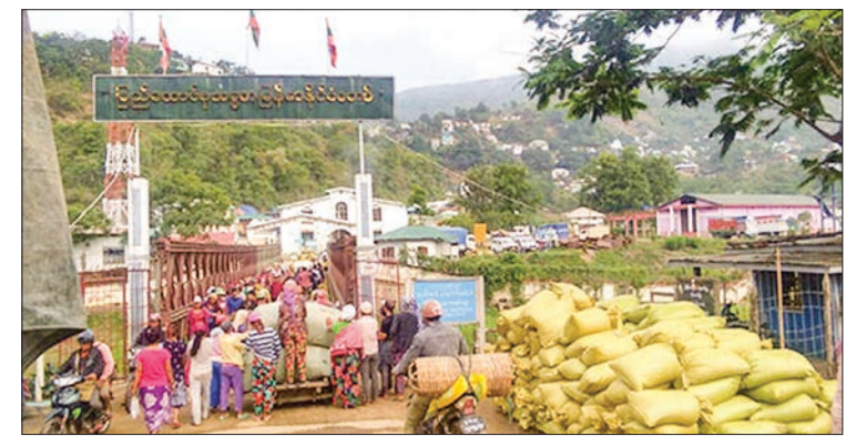
Between 1 October and 9 July in the current budget year, trade volume via the Tamu border gate totalled over $32.6 million, with exports valued at $31.73 million and imports $0.88 million.

THE value of border trade between Myanmar and India amounted to US$193 million between 1 October and 9 July of the current financial year 2020-21 amid the closure of border posts by India.