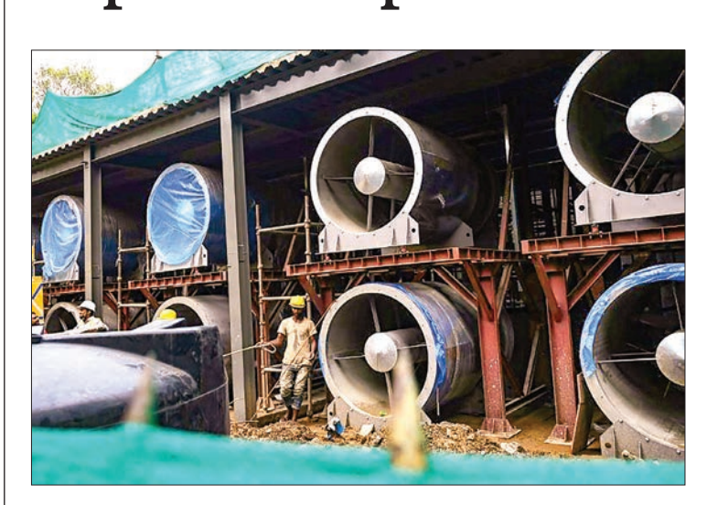
The fresh air tower's benefits are contested by environmental experts who say it will make little difference to the city's air quality.

A new attempt at purifying New Delhi's notoriously polluted air will see forty giant fans push out filtered air in the heart of the Indian capital's posh downtown shopping district.