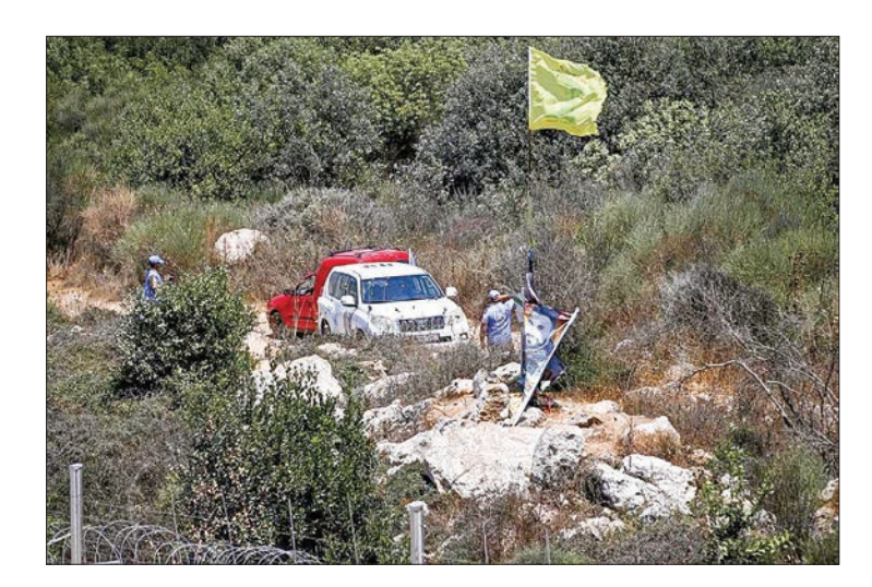
United Nations peacekeepers stand next to a Hezbollah flag raised on the Lebanese side of the border fence with Israel, near the northern Israeli settlement of Shtula.

ISRAEL shelled Lebanon early Tuesday in response to earlier rocket attacks, the Israeli army