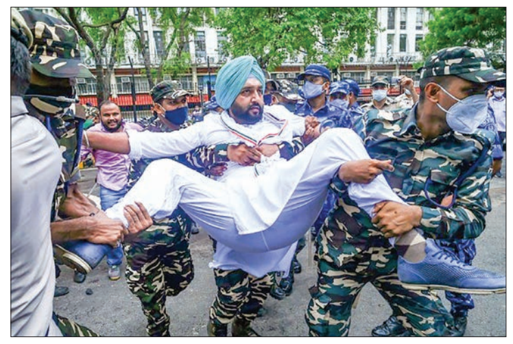
India's Congress party members were detained by security personnel as they took part in a demonstration against an alleged surveillance operation using the Pegasus spyware.

ment should order a joint parliamentary committee probe to investigate the entire matter," he told reporters in New Delhi.