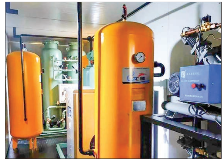
According to a member of the Kawlin Township Oxygen Implementation Committee, a deposit of US$23,500 has already been paid for the oxygen plant construction and equipment will arrive at the port of Yangon within 45 days of signing the contract and will be transported to Kawlin as soon as possible.

For the future processes of the oxygen plant, the township elders will move forward with Shwe Kawlin oxygen-supplying association, philanthropic groups and young volunteers, officials said. - Myint Tun Min (Kawlin)/ GNLM