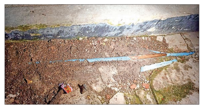
On 19 July, the insurgents destroyed the oxygen pipeline connected to the ICU at North Okkalapa General Hospital in Yangon. Therefore, only 25 per cent of oxygen was supplied to the patients and it also caused casualties. The officials repaired the pipeline yesterday and provided the needed oxygen to the patients as usual.

THE State Administration Council has been working to conduct effective COVID-19 prevention, control and treatment activities since before the outbreak of the third wave of COVID-19. When the outbreak occurs, the SAC imposed rules and regulations to prevent the infection, conducted education programmes, established quarantine centres for suspected and confirmed patients in respective townships. Moreover, they promoted the local oxygen production rate and also imported the oxygen cylinders, vaccines