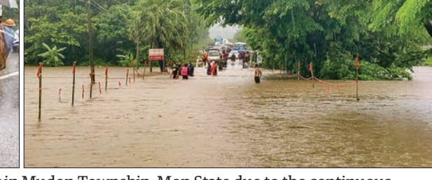
Flood impacted road transport at 1 pm on 20 July in Mudon Township, Mon State due to the continuous rainfall from 4 pm on 19 July. The heavy rainfall resulted in a flood on Mawlamyine-Thanbyuzayat Road between Hneepadaw village and Yaungdaung village in Mudon Township.