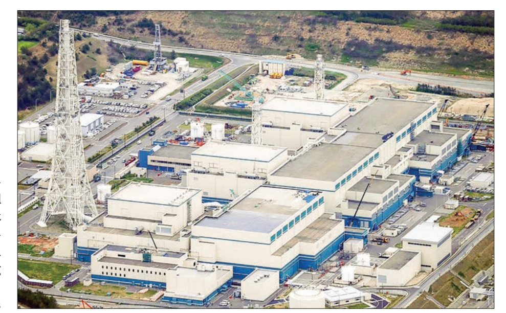
Reactors at Kashiwazaki-Kariwa nuclear power plant.

Touching on scandals that have recently come to light such as inadequate security measures at the Kashiwazaki-Kariwa plant in Niigata Prefecture, Kobayakawa underscored