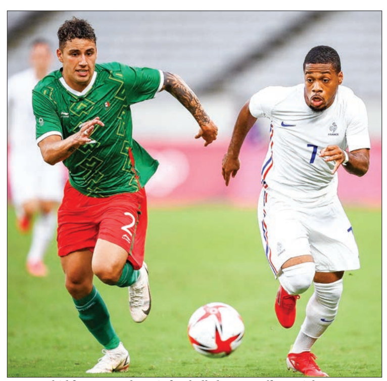
France's bid for men's Olympic football glory got off to a nightmare start with a 4-1 defeat by Mexico on Thursday, while a strong Spain side stuttered to a goalless stalemate with Egypt.