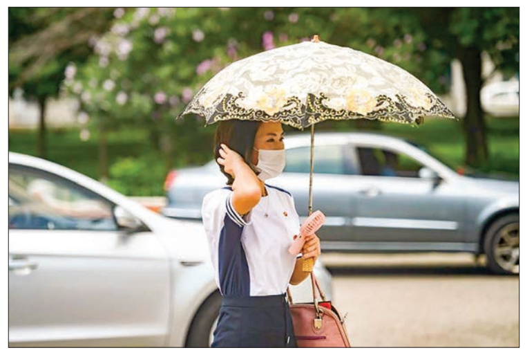
Pyongyang's residents are coping with higher-than-average temperatures.

Despite the sizzling climate, everyone sweated it out in face masks to prevent the spread