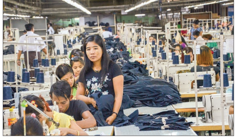
Of the seven export groups, agricultural exports showed an increase of $953.74 million against a year-ago period whereas exports of livestock, forest products, minerals, fishery products and finished industrial goods drastically declined.

This year, Myanmar's top export countries are listed China, Thailand, Japan, India, the USA, Spain, Germany, the UK, ROK and the Netherlands. – KK/GNLM