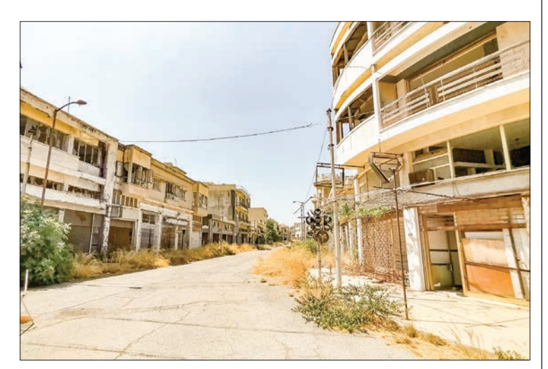
A view of the abandoned town Varosha (Maraş) in northern Cyprus, 2 Sept. 2019.

Cyprus has been divided since 1974 when Turkey invaded