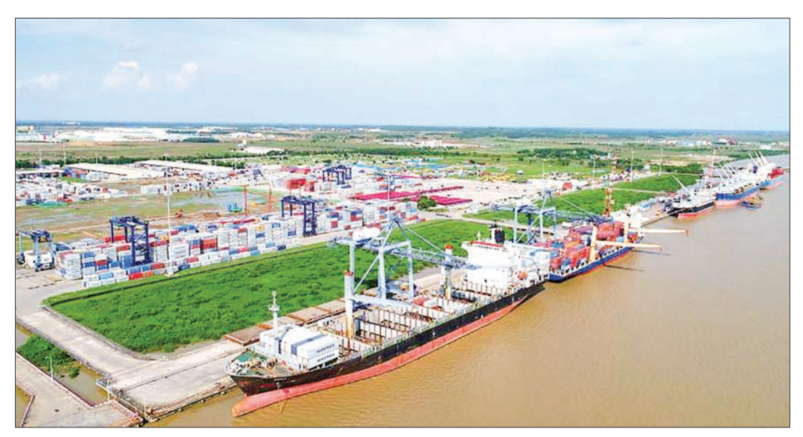
Myanmar International Terminal Thilawa (MITT).

Myanmar Port Authority ensures smooth freight flow with non-stop operation during the public holidays (17-25 July).