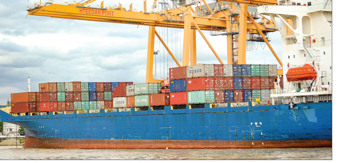
The top 10 import countries to Myanmar are China, Singapore, Thailand, Malaysia, Indonesia, India, Viet Nam, Japan, the Republic of Korea and the US, as per data of the Ministry of Commerce.

Last month, capital goods, such as auto parts, vehicles, machines, steel, and aeroplane parts were brought into the country. Their import value was estimated at $170.18 million. The figure