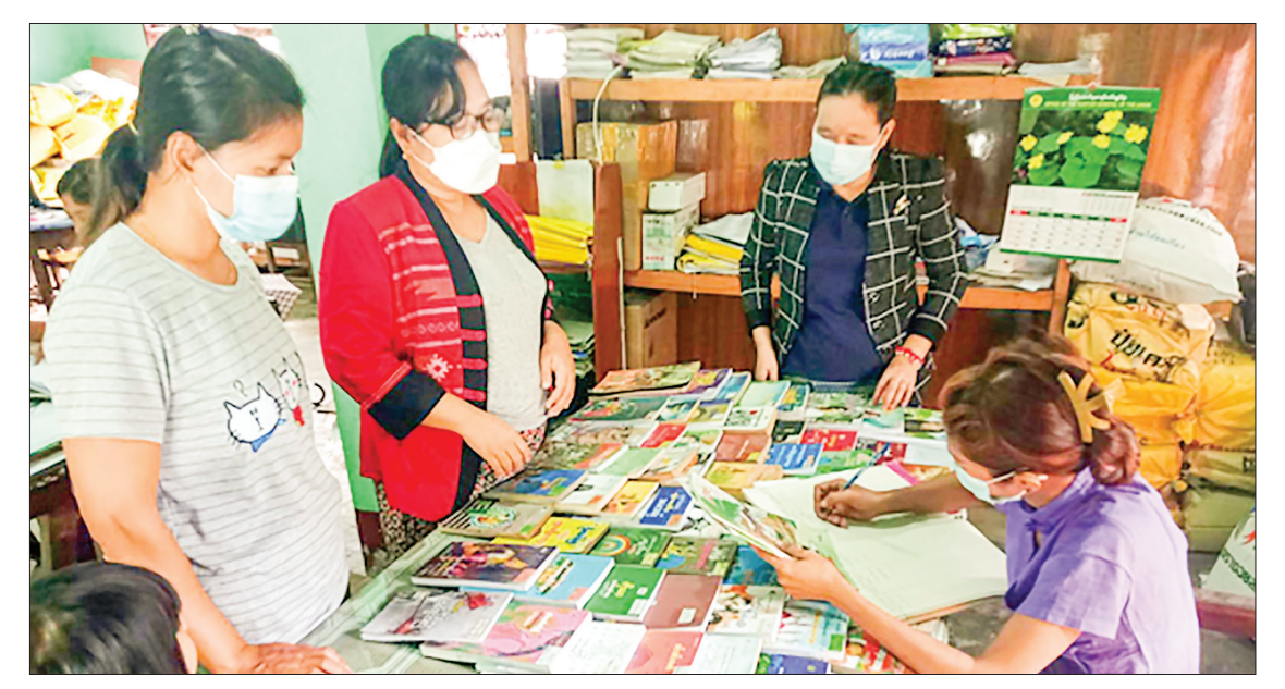
Readers are seen borrowing books from the mobile library.

In addition to debut books and educational talk shows, there are also books and magazines available to readers and bulletins are being rented out to the public, officials said.—Yin Yin Win (IPRD)/GNLM