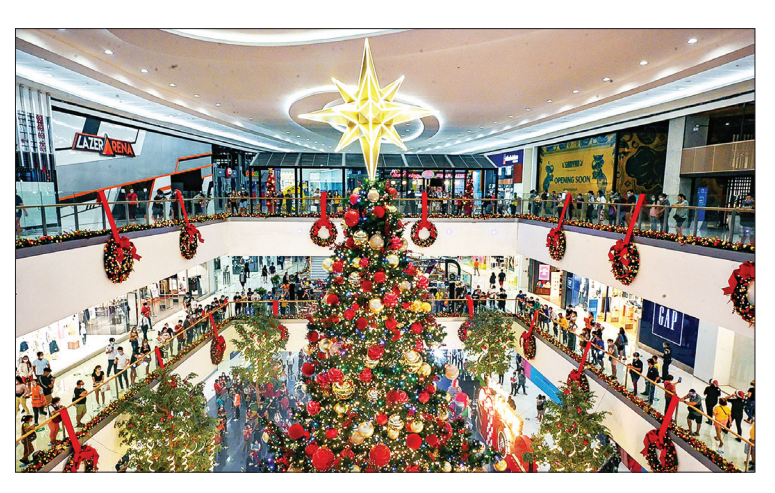
A lighting ceremony for a 18.29-metre-tall Christmas tree at the Mall of Asia in Manila .

will take the Philippines more than a decade to return to its pre-pandemic growth path. He said the "long-run total