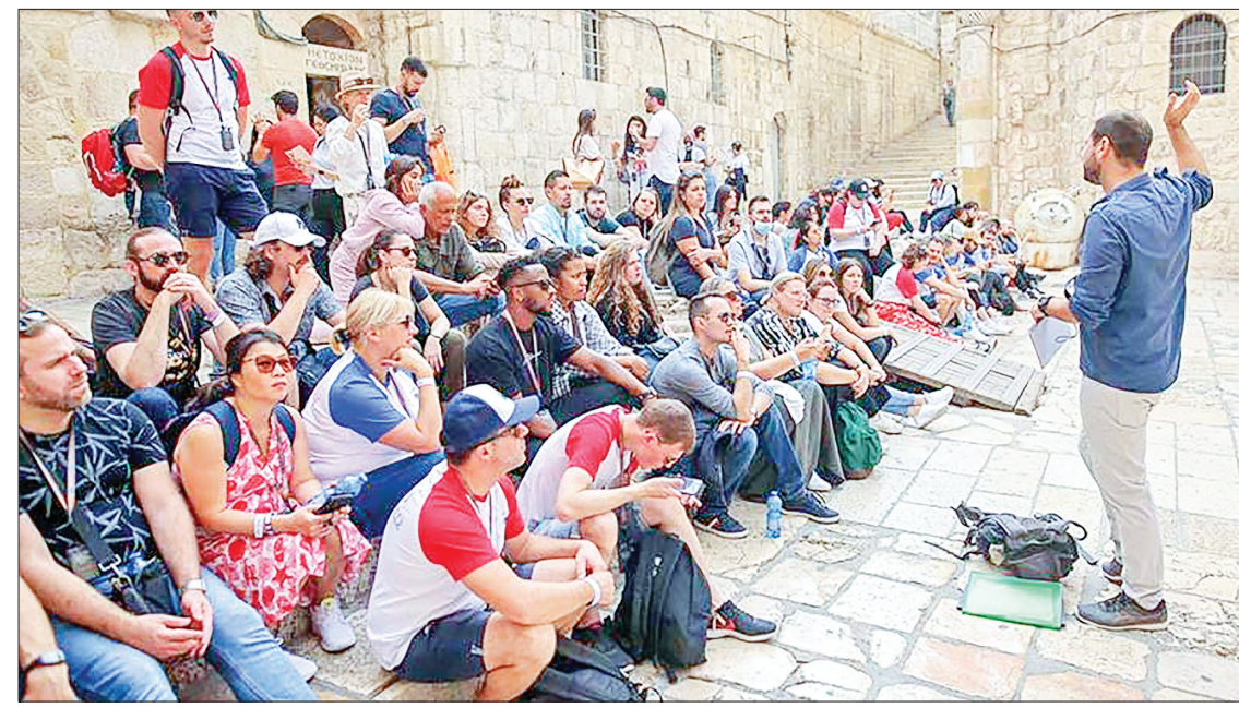
Tourists visit the Church of the Holy Sepulchre in the Old City of Jerusalem on 1 November 2021.

FOREIGN tourists who were double vaccinated more than six months ago will now be allowed to enter Israel in approved groups of five to 40 people — even if they have not received a booster shot, the Health and Tourism minis-