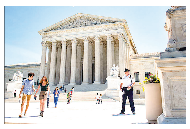
The US Supreme Court is seen in Washington, D.C., on 24 June 2019.

A district court in California dismissed the plaintiffs' claim, accepting the FBI argument that state secrets risked being