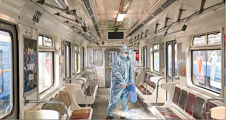
An employee wearing a protective suit disinfects a metro carriage in Kiev on 8 November 2021, amid the ongoing coronavirus disease (Covid-19) pandemic.

According to a WHO tally on 31 October, the number of confirmed coronavirus infections had increased by 3.02 million in a week, rising for the second week in a row. While many countries are reopening their economies in line with mass vaccination progress, the WHO has said it is important for people to wear masks in crowded environments