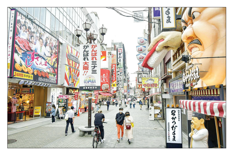
Businesses have welcomed the government's decision to lift the COVID-19 state of emergency in Tokyo and across 18 prefectures.

BUSINESS sentiment among workers with jobs sensitive to economic trends in Japan jumped in October to its highest level since January 2014 as the government lifted the state of emergency over the coronavirus, and eateries and retailers began recovering from the pandemic fallout, official data showed Tuesday. The diffusion index of confidence measuring the current mood compared with three months earlier among "economy watchers," such as taxi drivers and restaurant staff, climbed 13.4 points from September to 55.5, up