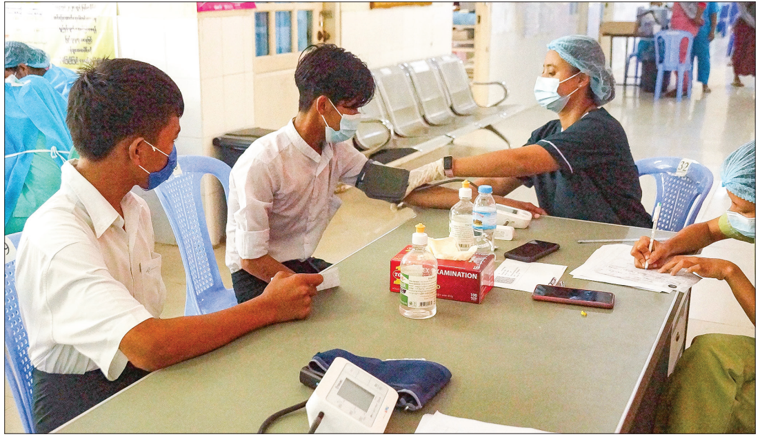
Immunization drive in Nay Pyi Taw.

HEALTH officials gave the first dose of Sinovac COVID-19 vaccines to over 12-year-old schoolchildren and over 18-year-old people at People's Hospital (50bed) in Pobbathiri Township, Ottara District, Union Territory in Nay Pyi Taw yesterday morning.