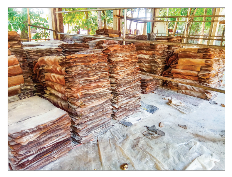
About 300,000 tonnes of rubber is produced annually across the country. Seventy per cent of rubber produced in Myanmar goes to China. It is also shipped to Singapore, Indonesia, Malaysia, Viet Nam, Korea, India, Japan and other countries.

THE price of rubber is unlikely to drop as long as there is a steady demand and Kyat devaluation against the US dollar continues, according to rubber