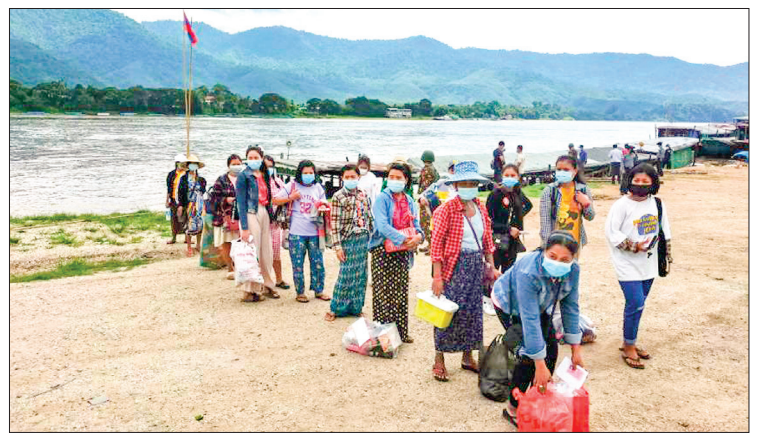
provide free transport to reach (IPRD)/GNLM

Returnees from Laos queue up for the reception process.