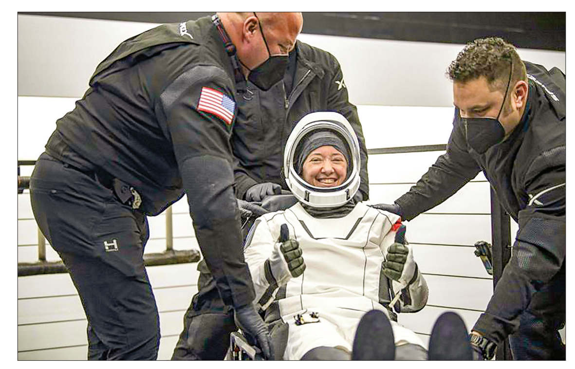
NASA astronaut Megan McArthur gives a thumbs up after being helped out of the SpaceX craft.