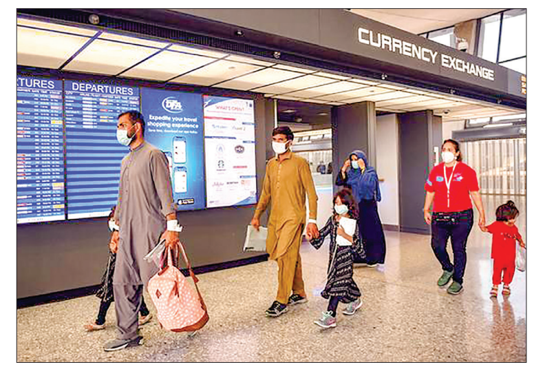
A volunteer helps Afghan refugees to board a bus after arriving on a flight at Dulles International Airport in Chantilly, Virginia on 23 August 2021.

Some 70,000 Afghans have landed in the United States as part of "Operation Allies Welcome", launched amid the August evacuation of tens of thousands of people from Afghanistan, as the country fell to the Islamist Taliban following the withdrawal of US troops from the country. Afghans who arrived in the United States on or after 30 July this year will be able to take advantage of simplified procedures to get a prized "green card", or permanent resident status, as well as various work permits, the DHS said in a statement. They will also not have to