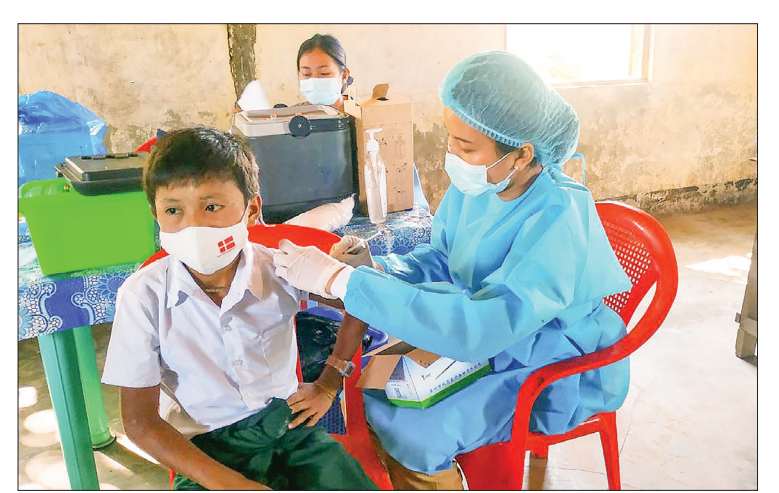
Vaccination programme for schoolchildren aged 12 plus is underway in Maungtaw.

There are 7,297 students aged over 12 to receive vaccines at 53 sites of Maungtaw Township and 109 students were vaccinated against COVID-19 on 8 November. A total of 5,939 students received their first dose of vaccines between 17 October and 8 November.