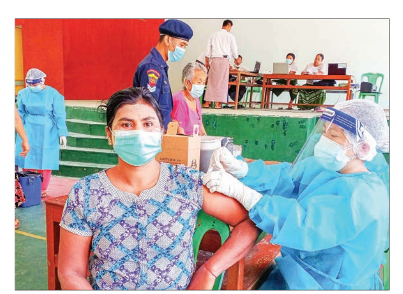
A Kyaukpyu resident gets vaccinated against COVID-19.