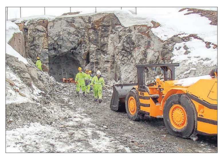
Students emerge from the KTI mine-training facility in Sisimiut, Greenland. The country is banking on the emergence of a mining sector that would generate income and jobs.

The IA won 12 seats in the 31-seat Greenlandic national assembly, beating its rival Siumut, a social democratic party that had dominated politics in the island territory since it gained autonomy in 1979. On Tuesday 12 MPs in the national assembly voted to ban uranium mining, with nine voting against. The IA had campaigned against exploiting the Kuannersuit deposit, which is located in fjords in the island's south and is considered one of the world's richest in uranium and rare earth minerals.