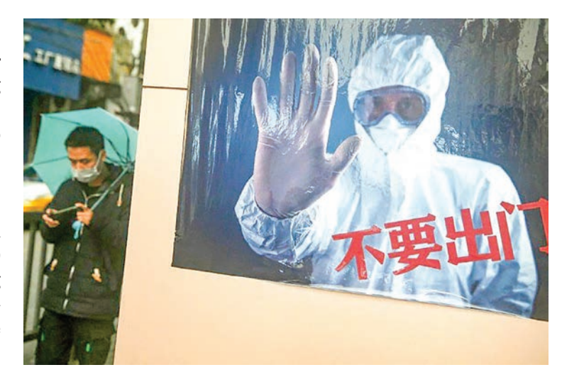
Beijing's rigorous anti-virus stance has been used as political capital to extol the virtues of China's leaders.

But the current outbreak has hit more than 40 cities, and