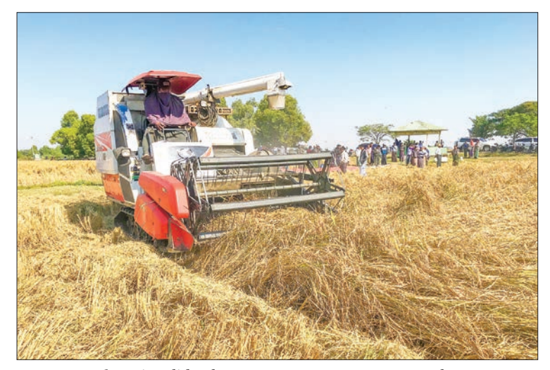
At present, the price slid to between K25,000-K44,700 per bag depending on quality. There is therefore a gap of K2,000-K2,500 per bag in recent days.

THE price of rice crops has fallen following the supply of fresh rice in the market.