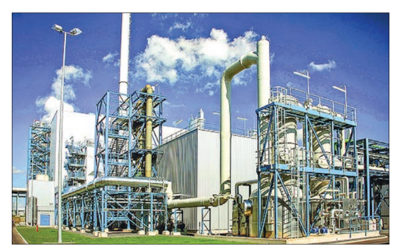
A carbon capture and storage plant in Germany.

an Australian one that's focused on technology not taxes and this Fund backs in Australian companies to find new solutions," Morrison said in a statement. However, in order to establish the fund, the government must first pass legislation expanding the remit of the CEFC to allow it to invest in CCS.—Xinhua