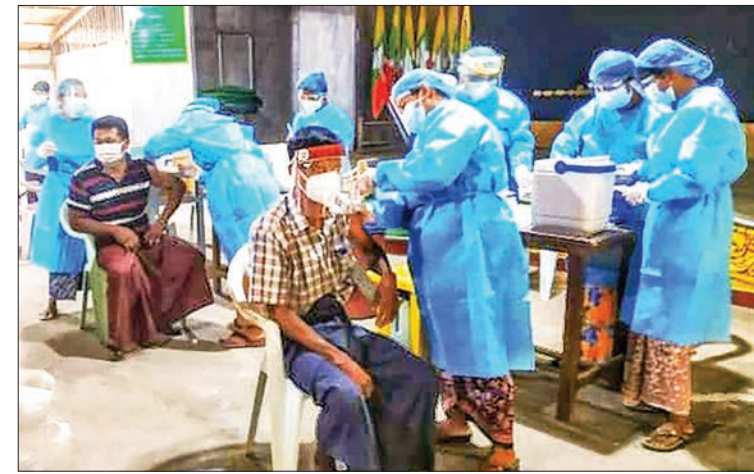
Vaccination is underway in Pakokku.

A total of 47,686 people, including 10,336 monks and nuns, 5,010 elderly people, 5,857 healthcare staff and fam-