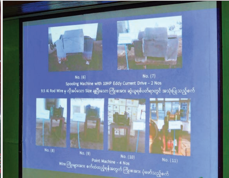
The Senior General hears the reports on the background history and production processes of the Indagaw Industrial Zone.