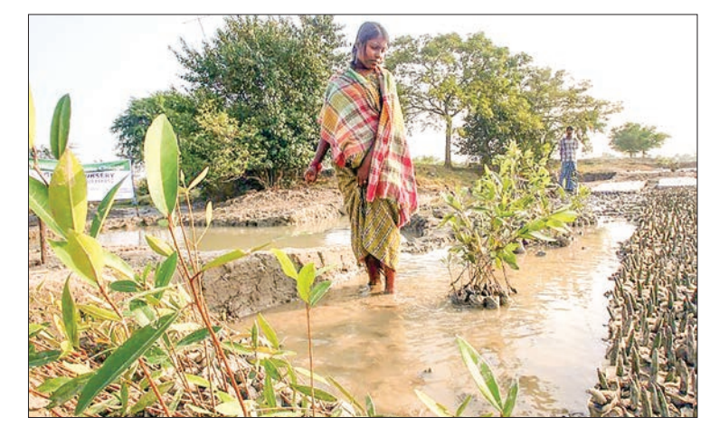
This file picture from 2008 shows mangrove seedlings planted at a nursery in the Sunderbands.

They can help fight climate change by sequestering millions of tonnes of carbon each year in their leaves, trunks, roots and the soil.—AFP ■