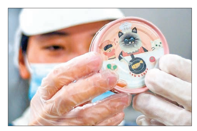
Scientists in Taiwan have developed cat food developed from silkworm pupae.

LICKING its lips imperiously, a ginger cat mops up every last morsel of food from its curly whiskers, clearly undaunted by its supper's rather unusual base ingredient -- silkworm pupae.