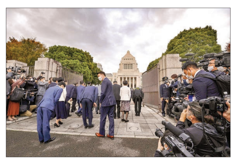
Lawmakers head to the parliament in Tokyo in the morning on 10 November 2021.

The government set up a number of committees for realizing Kishida's vision of a "new capitalism" that focuses on economic growth and redistribution of wealth, and he held phone talks with world leaders, including US President Joe Biden to realize a free and open Indo-Pacific region, Matsuno said