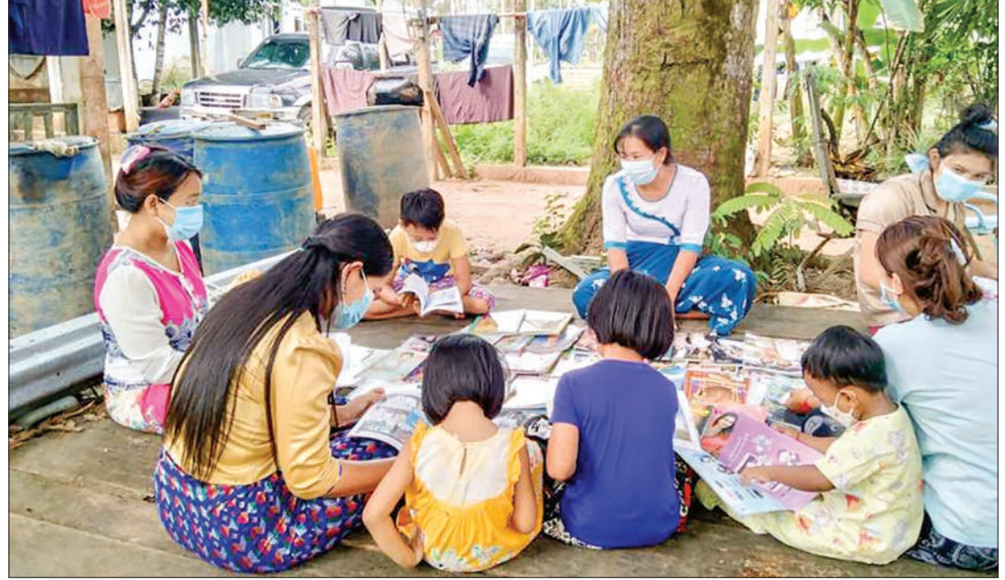
Children are seen reading books from the IPRD mobile library.

THE Information and Public Relations Department (IPRD) conducted a mobile library field visit in Pyigyimandaing town of Kawthoung District in Taninthayi Region yesterday.