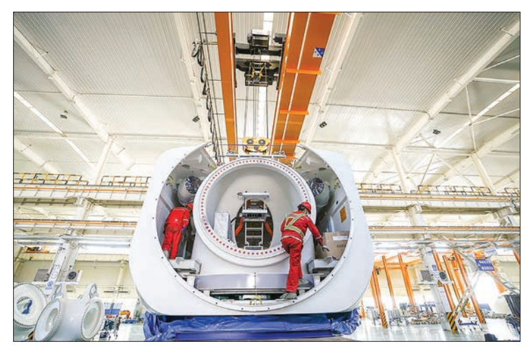
Employees work at a wind turbine plant of Goldwind Science and Technology Co.,Ltd. in Hami, northwest China's Xinjiang Uygur Autonomous Region, 25 April 2020.

PACIFIC Rim trade and foreign ministers agreed to push for a freeze on fossil fuel subsidies at a virtual summit Wednesday but host Prime Minister Jacinda Ardern of New Zealand said more "bold" action on climate change was needed.