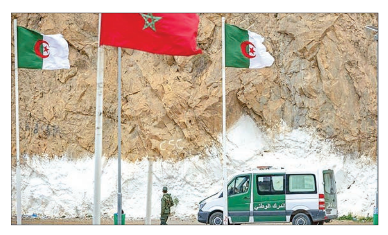
Closed since 1994, the border between Algeria and Morocco has been tightly sealed since 2013 ending visits between the many families that straddle the frontier.

The frontier has been sealed ever since, and there is little prospect of it opening soon as tensions mount once again between Rabat and Algiers.—