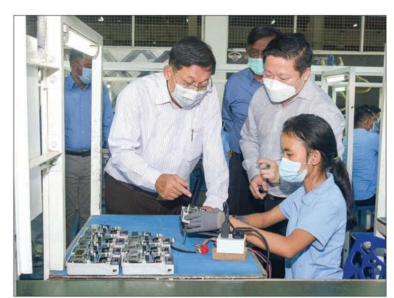
The Senior General views around the factories in the Indagaw Industrial Zone (top and left photos).

If each household consumes 100 units, it is estimated each unit will be charged at about K6,000. Hence, it is necessary to install a solar system in villages to consume electricity. The Senior General underlined the need to arrange generation of household use electricity through the solar system and strive for the production of solar panels at home, change the installation of AMI system electric meters in Yangon city and Mandalay city as well as regions and states, and strive