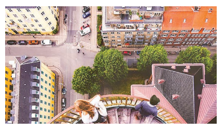
Denmark will re-introduce a health pass because of a sharp rise in Covid-19 infections, Prime Minister Mette Frederiksen said Monday, less than two months after scrapping controls.

DENMARK will re-introduce a health pass because of a sharp rise in Covid-19 infections, Prime