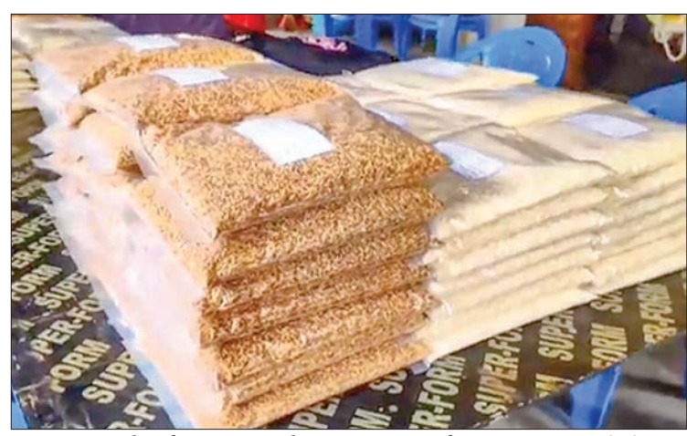
Myanmar's Shwebo Pawsanmhwe Growers and Exporters Association, with the support of GRET Myanmar together with France, is making efforts for Shwebo Pawsan to get the internationally recognized Geographical Indicating (GI) designation.

Pawsan rice was previously grown in the Ayeyawady delta region. Now, it is cultivated across the country. There are about 1.3 million acres of Pawsan rice crop every year. Pawsan varieties vary in different regions and harvest seasons.