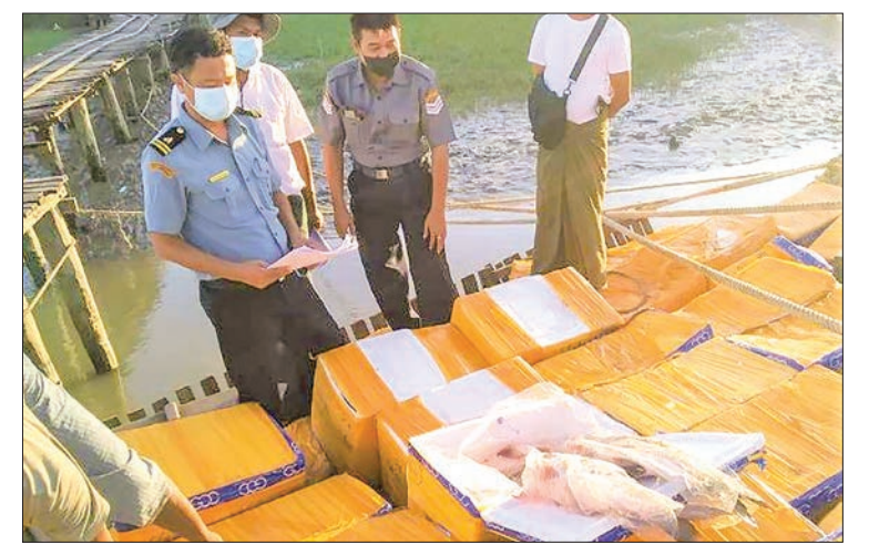
Two border checkpoints (Sittway-Shwemingan Port and Maungtaw-Kanyinchaung Port), which have been suspended for three months, was reopened on 13 October following the health prevention measures for COVID-19. As of 8 November, Myanmar delivered 4,841 tonnes of goods to Bangladesh through those two border posts, generating an export income of $2.261 million. Of them, the exports of fishery products were worth $1.615 million.

for the Customs to find drugs and other illicit goods are used in screening, it will secure the quality of the product. The detection technology will facilitate the Customs clearance procedures. It would be better if the government