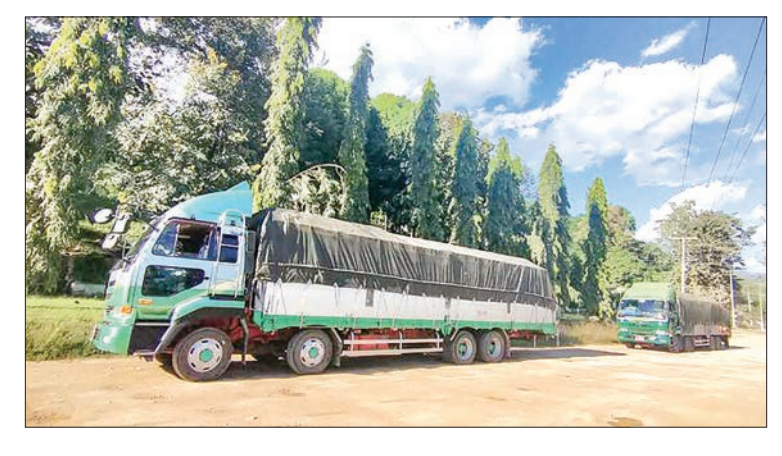
persons for inquiries can be W reached through the Ministry's m

It is reported that the Ministry of Commerce is coordinating with relevant departments, treatment of COVID-19, as well as contact