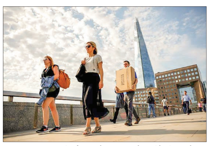
Commuters not wearing facemasks cross London Bridge in London on 19 July 2021.

The UK's key financial sector known as the City and