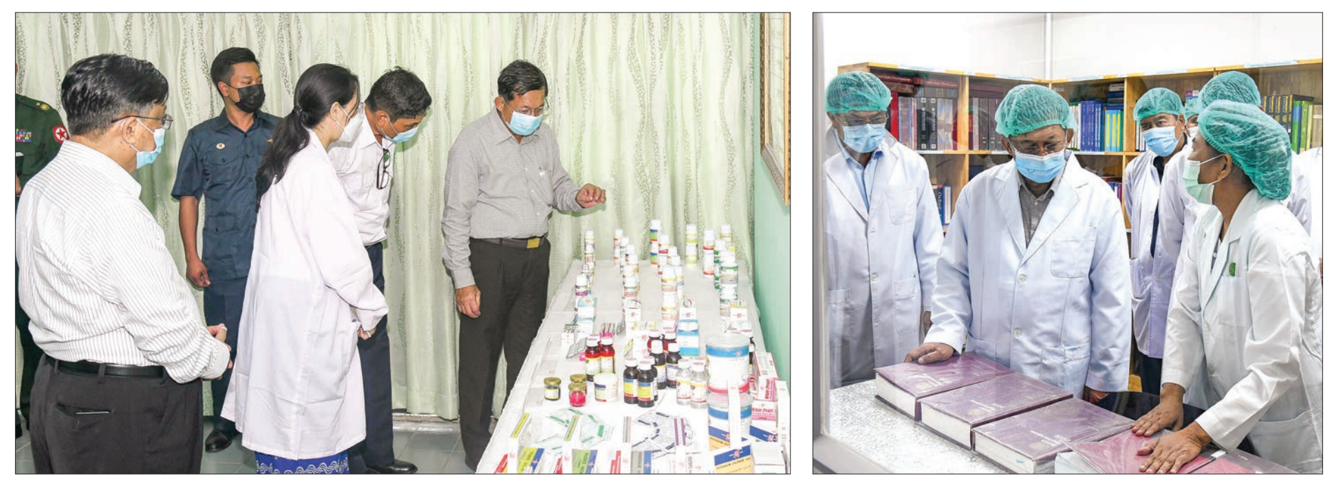
The Senior General looks into the medicines and related items at the Myanmar Pharmaceuticals Enterprise (Insein) on 11 November 2021.