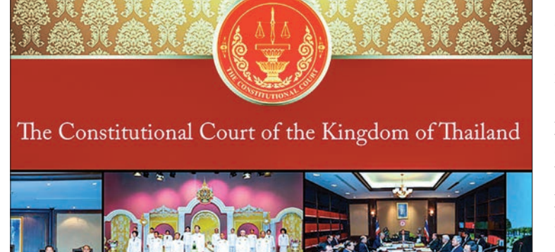
Thailand's Constitutional Court on Wednesday banned pro-democracy leaders from calling for reform of the monarchy, ruling that they had attempted to overthrow the country's constitutional monarchy. PHOTO: THAI WOMAN TALKS/KYODO/FILE

The court found that the leaders' calls for reform of the monarchy were unconstitution-