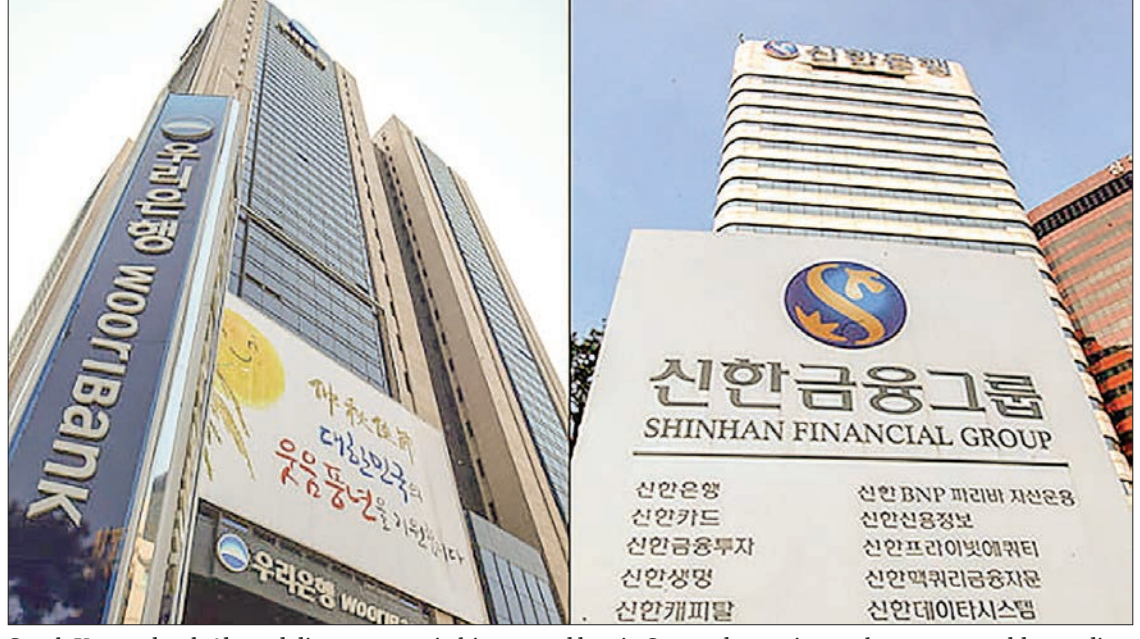
South Korean banks' loan delinquency ratio hit a record low in September owing to the near-record-low policy rate, financial watchdog data showed on 11 November 2021.

The resolved non-performing loan amounted to 1.7 trillion won (1.4 billion US dollars) in September, up 1 trillion won (845 million US dollars) from the prior month. The delinquency ratio for bank loan to households declined 0.02 percentage points from a month earlier to 0.17 per cent at the end of September, while the ratio for corporate loan slipped 0.06 percentage points to 0.30 per cent.—Xinhua