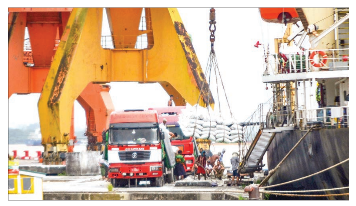
An overseas-going vessel seen loading export rice at Yangon port.