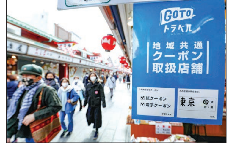
A sign promoting the government's Go To Travel subsidy program is put up in a shopping street in Tokyo's Asakusa area on 19 December 2020.

The government is planning to require people taking advantage of the "Go To Travel" programme to show proof of vaccination or a negative virus test result when they check into