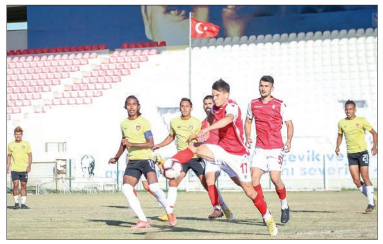
Manavgatspor FC players (red) are seen in attack position while Myanmar players (yellow) are looking for places in their defence line during their friendly match on 10 November.

The Myanmar national team will play against the African team Burundi on 13 November in their second friendly match.—Ko Nyi Lay/GNLM