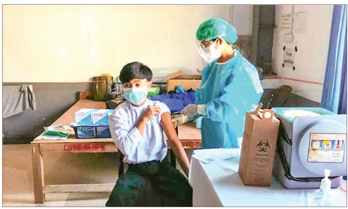
An above 12 year-old student gets jabbed against COVID-19.

THE COVID-19 vaccination programme for the students aged 12 and above has started since 12 October in Lewe Township, Nay Pyi Taw Union Territory, and a total of 15,884 students — 73.89 per cent have