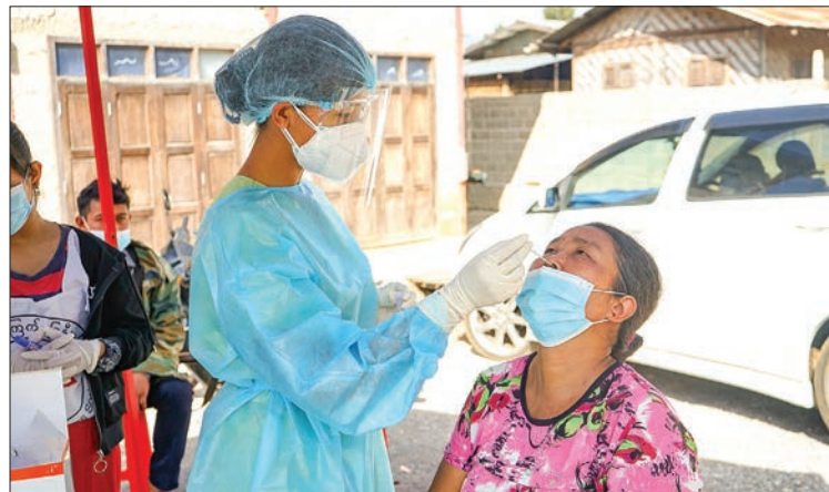
The Covid test is underway in southern Shan State.