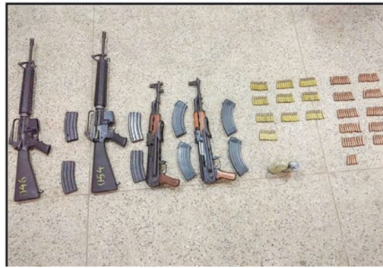
Seized weapons and ammunition in Thingangyun Township.