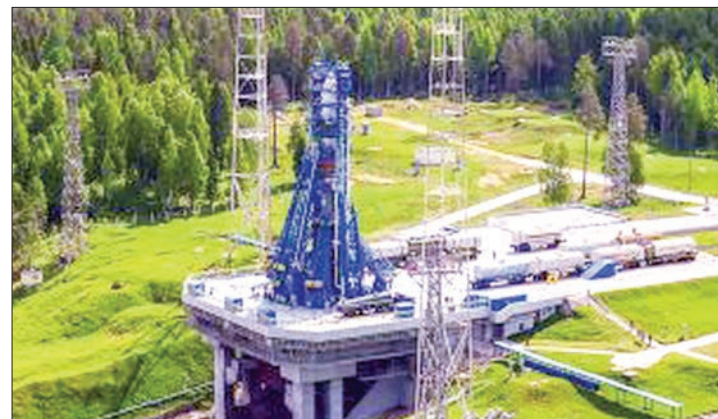
This image shows the Plesetsk Cosmodrome in northern Russia, the site of a Russian anti-satellite missile test in April 2020.

The US said the strike had created a cloud of debris and forced the crew of the International Space Station to take evasive action, a claim that Moscow rejected. "This irresponsible behaviour carries a risk of error of judgement and escalation," the German statement said.—AFP ■