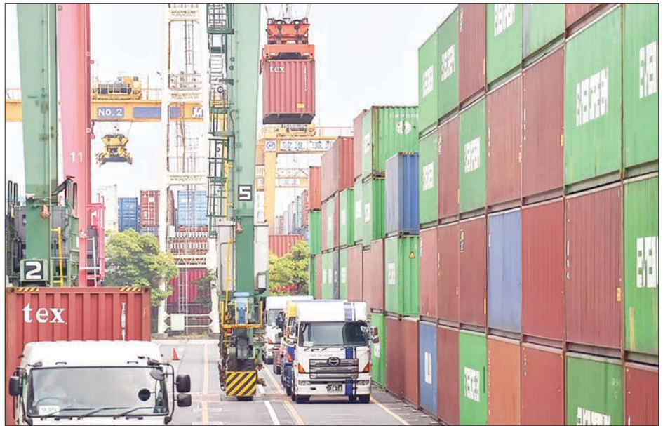
Containers are transferred to trucks at the Port of Tokyo on 19 August 2019.

Earlier in the day, Japan's trade and industry minister Koichi Hagiuda separately discussed with Tai bilateral cooperation in responding to such practices, according to the trade ministry. —Kyodo ■