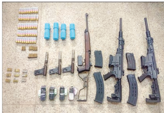
Seized weapons and ammunition in Mayangon Township.