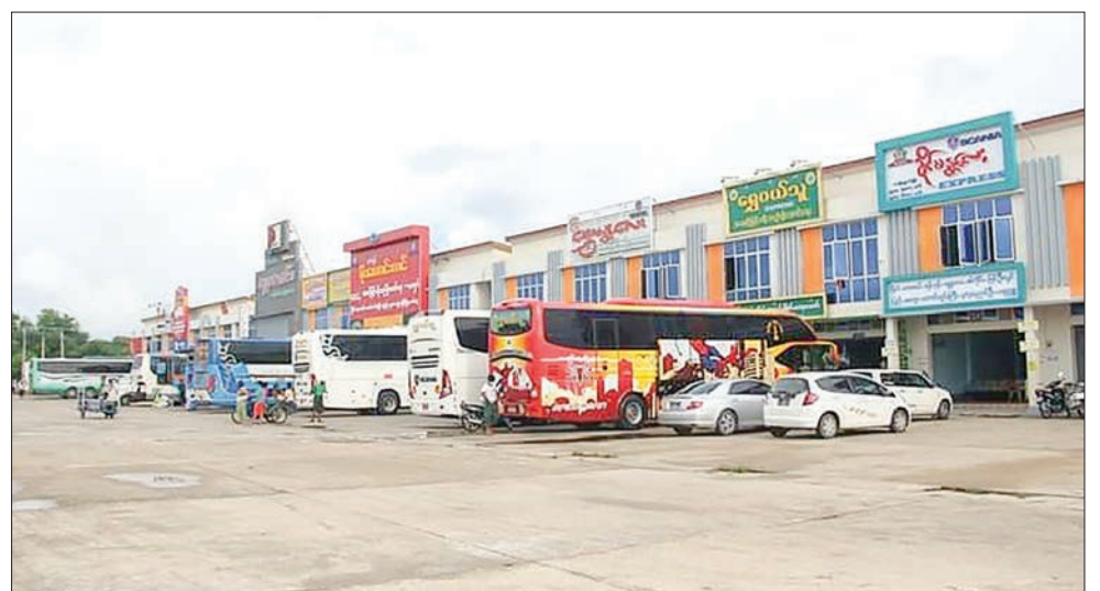
There are 35 mini-bus lines and 15 buses operating from Myeik town. The region government gave the go-ahead to highway bus service with 50 per cent of the total seat capacity.

The transport hour limit caused delay and additional charges, making the passengers uncomfortable.