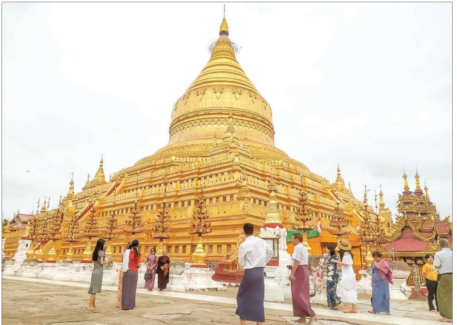
Visitors are seen at the Shwezigon Pagoda in Bagan.

Bagan Archeological Zone is a historical site in Myanmar with over 4,000 pagodas and temples built between the 11 th and 13 th centuries. As of yesterday, the most famous pagodas such as Shwezigon, Ananda Temple, Thabbinnyu and Dammayangyi pagodas, renowned as four major pagodas to visit in Bagan, were crowded with pilgrims. Moreover, visitors also paid visits to other historical pagodas, including Manuha, Lawkananda, Tooth relic Pagoda, Sulamuni, Soem-