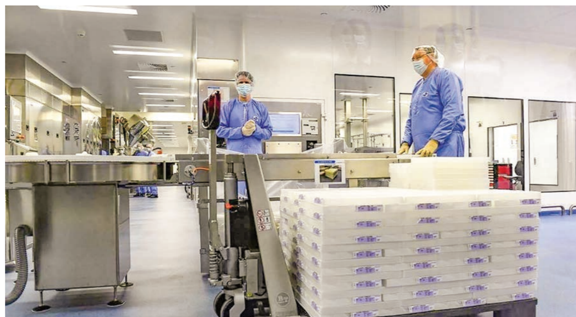
Employees are at work at the factory of US multinational pharmaceutical company Pfizer in Puurs, Belgium.

Interim data from ongoing trials demonstrated an 89 per cent reduction in the risk of Covid-19-related hospitalization or death compared to a placebo, in non-hospitalized high-risk adults