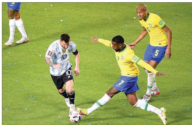
Lionel Messi (left) was unable to inspire Argentina to victory upon his return to the starting line-up in a tight clash with Brazil.