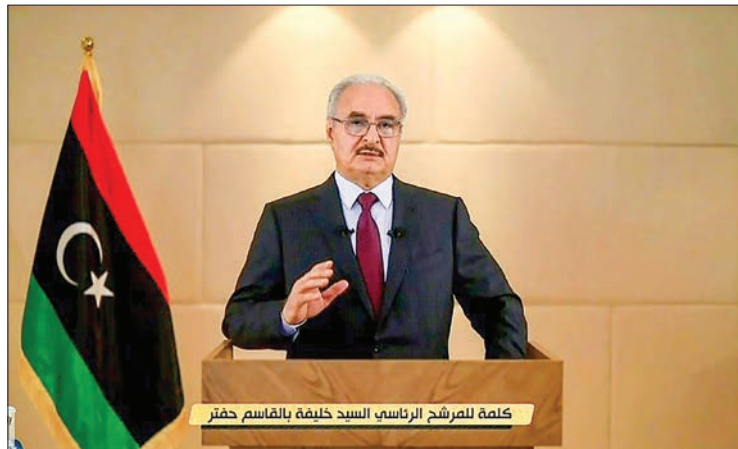
The military strongman of eastern Libya, Khalifa Haftar, despised by many in the west of the country for the devastating offensive he launched on the capital Tripoli in 2019, declares his candidacy for a 24 December presidential election.

His announcement comes two days after the candidacy of Seif al-Islam Kadhafi — the son of slain dictator Moamer Kadhafi