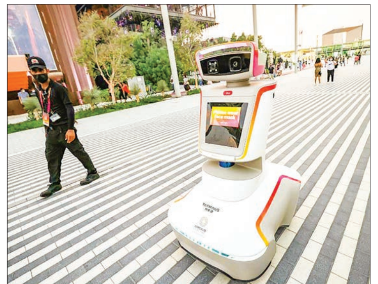
While the region might be known as culturally conservative, some local players say its AI strategies are better characterised as liberal and aggressive. PHOTO: AFP/FILE

"I think that's just completely the opposite of what I see in the rest of the world."—AFP ■