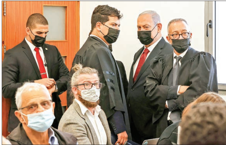
Former Israeli prime minister Benjamin Netanyahu (2nd R) arrives for a court hearing on corruption charges, on 16 November 2021 in Jerusalem.

FORMER Israeli prime minister Benjamin Netanyahu returned to court for his graft trial Tuesday, but judges granted a defence request to postpone highly anticipated testimony from his former