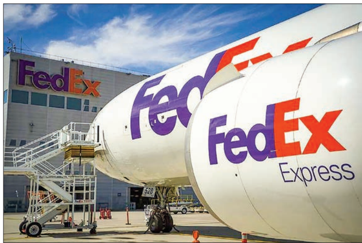
FedEx has decided to close its Hong Kong crew base and relocate its pilots because of the city's strict anti-coronavirus measures

GLOBAL delivery giant FedEx said Wednesday it was closing its crew base in Hong Kong and relocating pilots overseas because of the city's strict anti-coronavirus measures.