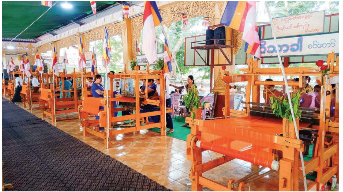
The “Mathoe” robe weaving ceremony in action at the Shwesandaw Pagoda in Twantay.

The Mathoe Robe Weaving Contest was held on nine looms in the past years and nine female groups from the villages participated in the contest and offered the robes to the Buddha images at Shwesandaw Pagoda. — Myo Hlaing (Twantay)/GNLM