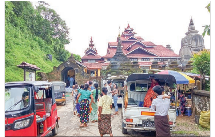
Worshippers seen visiting one of the ancient pagodas in MraukU.

Shitthaung Stupa and Htukkant Thein Stupa to study ancient architecture and 550 Jataka stories, including other fine artworks. Moreover, souvenir shops and photo studios were also crowded with visitors, including students.