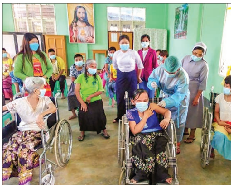
People with disabilities get jabbed in Nawnghkio.

education and then allowed to leave, according to the township COVID-19 disease prevention and control committee.