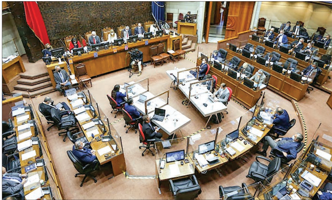
The vote was 24 in favour of impeachment, 18 against and one abstention. Those voting to charge the billionaire president with corruption needed at least 29 votes to pass the measure.

CHILE'S Senate declined Tuesday to impeach President Sebastian Pinera over a business deal revealed in the Pandora Papers leaks, refusing to go along with the lower chamber of Congress in opening proceedings against him.