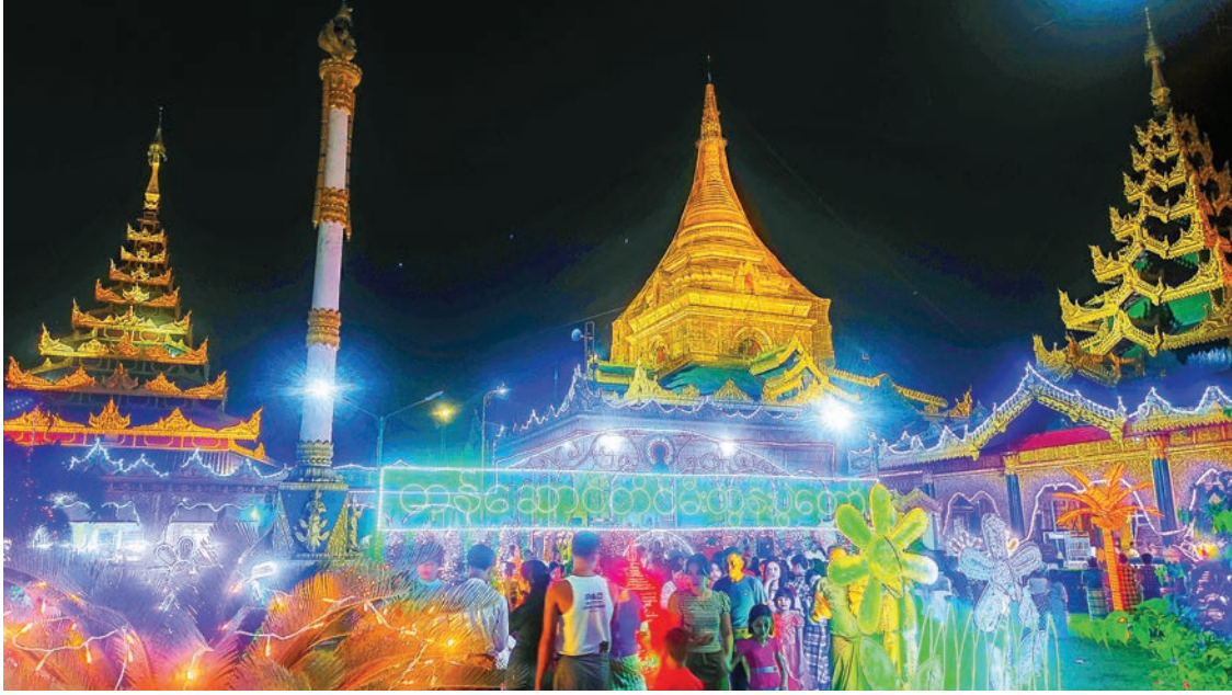
Zalun Pyitawpyan Pagoda.

THE Zalun Pyitawpyan Pagoda in Zalun Township of Hinthada District of Ayeyawady Region was decorated with the colourful oil lamps and electric lights yesterday evening. The lighting festival is organized from 14 th Waxing to 1 st Waning of Tazaungmon.