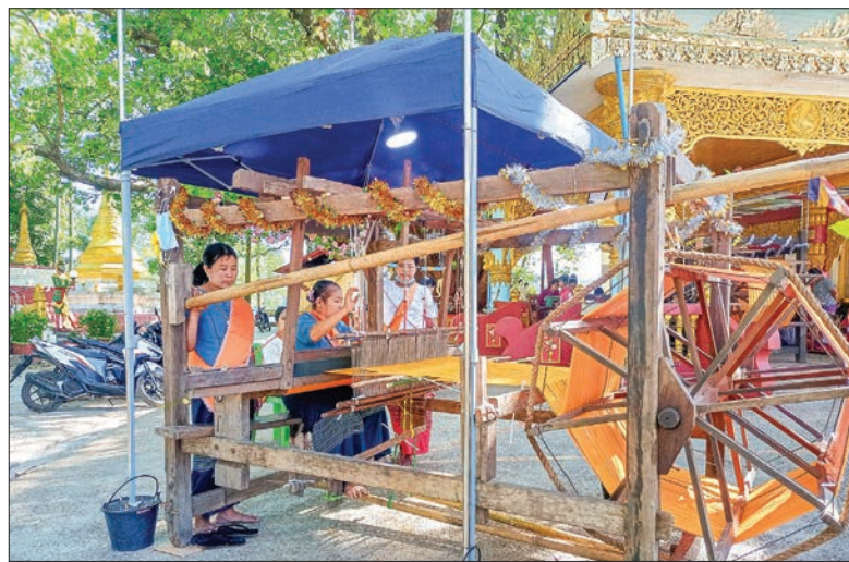
The 95 th “Mathoe” robe weaving ceremony in progress in Mudon.