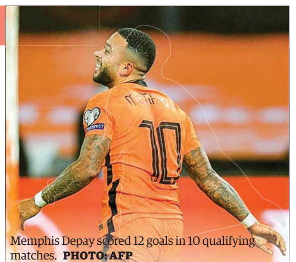
Memphis Depay scored 12 goals in 10 qualifying matches.

Van Gaal admitted he was "worried that things could go wrong", especially after the his side's shocking 2-2 draw against Montenegro over the weekend when they let a two-goal lead slip in the final 10 minutes. "But this evening we kept the match under control," he added. — AFP ■