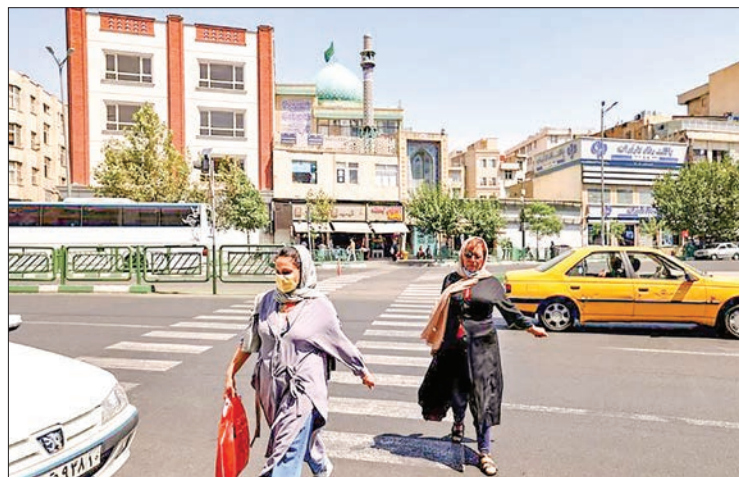
Iranian women cross a street in downtown Tehran on 20 July 2021, as authorities tighten restrictions amid the Covid-19 pandemic.

The law has been criticized by United Nations experts, as well as by women's rights ac-