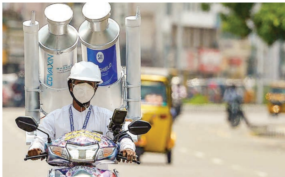
Several million doses of Covaxin have now been supplied and administered in India and several other countries. A volunteer rides along a road with a mock vials of India-made vaccine Covishield and Covaxin in India.