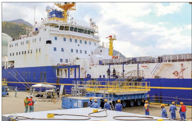
A freighter carrying plutonium-uranium mixed oxide fuel, known as MOX fuel, arrives at Kansai Electric Power Co.'s Takahama nuclear power plant in the Fukui Prefecture town of Takahama, central Japan, on 17 November 2021.

A cargo ship carrying uranium-plutonium mixed-oxide fuel processed in France arrived Wednesday at a nuclear power plant in central Japan, the third such shipment since