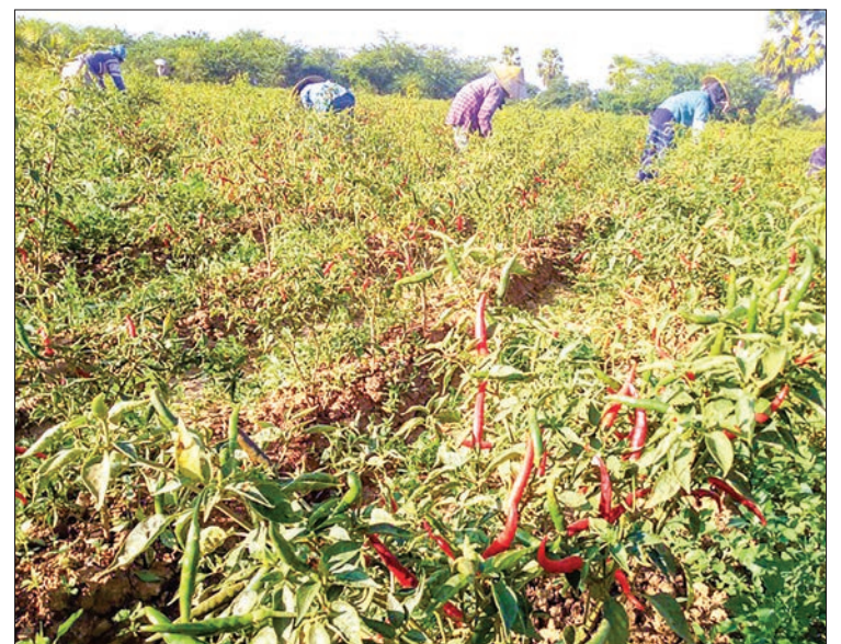
At present, the local fresh chillis lack supply. It fetches K1,400-2,000 per viss.

It is commonly grown in Ayeyawady, Mandalay and Magway regions and Shan State. The export varieties of fresh chilli peppers are 692, 777, 999, Demon, Sunshine, Lucky one and Tharmo. — NN/GNLM