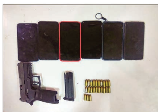
Confiscated weapons and ammunition in Thingangyun and South Okkalapa townships.