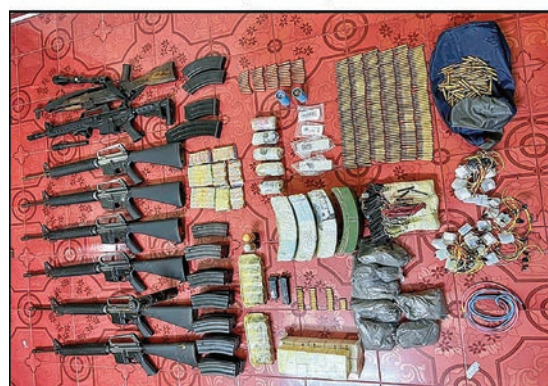
Confiscated weapons and ammunition in Dagon Myothit (North) and Bahan townships.