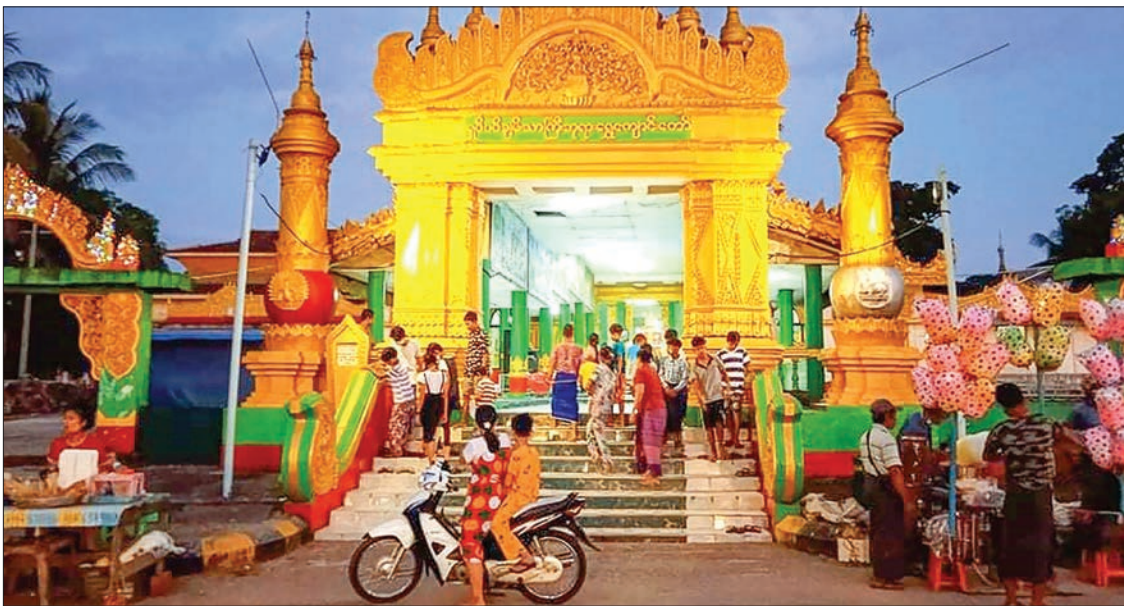
Shinpin Chanthagyi Pagoda in Ayeyawady Region.

PILGRIMS visited Shinpin Chanthagyi Pagoda, situated on Chaung Wa Paing (1) Road in Einme Township, Myaungmya District, Ayeyawady Region on the evening of 14 th Waxing of Tazaungmon (yesterday). Gold foils and cash trees offering ceremony will be held at the historic Shinpin Chanthagyi Pagoda on 18 November and a merit-sharing ceremony will also be held on 19 November, according to the Pagoda Board of Trustees.