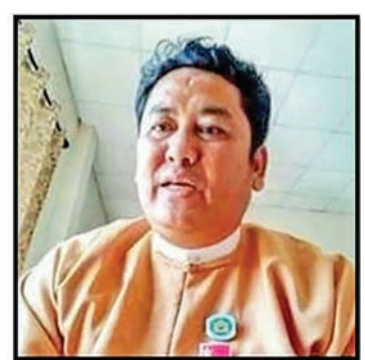
တောင်ပိုင်း PDF အကြမ်းဖက် တာဝန်ခံ