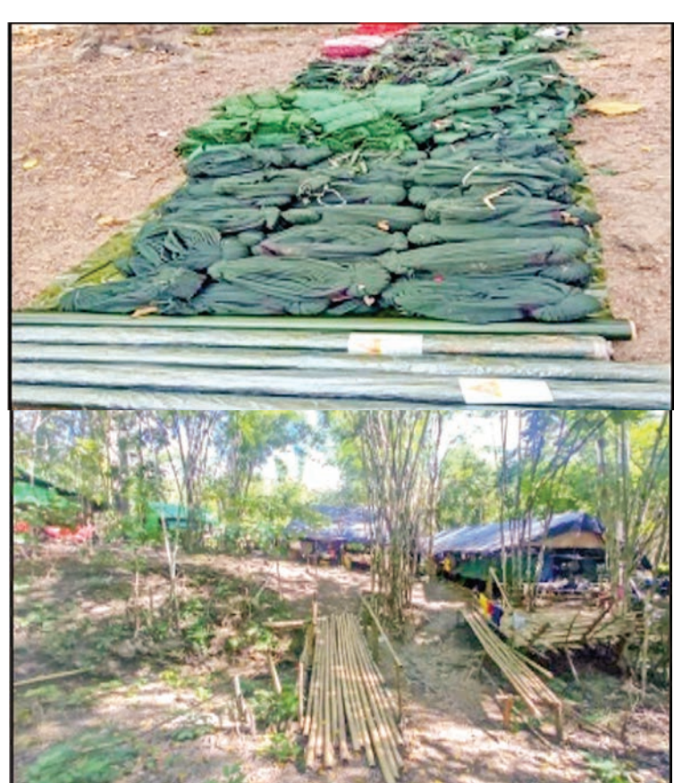
Seized materials from southern area PDF camp in KNLA Brigade 2.