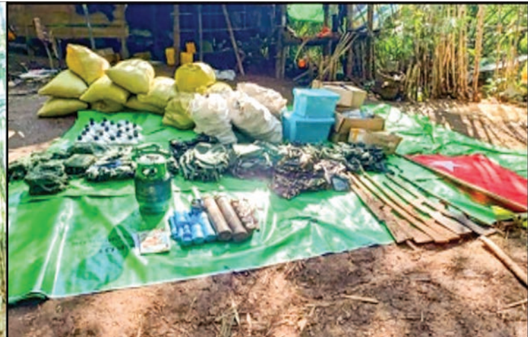
Confiscated stuff from Toungoo PDF camp in KNLA Brigade 2.