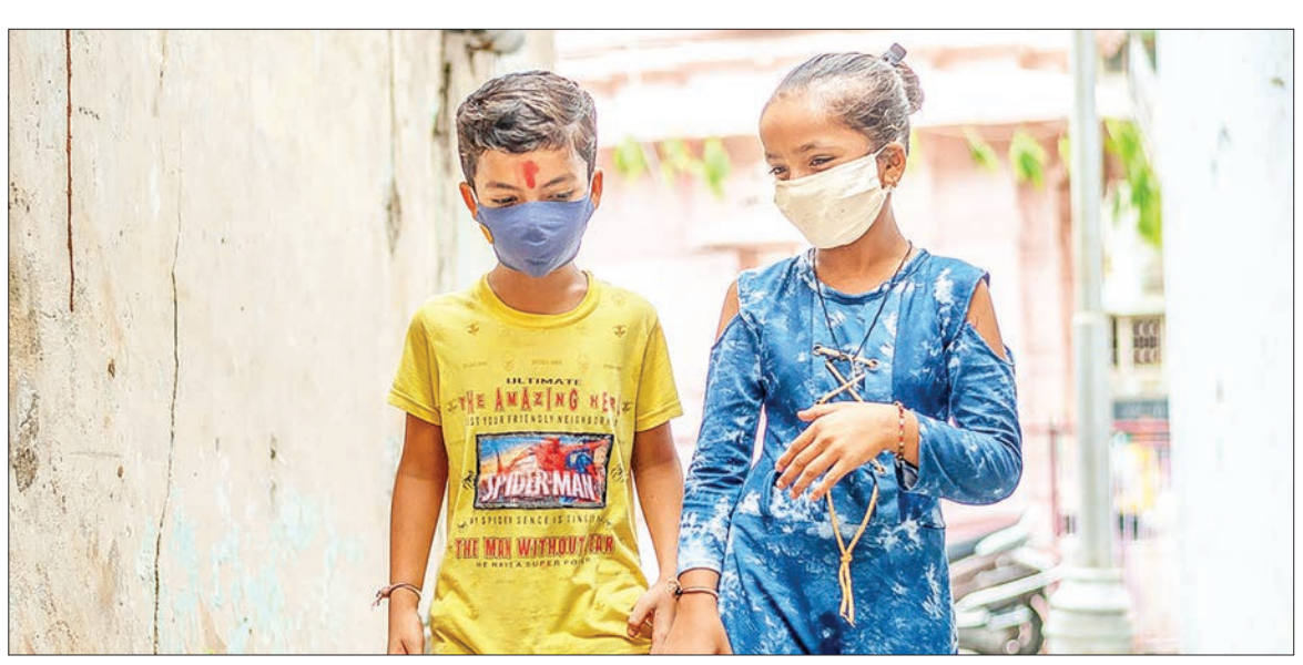
A young boy and girl in India protect themselves against COVID-19 by wearing face masks.