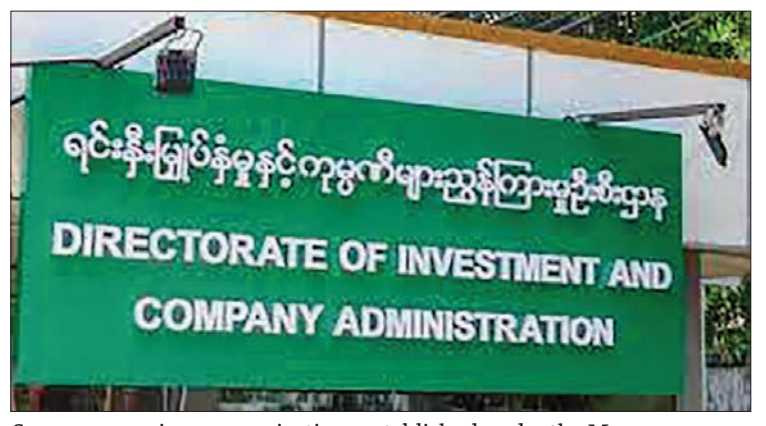
Some companies or organizations established under the Myanmar Companies Law are found to run the business with the personal account of the directors without having corporate accounts.

period, the number of registered companies on MyCO was 1,373 in January, 188 in February,163 in March, 254 in April, 686 in May, 775 in June, 433 in July, 360 in August, 733 in September and 1,027 in October, the DICA's statistics showed.