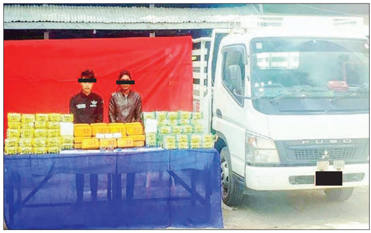
Two arrestees are pictured along with seized drugs.

POLICE seized more than K2.21 Township of Shan State (South). billion worth of drugs in Taunggyi