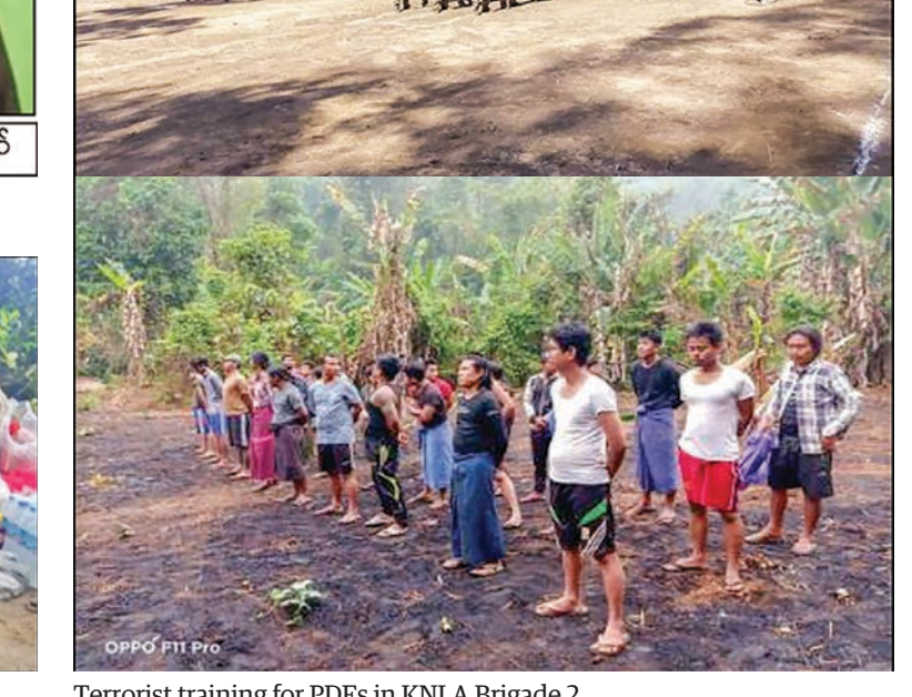
Terrorist training for PDFs in KNLA Brigade 2.