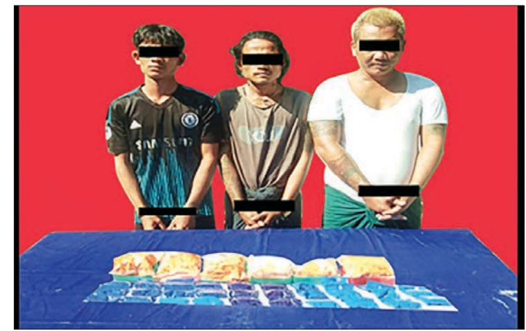
Arrestees are seen together with seized drugs.

It is reported that 6,630 Chinese yuan, which was the evidence from the case, was confiscated as public funds. - MNA