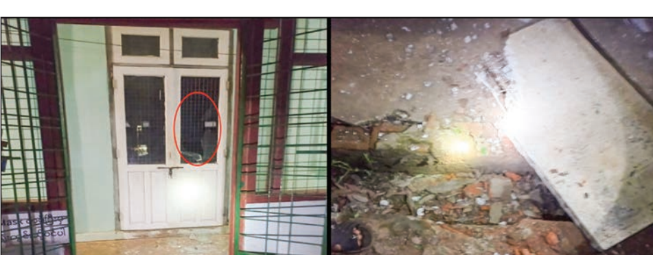
Myanma Agriculture Bank in Hpa-an.