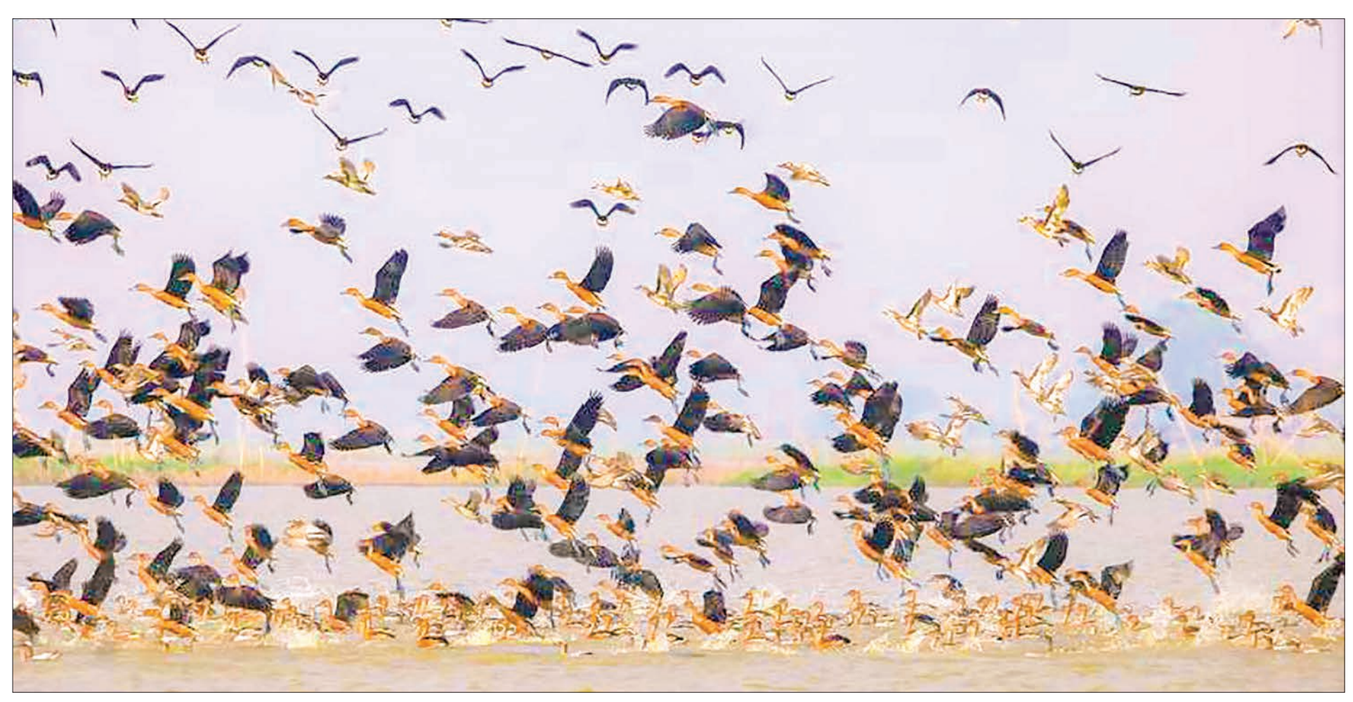
Many and varied winged "tourists" are seen seeking refuge at the natural habitat of the Moeyungyi Wetland Wildlife Sanctuary in Bago Region.

tions, has a long coastline, mountain ranges, three seasons and a good geographical location. The natural scenic beauty of rivers, mountain ranges, snow-capped mountains, natu-