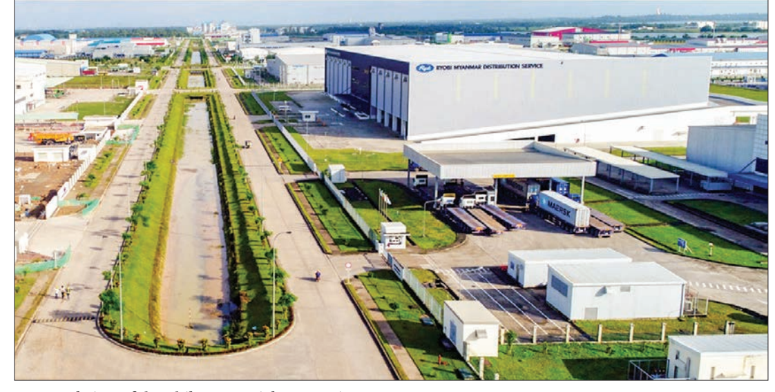
A general view of the Thilawa Special Economic Zone.

FOREIGN investments of over US$102 million, including the expansion of capital by the existing enterprises, flowed into Thilawa Special Economic Zone under the Special Economic Zone Law and one foreign enterprise was given the go-ahead in the financial year 2020-2021.