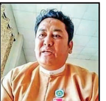
မြောက်ပိုင်း PDF အကြမ်းဖက် တာဝန်ခံ