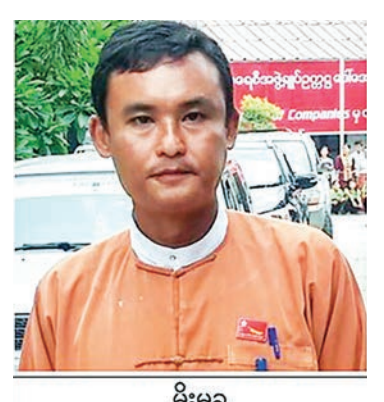
တောင်ငူမြို့နယ် NLD ပါတီမှ တိုင်း(၂) လွှ တ် တော် ကို ယ် စား လှ ယ် ဟော င်း တောင်ငူ အကြမ်းဖက် PDF အဖွဲ့ တာဝန်ခံ၏ မှတ်တမ်းဓာတ်ပုံ