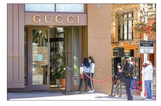
Luxury shops in San Francisco's Union Square have been particular targets in the surge of "flash mob" robberies.

US retailers are adding security and locking up goods after flash mob heists involving dozens of thieves at once stunned luxury stores in the San Francisco area and be-