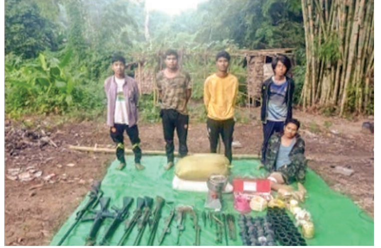
Five arrestees from Pyay PDF camp in KNLA Brigade 2.

explosive training conducted in Kyaukkyi Township of KNLA Brigade 3 area. The KNLA Brigade 3 taught military and explosive courses to PDF terrorists and accepted those who are still at large.