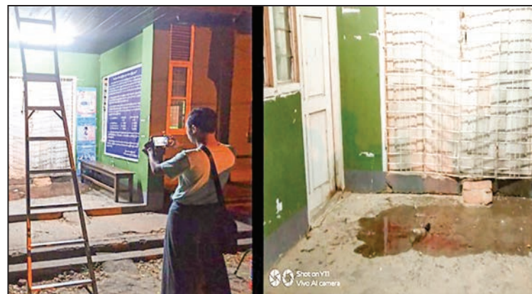
Lewe Agriculture Bank.