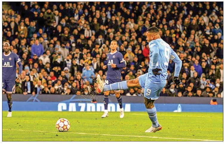
Gabriel Jesus scored the winner for Manchester City against Paris Saint-Germain.

PSG coach Mauricio Pochettino, in the city where he is being linked with the vacant Manchester United job, insisted his expensively-assembled side were showing improvement. "We have