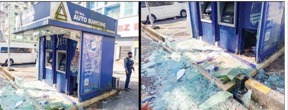
A handmade bomb blast at the ATM of Kanbawza bank in Mayangon Township.