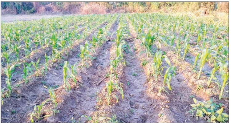
A delegation of the corn growers holds a series of discussions with the private lenders to receive a K500,000 agricultural loan for the winter corn season

The corn is cultivated in Shan, Kachin, Kayah and Kayin states and Mandalay, Sagaing and Magway regions. Myanmar has three corn seasons- winter, summer and monsoon. The country yearly produces 2.5-3 million tonnes of corn. — NN/GNLM