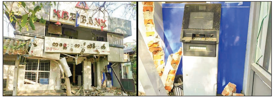
A handmade bomb blast at KBZ bank in Myingyan on 18 April 2021.

The public is urged to work together to protect the terrorists, and if they receive information about the terrorist activities, they should contact the nearest security forces and cooperate with them until the terrorists can no longer stand, officials stated. - MNA