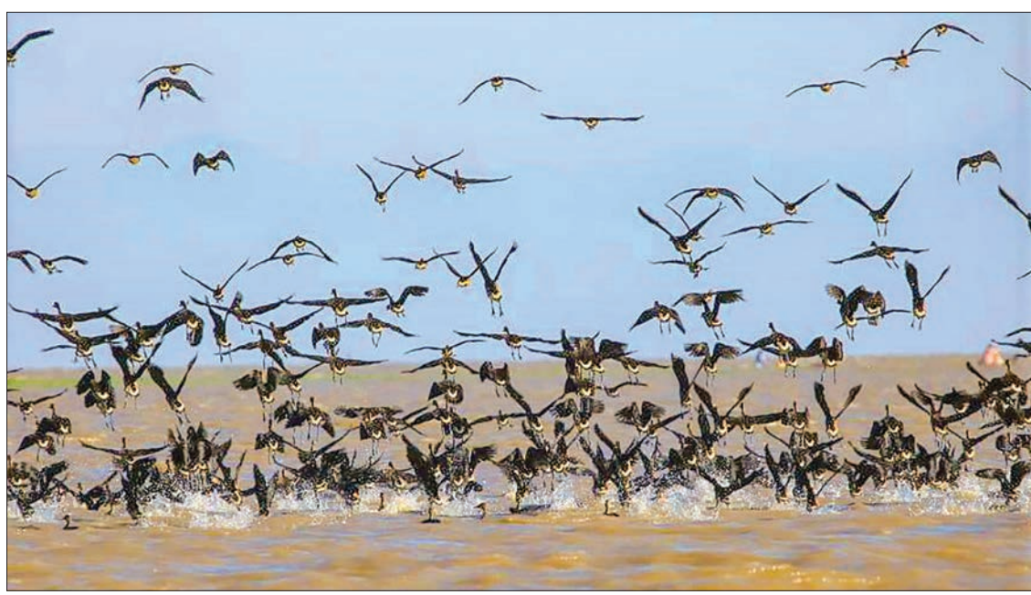
The migratory birds contribute to the ecotourism business, allowing the locals to earn income. Myanmar's Moeyungyi Sanctuary welcome the visitors in high season. It is located at 6 furlongs from Pyinbongyi Town and 19 miles away from 39-Mile Phayagyi Road section of the Yangon-Mandalay Expressway.

Central Asian Flyway is the shortest route out of the nine flyways. About 307 bird species including 182 seasonal migratory species and 20 rare species pass 30 countries from Siberia to the southernmost and Southeast