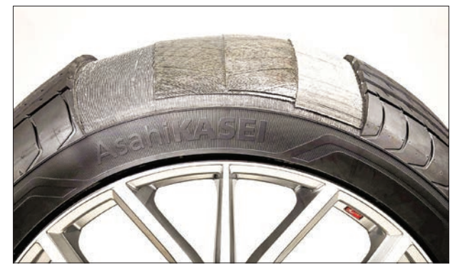
The Tokyo-based chemical firm said it will start producing sustainable S-SBR, used mainly for high-performance and fuel-efficient tires, by March next year.

Asahi Kasei said Wednesday that it concluded an agreement with Shell Eastern Petroleum (Pte) Ltd. on Tuesday to purchase the butadiene to manufacture and market sustainable solution-polymerized styrene-butadiene rubber, or S-SBR for short, in the city-state.