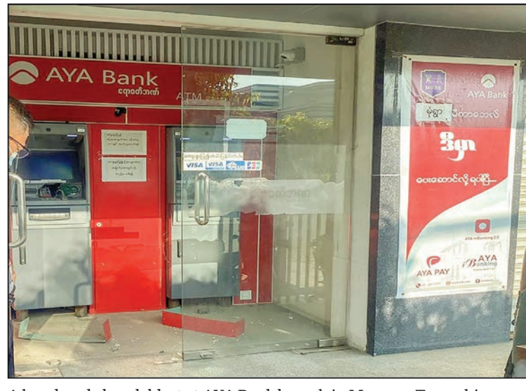
A handmade bomb blast at AYA Bank branch in Monywa Township.