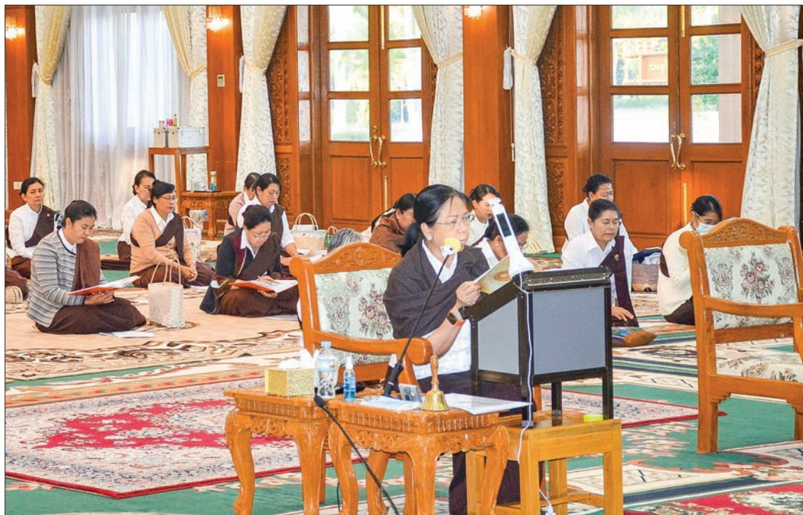
The Five Volumes of the Maha Pathana Treatise are recited victoriously by the religious team of families of Commander-in-Chief (Army, Navy and Air) Office on 29 November 2021.