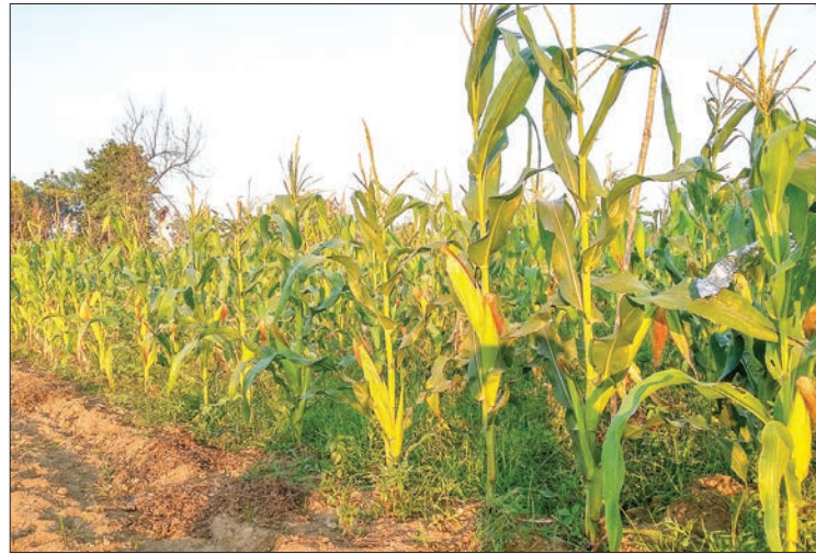
During the FY 2019-2020 ended 30 September, the country exported 2.2 million tonnes of corns to the external market, with an estimated value of $360 million, the Ministry of Commerce's data showed.

Thailand has granted tax exemption on corn imports between February and August.