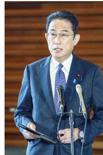
Prime Minister Fumio Kishida speaks to reporters at his office in Tokyo on 29 November 2021.

While it is unclear whether existing vaccines are effective against the Omicron variant, Kishida said the government will carry on with its plan to begin administering booster shots later this week while looking to health experts to provide additional data. The emergence of the variant comes as Kishida aims to restart economic activity that has been restricted by the pandemic, and could hold up plans to restart the government’s “Go To Travel” programme, meant to shore up the domestic tourism industry.— Kyodo ■