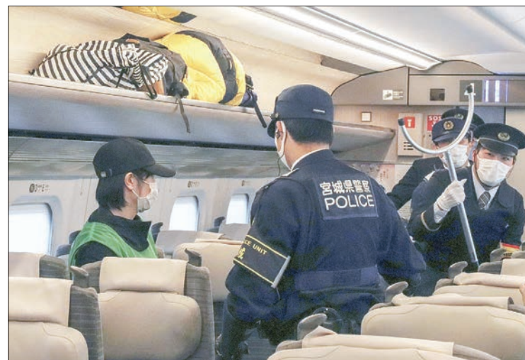
A mock attack is conducted on a bullet train at Shiroishi-Zao Station in Miyagi Prefecture on 29 November 2021.

The incident followed another knife attack in August this year when a man injured 10 passengers on an Odakyu Electric Railway commuter train in the capital.— Kyodo ■