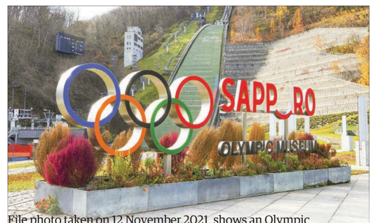
File photo taken on 12 November 2021, shows an Olympic rings monument outside the Sapporo Olympic Museum in Hokkaido.

Tokyo spent 1.64 trillion yen to stage the 2020 Summer Games that were postponed for a year due to the coronavirus pandemic and related issues. — Kyodo ■