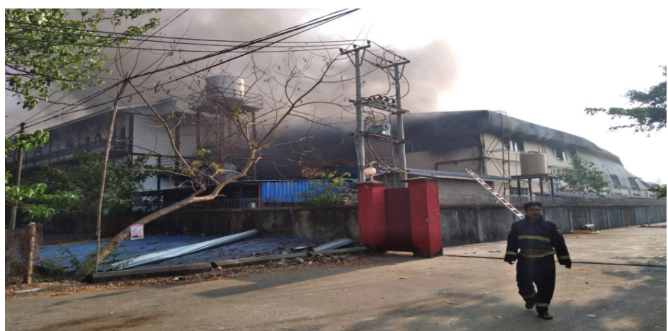
Hlinethaya (East) Industrial Zone 1.