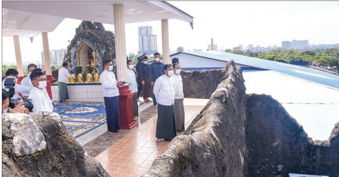
Chairman of the State Administration Council Prime Minister Senior General Min Aung Hlaing views renovation process at Maha Pasana Cave on 31 October 2021.

The Ministry of Commerce has been making necessary arrangements to facilitate the import of medical supplies and equipment required for the COVID-19 prevention, control and treatment. Myanmar nationals who returned home have been systematically administered COVID-19 tests, medical check-ups, and treatment as necessary, and their return to respective regions and states has been facilitated by the authorities. The Ministry of Health is using the Vaccination Management Infor-