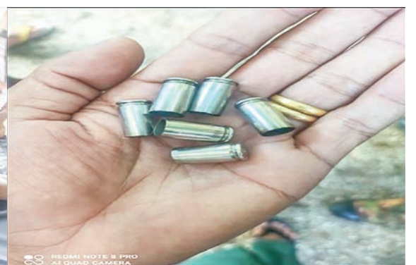
Two terrorists hit security forces in Monywa on 23 September.