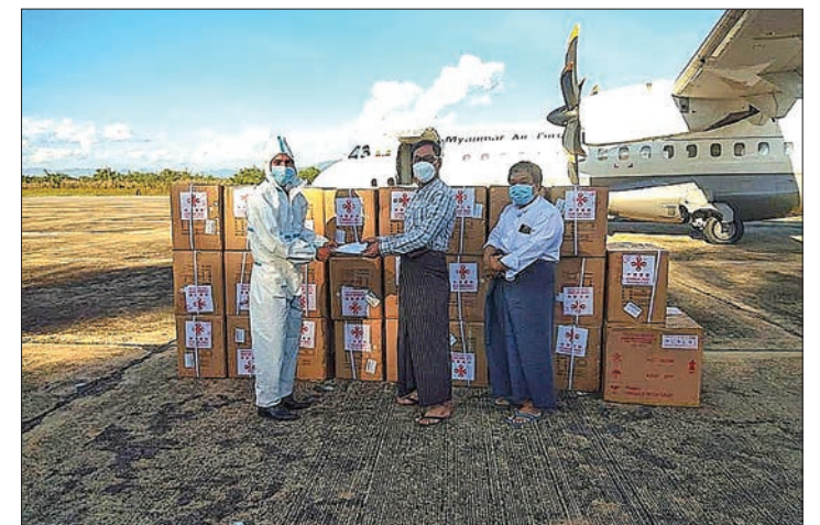
Covid vaccines are received by Shan State health officials.

A total of 2,454 doses of Sinopharm COVID-19 vaccine were flown to Kengtung, Shan State (East) from Yangon by military aircraft and arrived at 3 pm on 29 November.