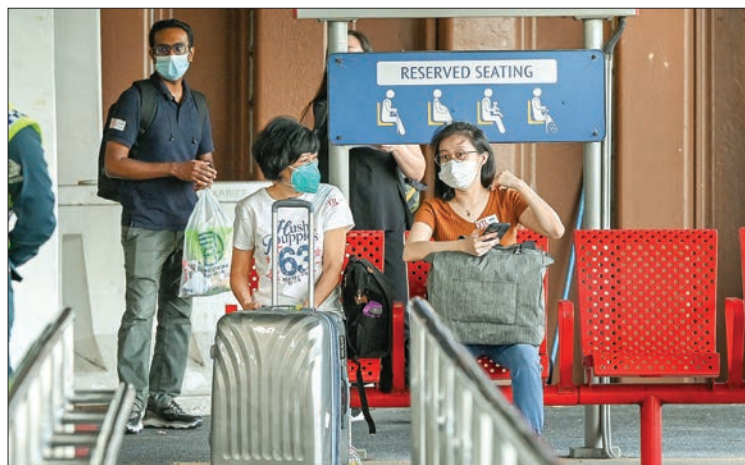
Passengers wait to board a bus in Singapore on 29 November 2021 to cross the border overland to Malaysia’s southern state of Johor under the vaccinated travel lane (VTL) between the two countries.

SINGAPORE and Malaysia eased coronavirus travel restrictions on one of the world’s busiest land borders Monday after nearly two years, allowing some vaccinated people to cross without quarantine.