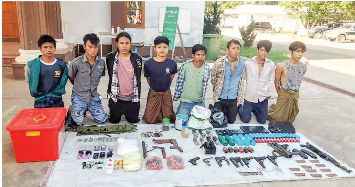
Arrestees are seen along with weapons and ammunition in Monywa.