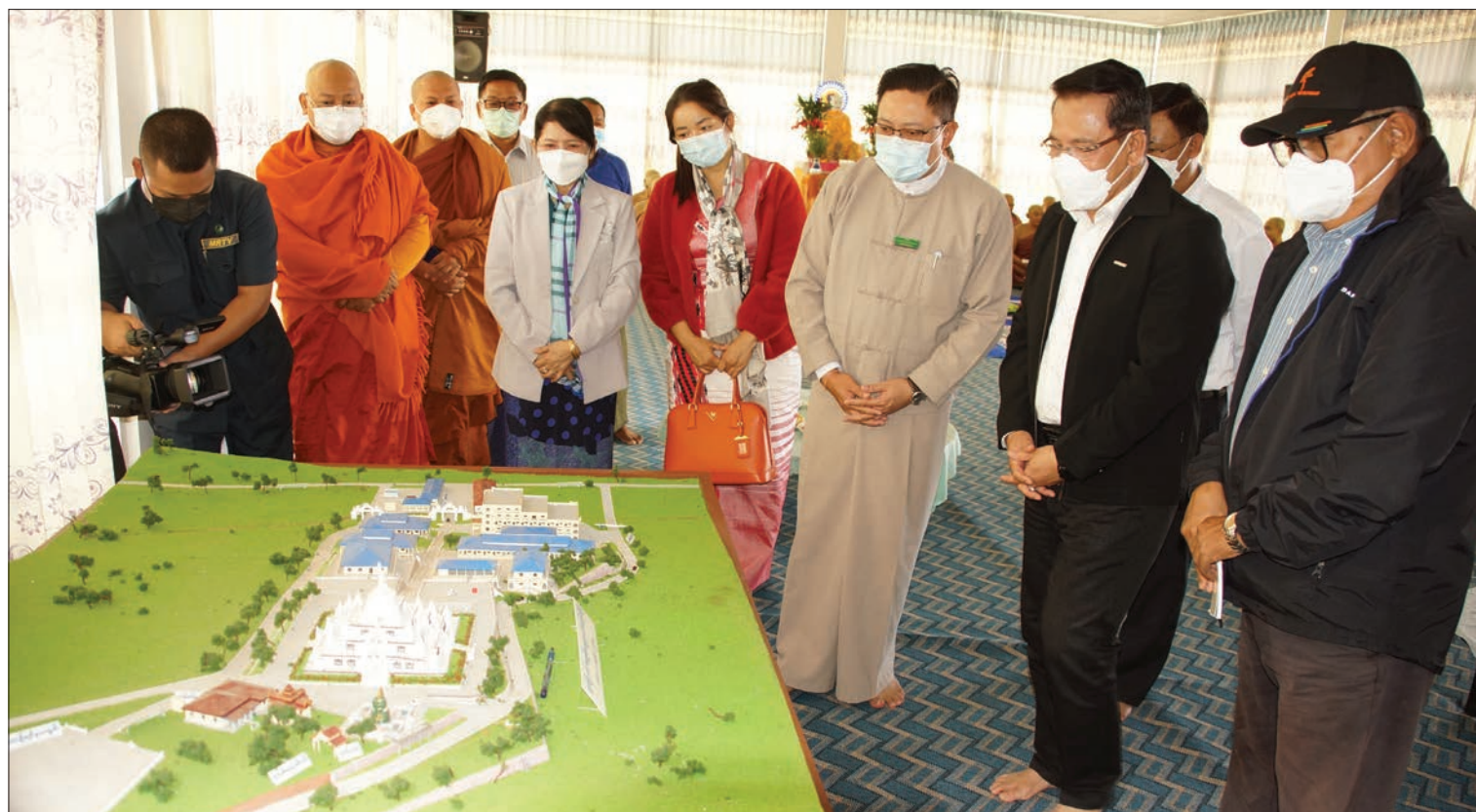
The MoI Union minister views the miniature version of the construction of Ananta Zina Thanbuddhe Pagoda in Ywangan on 29 November 2021.

The Union minister highlighted the need to launch computer courses and other vo-