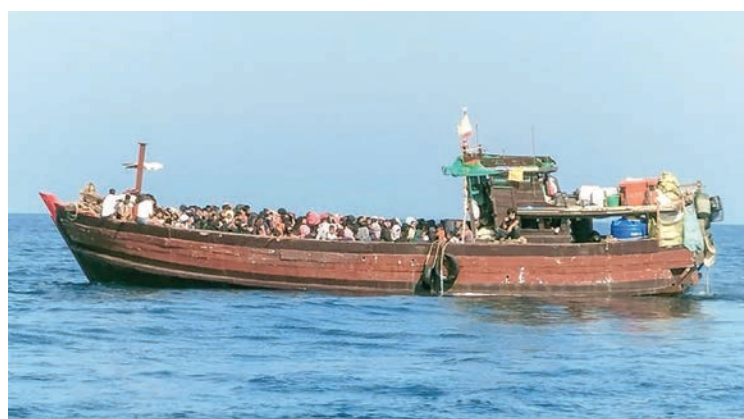
A motorboat carrying 228 Bengalis is apprehended by Myanmar Navy.

They will be handed over to the Myanmar Police Force, Township Immigration Department and officials to proceed according to the procedures, it is reported. — MNA