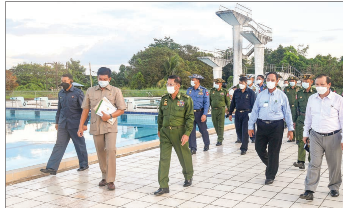
The Senior General looks around the National Swimming Pool in Yangon on 29 October.

On 18 October, the Chairman of the State Administration Council granted pardons and commutations to 1,316 detainees and prisoners from various prisons and detention centres. In addition, the criminal cases of 4,320 people charged in connection with the riots were closed. These included 34 artists and social media celebrities who had been arrested for inciting unrest. The amnesty was intended to promote humanitarian values and enable those who had been released to contribute to nation-building efforts.