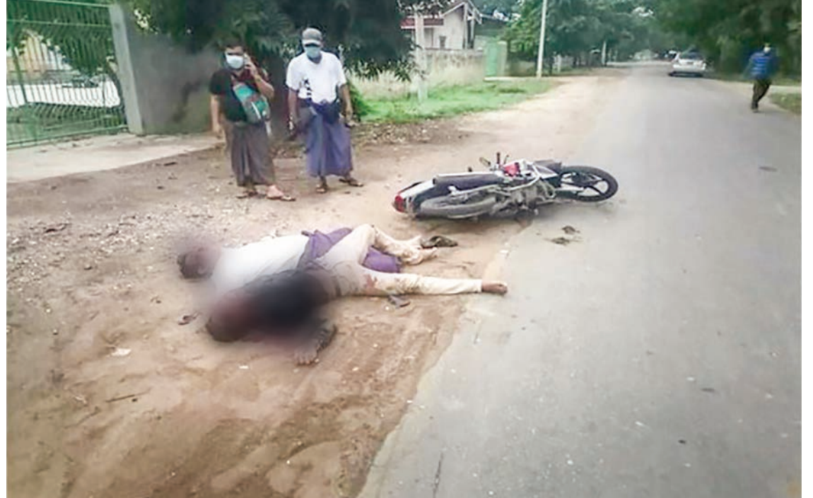
Civilians are killed by terrorists in Monywa on 26 October.

The people are urged to work together to prevent killing of good service personnel by the terrorists for ensuring development, peace and stability of the State, and if they receive information about the terrorist activities, they should secretly contact the nearest security forces and cooperate with them until the terrorists can no longer stand. — MNA