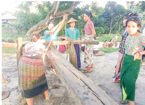
More than 30 years ago, there was no oil miller in the villages of Bamauk Township and so the people created the ox-driven oil grinders. Currently, such tradition becomes disappeared in some villages and only 23 villages in the Kanan region still use such traditional ways.

They peel the peanut and sesame and dry them in the sun. Then, they pound them in the large motor and place them in the pot to boil. Moreover, they put it in the material (nhyat taung) made of Tazaungmon bamboo strips with 8 inches each in width and height, and make holes in mango trees, tamarind tree or Albizzia lebbek, use the Rosewood block with 8 feet in length and a girth of 10 feet to press