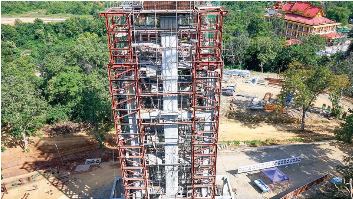
The elevator tower is 210 feet in length and 119 feet high. The tower also includes a 12-foot-wide walkway. The total cost is estimated to be about K1.6 billion.

THE construction of elevator tower and skywalk Way Bridge was completed by 74 per cent, said U Than Lwin, construction project manager.