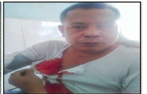
A civilian (wounded) in Monywa on 24 October.