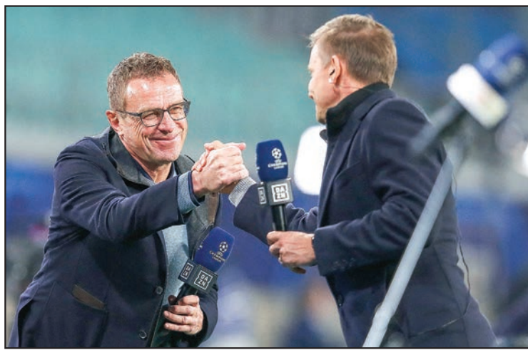
Leipzig's US head coach Jesse Marsch (R) shakes hands with Ralf Rangnick (L), former head coach of RB Leipzig, prior to the UEFA Champions League, Group A, football match RB Leipzig v Paris Saint-Germain in Leipzig, eastern Germany on 3 November 2021.

Solskjaer's failed reign was defined by an acute lack of coherent game-planning. But Rangnick's role in championing the "gegenpressing" (counter-pressing) philosophy popularised by Liverpool boss Klopp suggests United are about to be dragged into the 21st century. United lured Rangnick from his role as Lokomotiv Moscow's head of sports and development after learning Paris Saint-Germain were