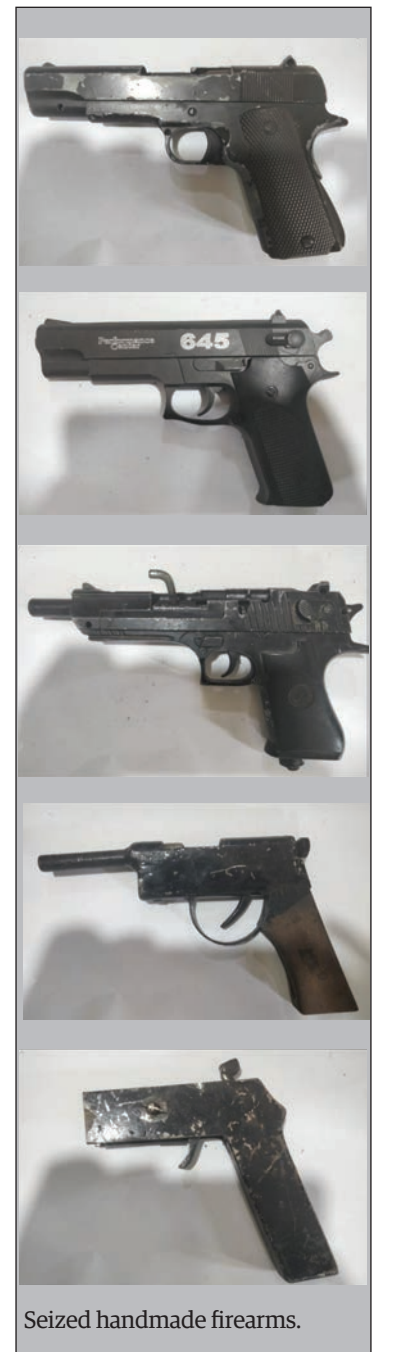
Seized handmade firearms.