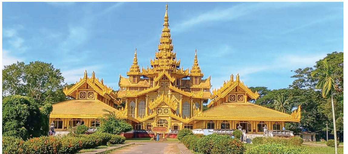
Kanbawzathadi Palace located near the southern archway of the magnificent Shwemawdaw Pagoda in Bago is a landmark in the Bago Archaeological Zone, covering an area of 64 acres.

As of 31 December, the admission to the Kanbawzathadi