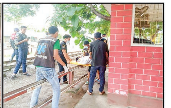
A security member is killed by terrorists in Monywa on 22 September.