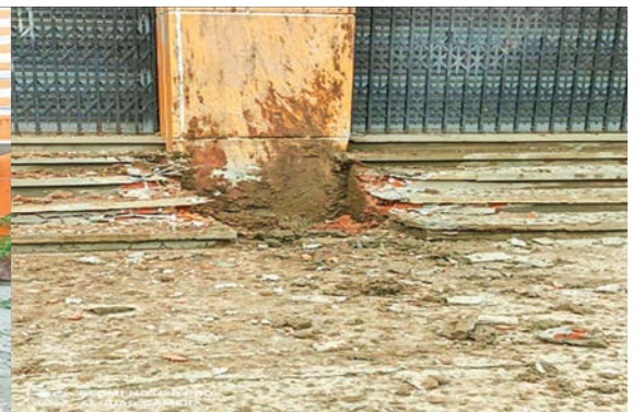
A handmade bomb blast in front of Mytel office in Monywa on 15 September.