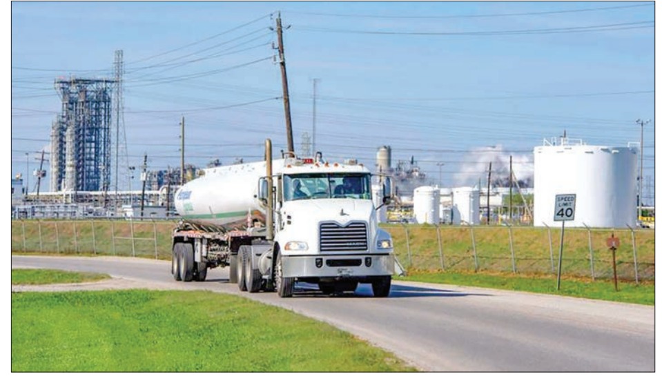
OPEC+ oil producers meet Thursday under pressure from US President Joe Biden, who has opened up his country's taps hoping to bring down crude prices, and a new Covid-19 variant that has complicated the equation. A truck drives past an oil storage facility in Houston, Texas, on 21 April 2020.

After coming under heavy pressure to step up production, leading members the United States, China, India and Japan last week announced that they would dip into their strategic reserves to help bring down crude prices, after a surge that has un-