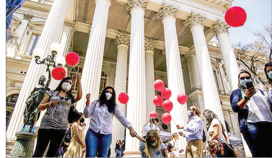
The Iguales Fundation LGBT rights group demonstrated outside the Constituent Assembly in Santiago, Chile, on 29 November 2021, ahead of a Senate vote to approve a bill legalizing same-sex marriage.

"We want to insist that this bill should become law right now. There can no longer be excuses for continuing to drag out the discussion in congress while