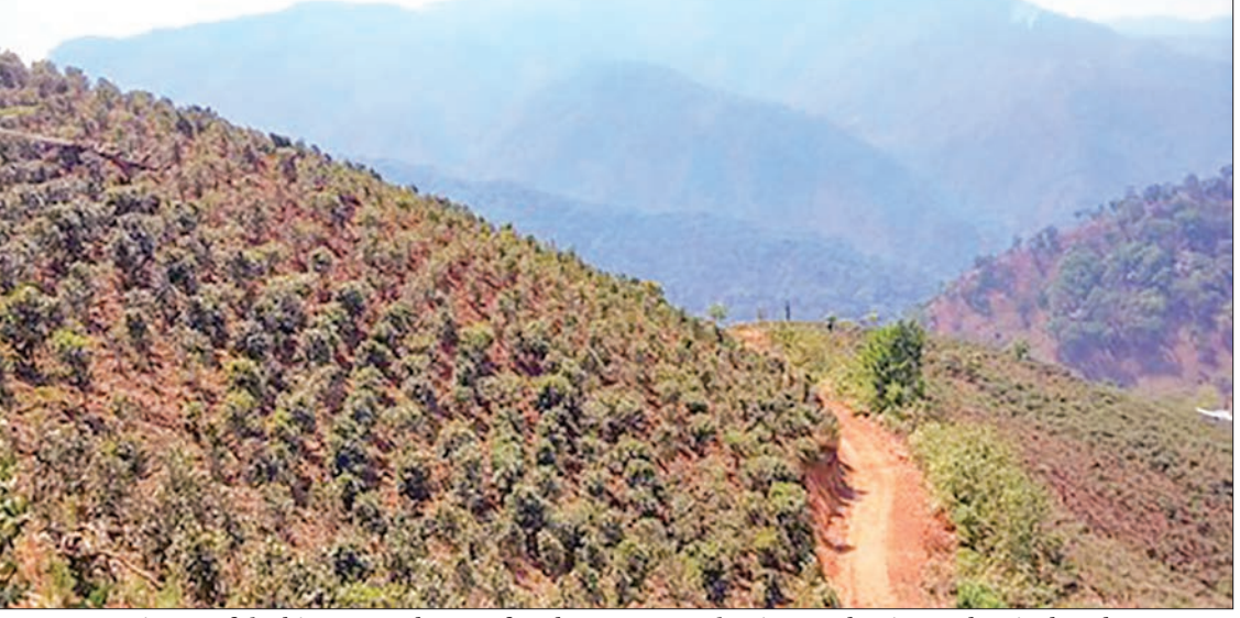
As Myanmar is one of the biggest producers of tea leaves, strengthening production and agricultural technology will make it one of the world's top tea exporters. Tea cultivations, as well as fishery and other exports, generate annual foreign income in Myanmar.

Assistant Director of the Kanbawza Trade Centre, Myanmar Trade Promotion Organization, Ministry of Commerce, said, "We focus on export promotion. In Shan State, there is a tea plantation project which provides technology to farmers as alternative development. With better methods, production has increased and more advanced