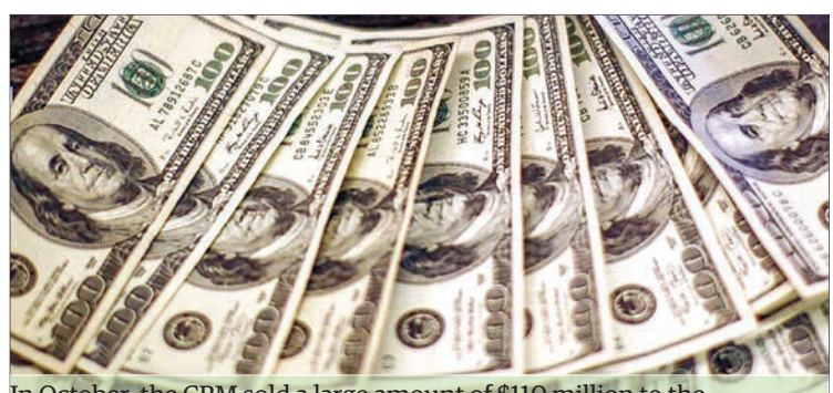
In October, the CBM sold a large amount of $110 million to the authorized dealers to stabilize the currency. In September, the CBM sold 63 million dollars to the private banks to increase the local currency value. Last September-end, a dollar value reached the highest of over K3,000 in history.

THE Central Bank of Myanmar (CBM) sold US$31 million at its FX auction rate in November to steer the local currency value, according to the auction result issued by the CBM on 30 November. The CBM sold the foreign currency to the prioritized sectors (palm oil, fuel oil and pharmaceuticals) at an auction rate through the authorized banks. The CBM sold the US dollars at the set rate to the banks with the authorized dealer licence where the companies screened by the National Trade Facilitation Committee opened an account. In October, the CBM sold a large amount of $110 million to the authorized dealers to stabilize the currency. In September, the CBM sold 63 million dollars to the private banks to increase the local currency value. Last September-end, a dollar value reached the highest of over K3,000 in history.