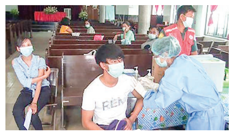
Locals get jabbed against COVID-19 in Taungoo.

TATMADAW has been working together with doctors, health workers and volunteers to carry out COVID-19 immunization to people over the age of 40, including monks, nuns, civil service personnel, prisoners,