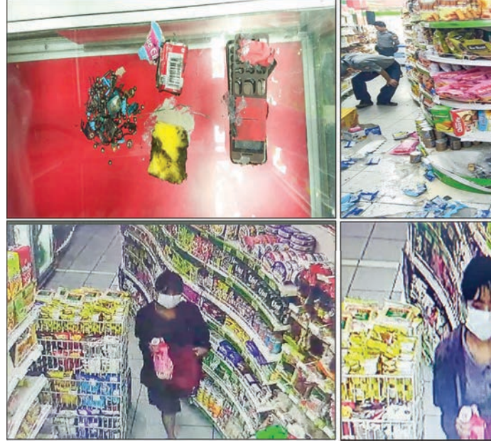
A handmade mine blast in Kamayut Township.

The public is urged to work together to protect the terrorists, and if they receive information about the terrorist movements, they should contact the nearest security forces and cooperate with them until the terrorists can no longer stand, officials stated. — MNA