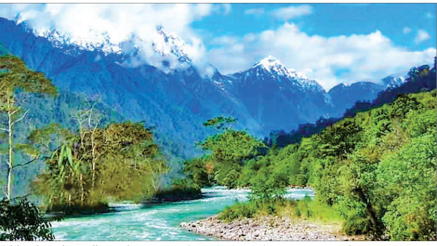
Khakaborazi boasts of its natural beauty and scenery in winter. Those tourism sites in northern Myanmar are attracting homegrown tourists.

The biodiversity and scenery of icy mountains are catching