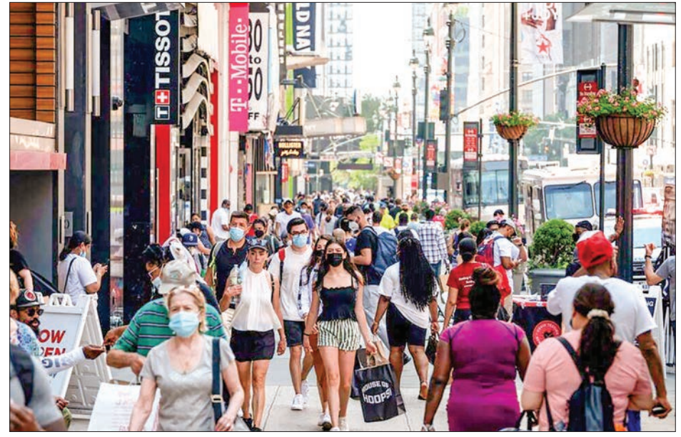
Federal Reserve boss Jerome Powell warned Omicron posed a 'downside risks to employment and economic activity, and increased uncertainty for inflation'. People walk through a shopping area in New York City, on 11 June 2021.

EQUITIES and oil sank again Tuesday after the head of Moderna warned current coronavirus vaccines might be less effective at fending off the Omicron variant, fuelling fears that countries could be forced back into economically painful lockdowns.