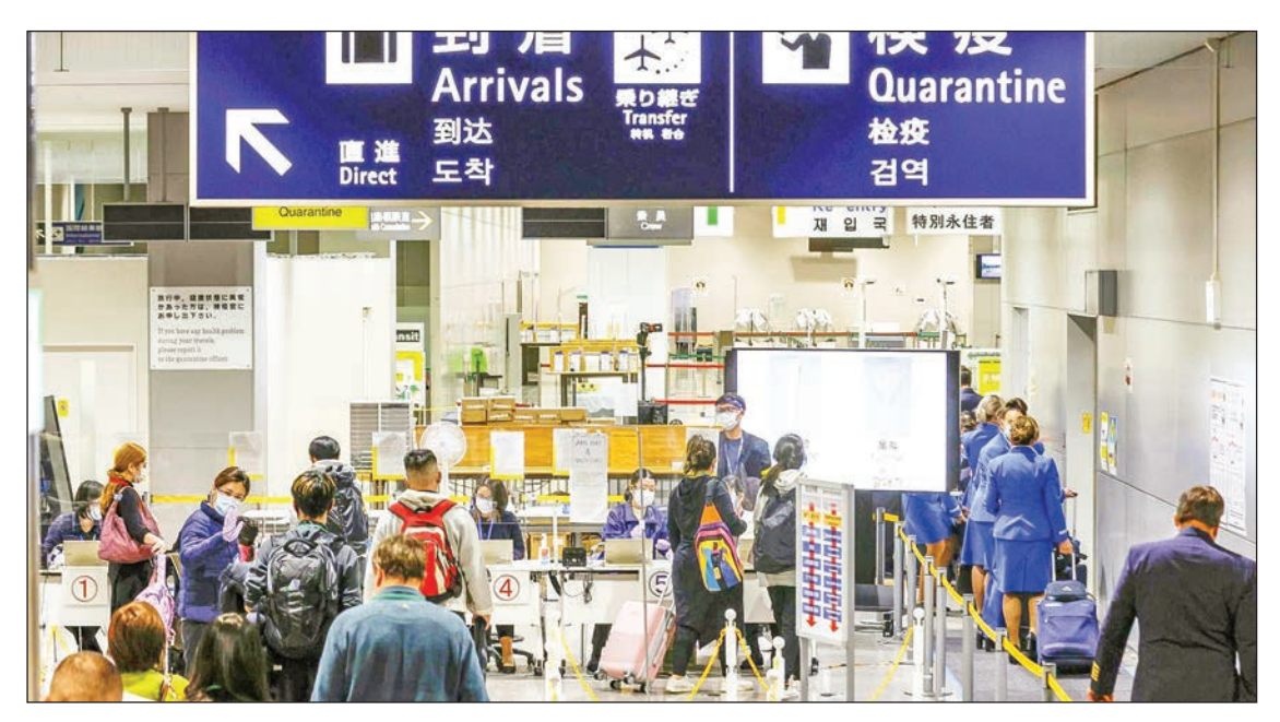
Japan has confirmed the first case in the country of the omicron variant of the coronavirus.

JAPAN on Tuesday confirmed its first case of the Omicron coronavirus variant, a day after authorities announced new Covid border restrictions.