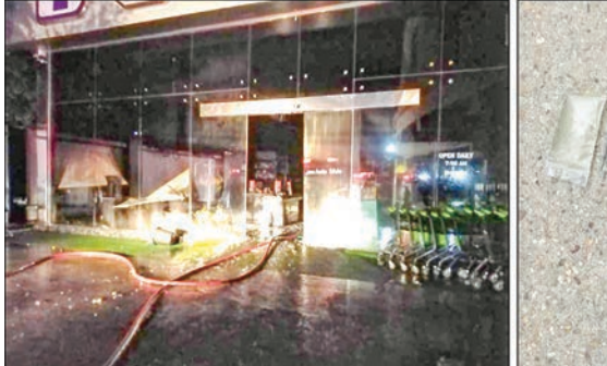
One Stop Mart in Bahan Township.