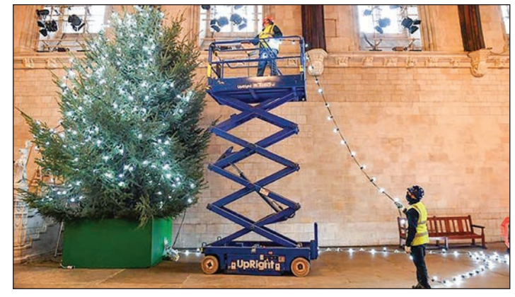
A photograph released by the UK Parliament's Christmas tree being erected at Westminster Hall in London. Adults in Britain will be able to get 3rd Covid jab, a government body said, as concerns mount about the Omicron variant's spread. PHOTO: AFP

Britain is one of several countries to have announced cases of the new variant on their soil, including Germany, Italy and the Netherlands. Six cases of the new strain were detected in Scotland on Monday, two of them in the largest city of Glasgow. Five others were confirmed in England, Javid told parliament.— AFP