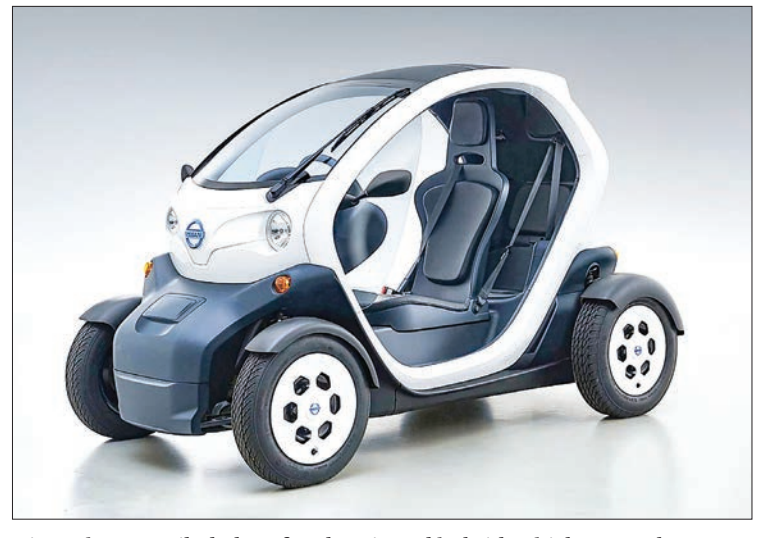
Nissan has unveiled plans for electric and hybrid vehicles to make up half its global sales by 2030. Nissan New Mobility Concept.

are being increasingly adopted in the face of concern about climate change, with Britain moving to