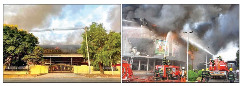
GandamaWholesale in Mayangon Township.