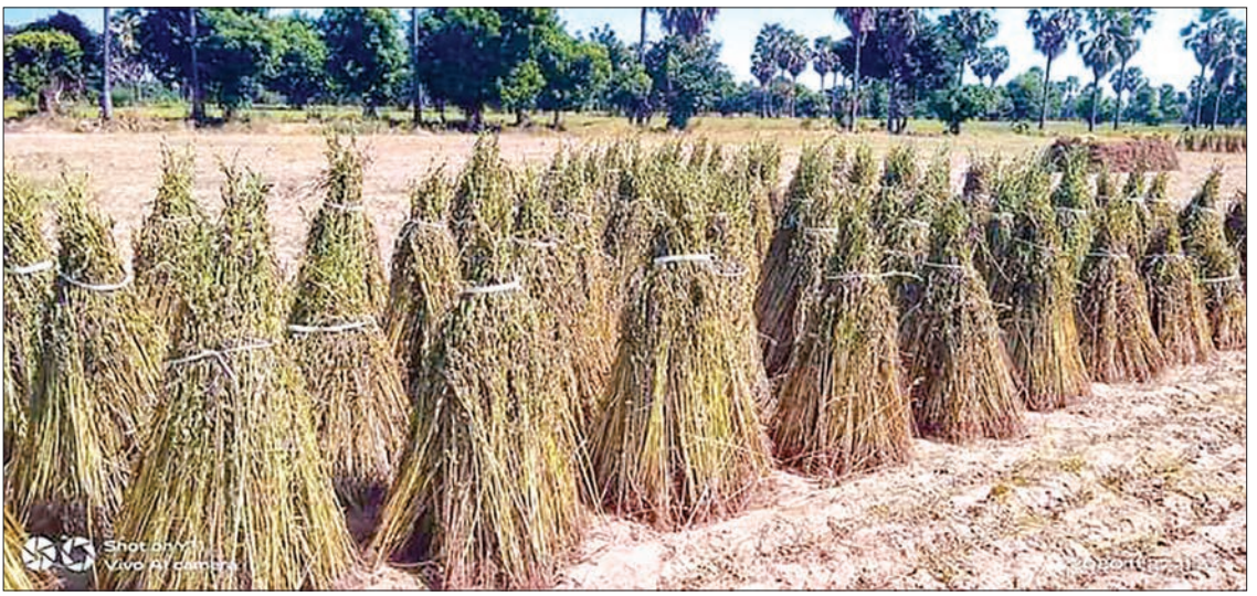
Every year at this time, the farmers conveyed about 500 bags of sesames to the commodity depot daily. But this year, only about 200 bags are transported to the depot.

Currently, the price of sesame seeds is remaining upward trend on low yield. The price of black sesame stood at K78,000 per viss, while the price of another variety sesame is priced at K46,000 per viss.