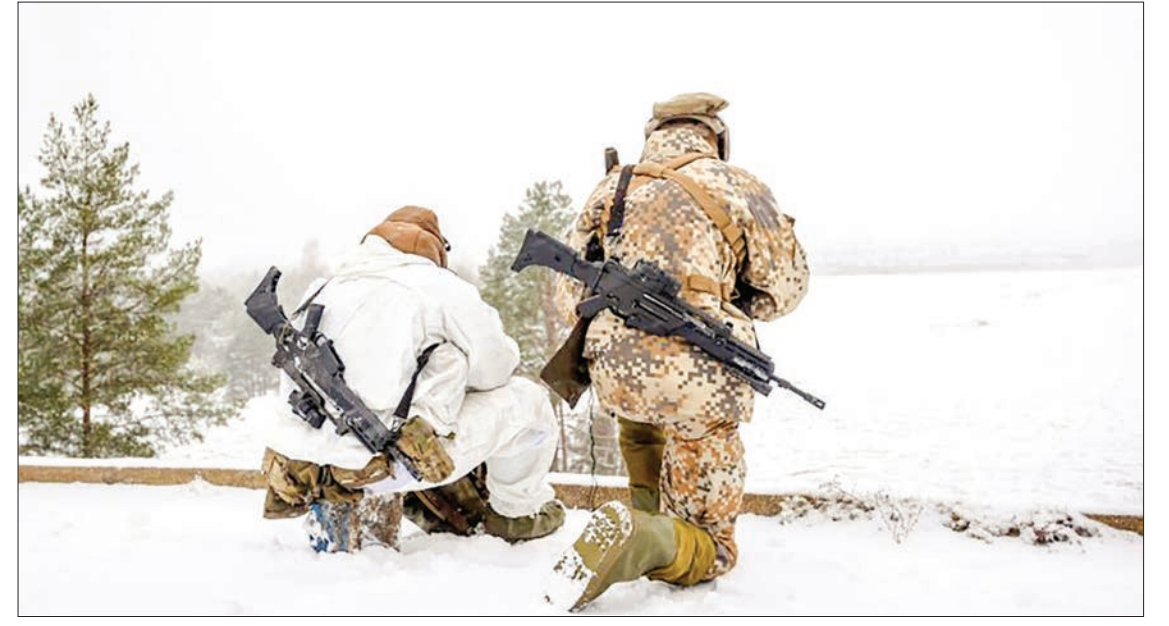
Soldiers take part in the NATO annual military exercise "Winter Shield" 2021 in Adazi, Latvia.

NATO foreign ministers will meet on Tuesday to discuss how to counter a Russian military build-up on Ukraine's border amid fears the Kremlin could be preparing to invade.