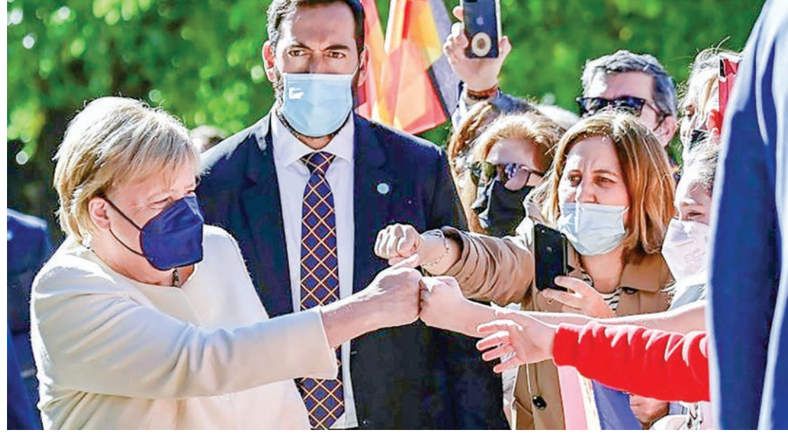
Angela Merkel has been lauded for her steady hand in steering the bloc through crisis after crisis.

ANGELA Merkel's departure from the political stage after 16 years as chancellor has not only ushered in a new era in Germany but also shakes up the power balance in the EU.