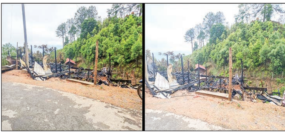
Setting fire in Kanpetlet.

Arson attack on security checkpoint in Tiddim.