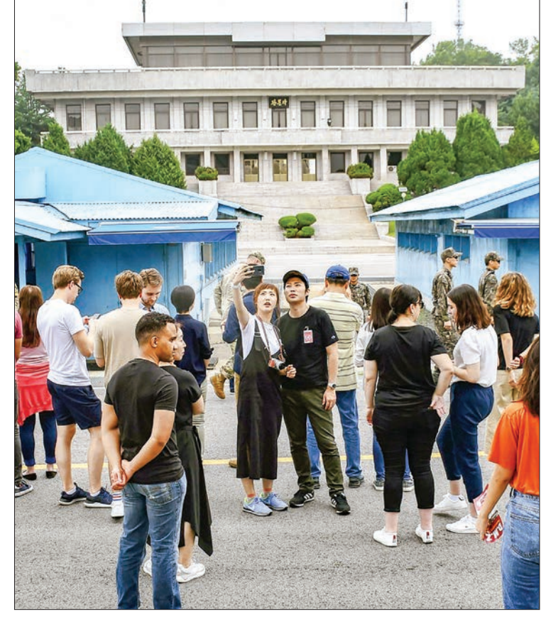
Tourists take a selfie in front of a North Korean facility at the truce village of Panmunjeom from the South Korean side on 23 July 2019. PHOTO: KYODO

Concerned about the virus's spread, North Korea continues to keep its border with China closed.—Kyodo