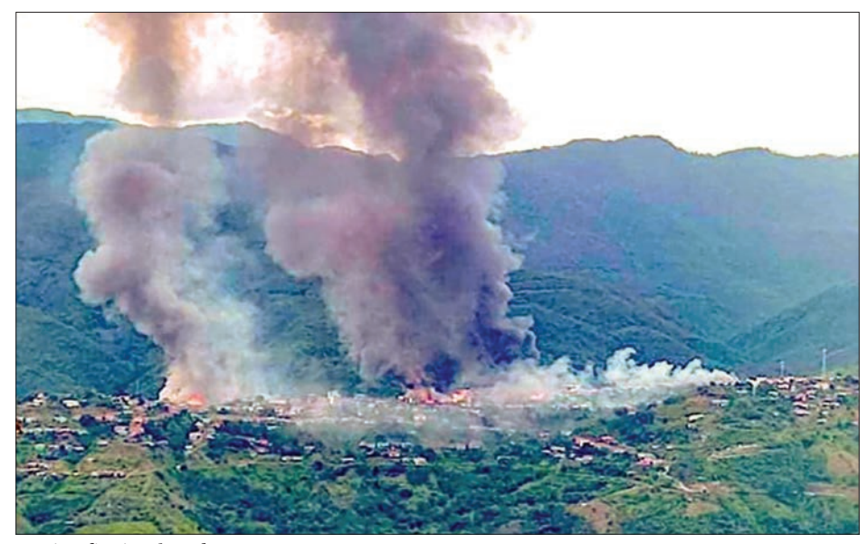
Setting fire in Thantlang.