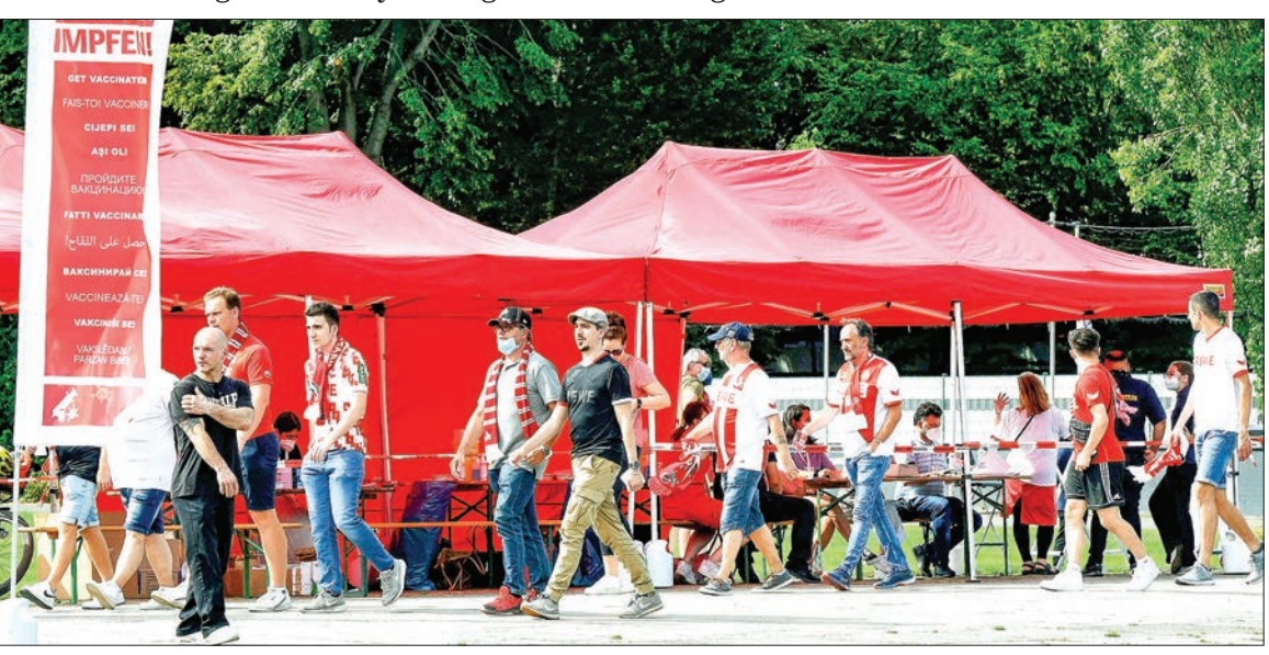
Visitors walk past stands offering the opportunity for free vaccination shots to fans and residents ahead of a German Bundesliga football match in Cologne, western Germany.

But the World Health Organization warned Tuesday - as Canada expanded its restrictions to also include Egypt and Nigeria that "blanket" travel bans risked doing more harm than good.