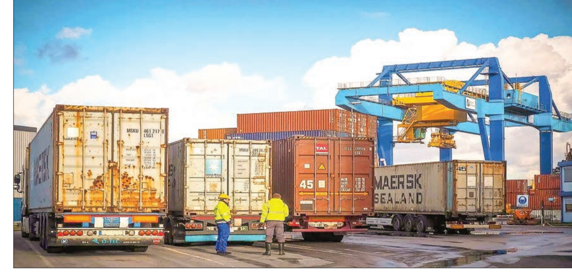
Economists had forecast growth would drop around 2.8 per cent, but increased exports appear to have come to the rescue – buoyed by high coal and gas prices.

said the strain "poses new risks to the global economic growth and inflation outlook".