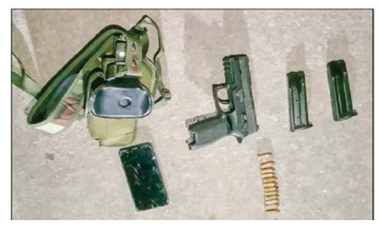
Seized weapons and ammunition.

The arrested suspects will be taken action under the law and the people are requested to work together to fight against the terrorists and to secretly report any information or movement of them to the relevant authority and that they will be rewarded, it is reported.