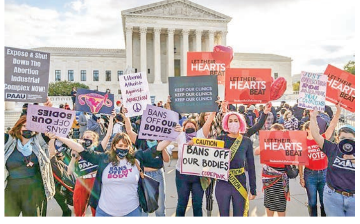
Abortion rights and anti-abortion demonstrators rally outside the US Supreme Court.

"We recognize the magnitude of what we are asking," Mississippi Attorney General Lynn Fitch wrote in The Washington Post.—AFP