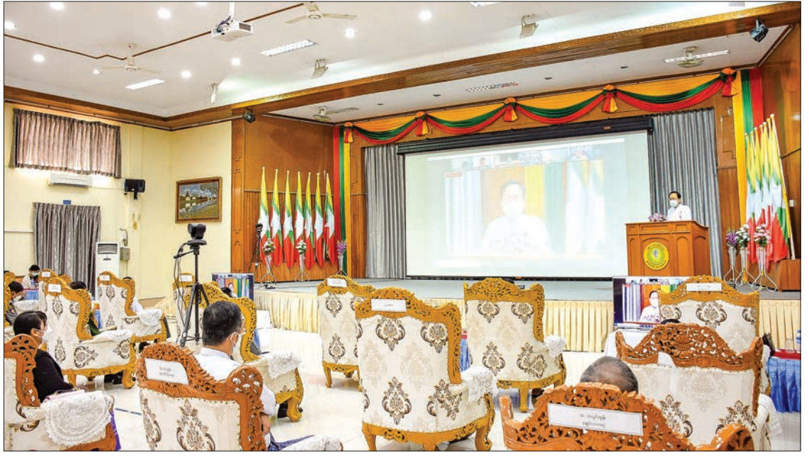
World AIDS Day 2021 in progress in Nay Pyi Taw.

In 2021, 362 ART clinics were opened in 273 townships to provide treatment for HIV/ AIDS patients, making the ART medical services more accessible. In addition, prevention of mother-to-child transmission of HIV (PMTCT) has been extended to 330 townships nationwide this year. Preventive care and treatment have been stepped up since 2021 with increased funding from the government, he said. The government has been increasing the allocation of funds from the 2016-2017 financial year to make sure that there is no shortage of medicines and related medical supplies for ART medical services. In the 2020-2021 FY, up to US$ 15 million was allocated and more are planned to be allocated in the coming years, he continued. As a result, out of an estimated 240,000 people living with HIV, more than