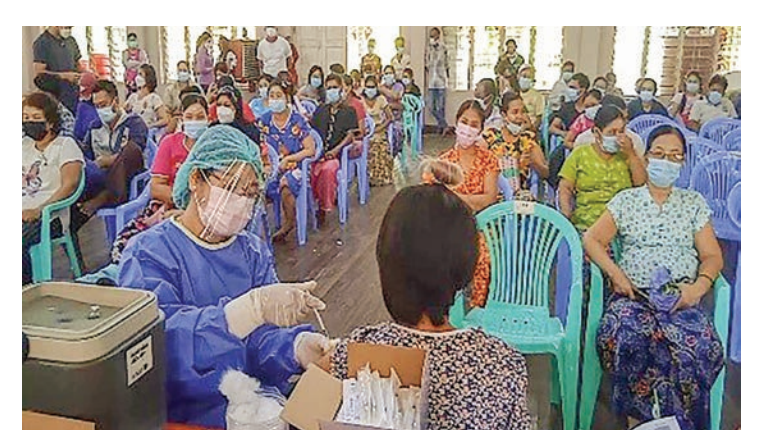
Inoculation is underway for locals in Mon State.