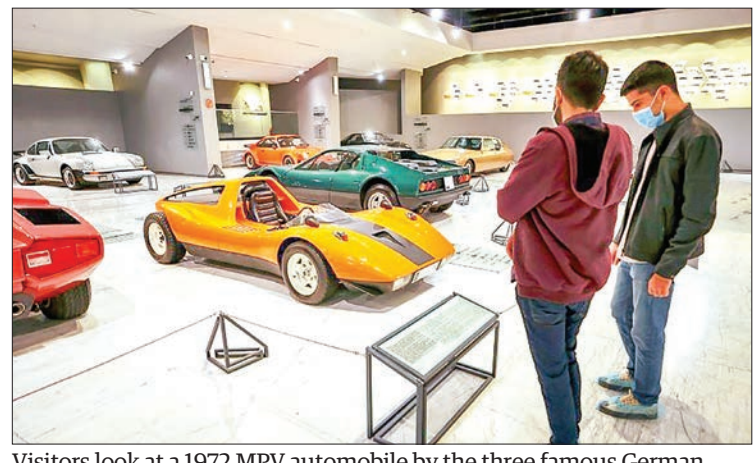
Visitors look at a 1972 MPV automobile by the three famous German car manufactures Mercedes-Benz, Porsche and Volkswagen at the IIran Historical Car Museum.

BEFORE they were ousted by the 1979 Islamic revolution, Iran's royal family enjoyed a lavish lifestyle with a taste for fast