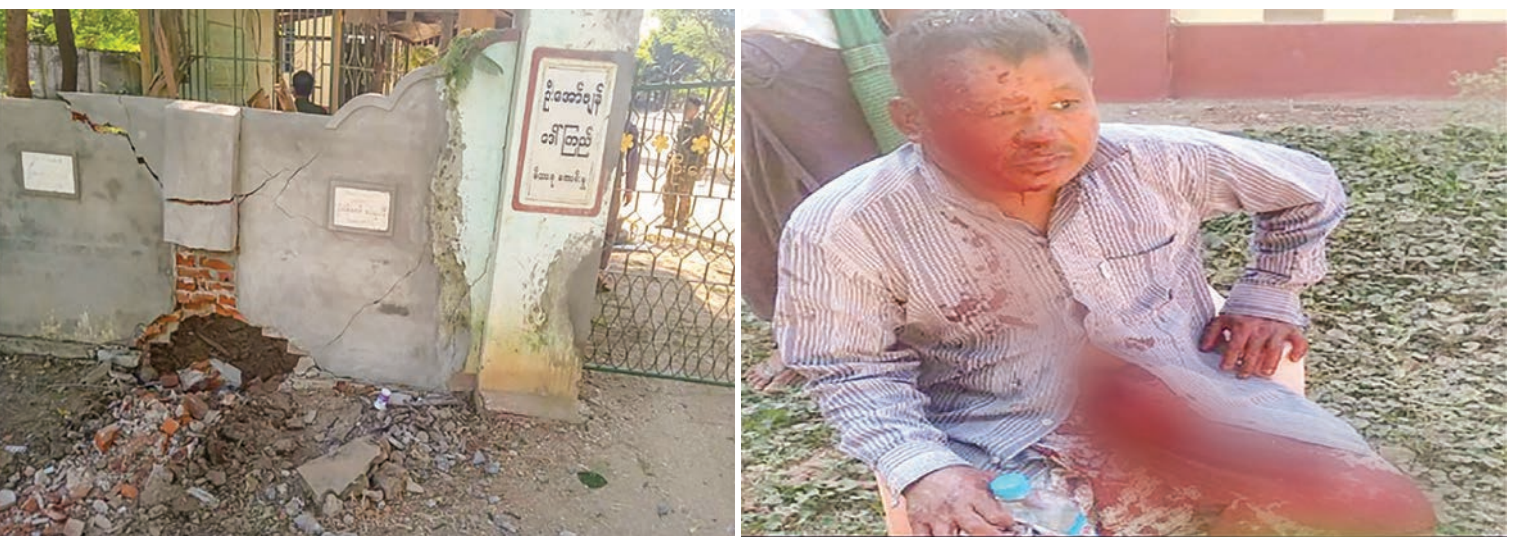
Damages are seen at No 1 Basic Education High School in Taze Township.

U Aung Ba Hein, 45-yearold, a member of the village support group, was taken to Pwintbyu Township People's Hospital for treatment after suffering landmine injuries near the security checkpoint.