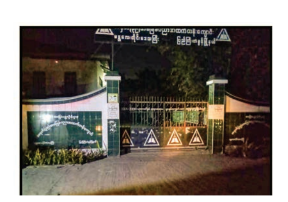
A handmade bomb blast at No 39 Basic Education High School in Pyigyidagun on 5 September.

A handmade bomb blast nearby Royal One KTV at the roadside in Mahaaungmyay on 31 October.