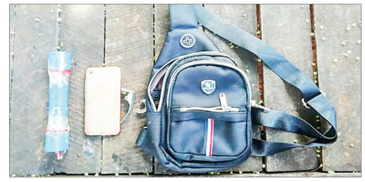
Some items of equipment were seized from terrorists who committed grenade attack on Kyaukme Township education office on 11 December.

it is reported that necessary interrogations are being carried out to ensure that the detainees are prosecuted in accordance with the law, and security forces are continuing to provide security for the towns/villages.—MNA