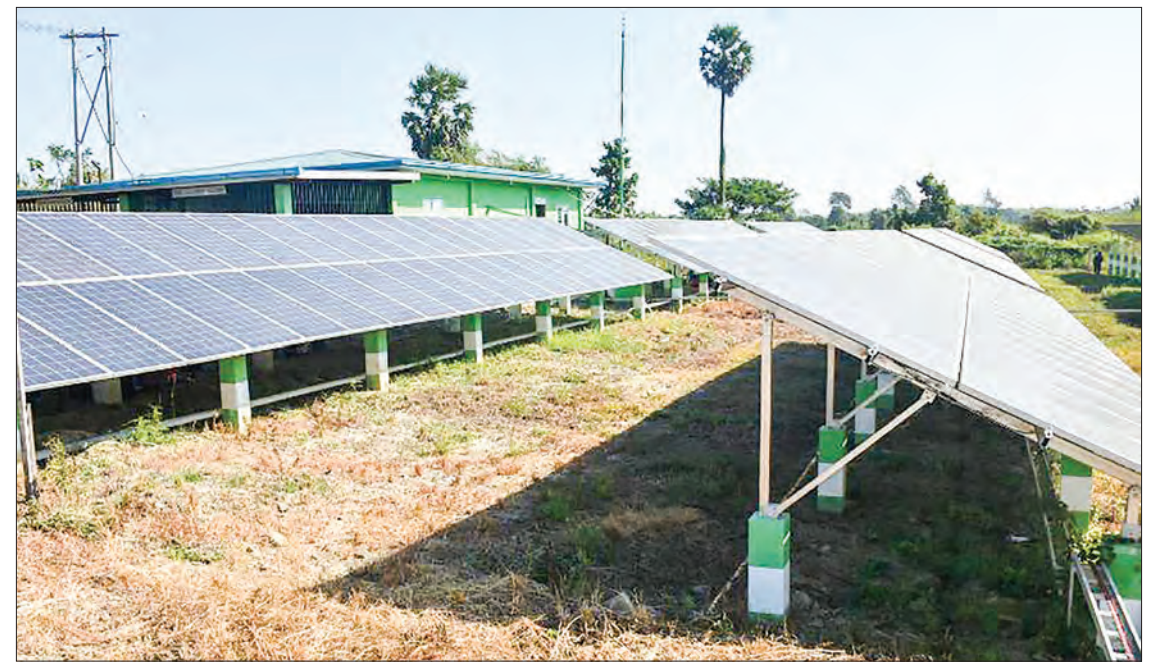
Solar\ panels\ are\ absorbing\ sunray\ to\ generate\ electricity\ at\ Solar\ Mini\ Grid\ Project\ in\ Myanaung\ Township.

A team led by Ayeyawady Region Chief Minister U Tin Maung Win, accompanied by Colonel Kyaw Swa Hlaing, Region Minister for Security and Border Affairs, Police Col Tin Zaw Tun, Region Minister for Transport and other officials concerned joined the ceremony of launching the solar power mini-grid project in Bantbwegon of Myanaung Township and formally cut the ribbon at the event on yesterday afternoon.