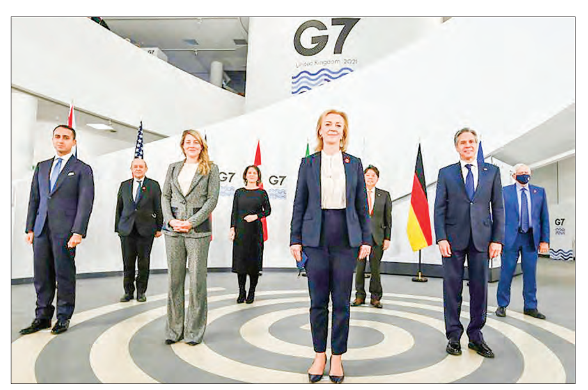
G7 foreign ministers met in Liverpool, northwest England, for talks about Russia's military build-up on the border with Ukraine, an assertive China and other threats.

The meeting — at which ministers want to present a united front against authoritarianism — is the last in-person gathering of Britain's year-long G7