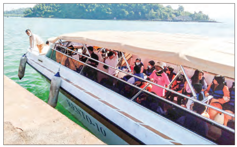
A speed boat carrying travellers is ready to start trip to islands.