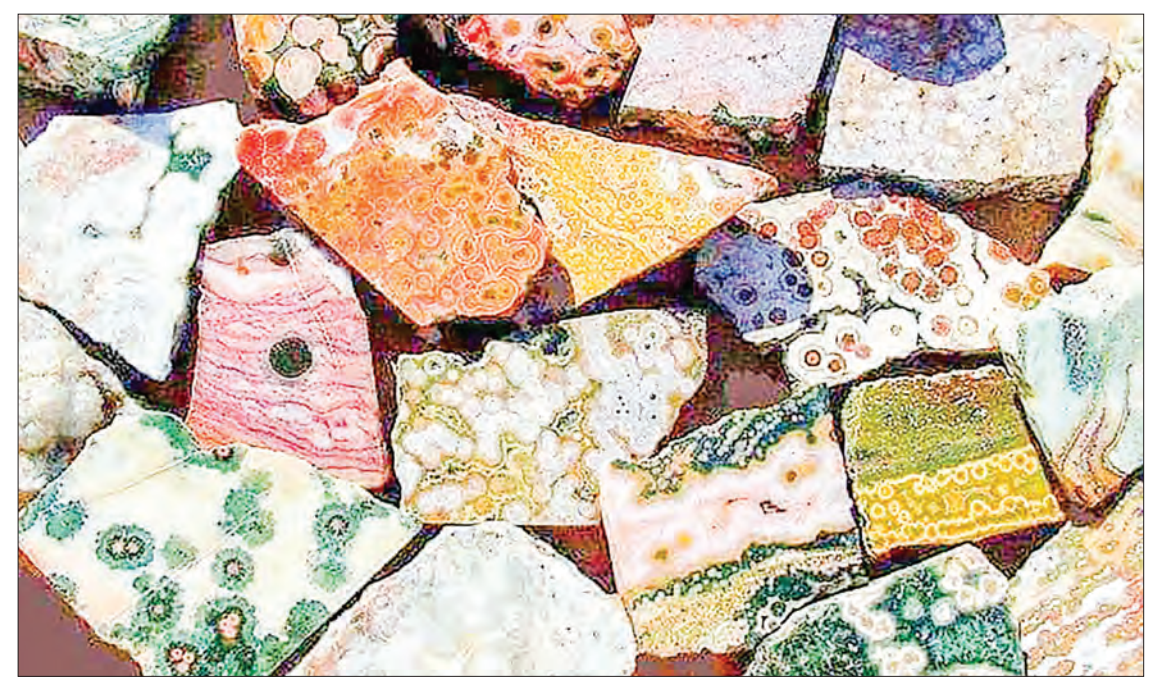
Pieces of petrified word are displayed at the market.

"The souvenir market is usually relying on tourists. However, the market is sluggish as it