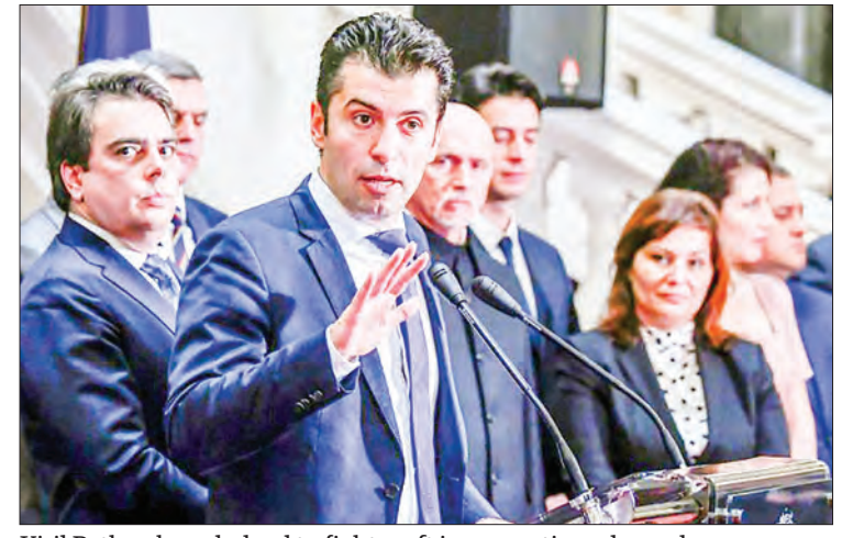
Kiril Petkov has pledged to fight graft in corruption-plagued Bulgaria.

BULGARIA'S PM-designate Kiril Petkov, whose new an-