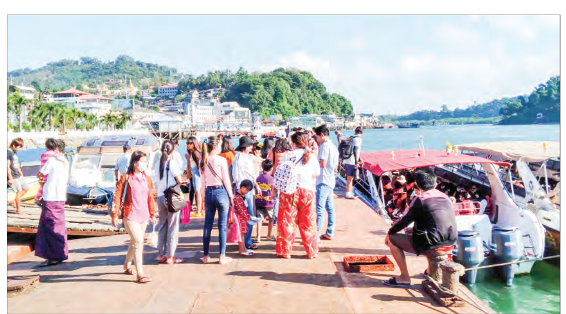
Flocks of travellers are seen on jetly in Kawthoung.

As measures to prevent and control the transmission of the disease, every traveller is required to present the proof of being vaccinated for twice against the COVID-19 disease and to wear face masks and gloves along the trip. As it is a sea voyage, it is necessary for all tourists to comply with the regulations of the Directorate of Hotels and Tourism and tourism companies so as not to endanger the lives of tourists, as well as the natural resources and ecosystems of the sea.—Kyaw Soe (Kawthoung)/GNLM