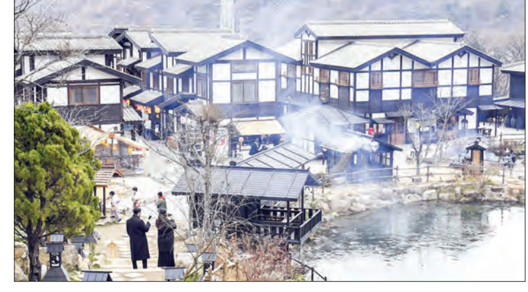
Photo taken in November 2021 shows a theme park that opened in South Korea's Dongducheon themed on Japan's Edo period (1600s-1860s).

"I've always wanted to travel to Japan, and after realizing that this place is nearby, I decided to make a visit," said 30-year-