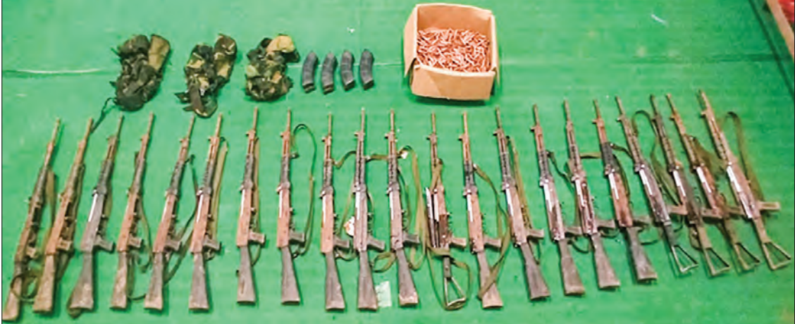
Assorted small arms were seized from PDF terrorists in Mogok Township from on 3 December.

and Bo Si killed one civilian of Peikswe area (3) of Shawliwaing Ward of Mogok Township under the instruction of Zaw Myo Tun (aka) Oak Gyi.