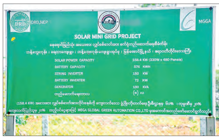
The board shows facts about solar Mini Grid Project in Bantbwegon of Myanaung Township.

The Chief Minister and party visited the solar power mini-grid project, implemented by Mega Global Green Automation Company, where U Nay Htet Shein, head of region Rural Development Department and officials and those of the company conducted the Chief Minister and party around the project site. The