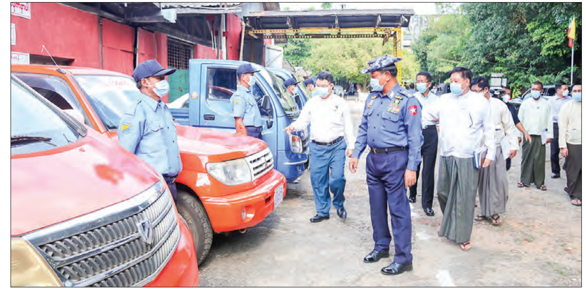
Union Minister Admiral Tin Aung San views round departmental vehicles at No 3 Workshop of Road Transport (Mayangon) on 11 December.

In the afternoon, the Union Minister visited No 3 Workshop of Road Transport (Mayangon) and he highlighted uplift of the morale and capacity of department, safety of staff and vehicles and clearance of irregularities by strictly follow-