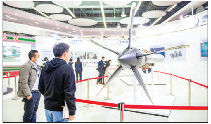
People view the exhibits at China International Rail Transit and Equipment Manufacturing Industry Exposition in Zhuzhou, Central China's Hunan province, 8 December 2021.

CUTTING-EDGE Chinese technologies have attracted enterprises from the United States, Germany, France and other countries at an international expo held in Zhuzhou city, central China's Hunan province.