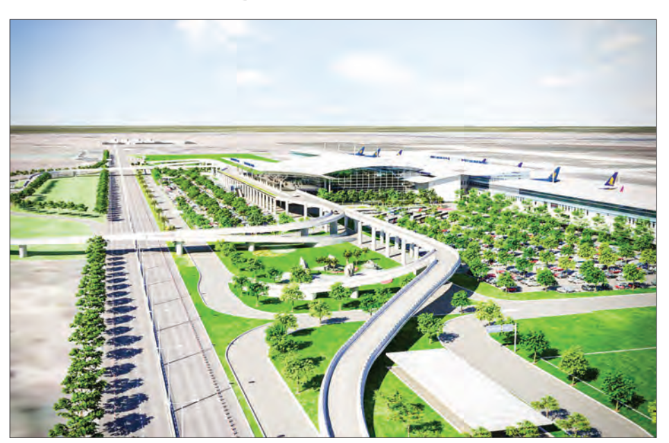
Noi Bai International Airport prepares to welcome a number of foreign visitors.

ic and tourism recovery and enable overseas Vietnamese to return to their homeland for the upcoming Lunar New Year, Vietnamese Deputy Prime Minister Pham Binh Minh said in the government directive. While the resumption of international flights is necessary, effective pandemic control must also be ensured, Minh said, urging relevant authorities and aviation businesses to work actively to realize the approved plan and make recommendations for adjustments in accordance with the actual situation. – Xinhua 🔳