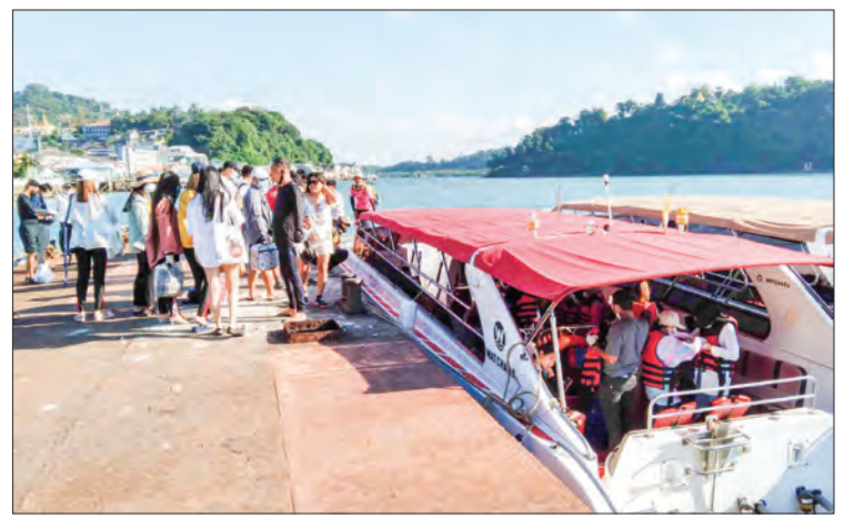
Crew members are preparing to launch trips to exotic islands in Kawthoung Township.