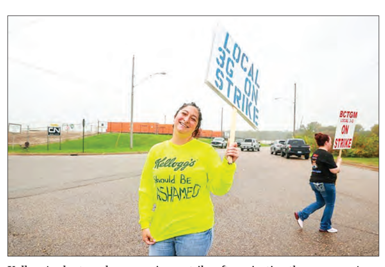
Kellogg's plant workers remain on strike after rejecting the company's latest contract offer.

US President Joe Biden slammed Kellogg's management for replacing striking workers and urged the breakfast cereal giant