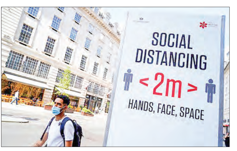
A pedestrian wearing face covering due to Covid-19, walks past a sign asking members of the public to social distance, in central London on 7 June 2021.

Meanwhile, experts also estimate that if it continues to