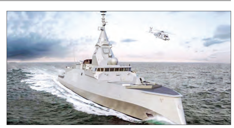
Athens has signed a deal with Paris to buy three French Belhara class frigates for €3billion. PHOTO: NAVAL GROUP

possible level. The Greek prime minister himself has announced it," the source told AFP on Saturday. On Friday the US State Department said it had approved the sale for $6.9 billion of four Lockheed Martin combat frigates, known as multi-mission surface combatant ships. The announcement suggested France faced a fresh commercial arms deal threat after the US wrested away a massive submarine contract for Australia in a shock announcement on 15 September that ruptured relations between Washington and Paris.—AFP■