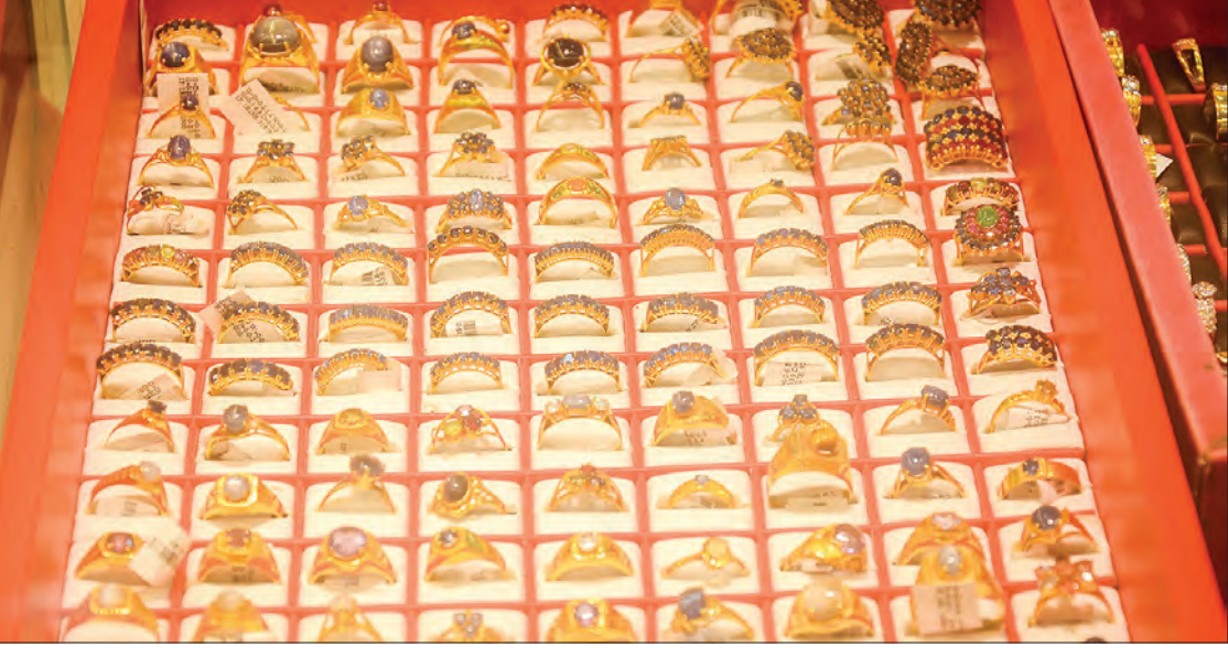
Currently, the pure gold price is about K1,793,000 per tical (0.578 ounce or 0.016 kilogramme) on 16 December in the domestic market while global gold price touches a high of above US$ 1,781 per ounce. Further, the dollar to kyat exchange rate was at K1,780 per dollar on 16 December.

"Now, our Myanmar gold market is operating as usual and the raw materials are also supplied from gold mining. When all the shops are reopened, the old gold scraps will be come back as raw materials. About 50 visses of gold are back to the shops as old gold scraps daily. Those old gold scraps are refined into pure gold bars and then about 50 visses of gold are resold in the market dai-