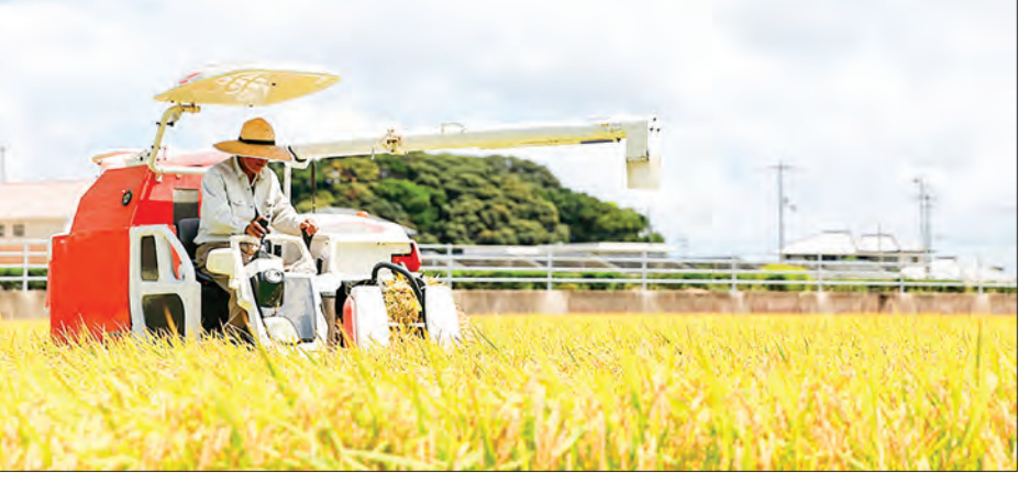
Japan's exports of agricultural products have grown steadily.

"We want to promote the growth of the agriculture, forestry and fishery industries by incorporating demand from overseas markets and stimulate regional economies," Mat-