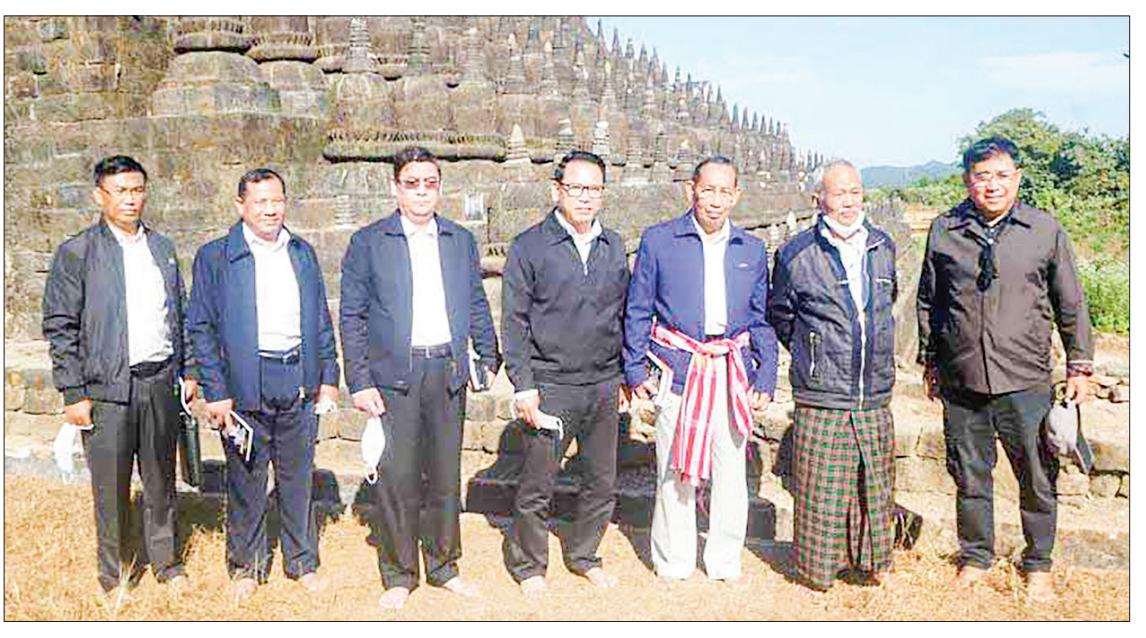
The members of the State Administration Council and Union ministers pose for the group documentary photo lagainst the architecture and culture-rich pagoda in MraukU.

They also visited the museum and viewed artefacts displayed at the museum. They called on systematic prepa-