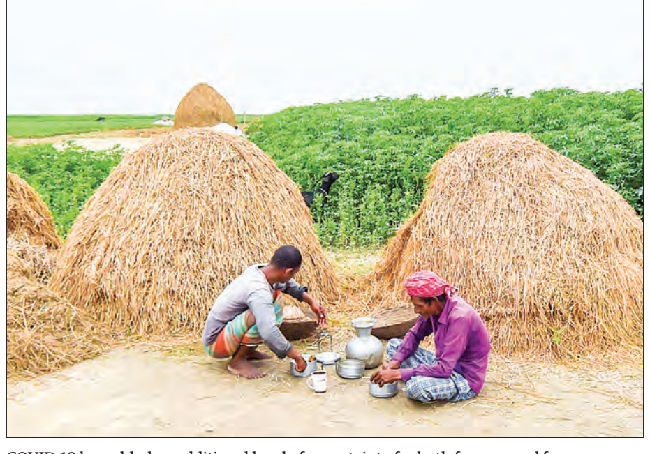
COVID-19 has added an additional level of uncertainty for both farmers and farm workers.

Hunger and poor nutrition levels in Asia and the Pacific in 2019 were already concerning, but the pandemic has made this drastically worse, UNICEF and FAO insisted, before adding that even countries that had initially reported a limited num-