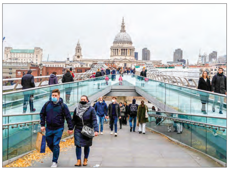
The UK Health Security Agency (UKHSA) confirmed that 10 people have been hospitalized with the Omicron variant in England.

"But over the last year, we've worked hard and we've achieved a great deal and that is why Europe is in a better position now to fight the virus," she said.