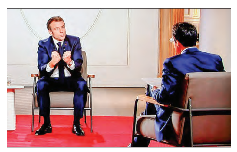
Macron sat down for a lengthy TV interview seen as part campaigning efforts before next year's election.

"If your question is 'are you looking ahead?','do you have