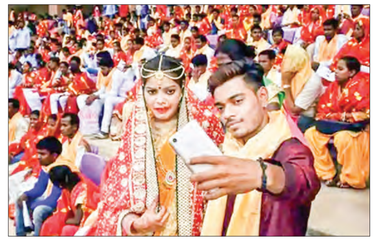
The decision to increase the marriageable age among women was reportedly made during a cabinet meeting on Wednesday.

INDIA'S federal government has cleared a proposal to increase the minimum age of marriage for women from 18 to 21 years, local media reports said Thursday.