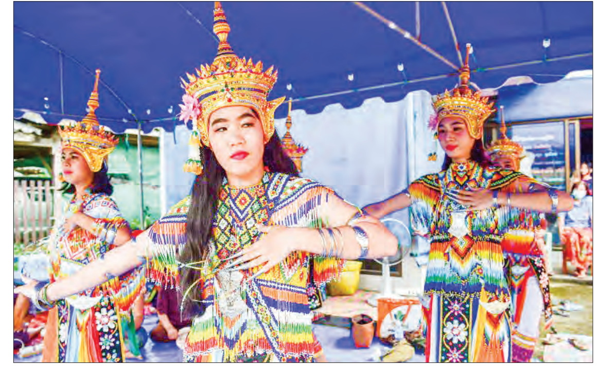
Dancers take part in a "nora" performance, a form of traditional folk dance, in Sungai Padi district in the southern province of Narathiwat on Saturday, ahead of UNESCO officially listing the art form as Thailand's "Intangible Cultural Heritage".

The ultra-elaborate showcases can last for up to three days. UNESCO on Wednesday officially listed nora as Thailand's "Intangible Cultural Heritage"—a move that could potentially bring more global recognition to a dance typically only seen in small village gatherings in the kingdom's south. In Narathiwat province's