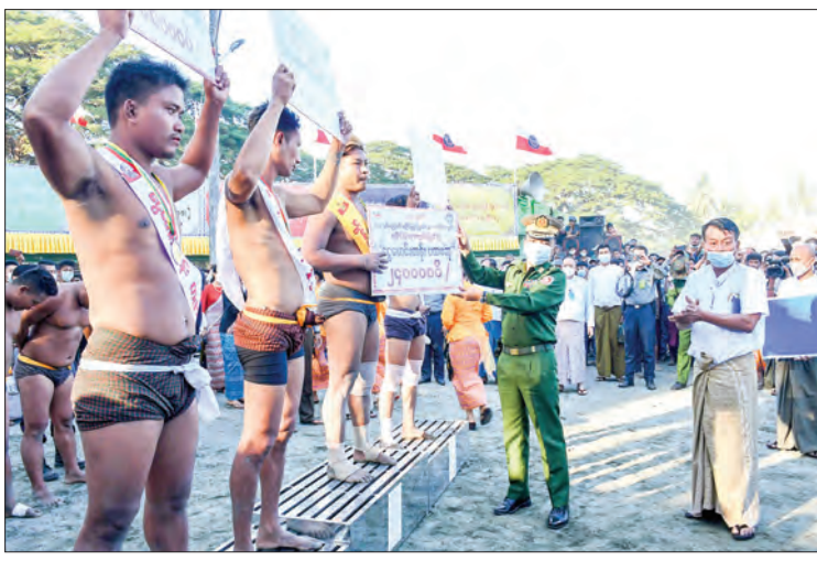
Prize-awarding ceremony.