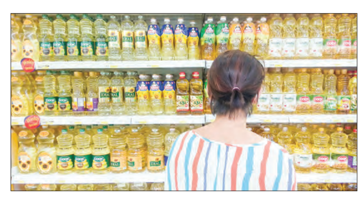
The price hit a record high of K5,000 per viss in late September. And it fell to K4,450 per viss in October-end. The price remained low at K4,270 per viss in mid-December.

THE price of palm oil plummeted to K4,270 per viss (a viss equals 1.6 kilogrammes) at present, following the Kyat revaluation on the US dollar in the local forex market, according to the domestic market.