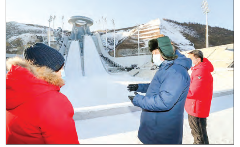
Chinese President Xi Jinping, also general secretary of the Communist Party of China Central Committee and chairman of the Central Military Commission, inspects the National Ski Jumping Center in Zhangjiakou, north China's Hebei Province, 19 Jan 2021.

With Putin pledging to join the ceremony of the Beijing Games and South Korean President Moon Jae In vowing not to mull a diplomatic boycott, the world could be