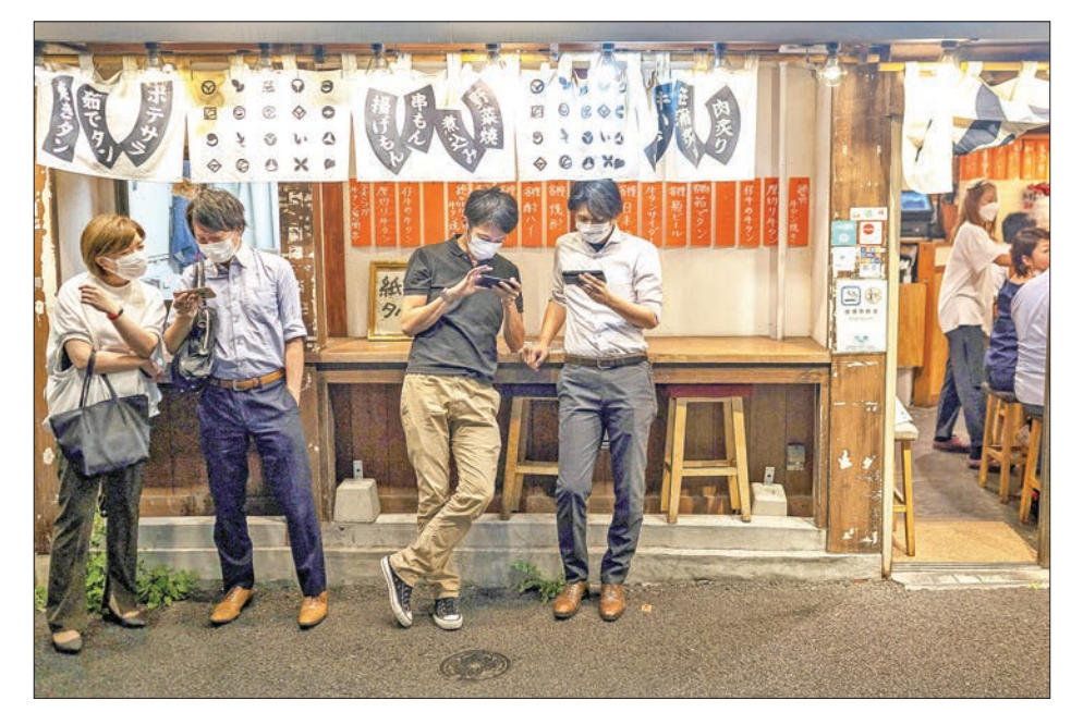
Evening diners wait for vacant seats at a restaurant in Tokyo on 24 September 2021.

The central bank, which has implemented a massive asset-buying programme to keep borrowing costs low for companies and consumers, owned 44.1 per cent of the outstanding debt