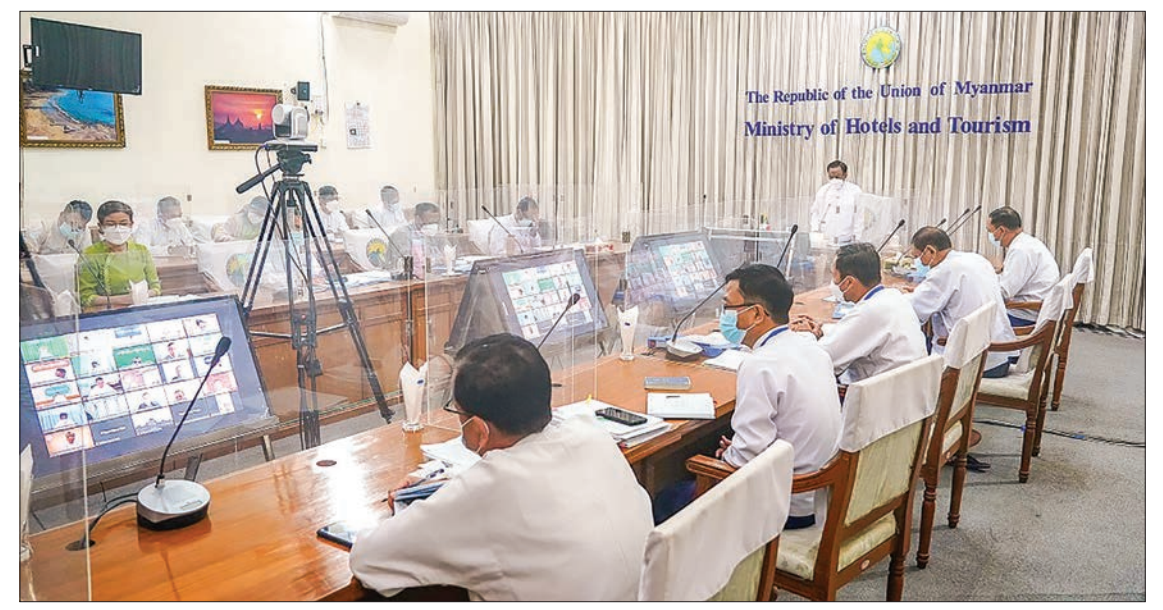
MoHT Union Minister Dr Htay Aung joins the virtual meeting of the Tourism Committee 2/2021 in Nay Pyi Taw yesterday.

At the meeting, the Union Minister, in his capacity as Chairman of the Working Committee, said that the COVID-19 epidemic was a genetic mutation and that it was spreading locally and in some neighbouring countries.