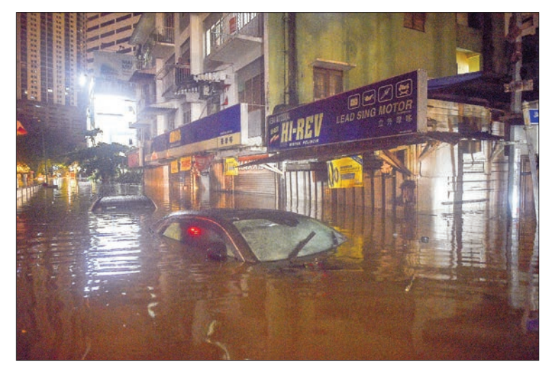
Cars are seen in flood water caused by heavy rain in Kuala Lumpur early on 19 December 2021.

MORE than 50,000 people have been forced from their homes in Malaysia and at least seven