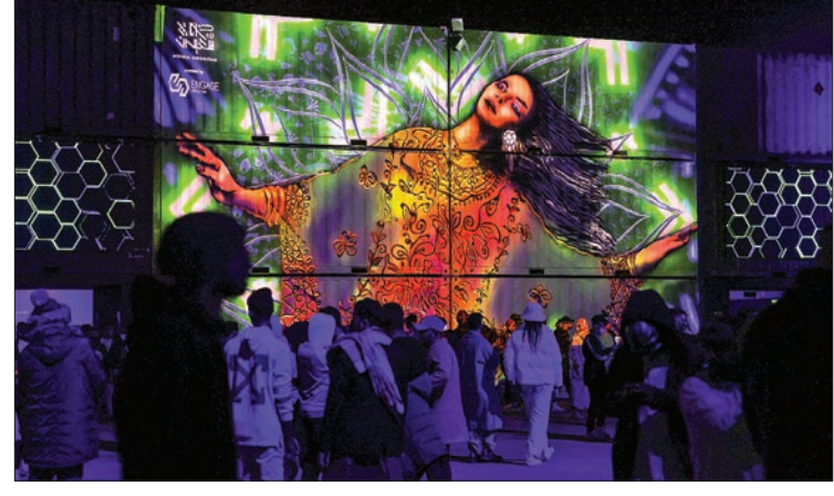
People attend the Soundstorm music festival, organized by MDLBEAST, in Banban on the outskirts of the Saudi capital Riyadh on 16 December 2021.

International entertainers and musicians — including superstar French DJ David Guetta — performed at the event despite boycott calls over Saudi Arabia's human rights record.