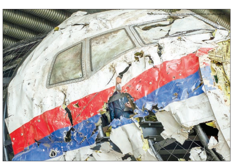
Trial judges and lawyers are seen inside as they view the reconstructed wreckage of Malaysia Airlines Flight MH17, at the Gilze-Rijen military airbase, southern Netherlands, on 26 May 2021.

DUTCH prosecutors will this week set out their sentencing demands for four men on trial in absentia over the downing of