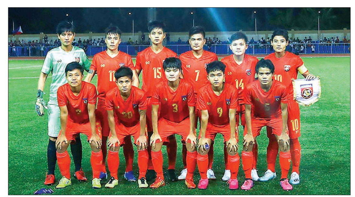
Myanmar women's national football team is currently at the third standing in ASEAN.