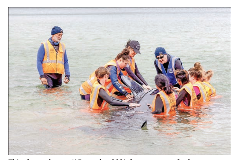
This photo taken on 11 December 2021 shows a group of volunteers from New Zealand whale rescue charity Project Jonah being taught how to save a stranded whale by a group instructor, at Scorching Bay in Wellington. Real strandings are all-too common in New Zealand, which has one of the highest rates in the world, with about 300 animals beaching themselves annually.

A two-tonne rubber whale can take on a life of its own in the frigid shallows of a windswept New Zealand beach, particularly when a bedraggled group of would-be rescuers is trying to wrestle it into a harness.