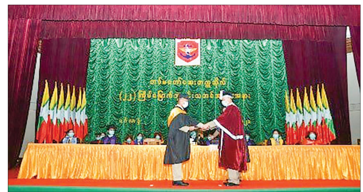
The 22<sup>nd</sup> Convocation of the Defence Services Medical Academy in progress.

To date, the DSMA has conferred master degrees in medical science on 2,136 students, PhDs in Basic Medicine and Clinical Practice on 138 students, postgraduate diplomas in medical education on 207 students, and postgraduate diplomas in medicines on 189 students. At present, there are four trainee officers are attending the 26th postgraduate course of medical science, 167 trainee offices in the 27th, 232 trainee officers in the 28th, and 304 trainee officers in the 29th postgraduate course of medical science, total-