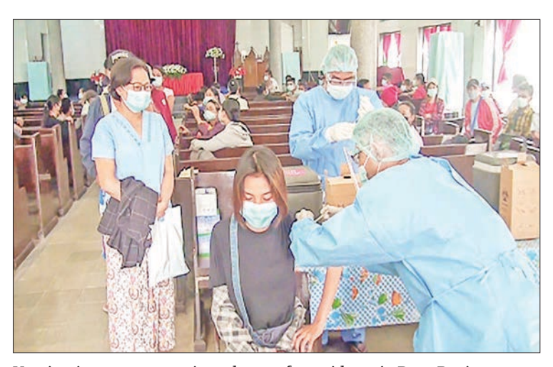
Vaccination programme is underway for residents in Bago Region.

Doctors and nurses from public hospitals, medical teams, relevant healthcare workers in collaboration with volunteers have already jabbed COVID-19 vaccines to 5,304 people from 12 townships in northern Shan State, 2,640 people from five townships in eastern Shan State, 9,765 people from 14 townships in Kayin and Mon states, 6,320 people from Myeik and Pulaw townships in Taninthayi Region, 4,272 people from three townships in Yangon Region, 26,500 people from 26 townships in Ayeyawady Region, 15,995 people from 10 townships in Rakhine