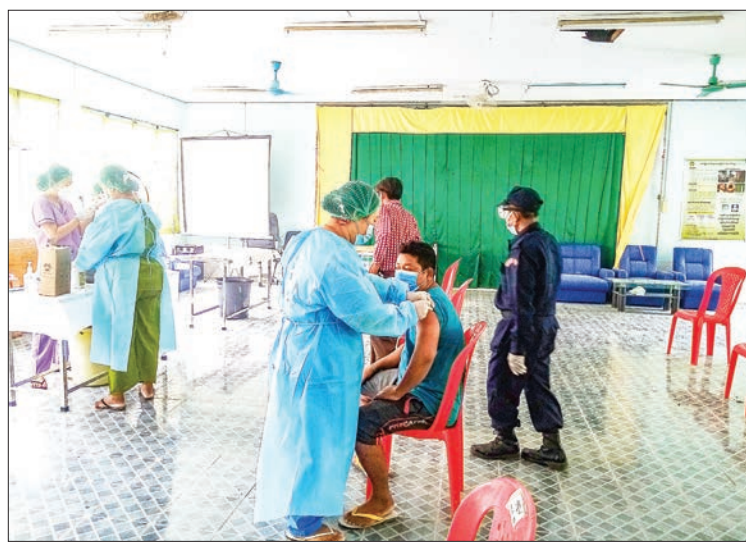
Singaing locals get jabbed against COVID-19. PHOTO: NYO NYO WIN (IPRD)

ward/village administrators, and members of charity associations are carrying out health campaigns to raise awareness of COVID-19 variants, including Omicron as well as to prevent and contain the disease transmission. They are also working together to spray pesticides in wards and villages and also monitoring the compliance of the guidelines set by the Ministry of Health and local rules and regulations. — Nyo Nyo Win (IPRD)/GNLM