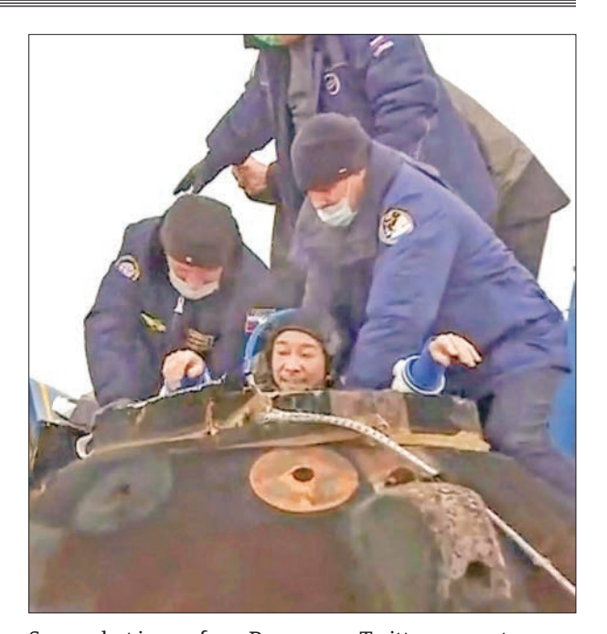
Screenshot image from Roscosmos Twitter account shows Japanese entrepreneur Yusaku Maezawa (C) upon returning to Earth aboard a Russian Soyuz spacecraft following his 12-day trip to the International Space Station.

Maezawa's trip to the ISS is believed to have cost around 10 billion yen ($88 million). While some people have criticized it as an "indulgence by a wealthy person," the trip likely expanded the public's interest in space. — Kyodo ■