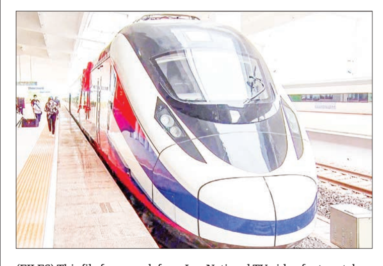
(FILES) This file frame grab from Lao National TV video footage taken on 16 October 2021 via AFPTV shows the Lane Xang bullet train at the Vientiane Railway Station in Vientiane.

Laos faces having to stump up vast sums of cash to pay for the rail line, which was set up as a Laos-China joint venture under Beijing's vast, trillion-dollar Belt and Road infrastructure initiative (BRI). − AFP ■