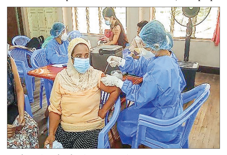
Locals\ gets\ inoculated\ against\ COVID-19\ in\ Mon\ State.

COVID-19 vaccine is being administered daily to target groups regardless of race and religion, including Buddhist monks and nuns, local people