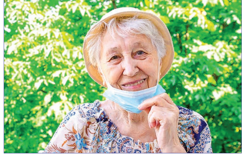
Representative image: Living with Parkinson's does not put you at a higher risk of contracting COVID-19, but it does make it harder for you to recover if you contract it.

new study has found that the SARS-CoV-2 N-protein interacts with a neuronal protein and speeds the formation of pathological protein bundles that have been implicated in Par-