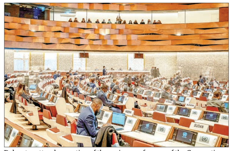
Delegates attend a meeting of the review conference of the Convention on Certain Conventional Weapons, (CCW) focussing on lethal autonomous weapons systems (killer robots) at the United Nations in Geneva on 17 December 2021.

JAPAN, the United States and other countries have blocked any advancement in UN talks toward legally binding measures to ban and regulate the development and use of lethal