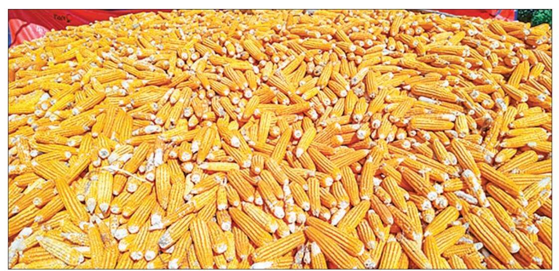
Of 2.3 million tonnes, the majority of corn was delivered to Thailand, whereas the remaining corn was conveyed to China, India and Viet Nam.

THE prices of corn remain unchanged these days, touching around K700 per viss (a viss equals 1.6 kilogrammes), market's data showed. The exchange rate is correlated with corn price stability. The fixed exchange rate is quite stable at present so the corn price is expected to remain stable, the traders said.