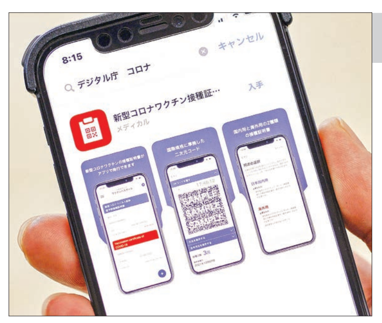
Photo taken on 20 December 2021, shows a smartphone screen displaying the Japanese government's COVID-19 vaccination certificate app.