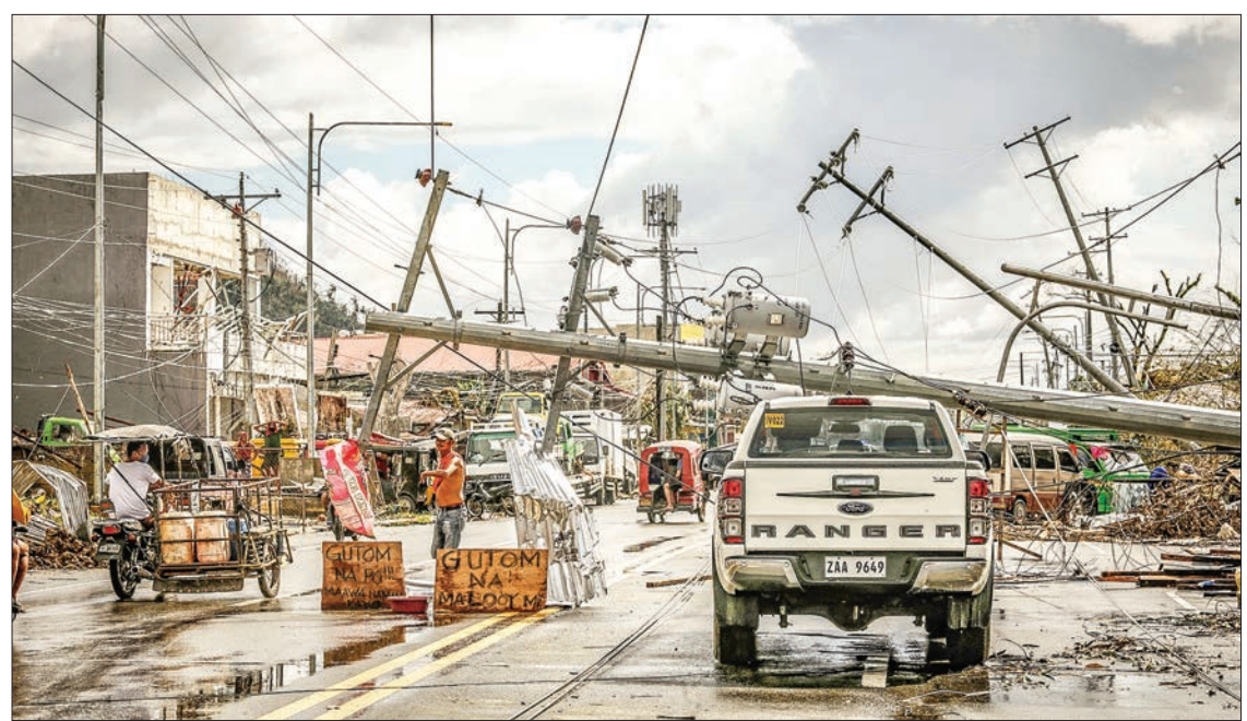
Fallen electric pylons block a road while a sign asking for food (L) is displayed along a road in Surigao City, Surigao del norte province, on 19 December 2021, days after super Typhoon Rai devastated the city.

THE death toll from the strongest typhoon to hit the Philippines this year surpassed 200 on Monday, as desperate survivors pleaded for urgent supplies of drinking water and food. The Philippine Red Cross reported "complete carnage" in coastal areas after Typhoon Rai left homes, hospitals and schools "ripped to shreds".