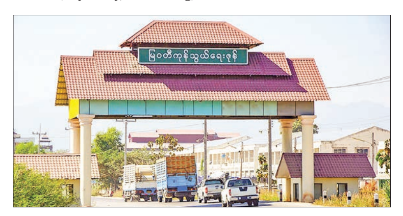
Thailand is Myanmar's second-largest trade partner and third-largest foreign investor.

Thailand is Myanmar's second-largest trade partner and third-largest foreign investor. — ACM/GNLM