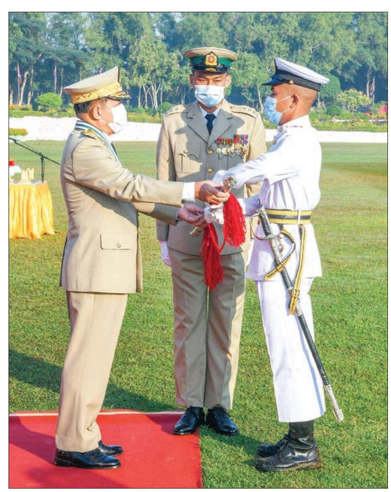
The Senior General presents the silver sword to Best Cadet awardee.