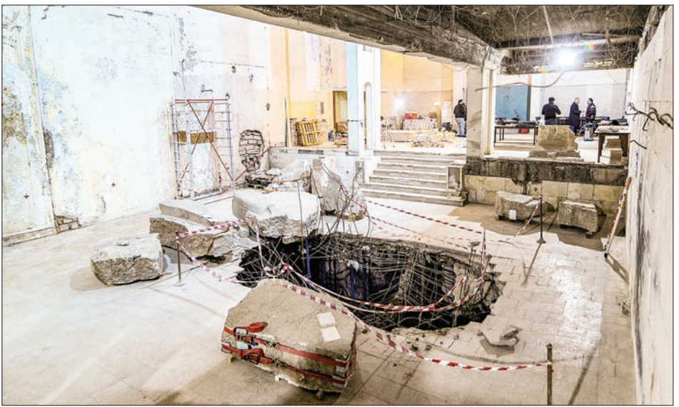
This picture taken on 14 December 2021 shows a view of a larger fragment of a statue of the ancient Mesopotamian "lamassu" human-headed winged bull being reassembled at the Mosul Museum in Iraq's northern city.

The largest and heaviest artefacts were destroyed for the sake of their propaganda, but smaller pieces were sold on black markets the