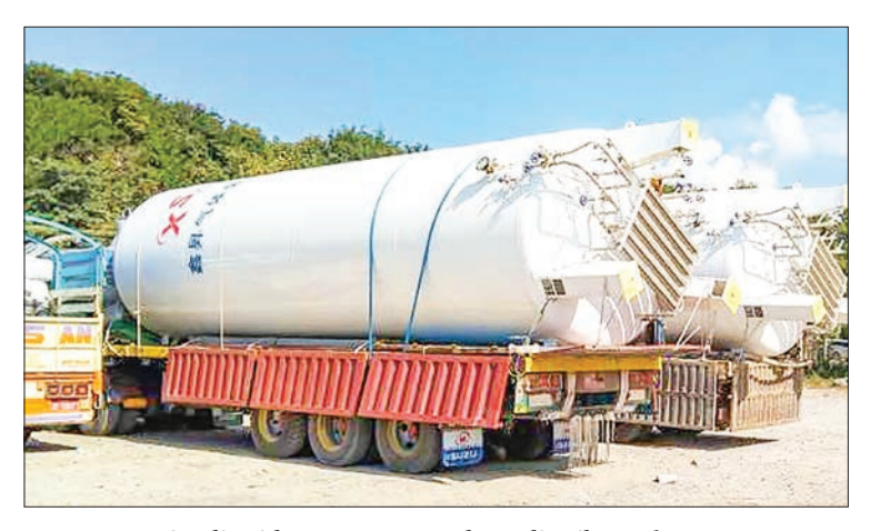
Boxers carrying liquid oxygen are ready to distribute them to states and regions.

Officials from the relevant departments are cooperating to facilitate and ex-