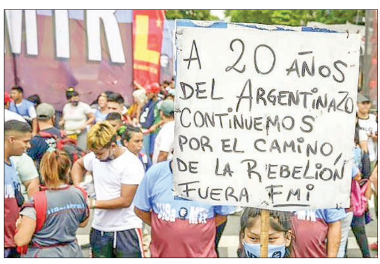
A demonstrator holds a banner denouncing the International Monetary Fund at a protest to mark the 20<sup>th</sup> anniversary of the 'great crisis'.

Monday's protest was taking place in a very similar economic context to that of 2001: large scale debt and a deal with the International Monetary Fund —