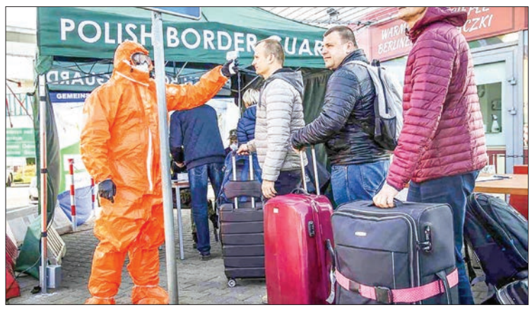
Poland has fully opened its borders with other EU countries. However, the borders with non-EU countries remain closed. Starting from 28th of December 2020 Polish Government imposed quarantine requirements for certain categories of travellers.

THE EU's drug regulator was set to decide Monday whether to approve a fifth Covid jab as the US warned of a bleak winter with the Omicron variant spurring new waves of infections globally.