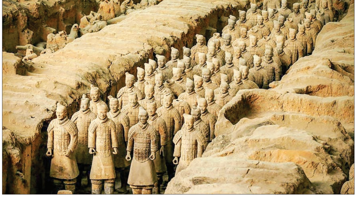
Xi'an — a historic northwestern city of around 13 million people known for its Terracotta Army — recorded 42 new cases on Tuesday.

The museum housing the world-famous Terracotta Army -the 2,000-year-old mausoleum of China's first emperor - said in an online statement that it had closed from Sunday "according to the needs of epidemic