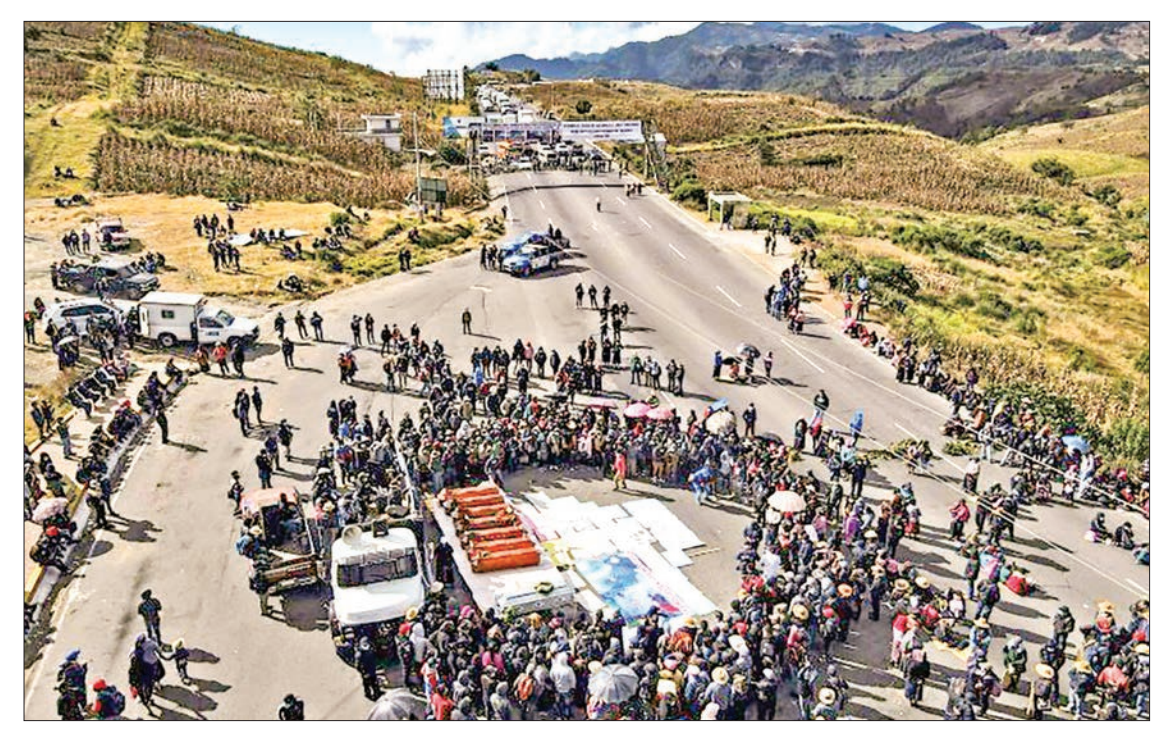
Relatives blocked a major road in Guatemala with the coffins of victims of a weekend massacre by a rival group to draw attention to violence plaguing their indigenous community.

GRIEVING family members on Monday blocked a major road in Guatemala with the coffins of victims of a weekend massacre