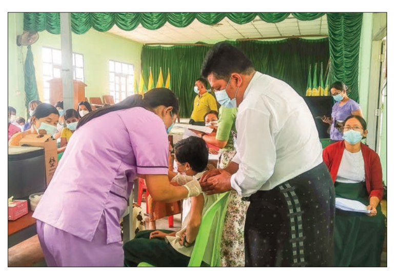
Above 12-year-old schoolchildren get inoculated against COVID-19 in