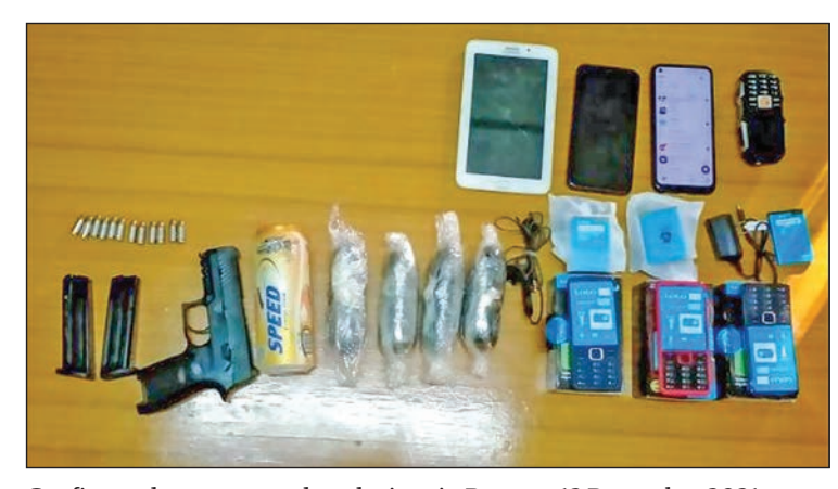
Confiscated weapons and explosives in Bago on 12 December 2021.