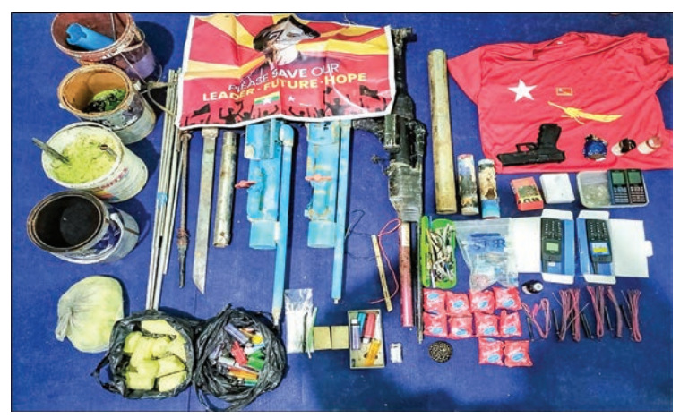
Seized firearms and explosives in Bago on 18 December 2021.