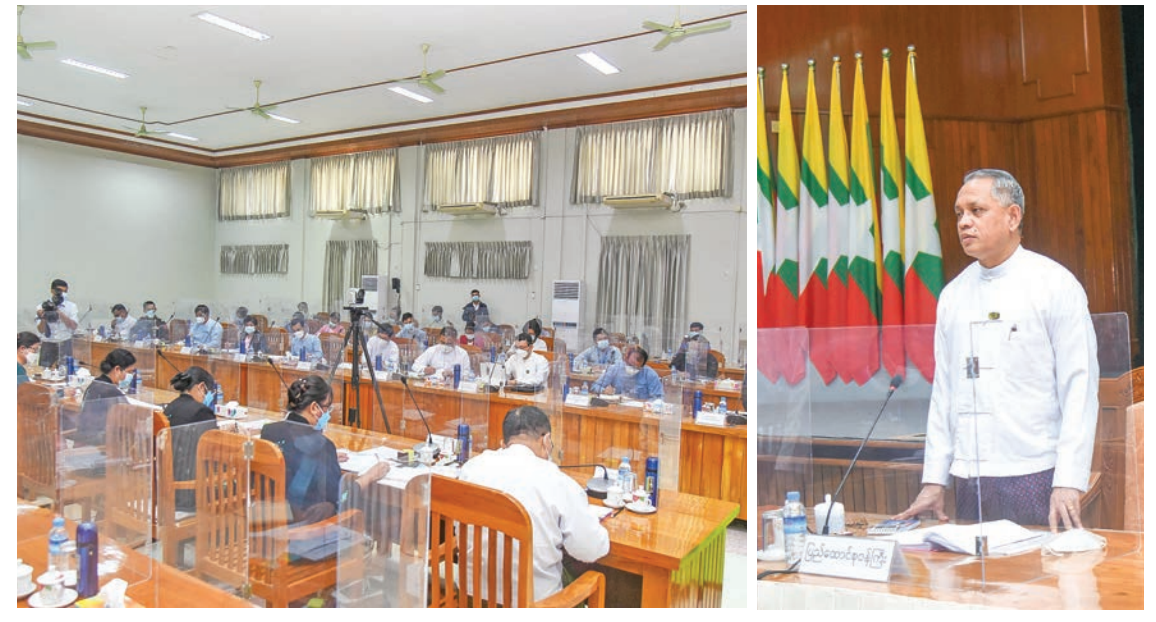
The preparatory meeting for the ASEAN-Canada free trade agreement negotiation meeting in progress yesterday.

He highlighted the need to prioritize negotiations over market access for the country's exports and access to high quality and responsible investment. In addition, necessary measures to be taken to protect the country's manufacturing and service sectors are required to negotiate