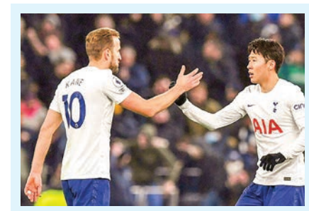
Tottenham Hotspur's European campaign this season is over after UEFA awarded Rennes victory in their final Europa Conference League group game called off due to the English club having an outbreak of Covid-19.

But on Monday the English top flight, following a shareholders' meeting involving representatives from the 20 clubs, said games would continue through the busy festive season.—AFP