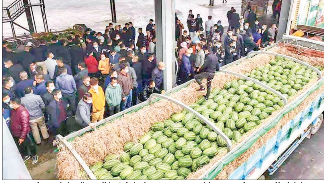
As watermelon trucks heading to China is facing long queues, most of the watermelons turned bad. Only one in five trucks are left undamaged with quality watermelon.

"The news of watermelon fetching a good price is spreading on the social network. It is real that the traders receive 6-7 Yuan per kilo. However, we cannot expect how many quantities remained in good condition. About 20-tonne truckloads of watermelons are left unhurt out of 5-6 trucks in the previous days. Such an unfortunate event will happen again upon the prolonged delay triggered by the driver-substitution system at the border. We cannot predict anything in the difficult times of the COVID-19 pandemic. If the price drops, the warehouse owners will suffer great loss amid the high trans-