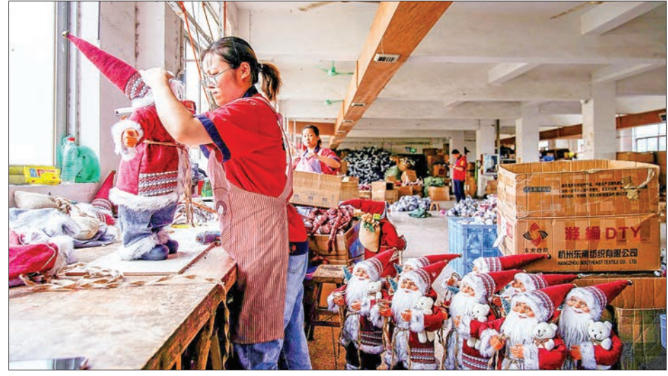
Most of the exported Christmas products came from China's coastal areas such as Zhejiang and Guangdong provinces, and are mainly exported to Kazakhstan, Kyrgyzstan, Germany, Britain and other central Asian and European countries.

these exported Christmas products came from China's coastal areas such as Zhejiang and Guangdong provinces, and are mainly exported to Kazakhstan,