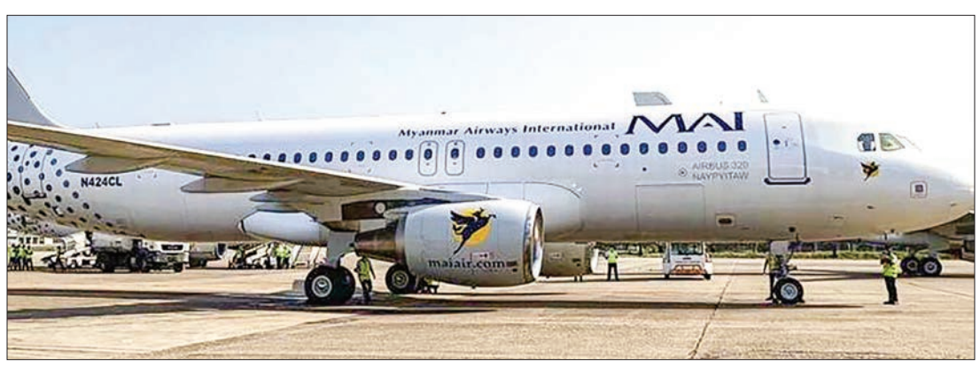
According to a statement from the Ministry of Transport and Communications, the international passenger aircraft will not be allowed to operate at Yangon International Airport until 31 December to prevent the spread of the COVID-19 virus in Myanmar via air travel.

Last month, it was also the rainy season when the cotton plants were harvested. And the cotton was sold for K1,000 per viss because of the low moisture content. Now, the cotton prices are ranging between K1,500 and K1,600 per viss. The cotton is mostly conveyed to the Mandalay market, it is learnt. — Than Win Tun (IPRD)/GNLM