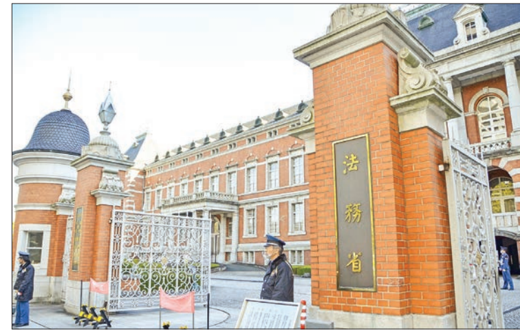
Photo taken on 20 December 2021, shows the Ministry of Justice in Tokyo.

Following Tuesday's executions, the number of inmates sitting on death row in Japan stands at 107.