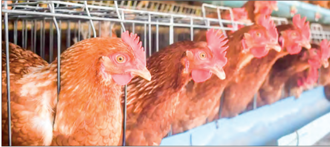
The prices of poultry meat and egg dramatically jumped in July 2021 as the demand grew amid the COVID-19 cases spiking in the country. After the concerted efforts of the stakeholders in the industry to govern the volatile price, the price fell.

The prices of poultry meat and egg dramatically jumped in July 2021 as the demand grew