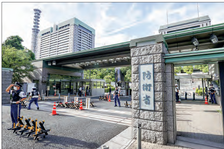
Photo taken on 19 August 2021, shows Japan's Defence Ministry in Tokyo.

The ministry will invest in game-changing technologies, such as crewless planes using artificial intelligence that fly in teams with next-generation fighter jets.