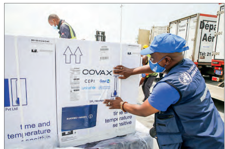
Workers transfer boxes of COVID-19 vaccines arrived at Abidjan International Airport in Abidjan, Cote d'Ivoire, 26 February 2021.

Given the global health and epidemiologic consequences of failing to immunize vulnerable populations, including those in humanitarian settings, the IAVG recommends that COVAX contin-