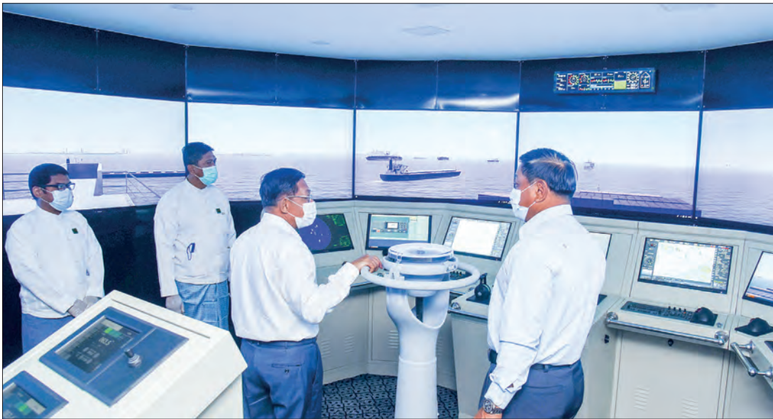
The Senior General observes one of the Simulator rooms at the university.