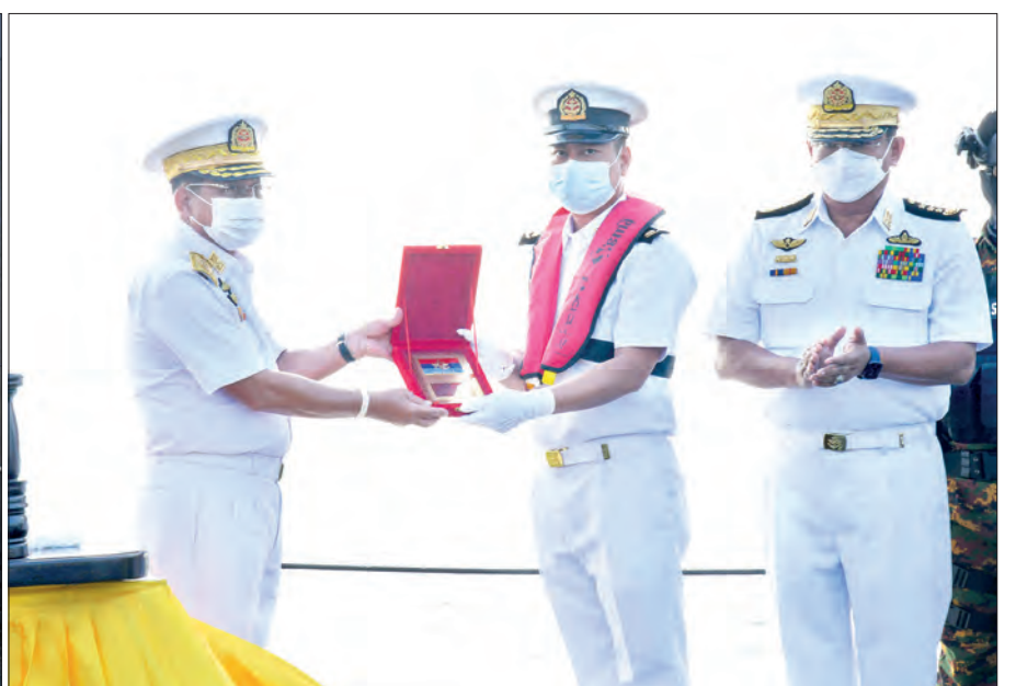
State Administration Council Chairman Commander-in-Chief of Defence Services Senior General Min Aung Hlaing visits the Submarine Minye Kyaw Htin and presents the C-in-C Emblem.

Economic Zone of Myanmar territorial waters for the first phase with formation of the submarine fleet, building of warships and improvement of human resources.