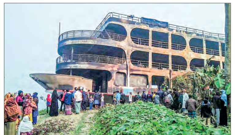
The blaze was believed to have originated in the engine room and ripped through the ferry.

Witnesses said the fire originated at around 3:00 am (2100 GMT) and quickly spread.—AFP ■