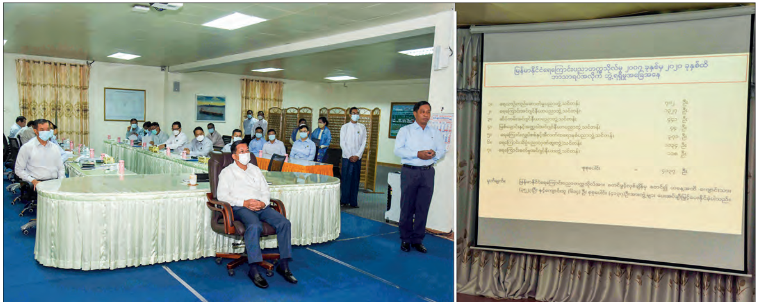
State Administration Council Chairman Prime Minister Senior General Min Aung Hlaing hears the report on the Myanmar Maritime University in Thanlyin Township of Yangon Region on 24 December 2021.

At the meeting hall, the Admiral and the rector reported to the Senior General on the background history of the university, implementation of the assigned