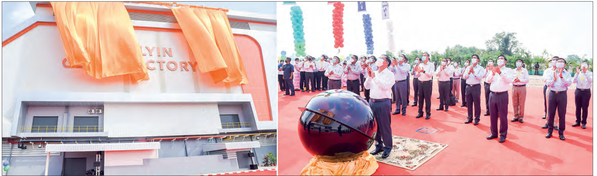
State Administration Council Chairman Prime Minister Senior General Min Aung Hlaing presses the button to inaugurate the signboard of Thanlyin Glass Factory in Thanlyin yesterday.

CHAIRMAN of the State Administration Council Prime Minister Senior General Min Aung Hlaing attended the opening ceremony of the upgraded Thanlyin glass factory of Myanmar Economic Corporation in Thanlyin Township of Yangon Region yesterday.