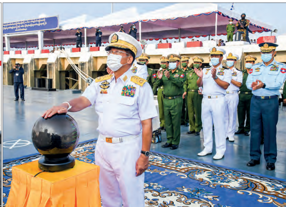
State Administration Council Chairman Commander-in-Chief of Defence Services Senior General Min Aung Hlaing presses the ceremonial button to unveil the plaque of Submarine Minye Kyaw Htin on the occasion of the 74 th Anniversary of Tatmadaw (Navy), at No 3 Naval Jetty in Yangon on 24 December 2021.

TODAY'S commissioned submarine Minye Kyaw Htin is primarily to serve the training as well as military operation duty, if necessary, said Chairman of the State Administration Council Commander-in-Chief of Defence Services Senior General Min Aung Hlaing at the ceremony to commission Submarine Minye Kyaw Htin and warships on the occasion of the 74 th Anniversary of Tatmadaw (Navy) formed on 24 December 1947 at No 3 Naval Jetty in Yangon yesterday.