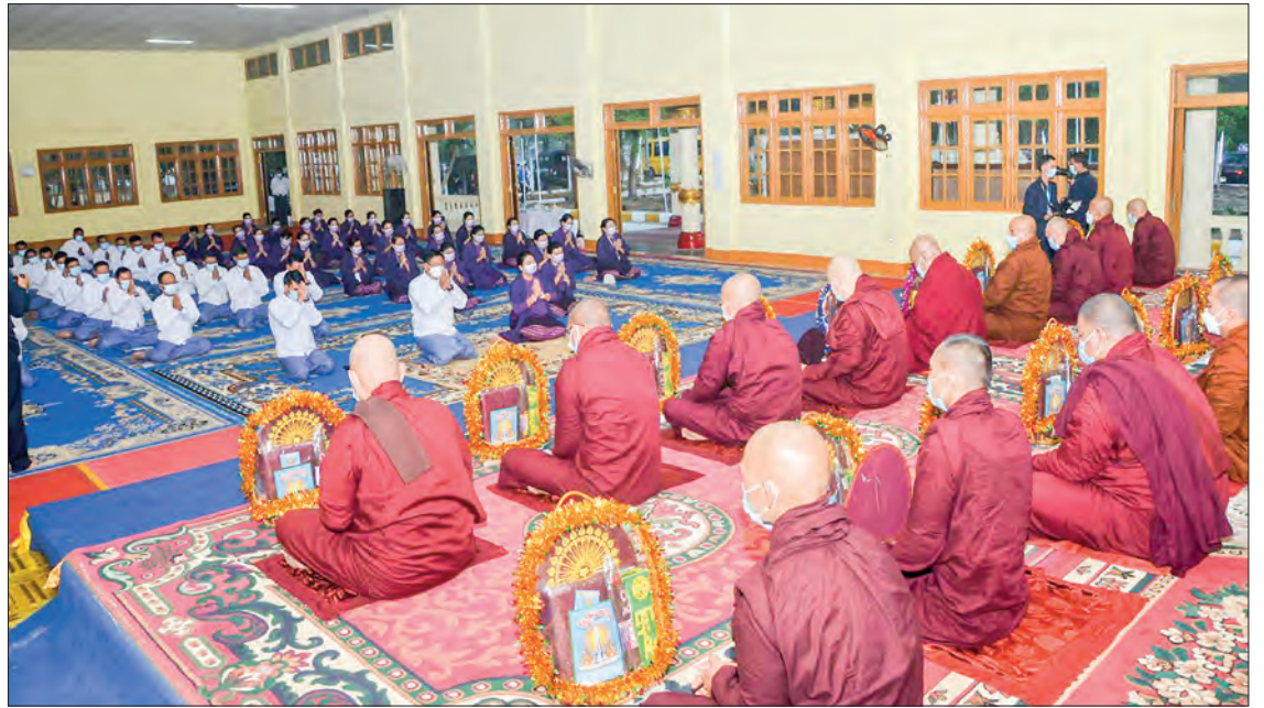
Paritta reciting ceremony in progress.

First, the Commander-in-Chief (Navy) and those present at the ceremony received the Five Precepts from the Sayadaw and then listened to the sermons deliv-