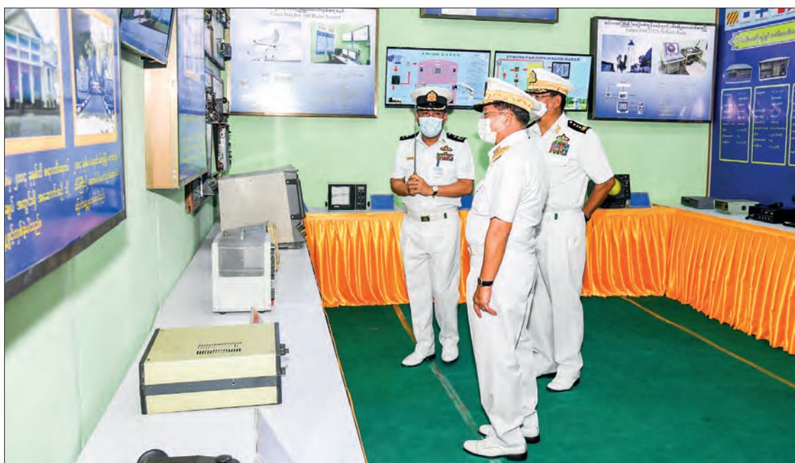
The Senior General looks around the exhibition in commemoration of the 74 th Anniversary of Tatmadaw (Navy).

The Senior General then opened the booths to mark the 74 th Anniversary of Tatmadaw (Navy) and viewed the entertainment, traditional dances and songs of the Tatmadaw (Navy) Band. The booths showcase documentary photos of the Tatmadaw (Navy), naval equipment, scale models of vessels, books and personal goods. — MNA