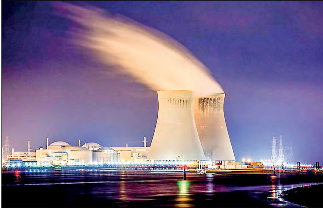
Progressively phasing out nuclear power has been enshrined in Belgian law since 2003.

BELGIUM will shut down all seven of its nuclear reactors by 2025 but will not close the door on new-generation nuclear technology, according to a deal reached Thursday by the coalition government.