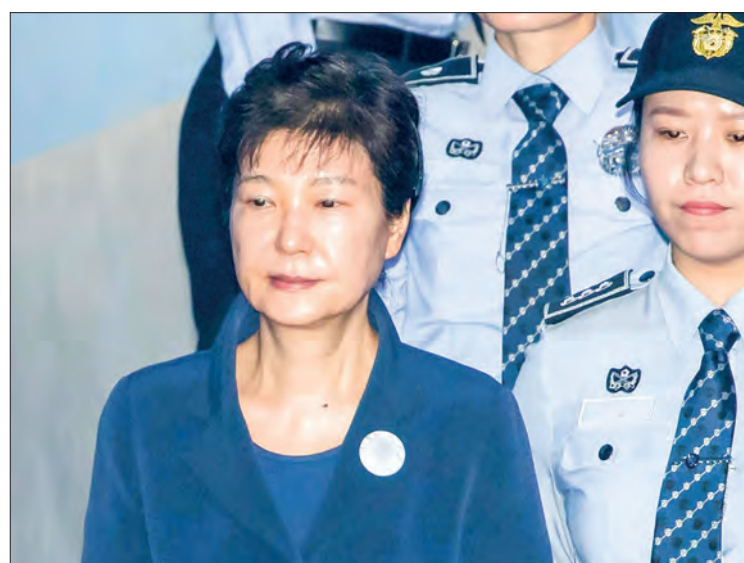
South Korea's disgraced ex-president Park Geun-hye has been granted a pardon.

The pardon is seen as an effort by the government of the ruling Democratic Party