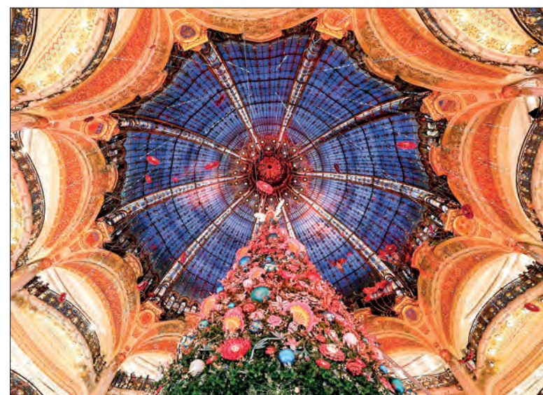
A giant Christmas tree stands at the Galeries Lafayette department store for the festive season.

will be easier than a year ago in many other places around the world.