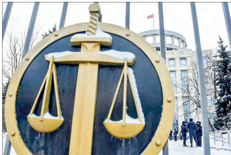
Observers were barred from the courtroom and a group of supporters gathered outside in the cold.

Next week, Russia’s Supreme Court will rule on the