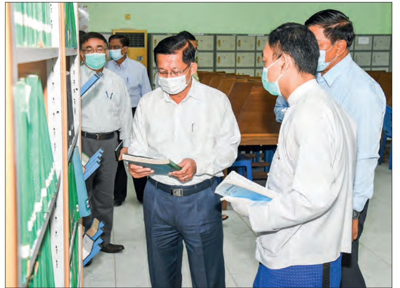
The Senior General views around the MMU library.

missions, organizational set-up of the university, academic measures, training of the university meeting international standards, practical training, cooperation with international universities, and participation of the university in the State projects.