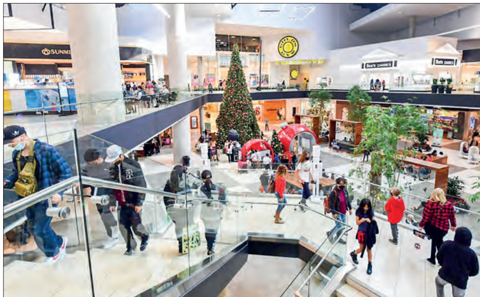
People walk at a shopping mall in Santa Anita, Calif., on 20 December 2021.