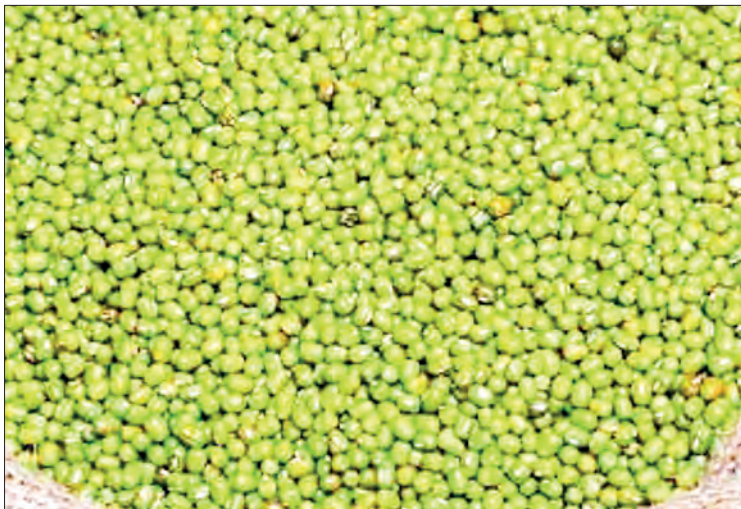
The green grams from Monywa, Shwebo, Myaung and Myinmu townships enter the Mandalay market. The newly harvested green grams are commercially valued due to their high quality.

GREEN gram (Shwe Wah) variety is found in abundant supply these days in the Mandalay market, Mandalay bean traders said.