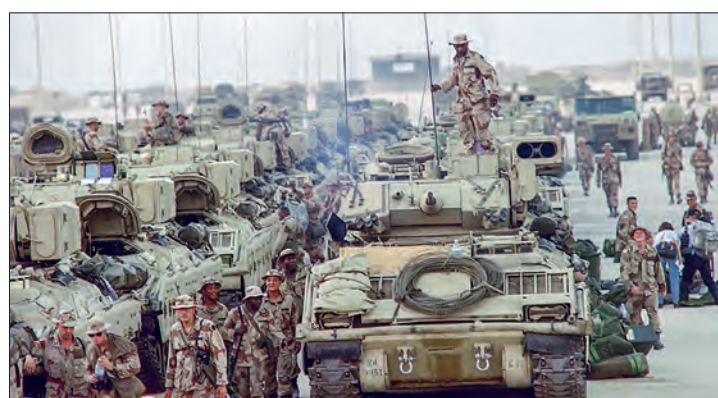
A major long-term effect of the first Gulf War was that it paved the way for greater US security and military presence in the region.

Despite being rich in hydrocarbons, Iraq's electricity infrastructure has suffered from years of negligence and successive wars, facing regular power cuts.—AFP ■