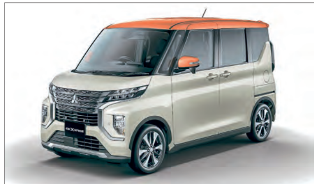
Supplied photo shows Mitsubishi Motors Corp.’s eK X space minivehicle.

The three models have been produced under a joint venture between the two companies. The models were developed by Nissan and produced at Mitsubishi’s factory in Okayama Prefecture, western Japan.—Kyodo ■