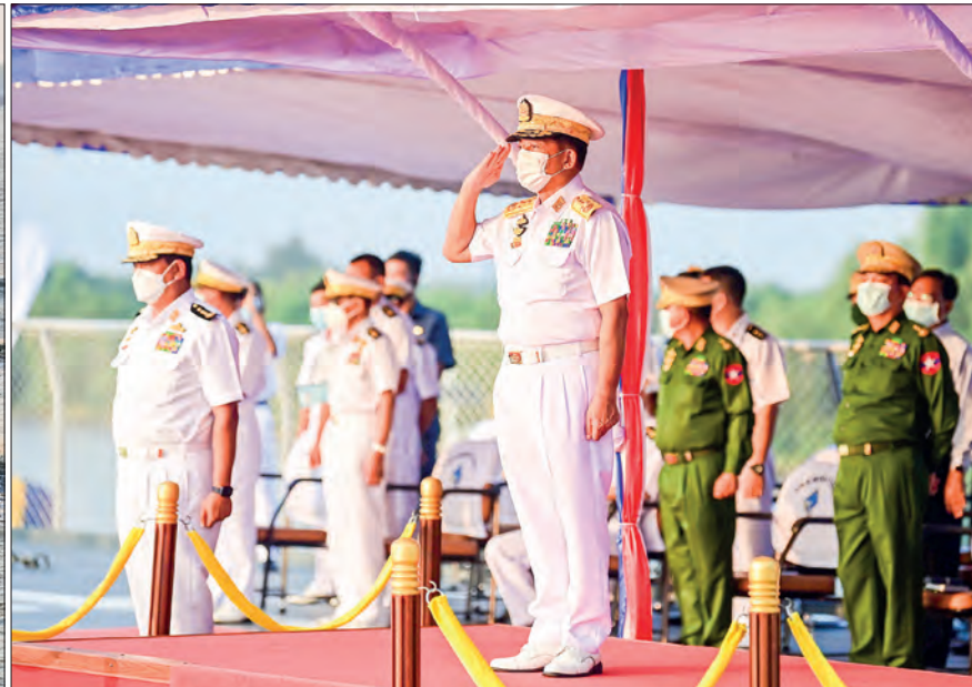
State Administration Council Chairman Commander-in-Chief of Defence Services takes the salute of the Guard of Honour and Frigate Aung Zeya, Frigate Kyansittha, Frigate Hsinbyushin, Corvette Tabinshwehti and fast attack vessels in single line formation and diamond formation at the event.