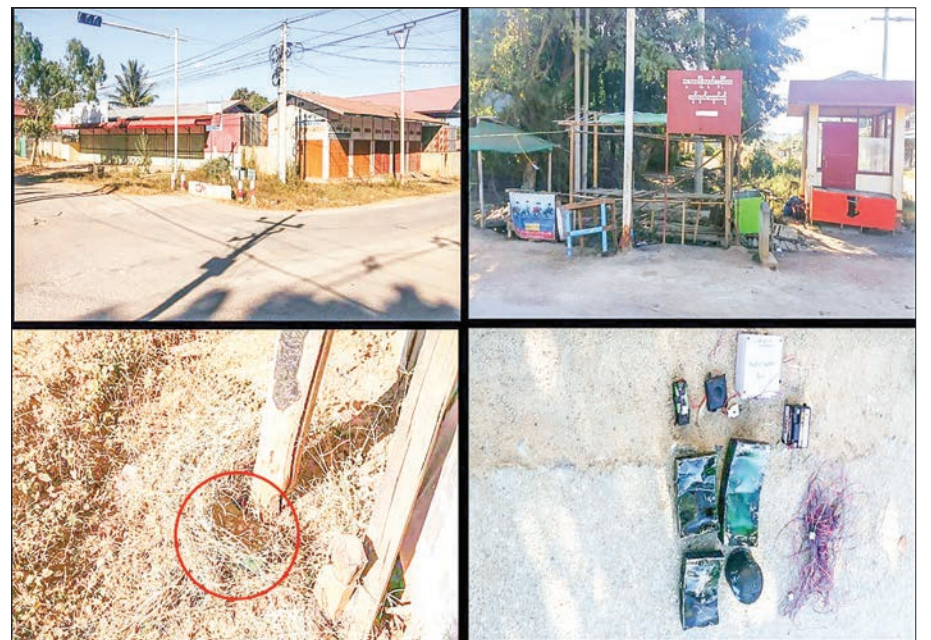
Homemade mine attacks to schools.

At around 3:45 pm, PDF terrorist groups planted three homemade mines at the junction of the Pyidaungsu Road and GTC Road near the Nambawan (A)