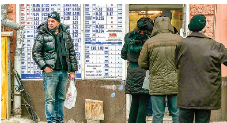
Some Bulgarians welcome the prospect of joining the euro. Others fear it will drive up prices.

BULGARIA could join the eurozone in 2024, but the EU's poorest nation is divided over the prospect of ditching its national currency and joining the single European currency club.