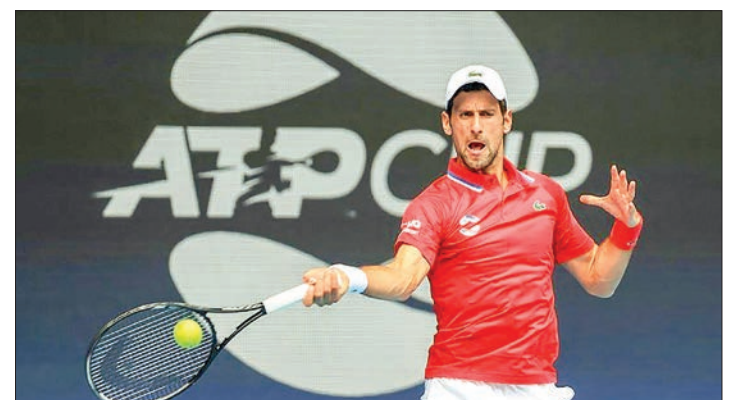
Tennis Australia insists Novak Djokovic has not yet withdrawn from the ATP Cup.

But Tennis Australia told AFP the Serbian had yet to pull out of the teams event, which is due to start on Saturday in Sydney with Djokovic drawn to play Norway's Casper Ruud on the opening day.—AFP ■