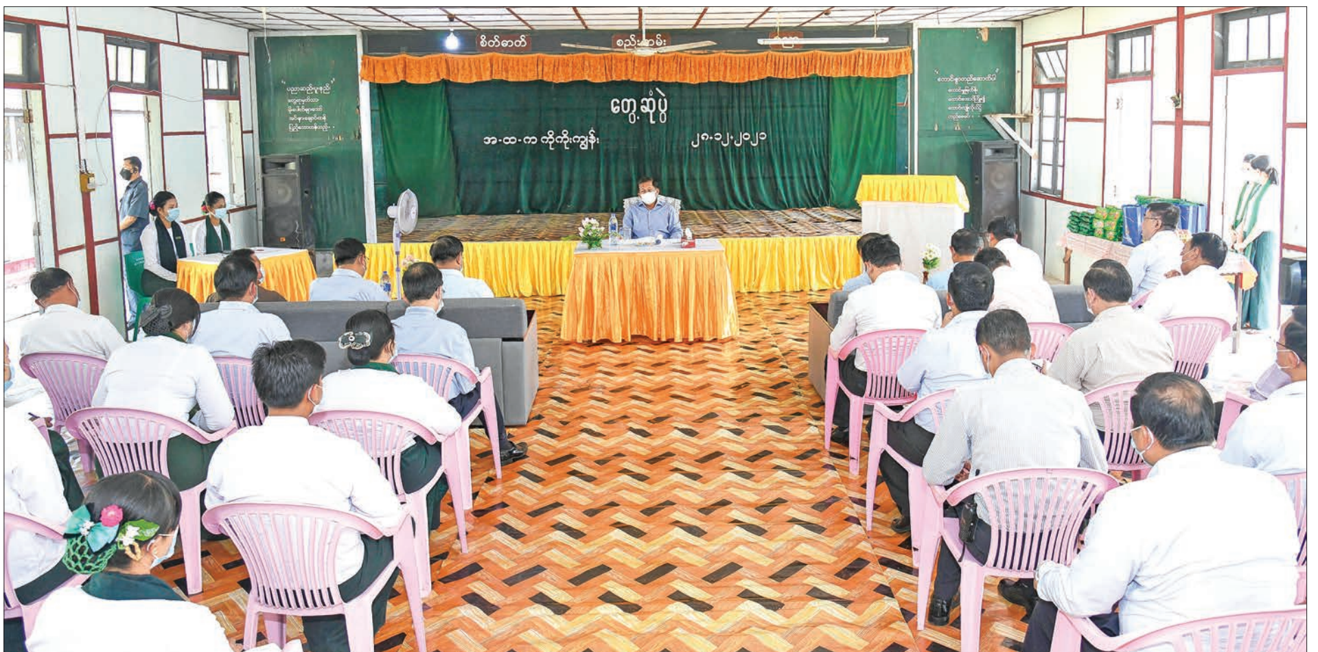
State Administration Council Chairman Prime Minister Senior General Min Aung Hlaing meets the departmental personnel at the Basic Education High School in Cocokyun yesterday.