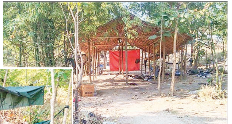
The enemy's camp is seen being seized at the Mae Wah Khee road junction.