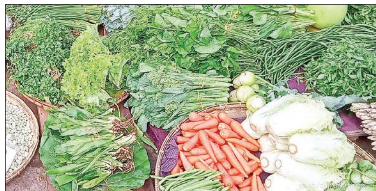
Sagaing Region started its winter crops cultivation in October 2021 and more than 100,000 acres of crops have been cultivated so far, according to the Sagaing Region Agriculture Department.

According to the official statistics of the Agriculture Department in Sagaing Region grows 6,326 acres of kitchen crops in Mawlaik district, 3,985 acres in Tamu district, 10,609 acres in Kalay district, 4,242 acres in Hkamti district, 1,766 acres in Naga Self-Administered Zone, 16,279 acres in Monywa district, 19,340 acres in Yinnabin district, 31,491 acres in Shwebo district, 7,898 acres in Kanbalu district, 16,063 acres in Sagaing district, 14,032 acres in Katha district and 5,577 acres in Kawlin district. — Lu Lay/GNLM