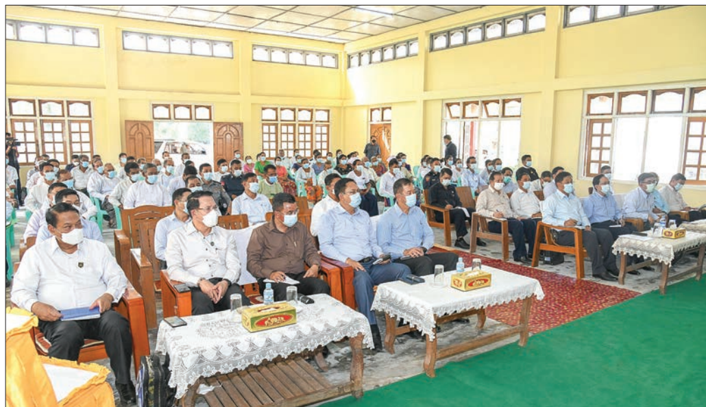
State Administration Council Chairman Prime Minister Senior General Min Aung Hlaing meets departmental personnel and town elders in Cocokyun yesterday.

Then, the Union Ministers, Yangon Region Chief Minister and Development Affairs Minister reported on their respective sectors regarding the needs for