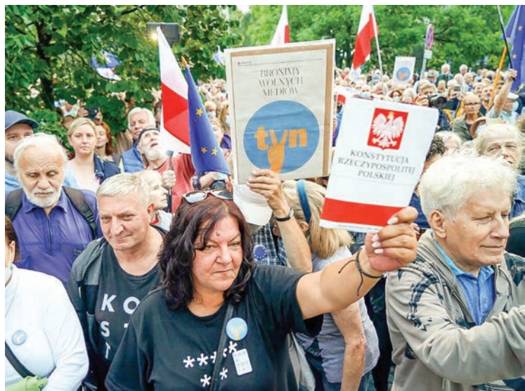
Thousands of Poles protested against the law earlier this month outside the presidential palace in Warsaw.

FOLLOWING pressure from the EU and US, Polish President Andrzej Duda on Monday vetoed a media ownership law that critics