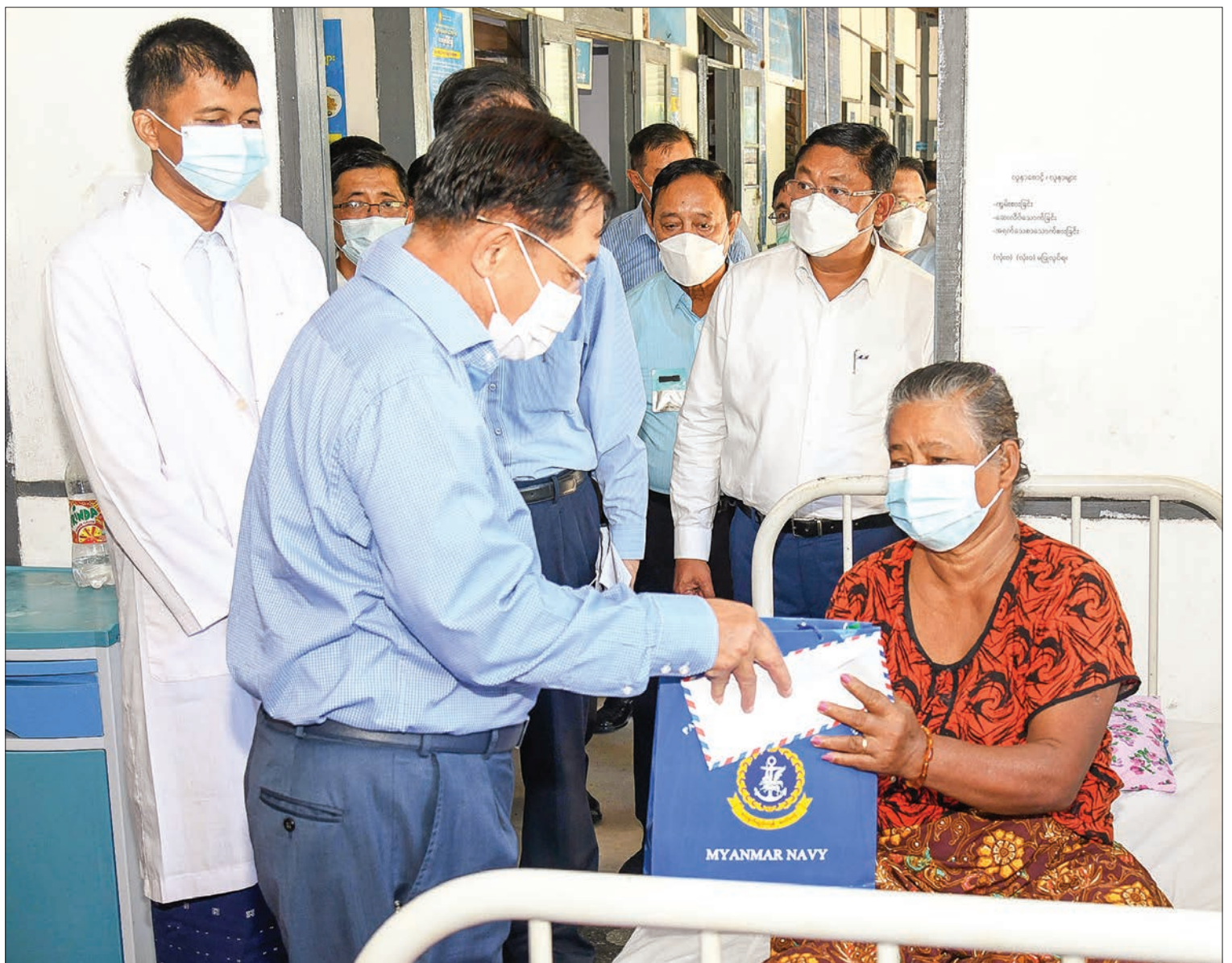
State Administration Council Chairman Prime Minister Senior General Min Aung Hlaing presents foodstuffs to one of the patients at the Cocokyun Township People's Hospital on 28 December 2021.