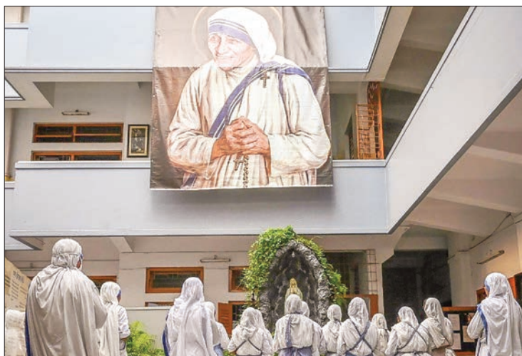
India has moved to cut off foreign funding to a charity founded by Mother Teresa.

The Indian Home Ministry said that on 25 December — Christmas Day — the renewal of the charity's licence to receive funding from abroad had been "refused".