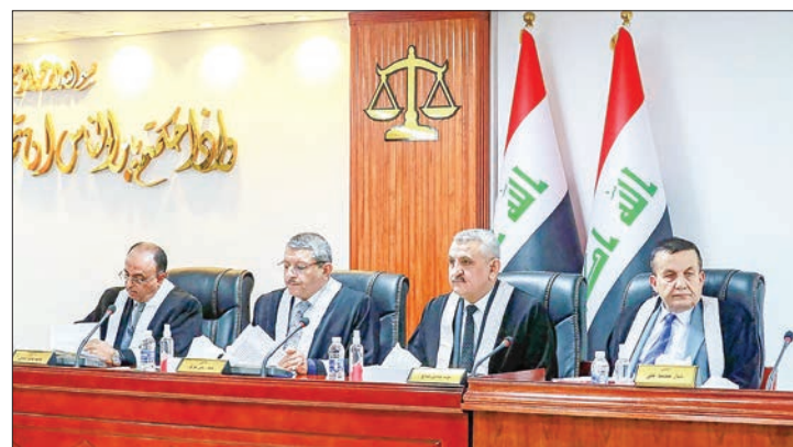
Iraqi judges attend a court session at the Supreme Judicial Council in Baghdad on 27 December 2021, as the court is set to announce the verdict in the bid filed by the Hashed al-Shaabi ex-paramilitary alliance.

India's government has also in recent years increased pressure on non-governmental organizations receiving foreign funding, including rights groups.—AFP ■