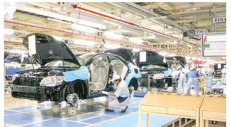
As a microchip shortage sends shock waves through the global car industry, one of Japan's main auto parts makers says it wants to swerve the risk of becoming a production "bottleneck" by revamping the way it manages its supply chains.

The government predicts a 2.6 per cent growth in fiscal 2021, followed by a 3.2 per cent increase in fiscal 2022. Among other major economies, growth in calendar 2022 is forecast by