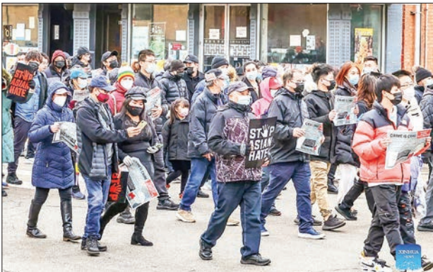
People take part in a protest in Chicago, the United States, on 27 December 2021. Hundreds of residents and business owners and employees Monday afternoon staged a two-hour silence protest against increasing crimes targeting local residents and businesses in Chicago.

A flyer circulated to bystanders read: "The community we once lived and worked in peace is now shrouded in fear and danger. In a country known