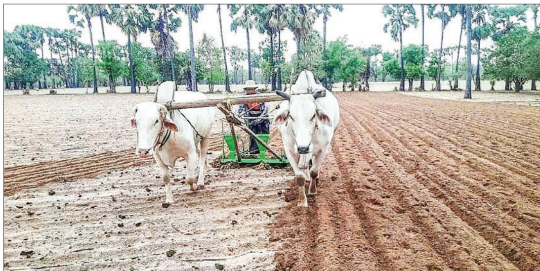
In the 2021-2022 growing season, Sagaing Region planned to cultivate 2.466 million acres of beans in the region and over 2 million acreages has been finished. The department and the growers are working together to boost the yield.