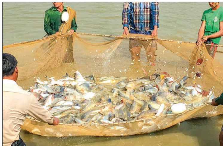
Myanmar exports agricultural products, animal products, minerals, forest products, and finished industrial goods, while it imports capital goods, raw industrial materials, CMP raw materials and consumer goods.

Agro-based food production, textile and clothing, industry and electronics, fisheries production, forestry production, digital production and services, logistics services, quality management, trade information services and innovation and entrepreneurship sectors are the main priority areas of the National Export Strategy (NES) 2020-25. — ACM/GNLM