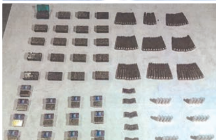
Seized weapons and ammunition in Htee Mae Wah Khee.