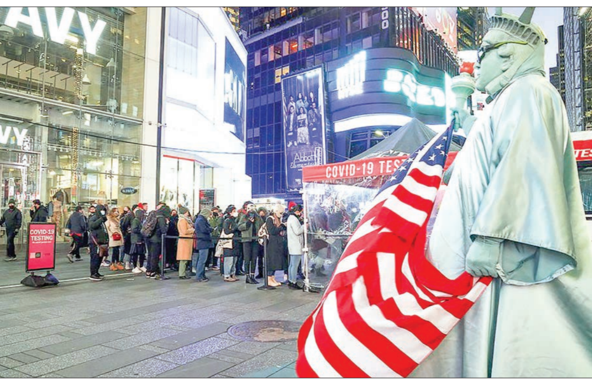
People line up for COVID-19 tests while a street performer waits for customer next to the mobile COVID-19 testing site on Times Square in New York, the United States, 20 December 2021.

Similarly to the United States, French Prime Minister Jean Castex said the government would announce by the end of the week