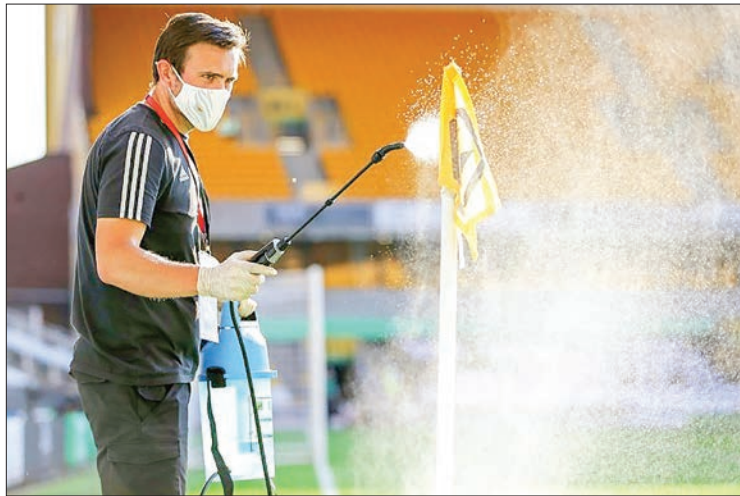
Wolves clash with Arsenal has been postponed due to a coronavirus outbreak.

"The safety of everyone is a priority and the Premier