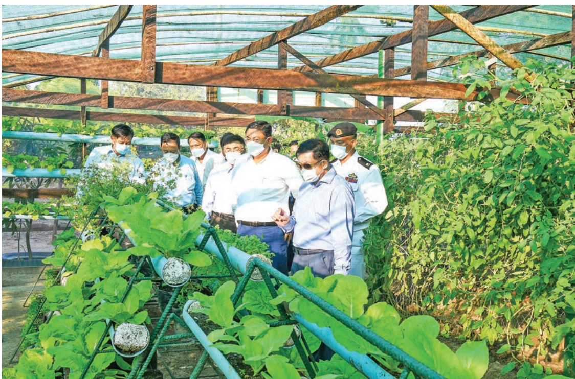
The Senior General looks into the cultivation of vegetables in the green house.

of the country. The emergence of a larger number of educated persons in the nation is a must in the tasks of State-building and Nation-building.