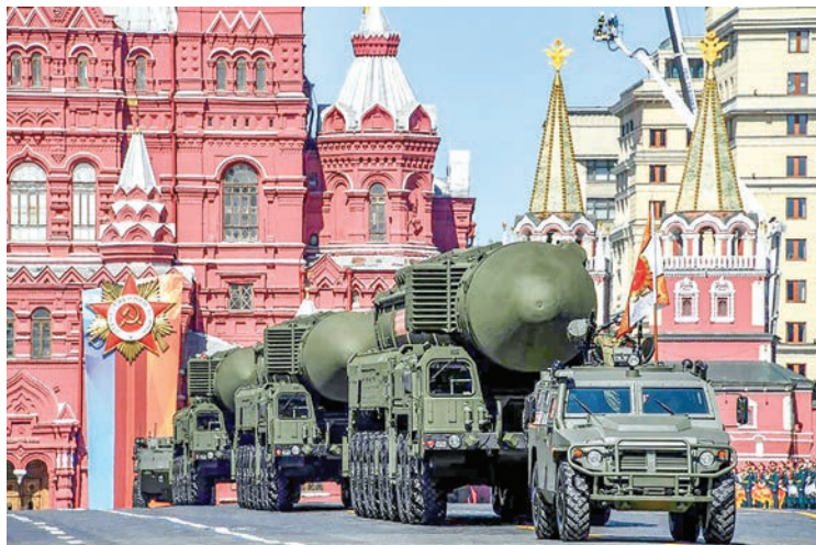
Russian Yars RS-24 intercontinental ballistic missile systems roll through Red Square during the Victory Day military parade in Moscow on 9 May.

Bilateral talks are scheduled for 10 January, the spokesperson said. Moscow and NATO representatives are then expected to