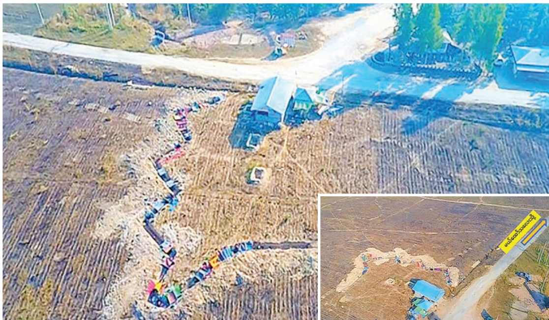
An enemy camp is occupied at the Mae Wah Khee road junction.