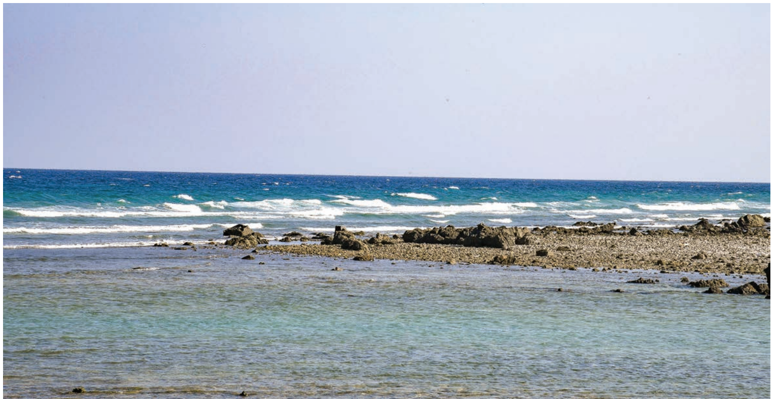
State Administration Council Chairman Prime Minister Senior General Min Aung Hlaing inspects the island circular road in Cocokyun of Yangon Region on 28 December 2021 (topmost picture).

After hearing the reports, the Senior General stressed that efforts must be made for increasing the pass rate of matriculation examination for sufficiency of human resources in the Cocokyun region. Adequate number of teachers for relevant subjects will be employed for the students. Requirements must be fulfilled for the teachers who serve their duties in remote areas. Concerning the education sector, the government follows the 30-year national education plan of the State. The topics from the past curriculum were edited for the difference from the current social system