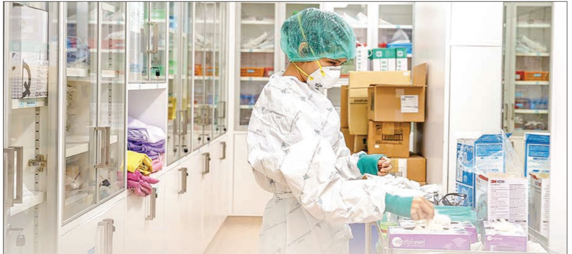
A healthcare worker at Bamrasnaradura Infectious Disease Institute in Thailand

vestments in better monitoring, early detection and rapid response plans in every country — especially the most vulnerable”, he said.