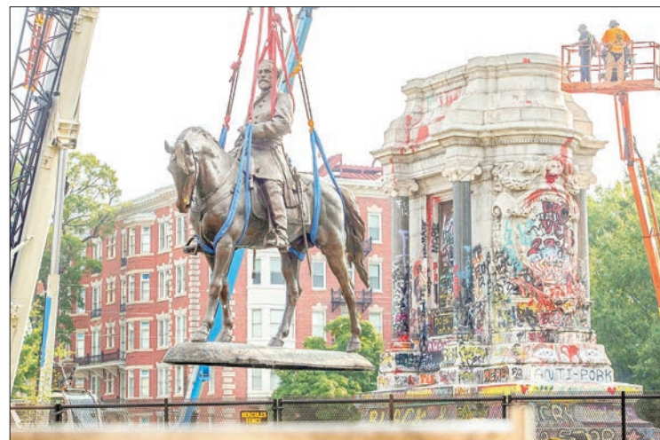
Workers dismantling the pedestal of a statue of a Confederate general discovered a copper box on Monday believed to have been buried 130 years ago, the second apparent time capsule unearthed at the site.

"Experts believe there may be coins, books, buttons, and even ammunition from the Civil War," he said.—AFP ■