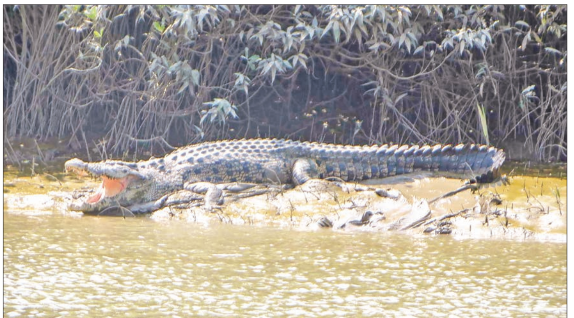
Mainmahla Island Wildlife Sanctuary is home to a large number of saltwater crocodiles and is protected as a breeding ground.

Mainmahla Island Wildlife Sanctuary is home to a large