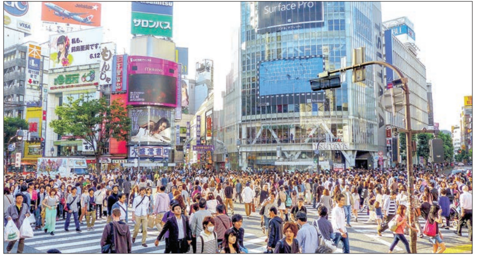
The total number of unemployed people in November increased 100,000 from the previous month to 1.92 million, rising for the first time in three months.

Private-sector analysts also said daily COVID-19 cases dropping to around 250 or lower in the reporting month