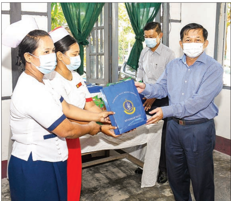
The Senior General presents foodstuffs to the health staff.

The Senior General expressed his delightedness for physical and mental development due to the improvement of transport, accommodation and food as well as healthcare services. Health staff must not be assigned duty in rotation but they must be deployed in limited