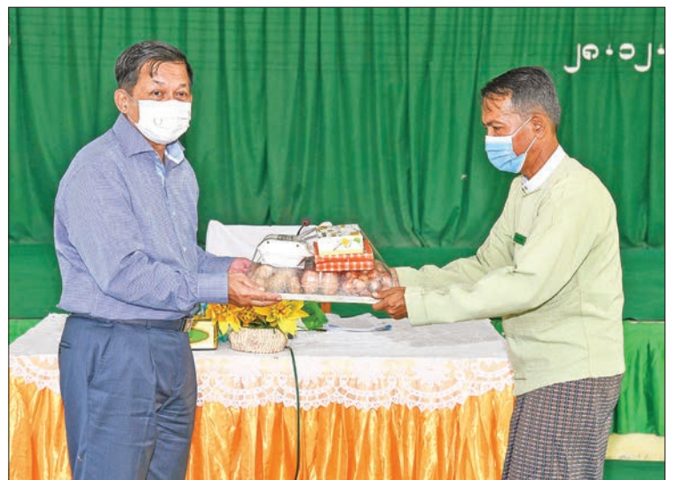
The Senior General gives foodstuffs to the elderlies in Cocokyun.