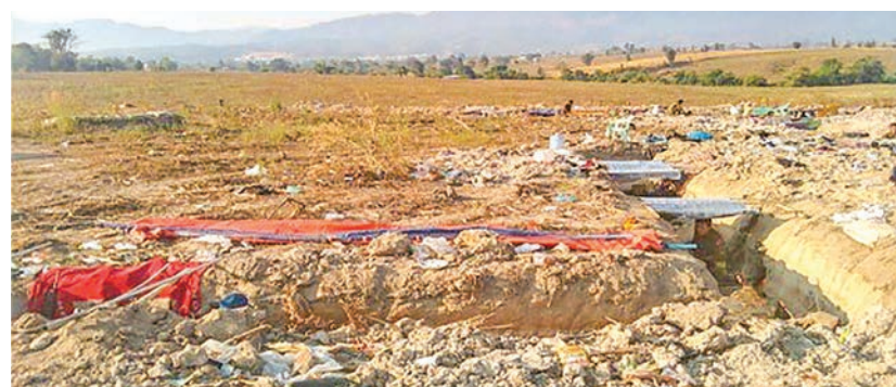
Combined PDF groups camp in Htee Mae Wah Khee.