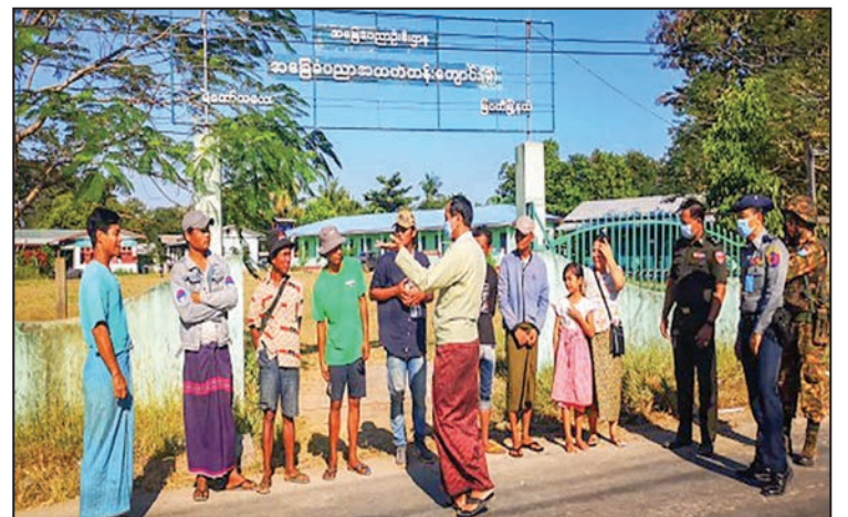
Officials welcome displaced persons in Mae Htaw Tha Lay.

Due to the fighting, the innocent civilians fled to the other country. The respective security forces conducted the campaign