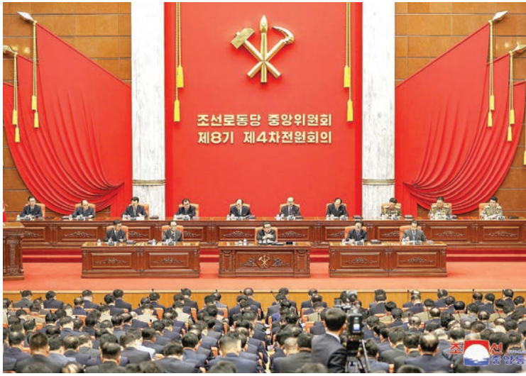
North Korea's ruling party convenes a plenary meeting of the Central Committee on 27 Dec 2021.

NORTH Korea's ruling party convened a plenary meeting of the Central Committee on Monday to review its policies for 2021, state-run media reported Tuesday, as the nation's economy is believed to remain stagnant amid the COVID-19 pandemic.