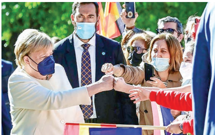
Angela Merkel has been lauded for her steady hand in steering the bloc through crisis after crisis.

But analysts warn that none may be immediately capable of assuming the task, given the