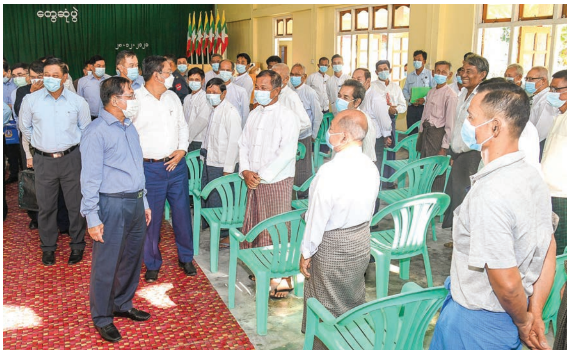
The Senior General warmly greets town elders in Cocokyun of Yangon Region yesterday.

better ability of a government is achieved for having qualified staff. Therefore, the staff should be skilful and if they meet the fixed qualifications, recruitment processes will be conducted. The new generation should emphasize their education for social development. According to the survey, there were 1.5 million who attended schools in the Academic Year 2007-2008 and there were only more than 270,000 who reached the matriculation level and so of these numbers, 90 per cent are under the level of matriculation. Therefore, all