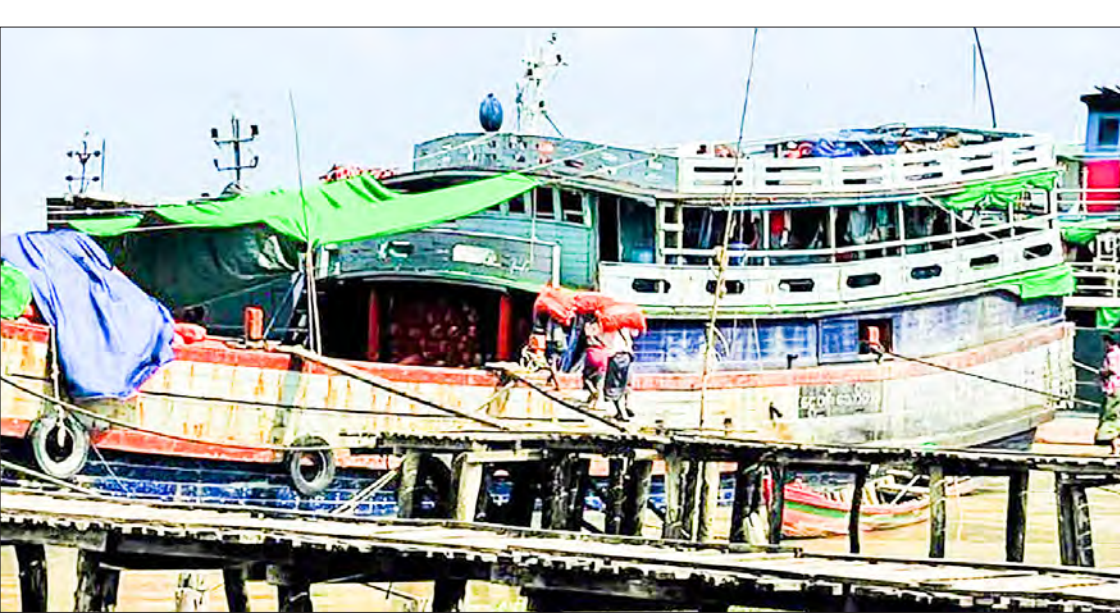
Export cargoes are loaded onto the vessel.

"The exports to Bangladesh collected $4.77 million during the previous FY. We brought in more than $6 million within two months and a half of the 2021-2022FY. The income is also secured from the vessels that directly export fisheries products to the port of Bangladesh. We always look for a way to earn income for the country and submit