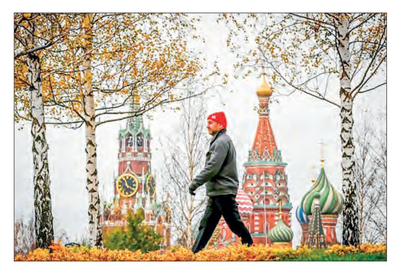
Russian authorities have been accused of downplaying the effects of the coronavirus pandemic.

RUSSIA'S state statistics agency Rosstat said Thursday that more than 71,000 people died of coronavirus in the country in November, setting a new fatality record since the start of the pandemic.