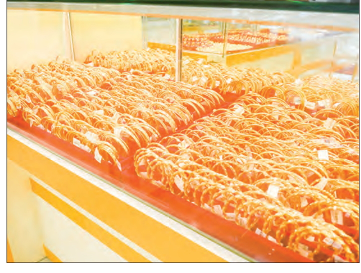
The rate fluctuated between the highest of K1,810,000 (6 November) and the lowest of K1,768,500 (24 November). In December, the pure yellow metal price moved in the range of 1,768,500 (6 December) and 1,823,000 (29 December).

Sugar cane prices were pegged at over K50,000 per tonne in the 2015-2016FY, K45,000 in the 2016-2017FY, K41,500 in the 2017-2018FY, K38,000-40,000 in the 2018-2019FY and K40,000 in the last FY2019-2020, according to the news released online by the Ministry of Commerce. —