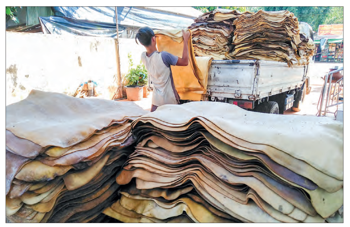
Rubber is primarily cultivated in Mon and Kayin states and Taninthayi, Bago, and Yangon regions in Myanmar.

Consequently, although the resumption of the rubber plantation starting from last September and the availability of raw rubber in the market has increased, the price of rubber is unlikely to fall lower than K700 as last year due to rising market demand and international exchange rate, according to the rubber traders.