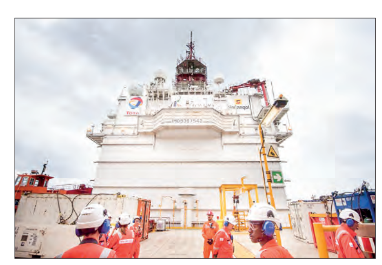
Kaombo Norte, a storage vessel off the coast of Angola.

mize revenue from the sale of these assets and to ensure that the next owner is not harmed by the market's situation since