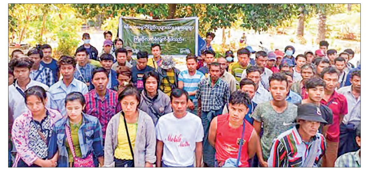
Returnees from villages in the Lay Kay Kaw area.

Officials from the Regional Command and departmental officials also coordinated the medical and other needs. —MNA