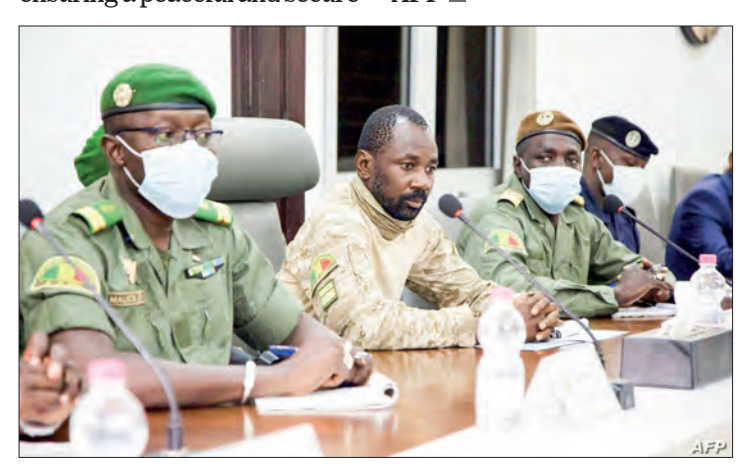
File Photo: President of the CNSP (National Committee for the Salvation of the People) Assimi Goita (C) prepares for a meeting between Malian military leaders and an ECOWAS delegation headed by former Nigerian president on 22 August 2020. PHOTO: AFP

Under pressure from France and Mali's neighbours, Goita pledged that Mali would return to civilian rule in February 2022 after holding presidential and legislative elections.—