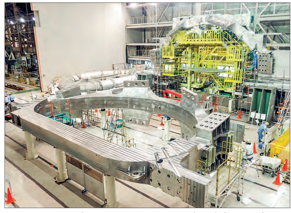
Representative image: The Japan Atomic Energy Agency and Mitsubishi Heavy Industries Ltd. will soon sign a memorandum of understanding with a US venture firm to provide technical support for its fast reactor development project.

But domestic development has come to a halt following the decommis-