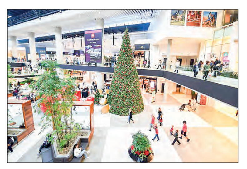
People walk at a shopping mall, 20 December 2021, in Santa Anita, Calif.

After 5,013 cases were reported in US territorial waters between 15 and 29 December, compared to just 162 in the prior two