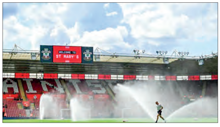
"Sunday's Premier League clash between Southampton and Newcastle United at St Mary's Stadium has been postponed due to ongoing Covid-19 cases and injuries amongst the Magpies' first-team squad," said a Newcastle statement

postpone the match because Newcastle did not have the required number of players available (13 outfield players and one goalkeeper). It is the second successive Newcastle fixture to be postponed following the cancellation of Thursday's scheduled game at Everton. The Premier League assesses applications to postpone matches on a case-by-case basis, based on existing rules and adapted guidance, implemented in light of the new Omicron variant of Covid-19.—AFP ■