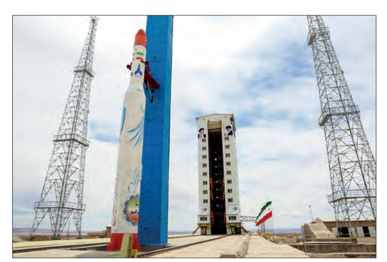
Handout picture released by Iran's Defence Ministry on 27 July 2017 shows a Simorgh (Phoenix) satellite rocket at its launch site at an undisclosed location in Iran.

"The research goals foreseen for this launch have been