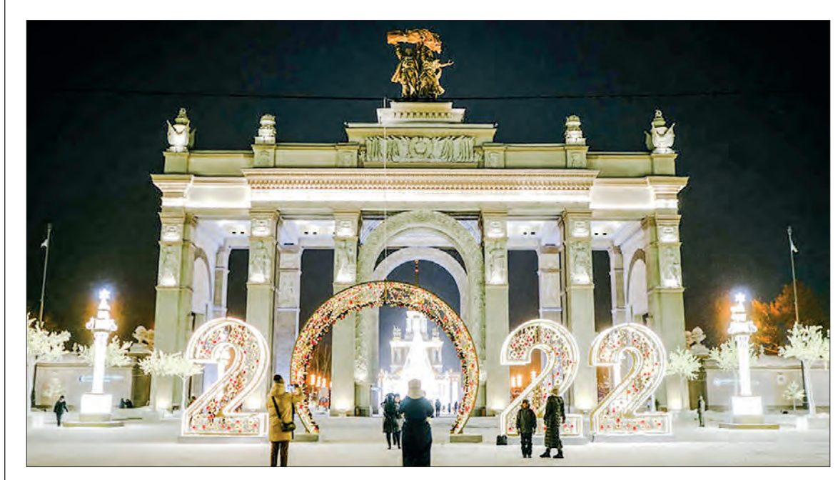
People take photos at VDNH (The Exhibition of Achievements of National Economy) with New Year decorations in Moscow, Russia, on 21 December 2021.

PRESIDENT Vladimir Putin said Moscow "firmly" defended its interests in 2021 — a year marked by an unprecedented crackdown on the opposition and increased tensions with the West — in a New Year's address.