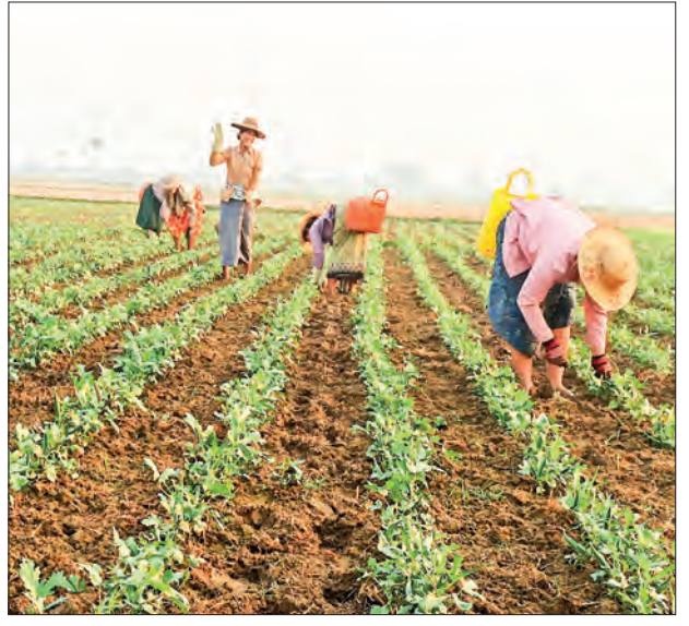
Myanmar agro products are primarily exported to China, Singapore, Malaysia, the Philippines, Bangladesh, India, Indonesia, and Sri Lanka.

The Commerce Ministry is endeavouring to help farmers deal with challenges such as high input costs, procurement of pedigree seeds, high cultivation costs, and erratic weather conditions. The agricultural exports jumped to US$4.6 billion in the financial year 2020-2021, despite the downward trend in other export groups. — KK/GNLM