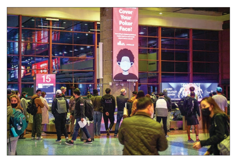
A sign reminds airline passengers to wear face masks as they wait to collect bags from a baggage carousel at the Harry Reid International Airport (LAS) on 2 January 2022 in Las Vegas, California. Americans returning home from holiday travel had to battle another day of airport chaos on 2 January with more than 2,000 flights cancelled due to bad weather or airline staffing woes sparked by a surge in Covid cases.

Airports in Chicago — a major transit hub — were the most affected Saturday, but by Sunday the airports in Atlanta, Denver, Detroit, Houston and Newark were also hard hit. — AFP ■