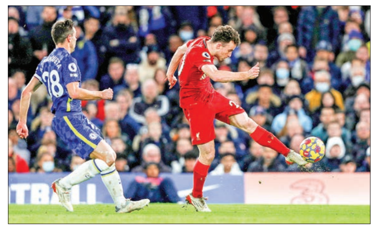
Liverpool's Portuguese striker Diogo Jota (R) shoots during the English Premier League football match between Chelsea and Liverpool at Stamford Bridge in London on 2 January 2022.

EVEN after a weekend in which Manchester City produced the worst performance of the Premier League's top four, the champions streaked further clear towards a fourth title in five years.