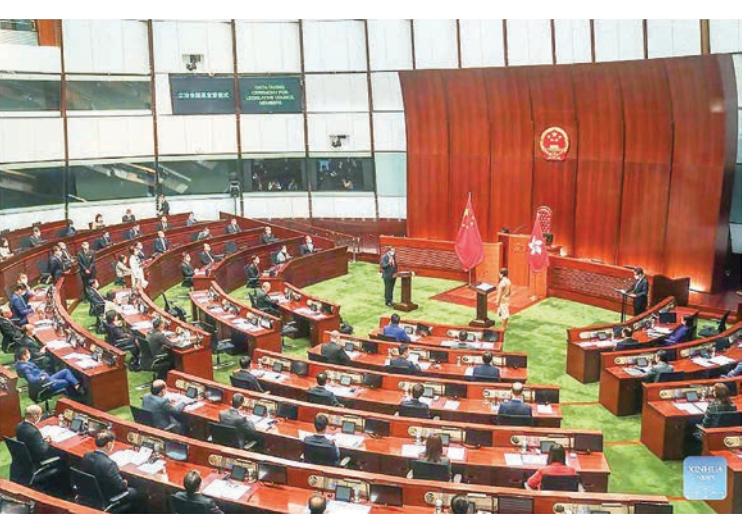
Photo taken on 3 January 2022 shows the oath-taking ceremony for 90 members of the seventh-term Legislative Council (LegCo) of China's Hong Kong Special Administrative Region (HKSAR) in Hong Kong, south China.

The seventh-term LegCo began its four-year term of office on Saturday. The new LegCo is