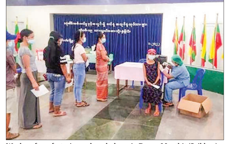
Workers from factories and workplaces in Dagon Myothit (Seikkan) get jabbed against Covid-19.

THE Tatmadaw medics, health officials, nurses and health workers of public hospitals including volunteers conduct vaccination programmes in regions and states for monks, nuns, people aged over 40, inmates, people with disabilities, ethnic armed groups, patients with chronic disease, people at IDP camps and students aged over 12.