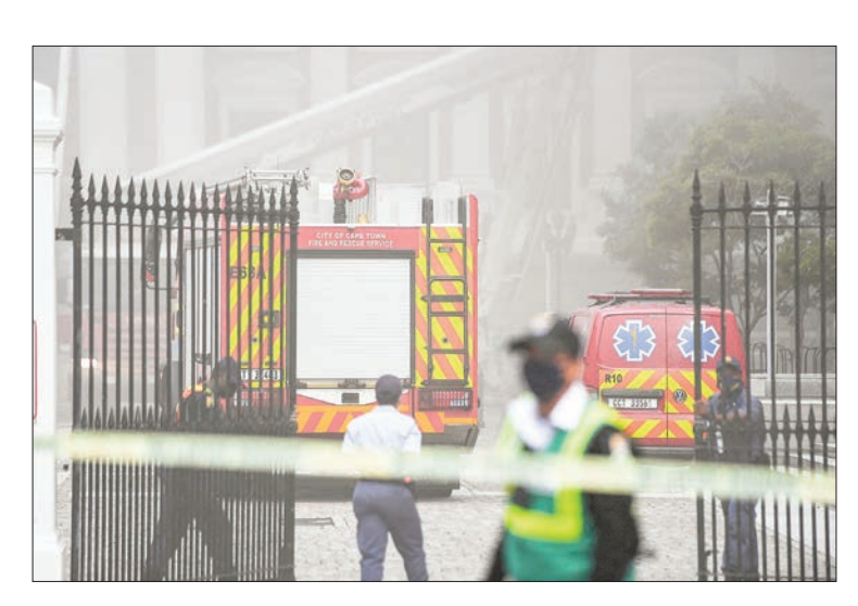
A fire truck is seen at the South African Parliament precinct in Cape Town on 2 January 2022, during a fire incident. A major fire broke out in the South African parliament building in Cape Town on 2 January 2022.

The parliament building houses a collection of rare books and the original copy of the former Afrikaans national anthem "Die Stem van Suid-Afrika" ("The Voice of South Africa"), which was already damaged. — AFP