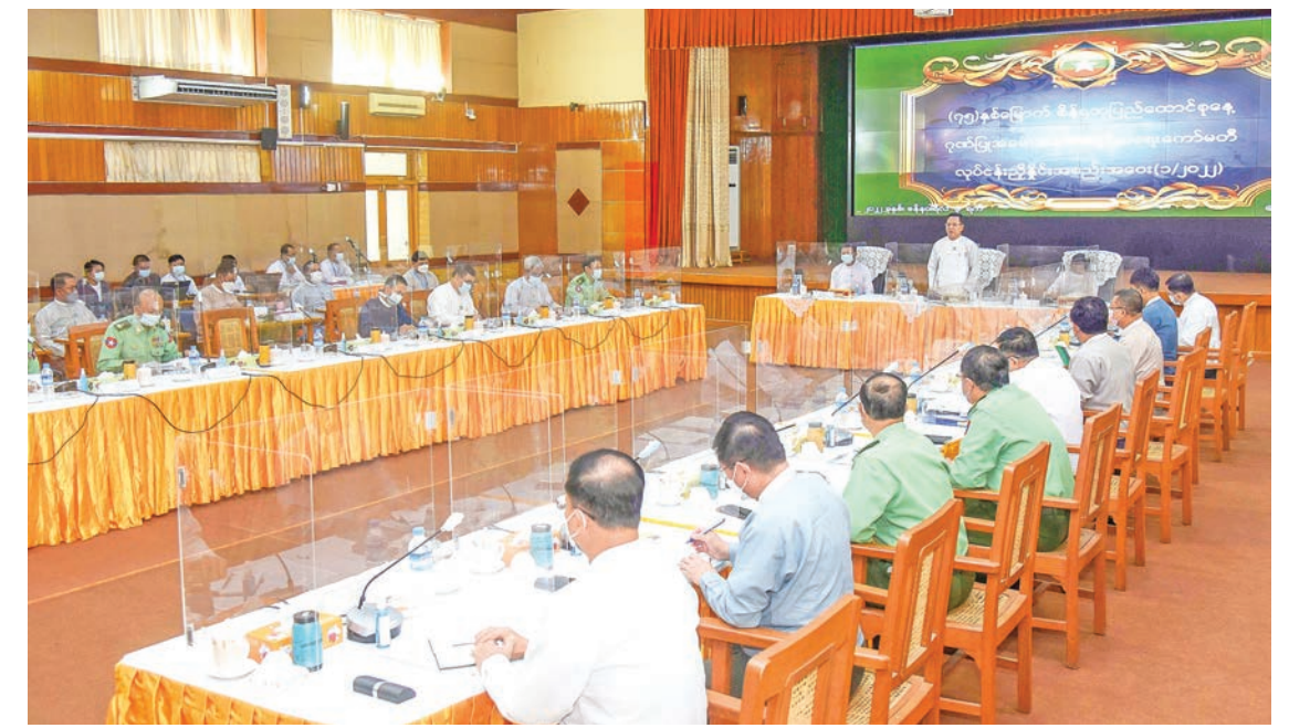
MoI Union Minister U Maung Maung Ohn chairs the coordination meeting 1/2022 of the Diamond Jubilee Anniversary of Union Day Organizing Committee yesterday.

The committee secretary and other officials briefed the organizing of committee and sub-committees on duty assignements. — MNA