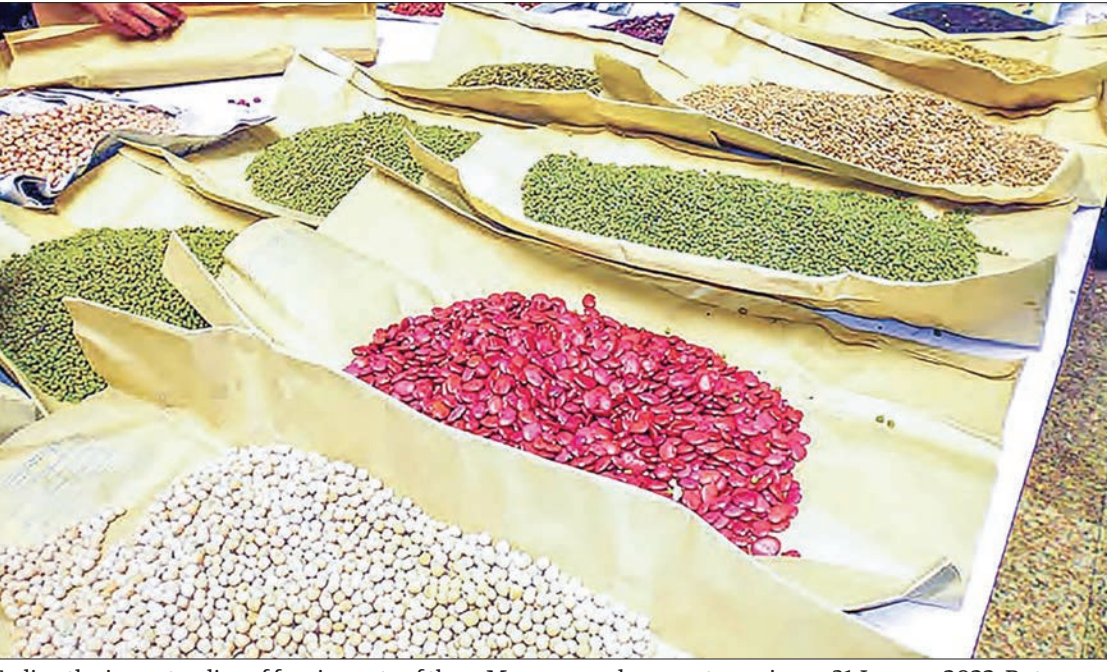
Earlier, the import policy of free imports of three Myanmar pulses was to expire on 31 January 2022. But now, it has been extended to 31 March 2022.

mung bean is about K1,285,000 per tonne, according to the Yangon Region Chambers of Commerce and Industry (Bayintnaung Commodity Exchange).