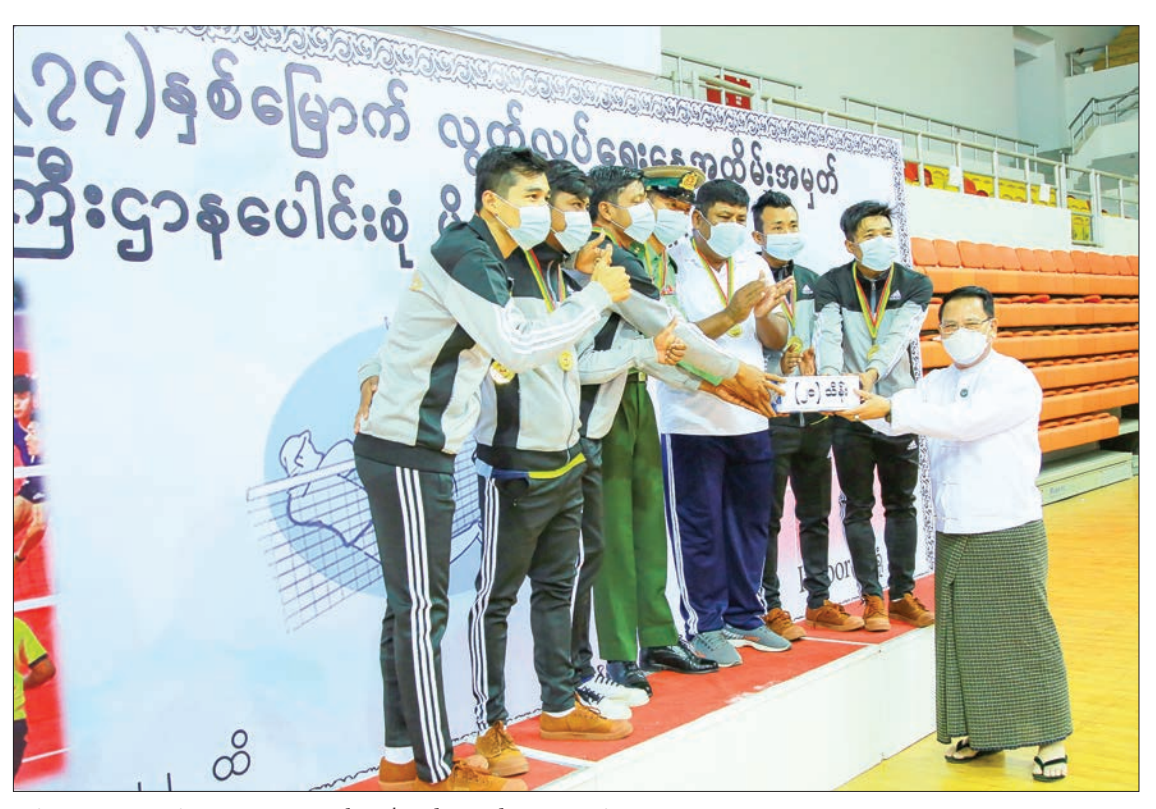
Prizes presentation event to mark 74<sup>th</sup> Independence Day in progress.

On 4 January from 7 am, men's/women's 100-metre, 200-metre, 400-metre and 800-metre races, tug of war competitions (men/women), and htoke-see-toe competitions will be held at Wunna Theikdi Sports Complex. — MNA