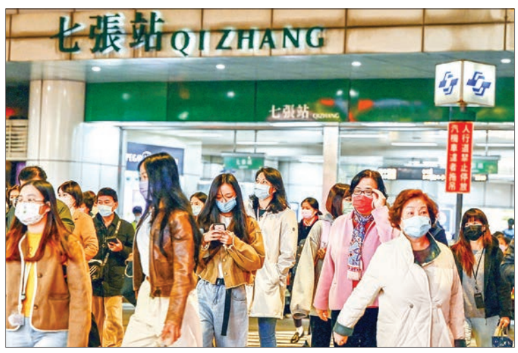
Commuters exit a Mass Rapid Transport (MRT) station in Xindian in New Taipei City on 3 January 2022, after a strong earthquake struck off the coast of eastern Taiwan with shaking felt in the capital Taipei.

A strong earthquake struck off the coast of eastern Taiwan on Monday evening with shaking felt in the capital Taipei, but authorities said there were no immediate reports of widespread damage or injuries.