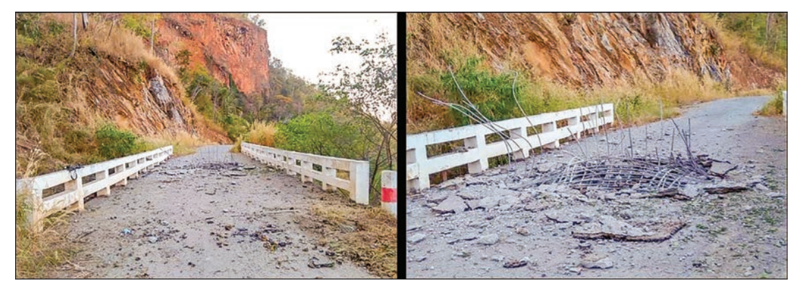
Ravages are seen in the aftermath of the mine attack