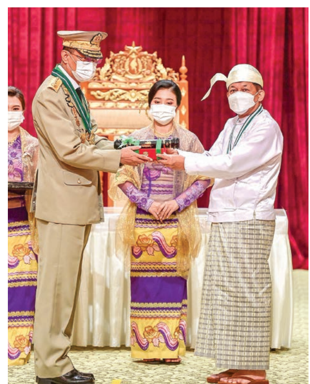
The Senior General offers ten Sithu titles.

Honorary titles are the records for excellent performances of the recipients in serving the interests of the State and the citizens. As the title is a record of the government in recognizing the excellent performances of the recipients, new generations of the recipients who could not attend the ceremony should take pride in winning the titles. The Senior General on behalf of the State and the people took pride in winning the titles.