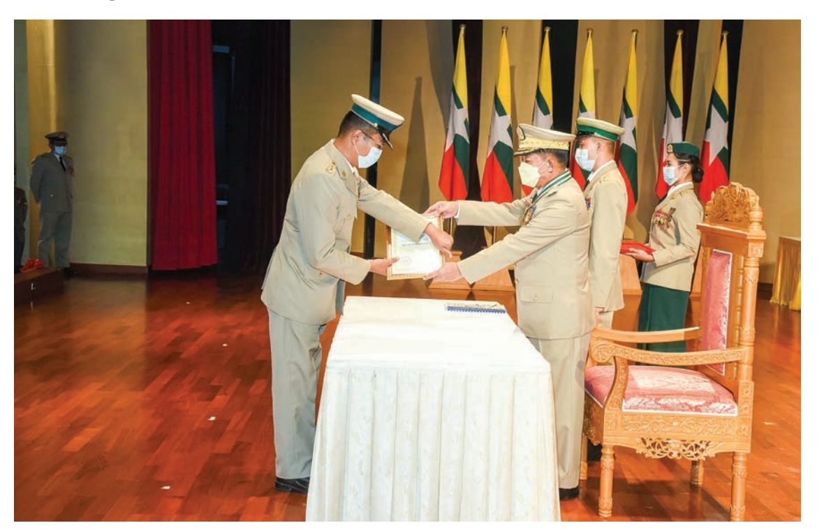
The Senior General confers the Excellent Medal in Science to six Lieutenant-Colonels.

With regard to the number of winners who secured the gallantry medals and certificates at the Tatmadaw till January 2021, there are six recipients in the Aung San Thuriya title, 50 in the Thiha Thura title, 546 in the Thura title, six in the Thiha Bala title, 1,860 in gallantry certificate, 2,018 in gallantry medal, 339 in the gallantry certificate of the Supreme Commander, 2,987 in gallantry certificate of the Commander-in-Chief of Defence Services, nine in the honorary certificate of the Supreme Commander and 1,901 in the honorary certificate of the Commander-in-Chief of Defence Services. — MNA