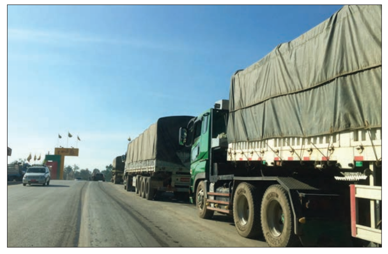
At present, Myanmar carries out border trade with China mainly through Muse, Lweje, Chinshwehaw, Kampaiti and Kengtung border checkpoints. Of these, Muse border trade points stood the largest trade zone.

ries out border trade with China mainly through Muse, Lwejel, Chinshwehaw, Kampaiti and