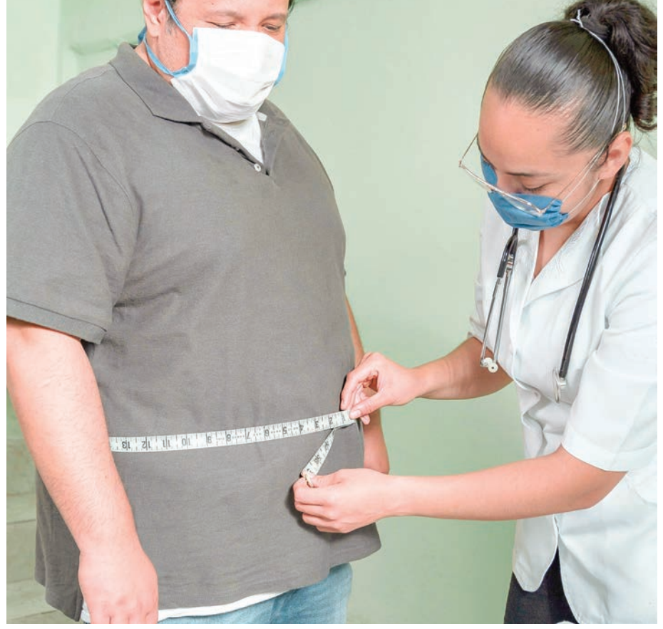
A total of 20,212 adult patients with obesity were included in this observational study.

The aim of this study was to examine whether a successful weight-loss intervention in patients with obesity prior to contracting COVID-19 could reduce the risk of developing a severe form of this disease. "The research findings show that patients with obesity who achieved substantial and sustained weight loss with bariatric surgery prior to a COVID-19 infection reduced their risk of developing