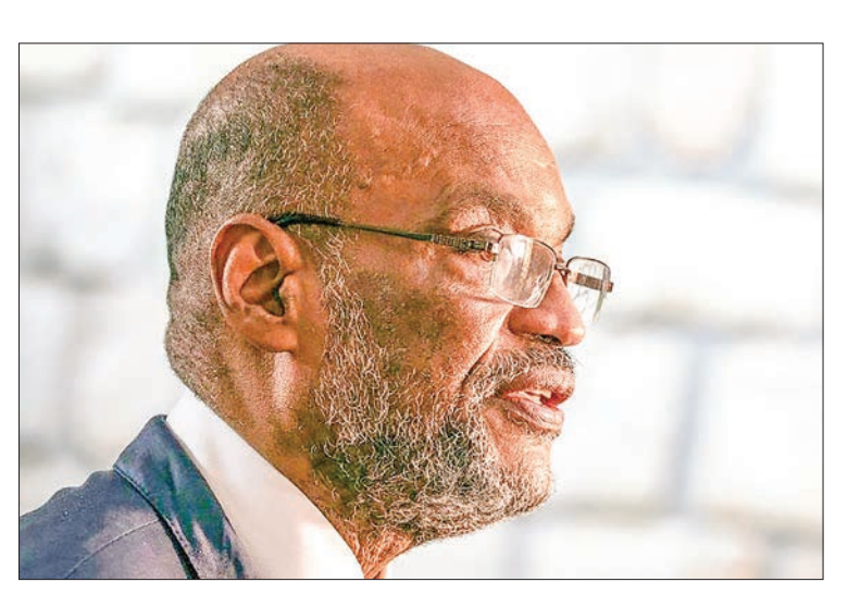
Haitian Prime Minister Ariel Henry has been de-facto running the country since the July 2021 assassination of president Jovenel Moise.

HAITIAN Prime Minister Ariel Henry told AFP in an interview Monday that he was targeted in an assassination attempt during weekend national day celebra-