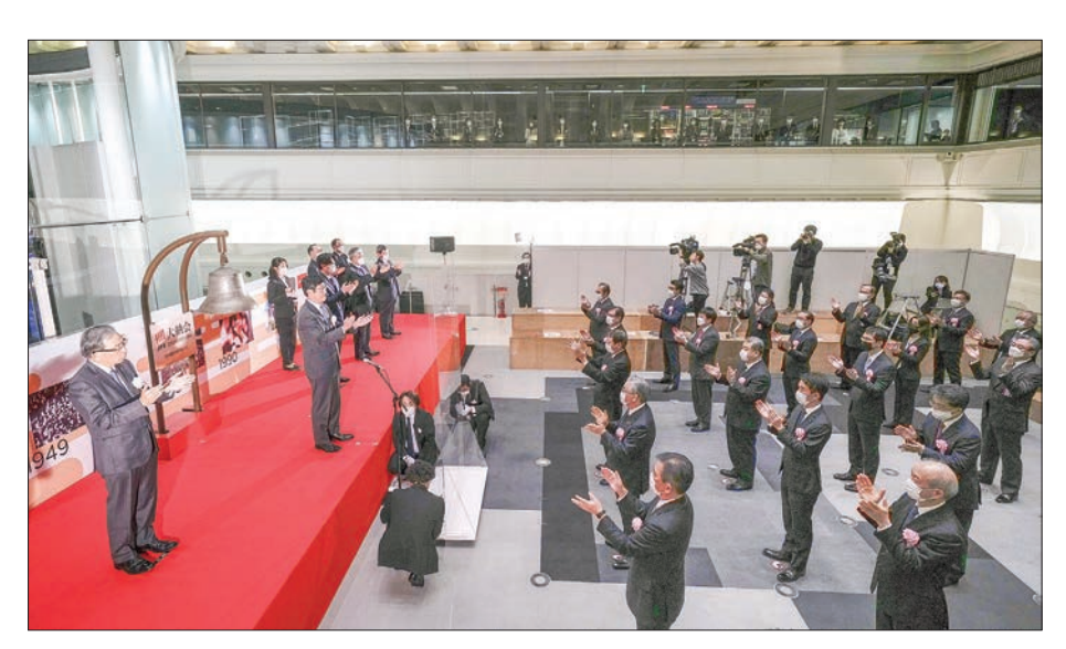
Market officials wearing masks for protection against the coronavirus make a ceremonial hand-clapping at the Tokyo Stock Exchange after the last trading session of the year on 30 December 2021.

The Nikkei index advanced 4.9 per cent in 2021 to end at 28,791.71, a third straight year of climb but a narrower gain than the 16 per cent rise the previous year. Along with precision