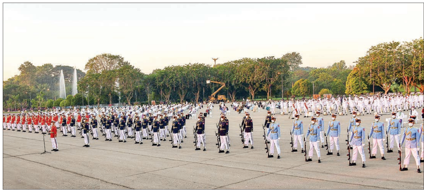
The State Administration Council Vice-Chairman Deputy Prime Minister Vice-Senior General reads out the message sent by the SAC Chairman Prime Minister Senior General at the event yesterday.