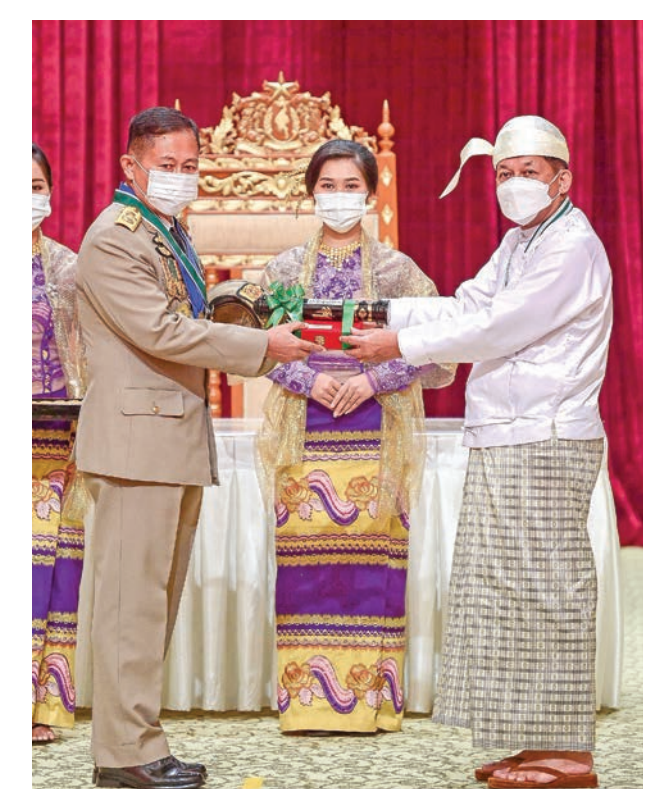
The Senior General presents the Thray Sithu title to the Vice-Senior General