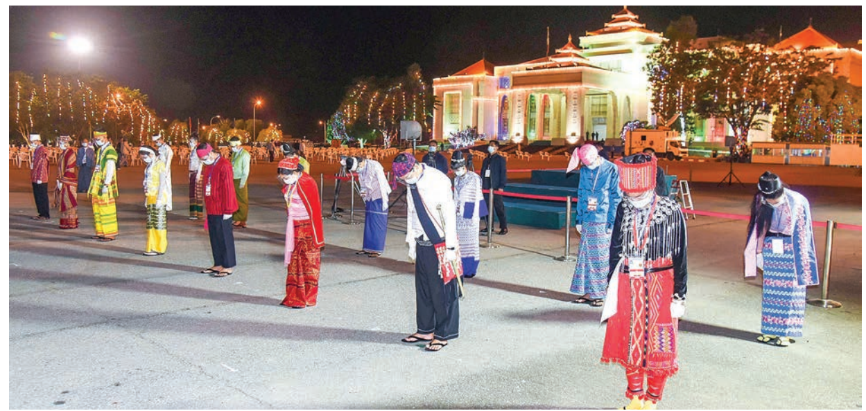
The national races are saluting the State Flag at the event in Nay Pyi Taw yesterday.