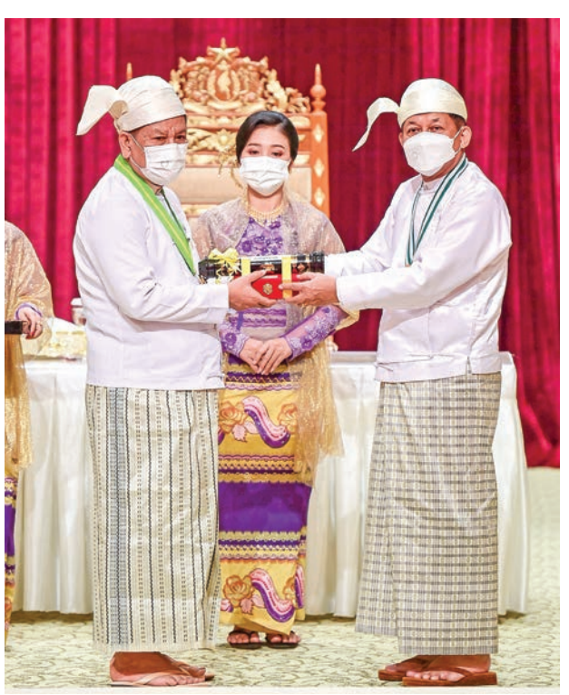
The Senior General gives two Wunna Kyaw Htin title awardees.