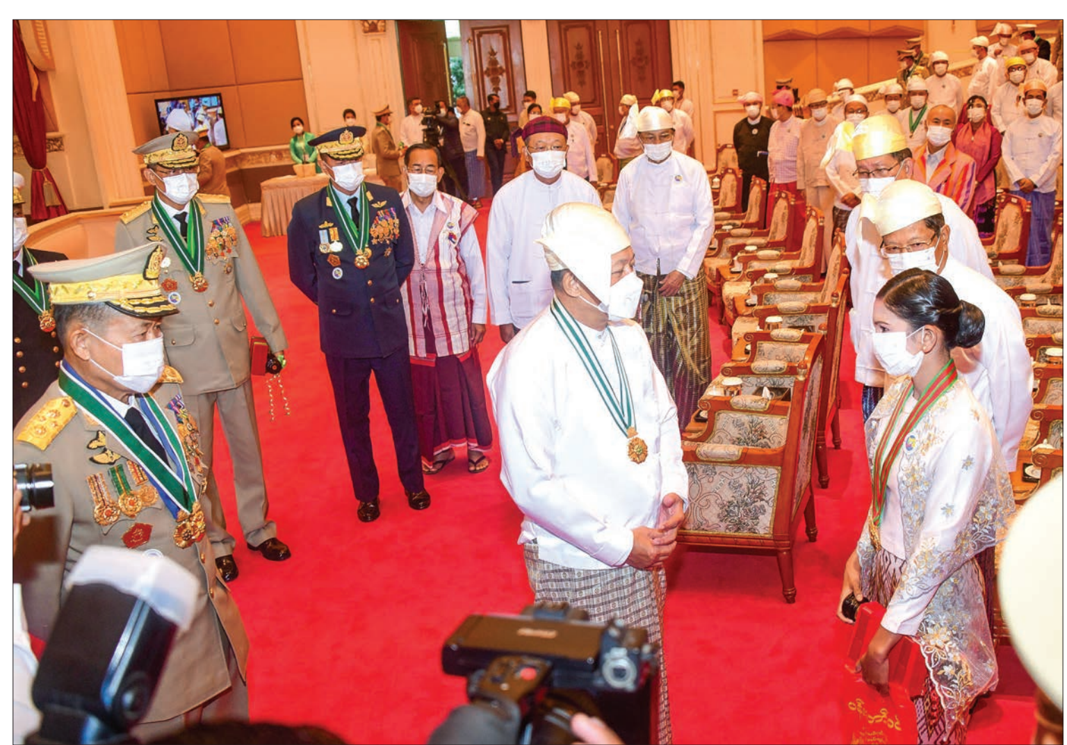
State Administration Council Chairman Prime Minister Senior General Maha Thray Sithu Min Aung Hlaing cordially greets the honorary title holders at the presentation ceremony to mark the 74th Anniversary of Independence Day in Nay Pyi Taw on 4 January 2022.

As such, independence and sovereignty are the hearts of all