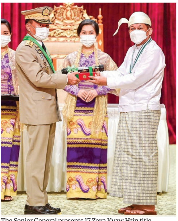
The Senior General presents 17 Zeya Kyaw Htin title recipients.