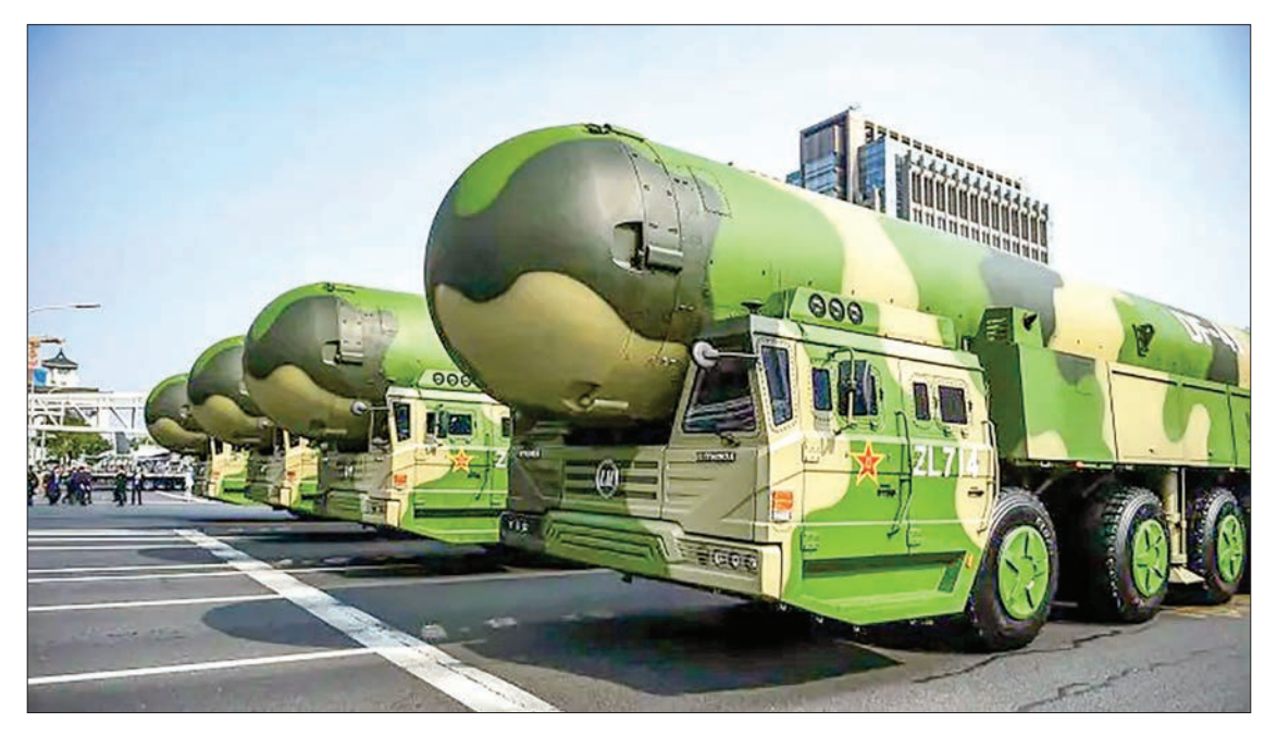
Beijing said it would continue to 'modernize' its nuclear arsenal, a day after joining the four other major nuclear powers in pledging to prevent such weapons spreading. Chinese intercontinental strategic nuclear missiles at a military parade in Beijing.

The United States has also said China is expanding its nuclear arsenal with as many as 700 warheads by 2027 and possibly 1,000 by 2030.