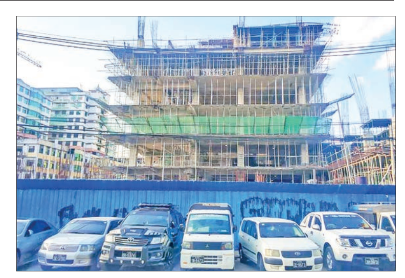
The new Mingala Market is seen under construciton (40 per cent completed).

There will be a two-storey basement car park and the shop owners of the old market will be relocated from the first to the fourth floor and the other eight-storey (except for residential flat) will contain a car park,