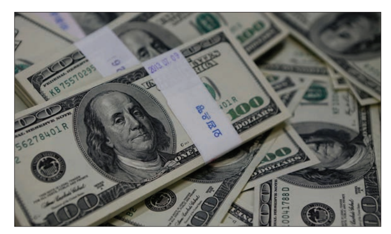
This move is aiming to boost the bilateral cross-border trade, facilitate the trading and bilateral transaction and increase the use of domestic currency in line with the objectives of ASEAN Financial Integration.

THE Central Bank of Myanmar (CBM) sold US$443.8 million at its FX auction rate to the authorized dealers in the past 11 months (February-December) 2021, according to the auction results released by the CBM.