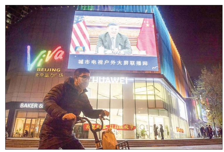
A screen on a street in Beijing shows on 16 November 2021, footage of Chinese President Xi Jinping who held a virtual summit with US President Joe Biden.

AN acceleration of Sino-US tensions may jeopardize the security environment in East Asia in 2022 ahead of key political events in the world's two major powers, making circumstances surrounding Chinese Taipei and North Korea