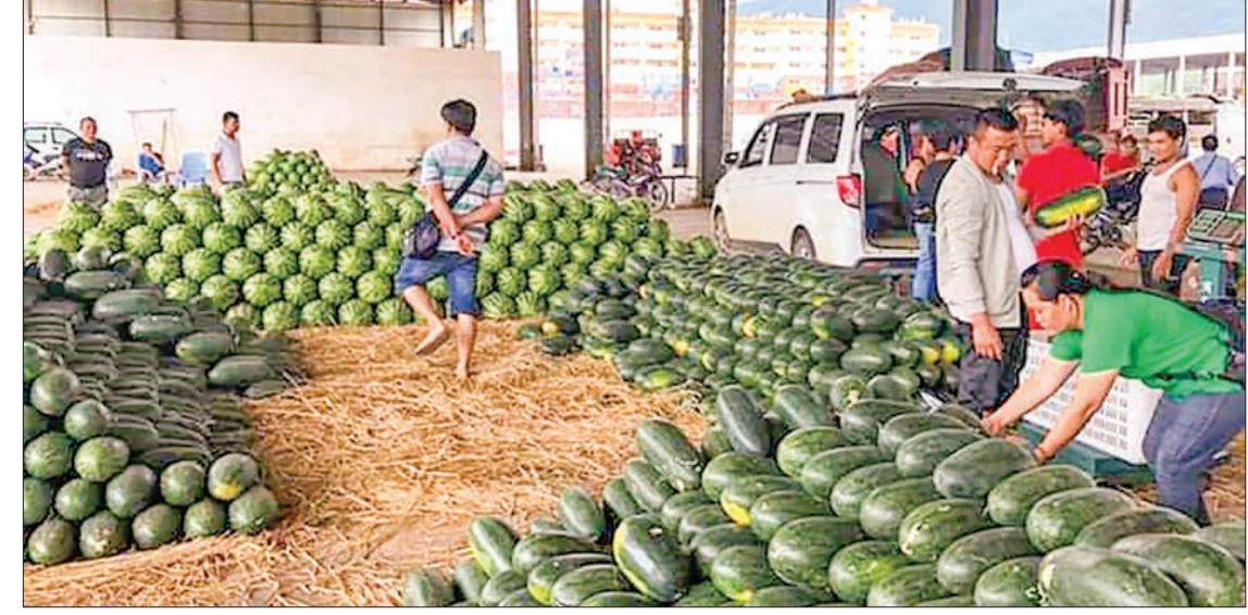
China shut down all border posts with Muse city in the wake of COVID-19 impacts. Of them, the Kyinsankyawt border post between Myanmar and China, which was previously closed down from 8 July, has been reopened starting from 26 November on a trial run.

Long delay of trucks caused harm to watermelon quality and