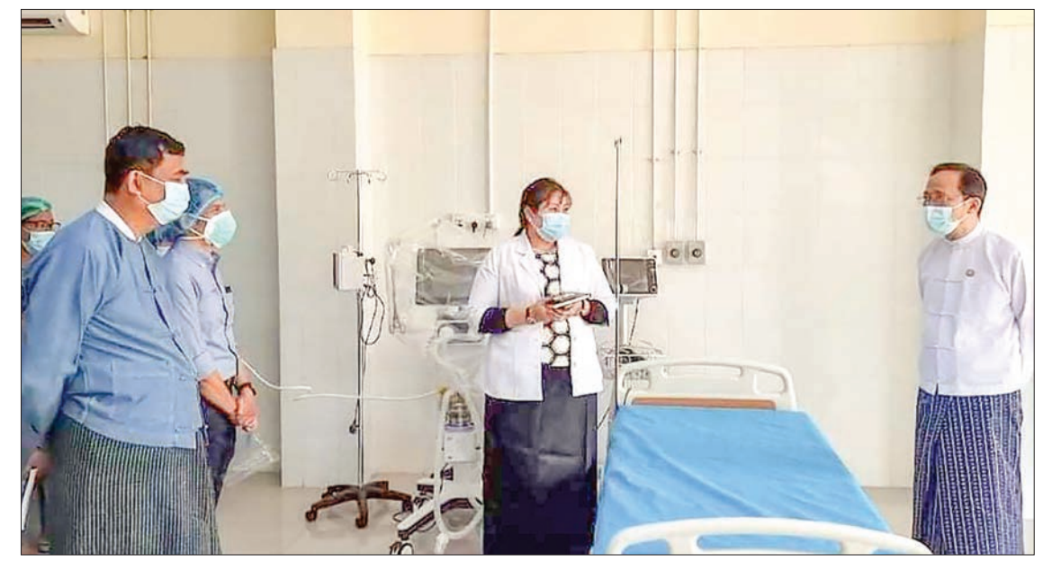
The MoH Union minister inspects the precautionary measures against COVID mutation Omicron.

AT present, 418 community-based quarantine centres and 93 treatment centres have