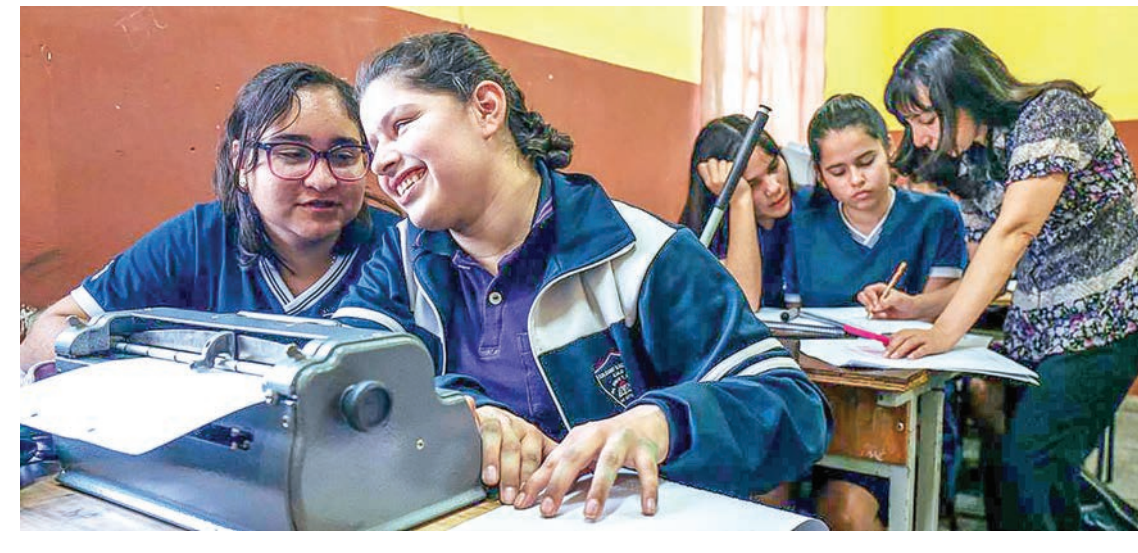
A student in her classroom in Paraguay, learning how to read and write Braille.

The World Health Organization (WHO) estimates at least one