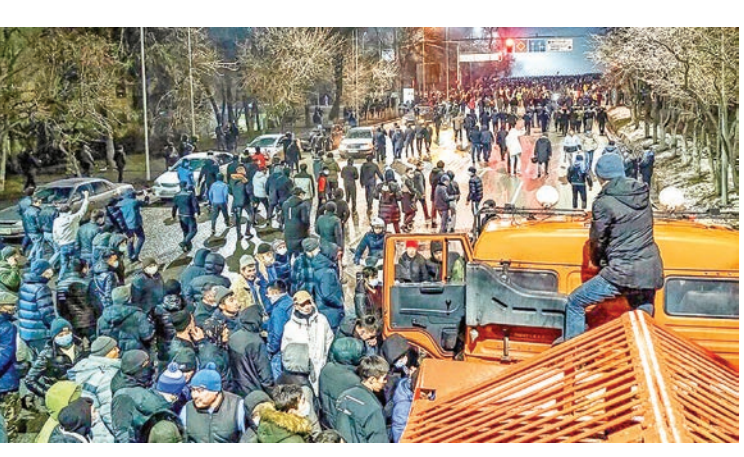
Protesters attend a rally in Almaty on 4 January 2022, after energy price hikes. Police fired tear gas and stun grenades in a bid to break up an unprecedented thousands-strong march in Almaty, Kazakhstan's largest city, after protests that began over fuel prices threatened to spiral out of control.

Deputy prime minister Alikhan Smailov will perform the PM's role on an acting basis