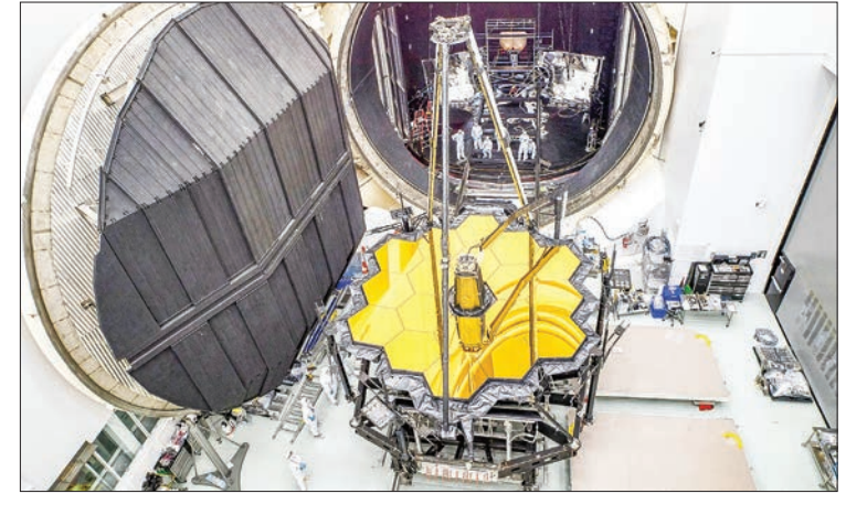
Deploying the James Webb Telescope in space will be one of the most challenging feats ever to be undertaken.

THE James Webb Space Telescope fully deployed its tennis-court sized sunshield Tuesday, a critical milestone for the success of its mission to study every phase of cosmic history, NASA said.