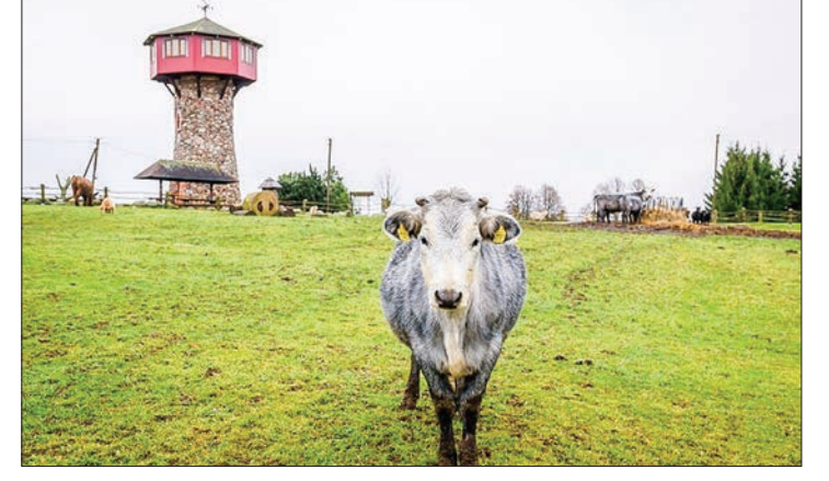
Under the Soviets, emphasis was placed on mass production of beef and dairy, favouring more generic cattle and causing the blue cow to almost go extinct.

the Games using only wind, hydro and solar energy — despite relying on coal to power nearly two-thirds of its economy.