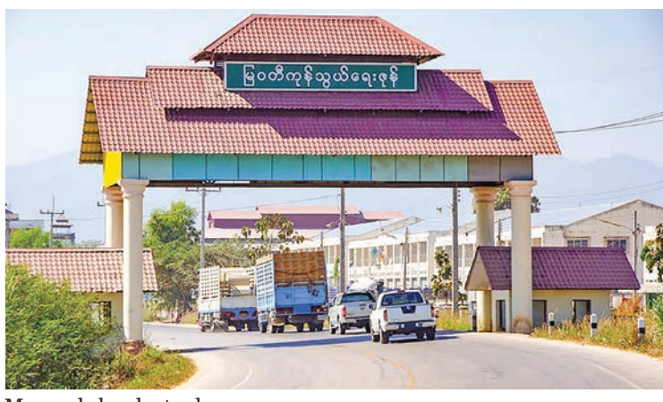
Myawady border trade zone.

MYANMAR-THAILAND border trade has increased by US$350 million and stands at $1.1 billion between 1 October and 24 December this mini-budget period, according to the Ministry of Commerce.