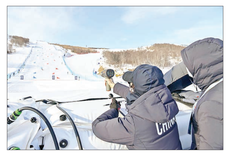
Staff members transport equipment during a testing programme for the 2022 Olympic and Paralympic Winter Games to root out problems and accumulate data at the Genting Snow Park in Chongli District of