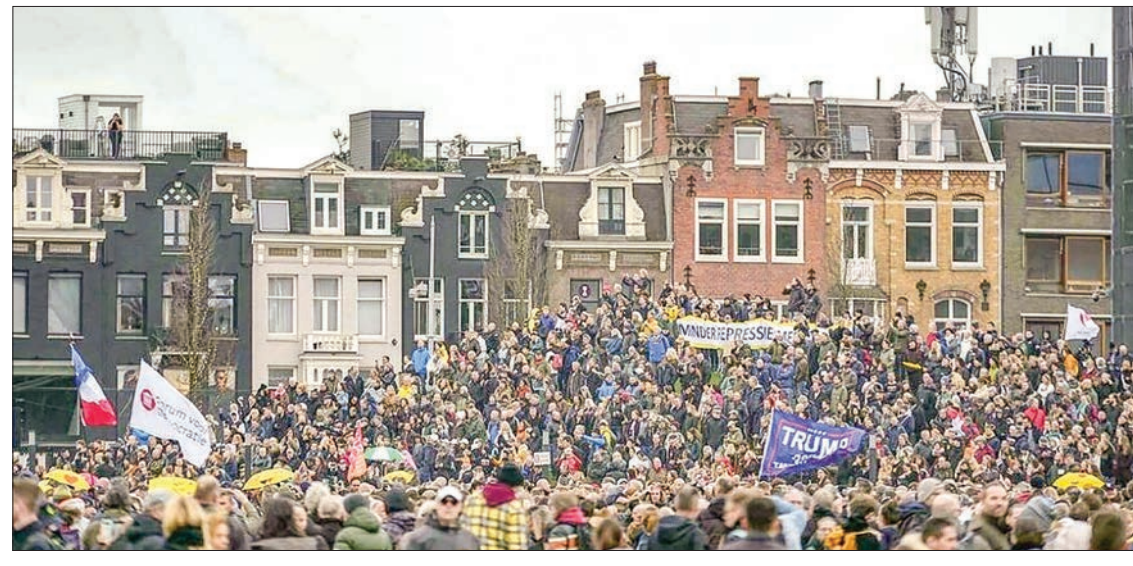
Demonstrators gathered in one of Amsterdam's main squares.

THOUSANDS of protesters defied authorities and gathered in the Dutch capital Amsterdam on Sunday to oppose coronavirus restrictions, leading to clashes and arrests.