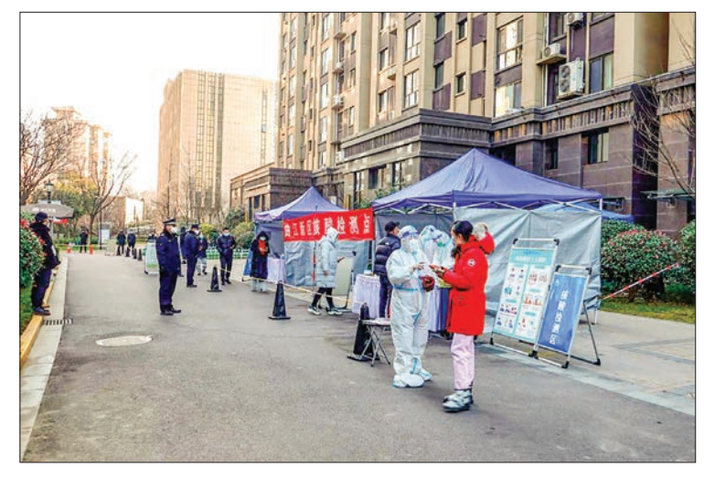
Pix for representational purpose only: More than one million people in a city in central China were being confined to their homes on Tuesday after three asymptomatic coronavirus cases were recorded in the country's latest mass lockdown.

Xi'an has reported more than 1,600 cases since 9 December, although numbers in the last few days have started to slide compared to last week's figures.