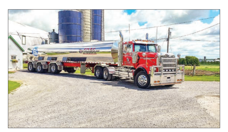
This undated photo shows a milk transport truck in Canada.

US Trade Representative (USTR) Katherine Tai called the ruling under the US-Mexico-Canada Agreement a "historic win" that "will help eliminate unjustified trade restrictions."