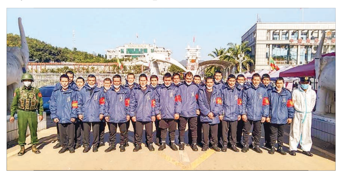
Returnees are welcomed at the Chinshwehaw land border in northern Shan State.

THE border camps are receiving Myanmar returnees from foreign countries. A total of 16 Myanmar citizens — eight males and eight females — returned to Chinshwehaw in northern