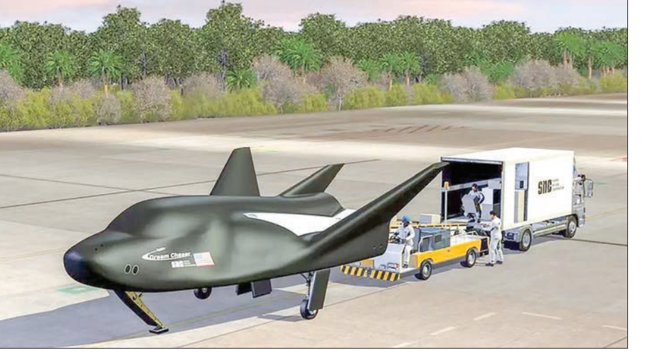
The Dream Chaser space plane is designed to return cargo to Earth by landing on a runway, allowing for rapid access.

Sierra Space, a subsidiary of private aerospace contractor Sierra Nevada Corp., plans to