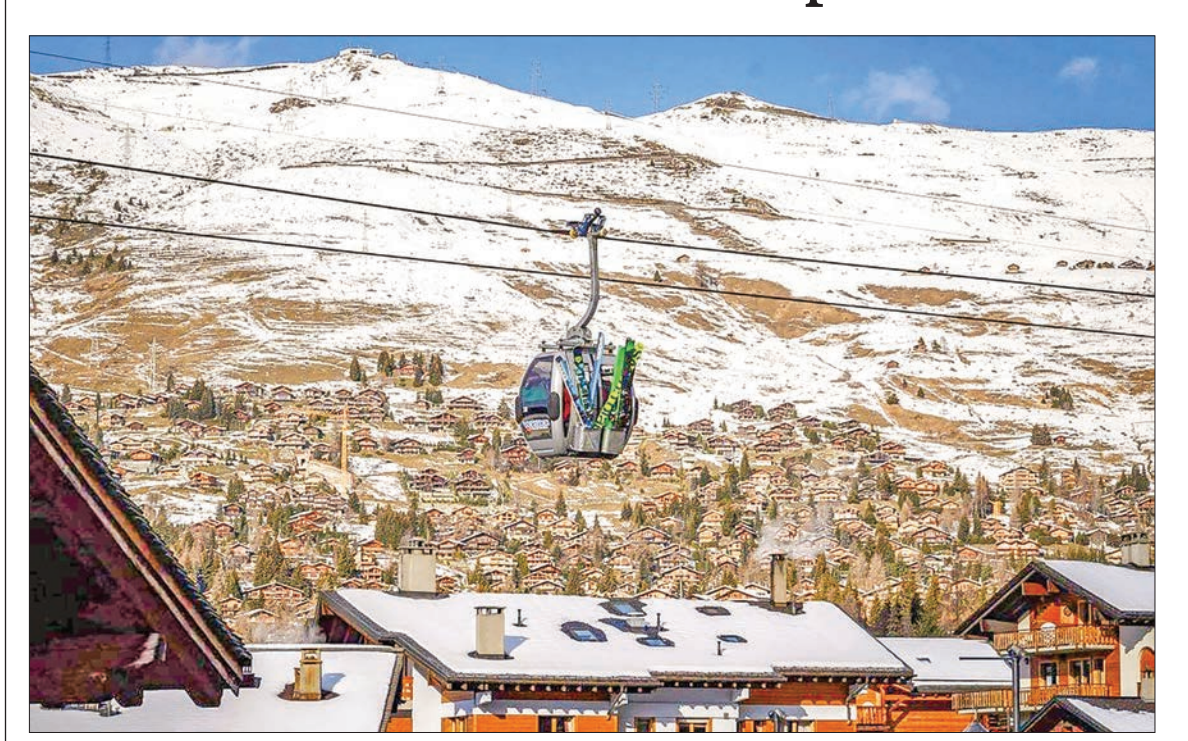
A gondola in the Alpine resort of Verbier, Switzerland.