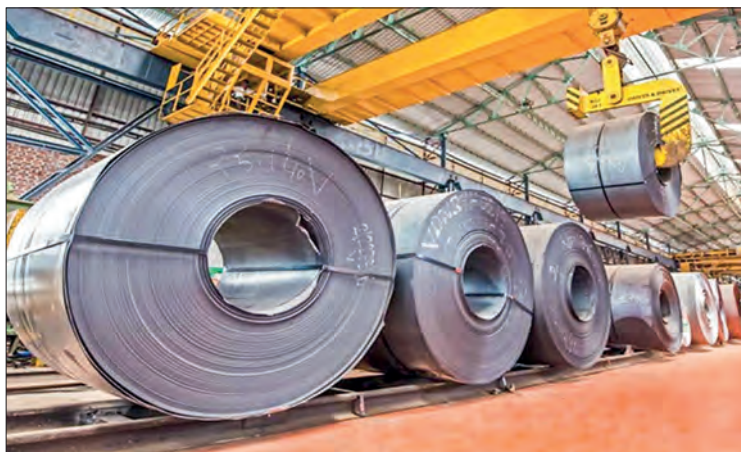
JSW Steel is a leading manufacturer of steel products including TMT bars, galvanised corrugated sheet, cold rolled and wire rods.

The expansion includes establishing 4.5 MTPA Blast Furnace, two steel melt shops that are 350 tons each, and 5 MTPA Hot Strip Mill along with other allied and auxiliary facilities.