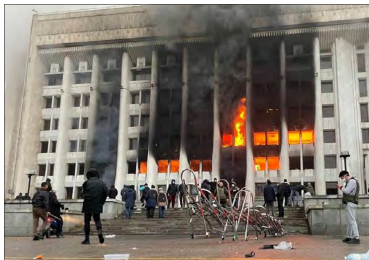
Protesters set fire to the city administration building in Almaty, Kazakhstan.

One long burst of gunfire scattered onlookers who had gathered close to a checkpoint, pointing and taking photos of a destroyed car with traces of state markings.—AFP ■