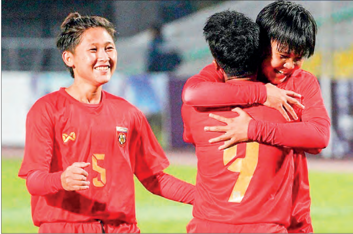
Myanmar Women's Football teammates.

THE Myanmar Football Federation will announce the final squad of the Myanmar women's football team in the coming days for the upcoming 2022 AFC Women's Cup.