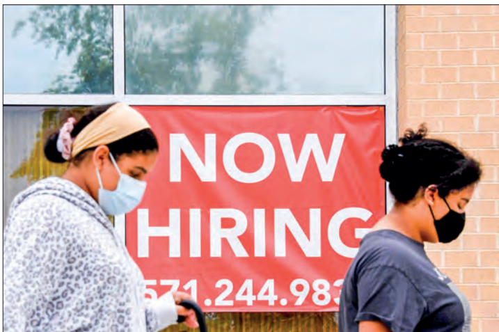
Women walk past a "Now Hiring" sign outside a store in Arlington, Virginia, US, 16 August 2021.

The Republican opposition in the Senate meanwhile tweeted that the report marks "another huge miss for the Biden economy."—AFP ■