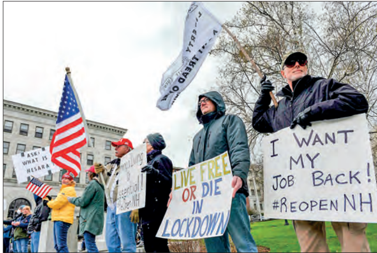
Some 400 people gathered on Saturday 18 April 2020 in front of the Parliament of Concord, capital of New Hampshire, to demand an end to the confinement.

Health Administration (OSHA) has given businesses until 9 February to be in compliance with the rules or face the possibility of fines.