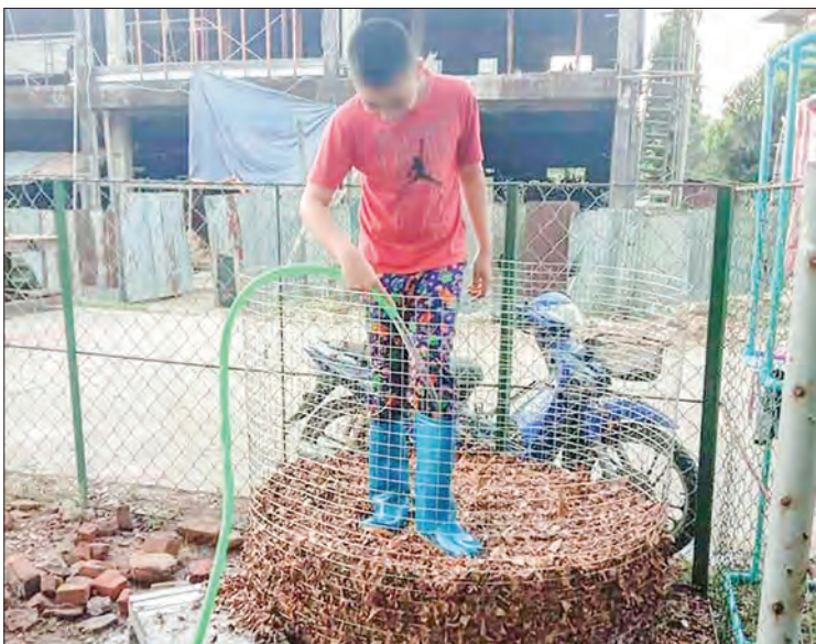
A compost basket.

In 2017, about 45,000 deaths in Myanmar were attributed to air pollution, according to the World Bank’s analysis. To mitigate death risk from air pollution an environmental-friendly community should be established with a good practice of Bokashi composting, YCDC released a notification. — Pwint Thitsar/GNLM