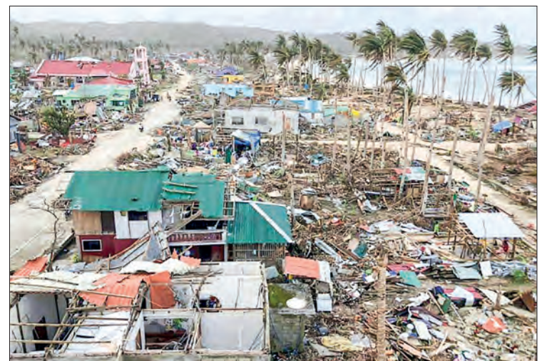
Thousands of homes have been destroyed by Typhoon Rai in the Philippines.

“It’s hard to say it’s under control. The water supply remains irregular. Their food needs have not been addressed,” Pareja said. — AFP ■