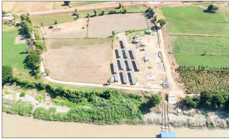
A new solar-powered pumping system project, which started in the 2020-2021 financial year, will irrigate summer crops in Kanmalay Village, Aunglan Township, Magway Region, according to the Magway Region Irrigation and Water Utilization Management Department.