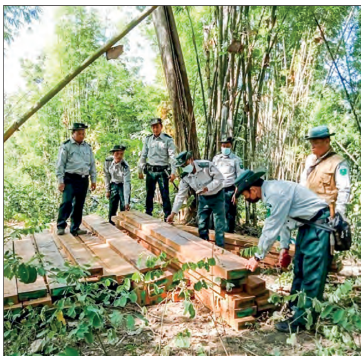
Confiscated timber in Bago Region on 8 January 2022.

UNDER the supervision of the Anti-Illegal Trade Steering Committee, effective action is being taken to prevent illegal trade under the law.