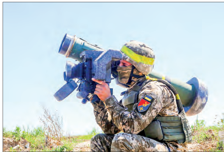
A Ukrainian soldier with an FGM-148 Javelin anti-tank missile during exercises in the Rivne Region of western Ukraine, 26 May 2021.

Blinken said that Russia should know it was issuing “absolutely non-starter demands”