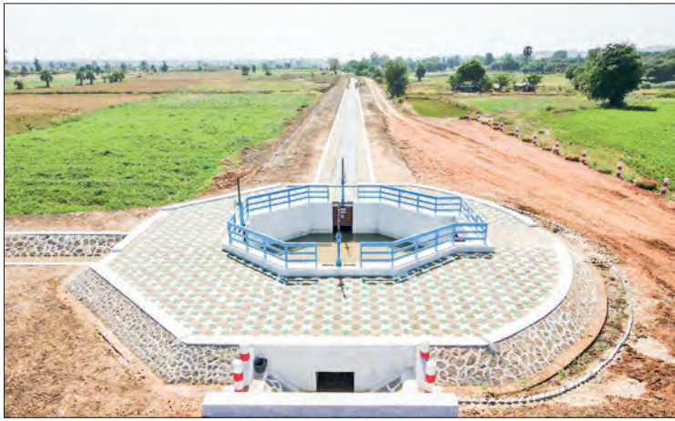
The project includes a two-mile long irrigation network, 99 canals and a 170kW solar system. It is slated to end in the 2022-2023 financial year.