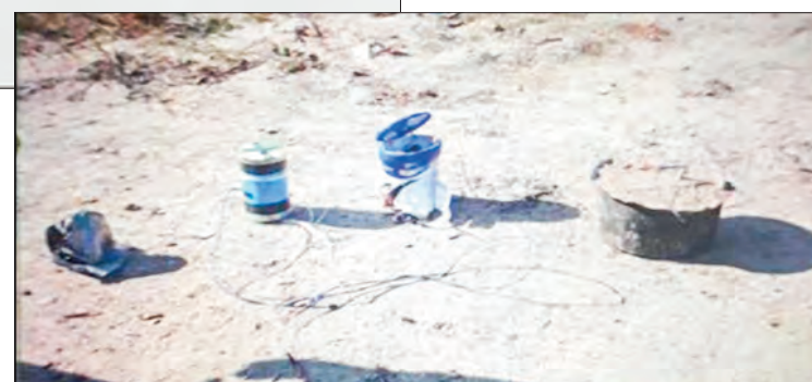
Blast of a handmade mine in Sagaing Region.