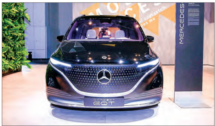
Retail unit sales of Daimler's brand Mercedes-Benz dropped by 24.6 per cent year-on-year to 464,130 units worldwide in the fourth quarter (Q4) of 2021.

RETAIL unit sales of Daimler's brand Mercedes-Benz dropped by 24.6 per cent year-on-year to 464,130 units worldwide in the fourth quarter (Q4) of 2021, the