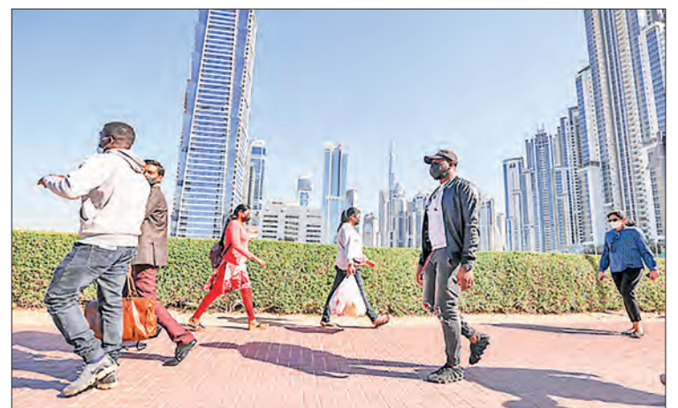
Employees walking to work.