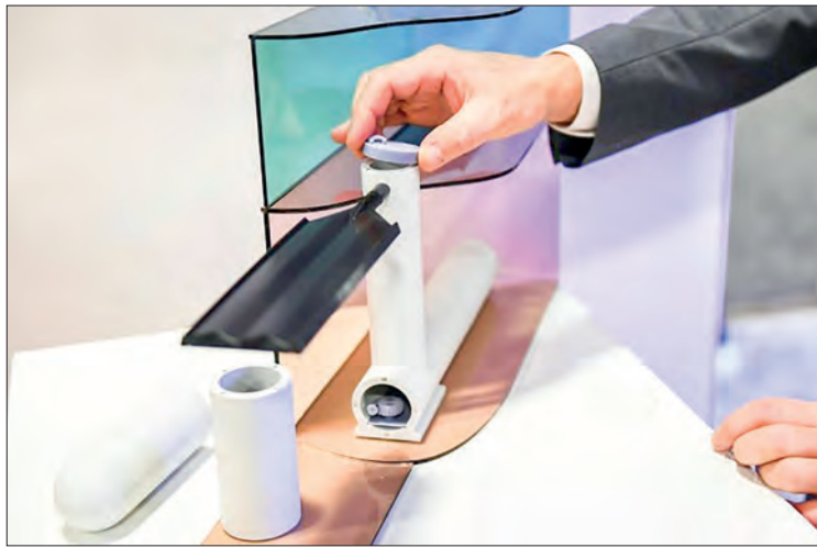
Frits Blik, CEO of Dutch startup Ocean Grazer, explains an “ocean battery,” during the Consumer Electronics Show (CES) on 6 January 2022 in Las Vegas.

A wind turbine sitting idle on a calm day or spinning swiftly when power demand is already met poses a problem for renewables, and is one researchers think can be tackled under the sea.