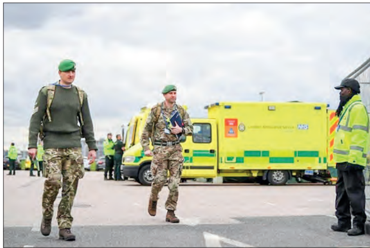
Members of the armed forces gather outside the NHS Nightingale Hospital in London in April 2020.

BRITAIN will deploy troops to hospitals in London to alleviate severe staff shortages caused