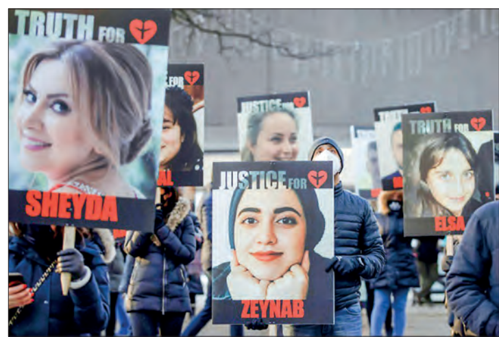
People hold signs with images of the victims of the downed Ukraine International Airlines flight PS752, which was shot down near Tehran by Iran’s Revolutionary Guard, as family and friends gather to take part in a march to mark the first anniversary, in Toronto, Ontario, Canada, on 8 January 2021.

Von der Leyen recalled the solidarity between European countries during the pandemic. She said that over 70 per cent of the EU’s adult population have now been fully vaccinated against COVID-19 and that the EU aims to donate and deliver 1.7 billion vaccine doses around the world by the middle of this year.—Xinhua ■