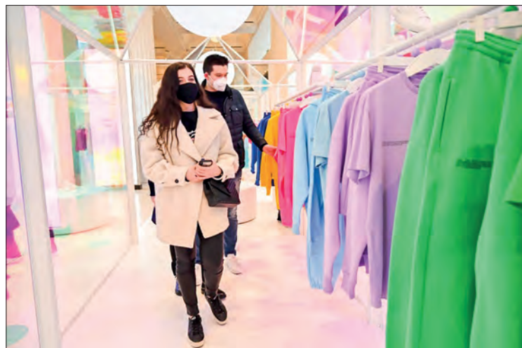
Customers browse clothing in the pop-up shop Pangaia inside Selfridges department store in London on 12 April 2021 as coronavirus restrictions are eased.

More than one in 20 people had Covid-19 in the week ending 31 December — the highest UK infection rate recorded during the pandemic.—AFP ■