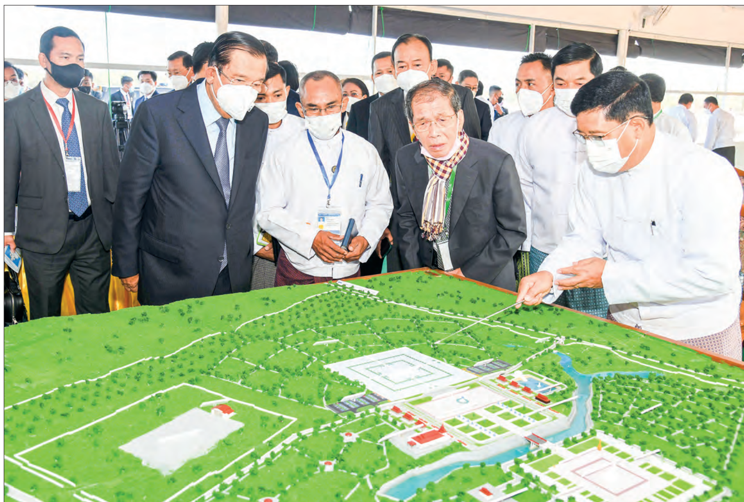
Cambodian Prime Minister Mr Hun Sen looks into the scale-model of the Buddha Image and pagoda compound in Nay Pyi Taw on 8 January 2022.

Then, the Cambodian Premier donated to the Buddha Image in the meeting hall. Afterwards, Lt-Gen Kan Myint Than briefed the curving and building of the Mara Vijaya Buddha Image, step-by-step exploration and conveyance of marble rocks, efforts of the Senior General for seeking the guidance of State Ovada Cariya Sayadaws, work processes to publish the Tri Pitaka treatises in the Romanized Language using modern machines and other construction