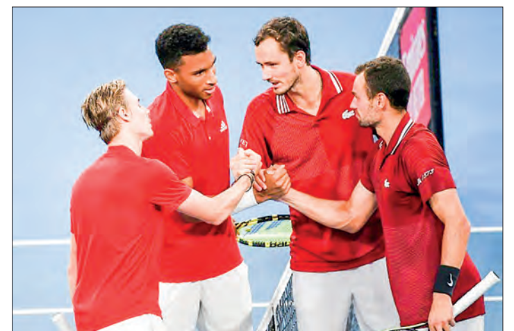
The players shake hands at the net.

It forced the match into a doubles shoot-out which looked to be going Russia's way only for Canada to find an extra gear and grind out a 4-6, 7-5, 10-7 win to make their first-ever final in the team event. — AFP ■