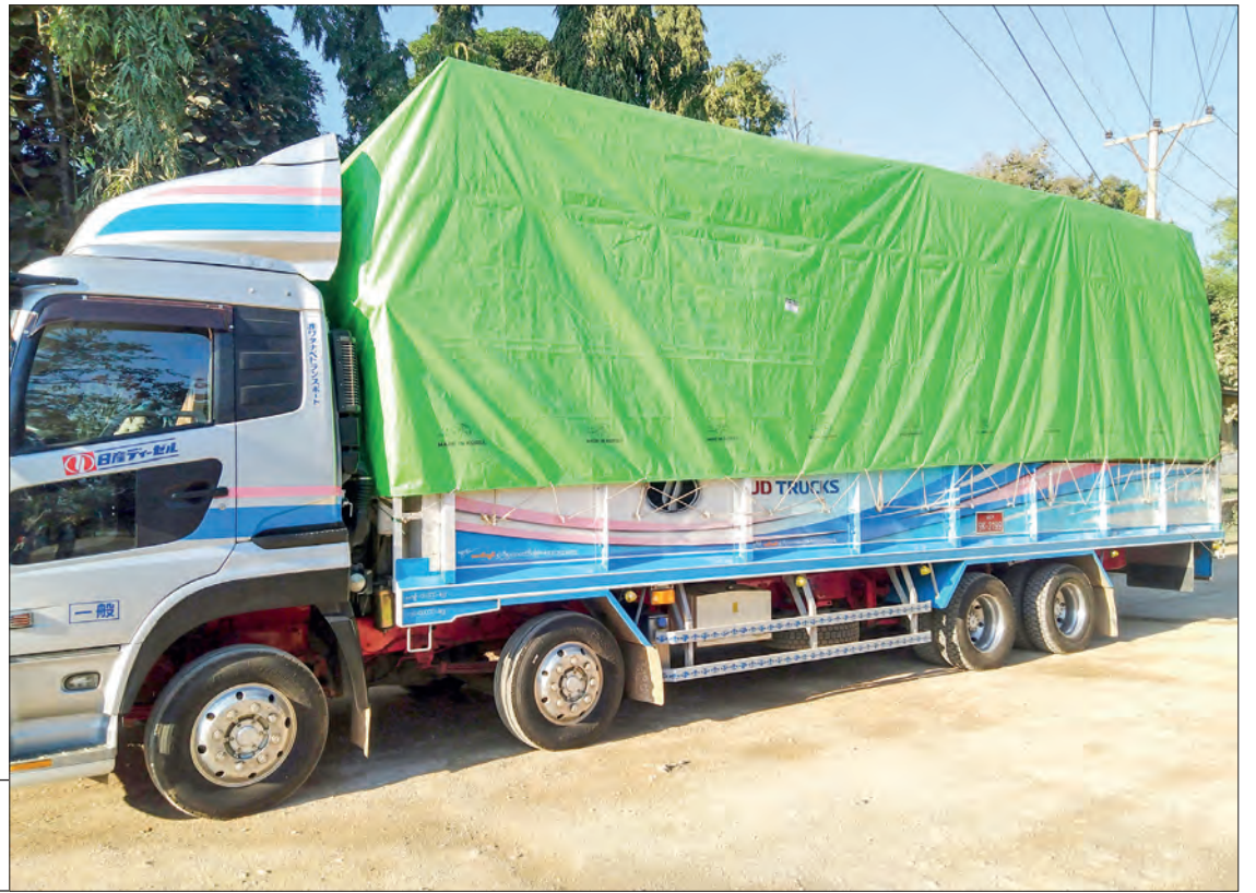
A lorry is seen transporting anti-Covid medical supplies to where necessary.

It is reported that the Ministry of Commerce is coordinating with relevant departments and treatment of COVID-19 as well as contact persons for inquiries can be reached through the Ministry's Website —www.commerce.gov.mm. — MNA