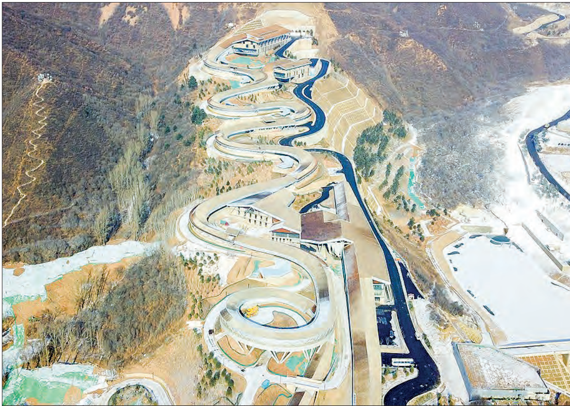
Aerial photo taken on 19 January 2021 shows the National Sliding Centre in Yanqing District, Beijing, capital of China.

NORTH Korea has slammed the US-led diplomatic boycott of February’s Beijing Winter Games, state media reported Friday, describing it as an “insult” to the Olympic spirit.