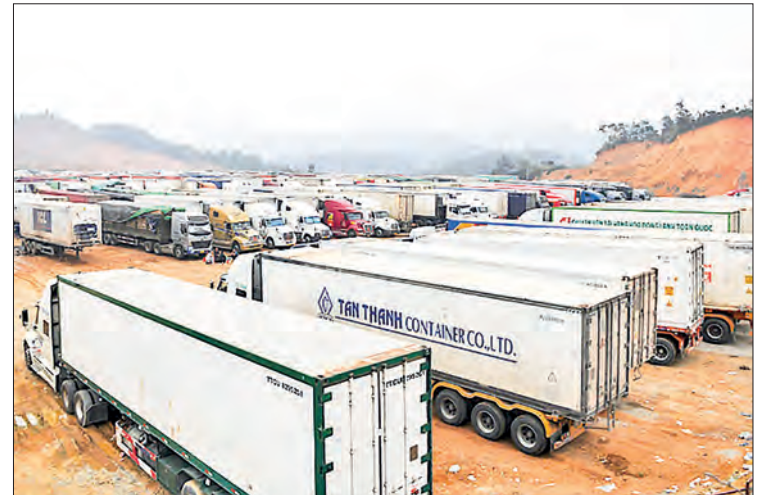
Lorries loaded with thousands of tonnes of dragonfruit, jackfruit, mango and other produce are languishing.

"If I am lucky, I think I can get through after 10 days," Nen told AFP, explaining his contain-