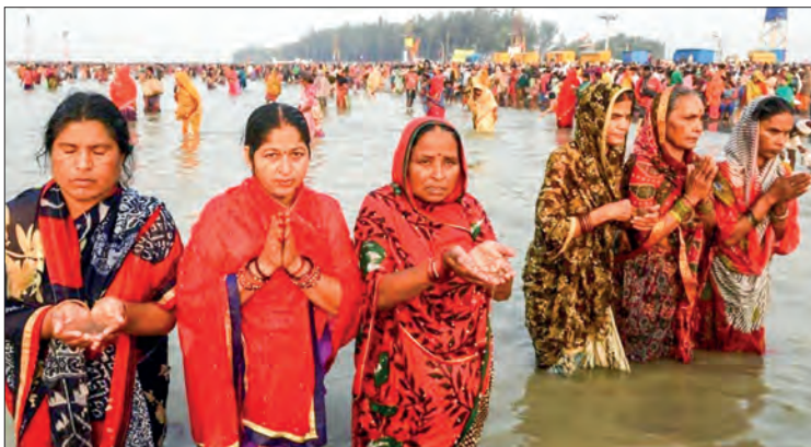
Hundreds of thousands of people are expected to attend the annual Gangasagar Mela festival, which begins Saturday on an island where the holy river Ganges enters the Bay of Bengal.

“They may carry variant viruses and this religious festival may end up being the biggest superspreader in the coming days,” he added.—AFP ■