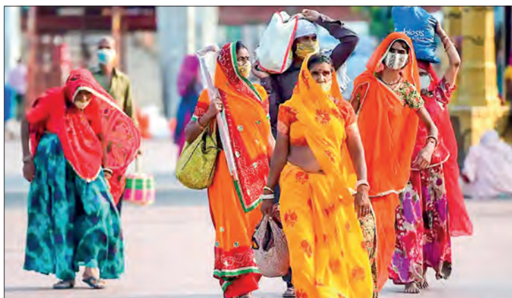
Daily infections nearly tripled over two days this week to more than 90,000, a surge driven by the highly contagious Omicron variant.

With this, the country's COVID-19 case tally has gone up to 3,52,26,386. According to Health Ministry, the country has so far reported 3,007 cases of Omicron of which 1,199 have been recovered. Maharashtra accounts for the highest number of Omicron cases (876), followed by Delhi