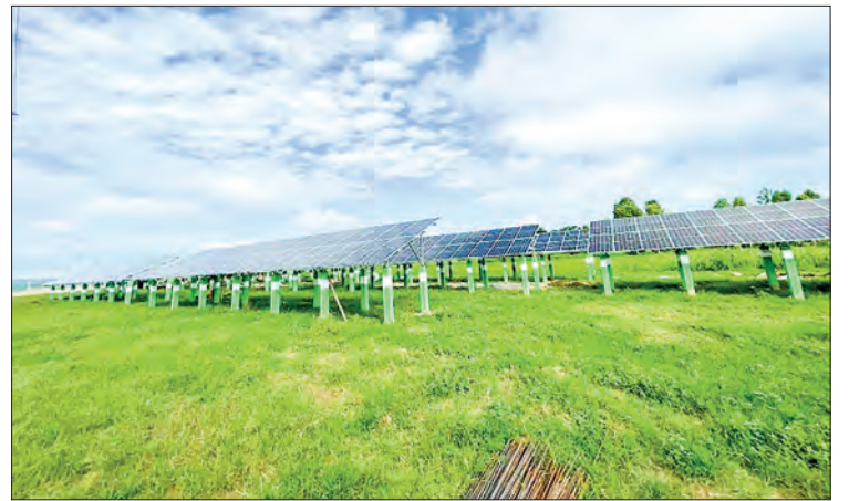
In a bid to reduce the electricity cost in irrigation, solar-powered irrigation activities are being implemented in Magway Region.

tricity cost in irrigation, solar-powered irrigation activities are being implemented in Magway Region. This renewable resource is aimed for sustainable energy. Solar panels have been installed in Minbu Township, while the Myinkun solar pumping irrigation project is a part of regional budget planning in the 2022-2023FY. More solar pumping irrigation projects will be carried out in the region.