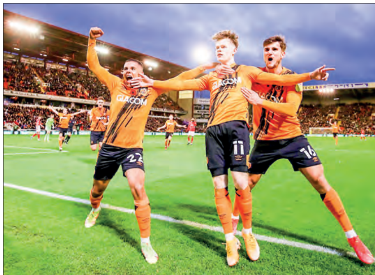
Hull City will believe they can deepen Everton's woes as they host Rafa Benitez's players.

Liverpool will rest players for their home game against Shrewsbury Town from League One, while FA Cup holders Chelsea will probably do likewise when they play at home to Chesterfield Town from the fifth tier Conference Premier in the sort of game that still makes the FA