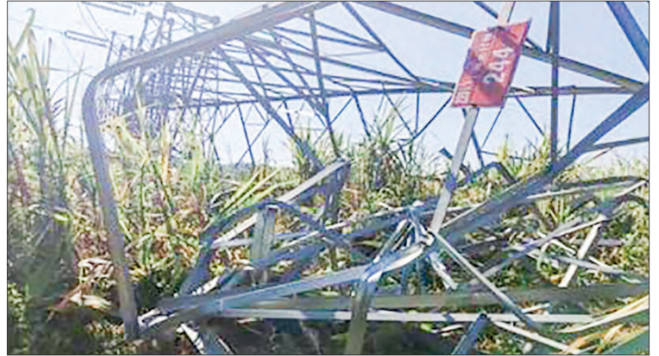
Ravages in the aftermath of the mine explosions.

An investigation is underway to arrest the terrorists who are fleeing after the mine blast.