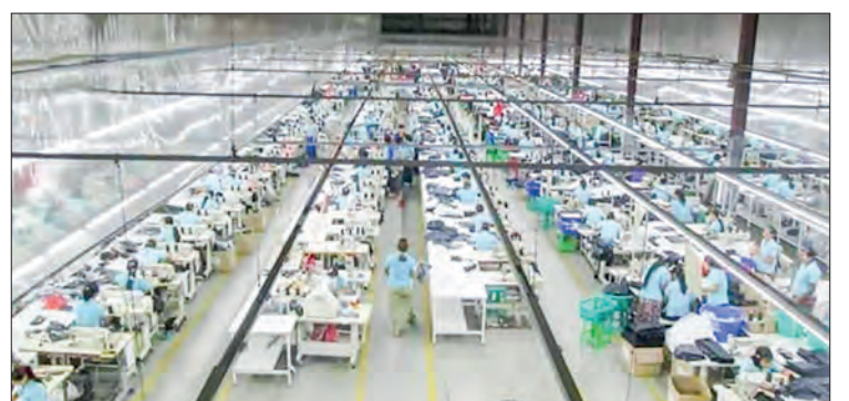
The Yangon Pan-Pacific International Company Limited.

Those interested can enquire about jobs through 09408001284, 09408001281 and 09259916014 and send CV to ypihrrecruit@gmail.com, with an attachment of both an original and a copy of the household certificate, citizen scrutiny card, two licence photos, and other documents. The lowest minimum wages for a worker are K5,200. The salary will vary depending on the grade of the operators. Y.P.I have the best corporate reputation in the past 22 years in the country. It is expected to employ 350 workers, according to the job opportunity announcement of the company. — Ko Naing (Bago)/GNLM