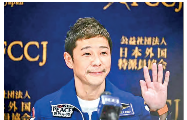
Japanese billionaire Yusaku Maezawa spent 12 days aboard the International Space Station.

to land without the undercarriage lowered, and crashed into a crowded neighbourhood while circling for a second attempt. The accident was attributed to pilot error as a result of the crew being out of action for months, having been grounded by the coronavirus epidemic.—AFP ■