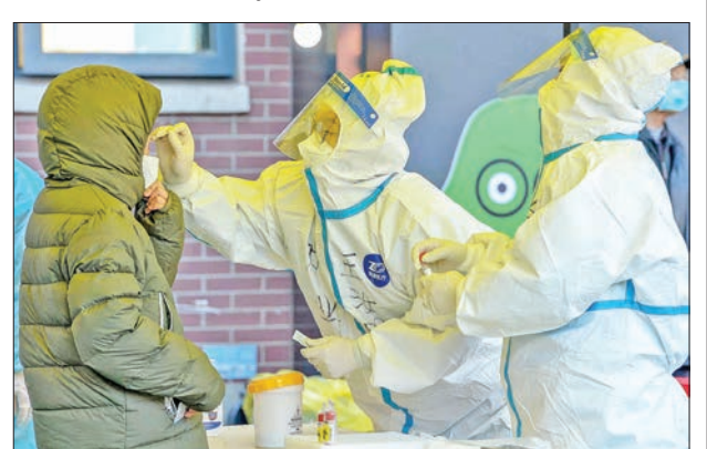
A resident undergoes a nucleic acid test for the Covid-19 coronavirus in north China's Tianjin on 10 January 2022.

"The US Fed needs to tread carefully in removing policy accommodation—it should not happen too fast otherwise it risks a disruption to the rebound in economic growth and could lead to another 'taper tantrum'," Diana Mousina, of AMP Capital, said.— AFP