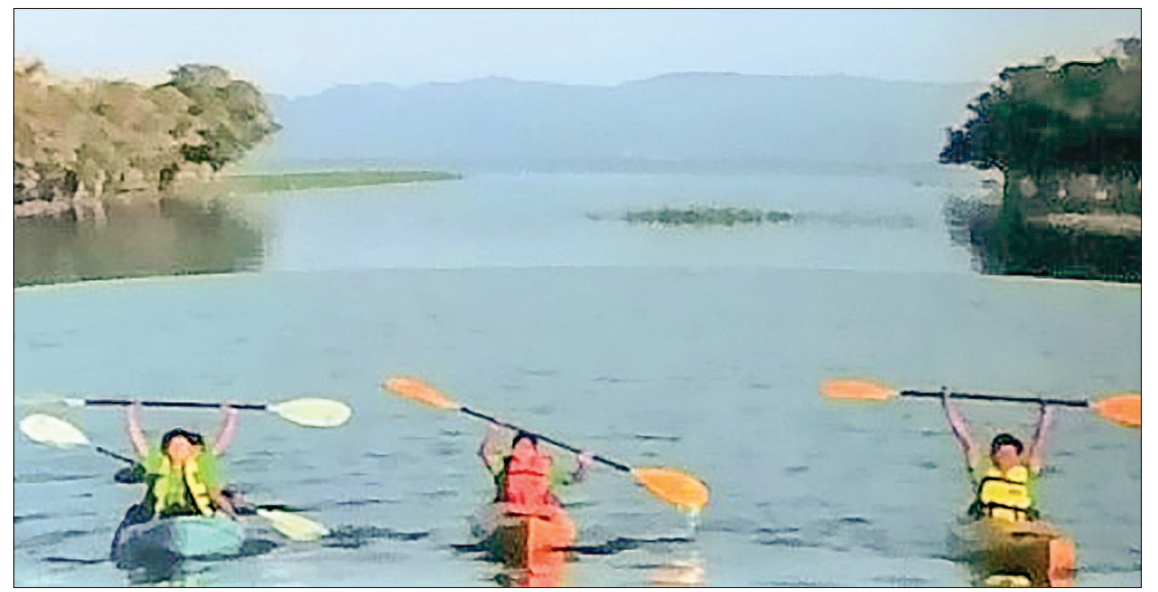
Revellers at Indawgyi Lake.

across an area of 303.508 square miles (200,645 acres).