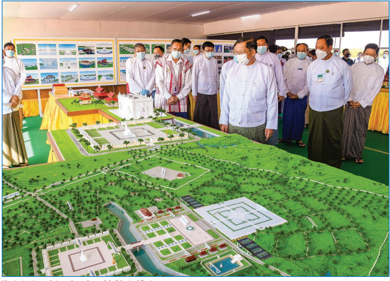
The Senior General views the scale-model of the Buddha Image.