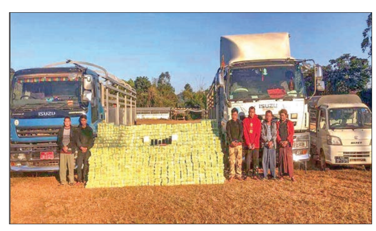
Arrestees with seized drugs and vehicles.

POLICE seized more than K17.3 billion worth of ICE (methamphetamine) in Loilem Township, a police statement said.