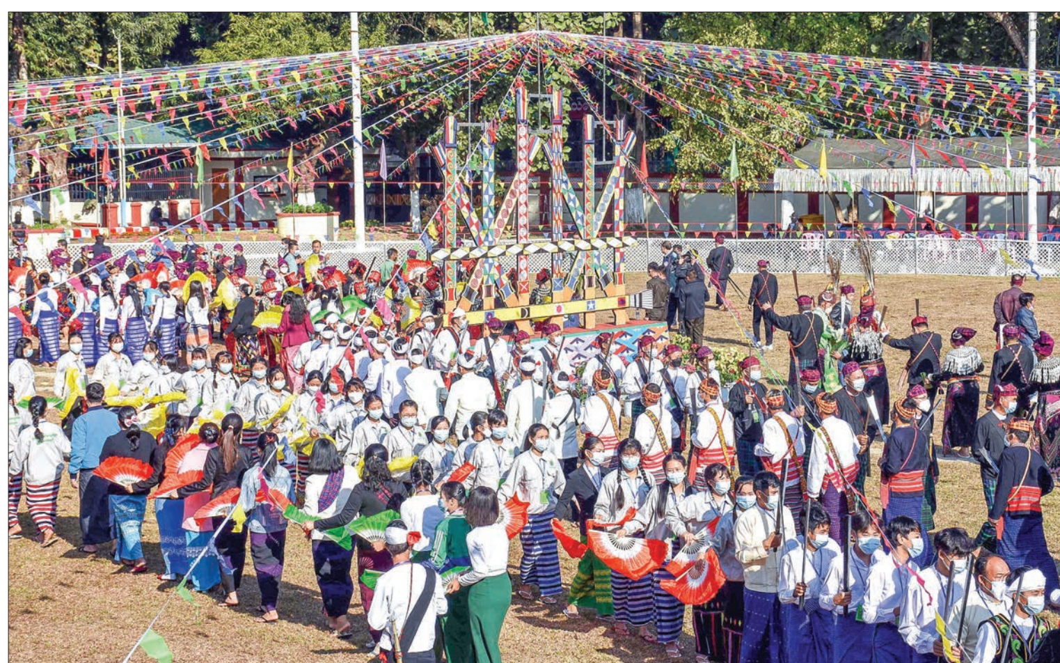
The Kachin traditional Manaw festival in action to commemorate the 74th Kachin State Day in Myitkyina on 10 January 2022.