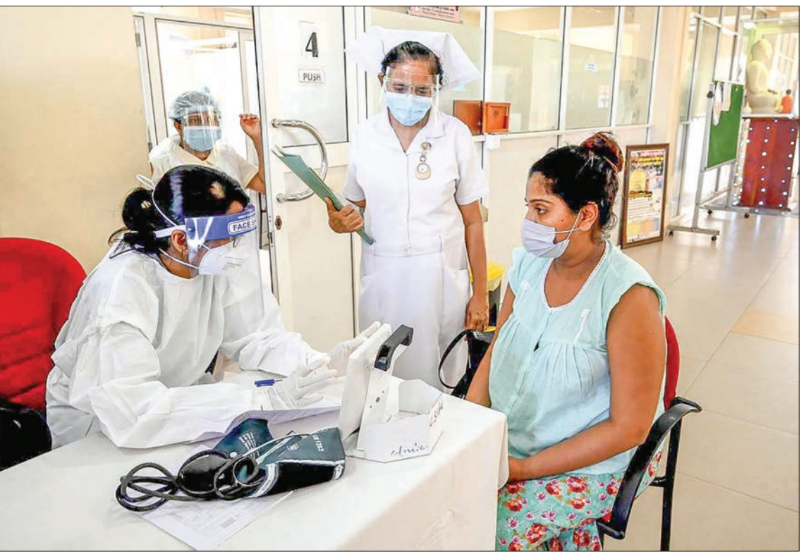
A pregnant woman registers to receive a dose of the Chinese-made Sinopharm Covid-19 coronavirus vaccine in Colombo on 9 September 2021.

A Yale co-led study, which looked at more than 40,000 pregnant individuals, adds new evidence supporting