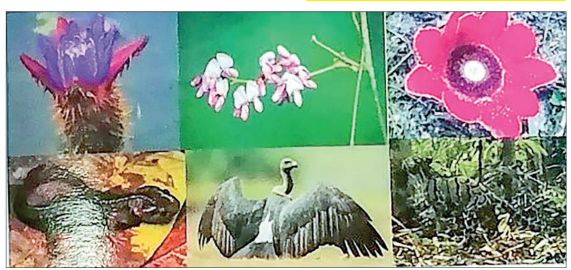
Thriving with nature—rich biodiversity at the Indawgyi Wildlife Sanctuary.