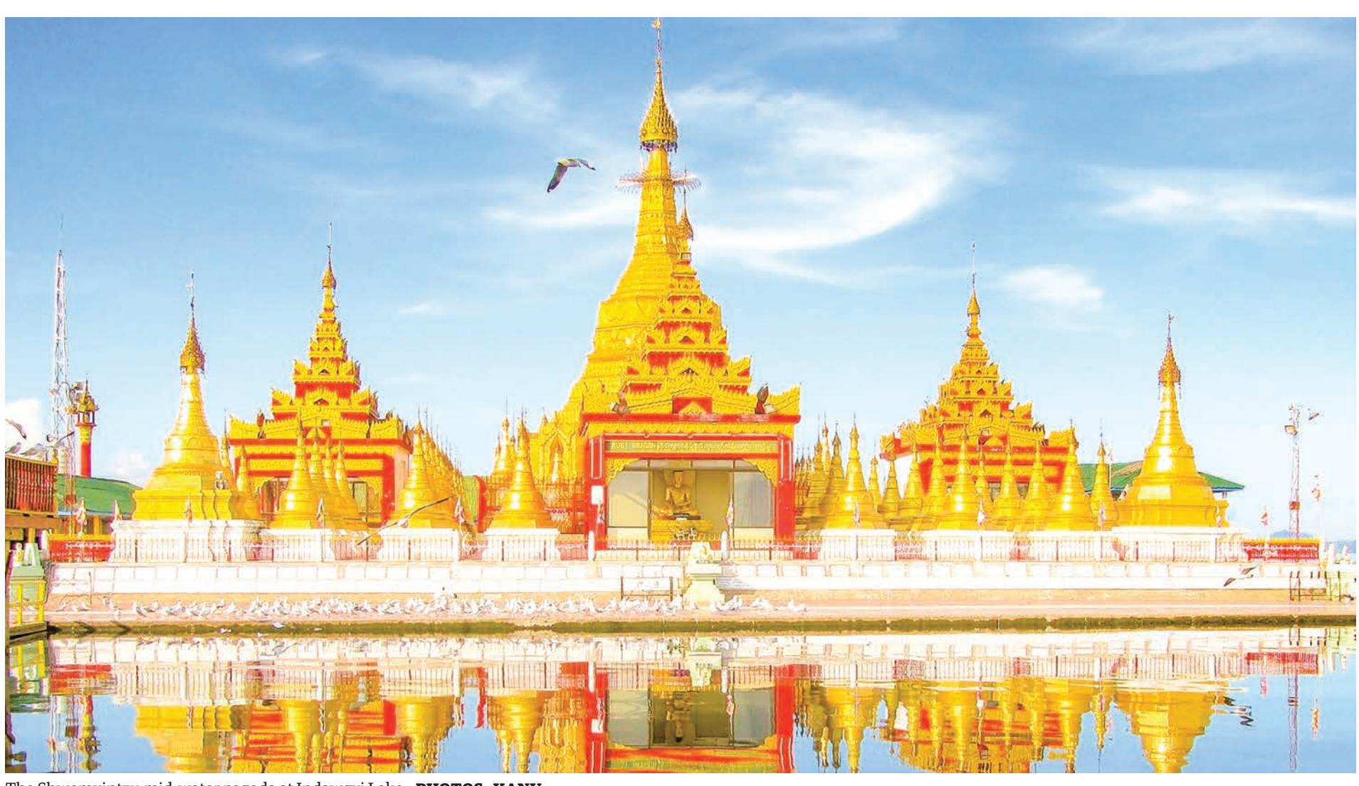
The Shwemyintzu mid-water pagoda at Indawgyi Lake.

TOURISM 11 JANUARY 2022 THE GLOBAL NEW LIGHT OF MYANMAR