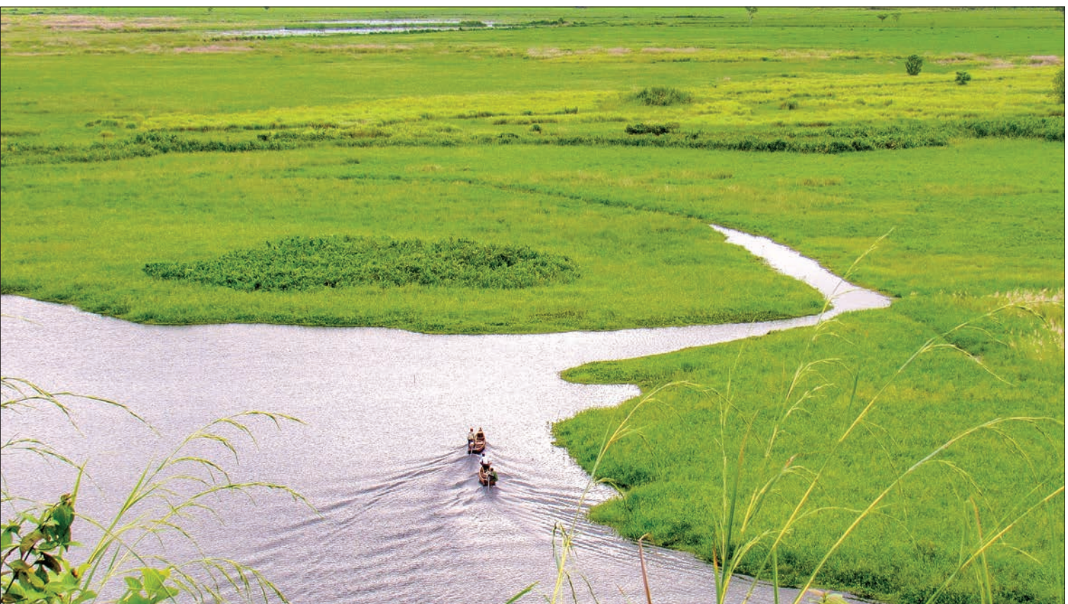
Indawgyi Lake – Ramsar Wetland Site No.2256 and Biosphere Reserve – is the habitat for migratary birds as well as local flora and fauna.

The tourism recovery plan is halted amidst the concerns of the Omicron variant. Yet, some countries reopened tourism with safety and precautionary measures. The most visited countries are Canada, the US, India, Ireland, Italy, Brazil, China, South Africa, New Zealand and Switzerland. Myanmar along with neighbouring India