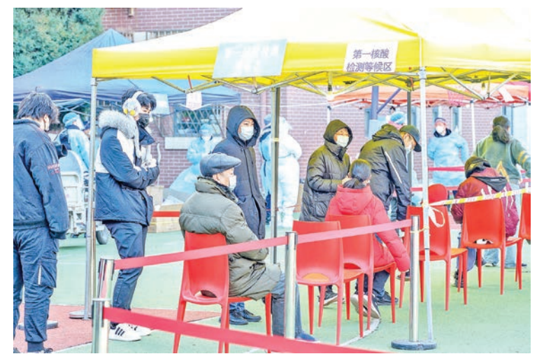
Residents queue to undergo nucleic acid tests for the Covid-19 coronavirus in north China's Tianjin on 10 January, 2022.