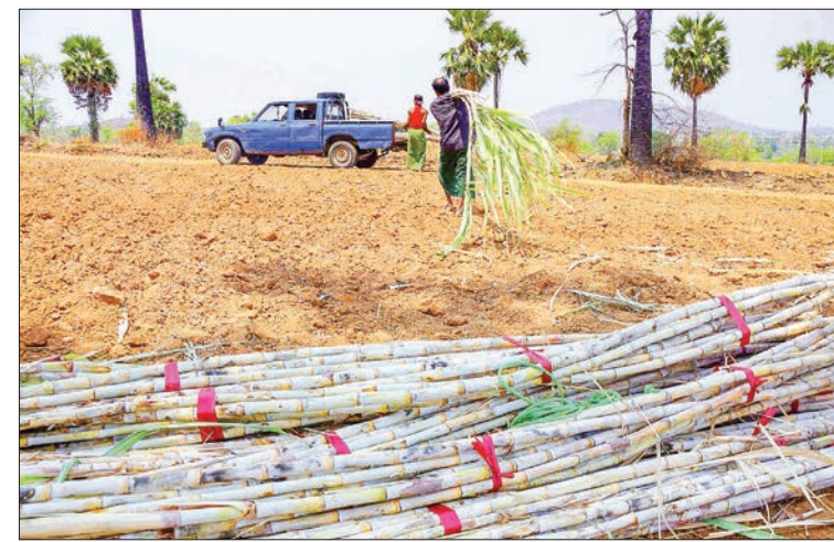
The department has completed more than 20,000 acres of sugarcane plantations in Mandalay and PyinOoLwin districts and over 4,000 have been harvested. That harvested sugarcane was delivered directly to Great Wall and Maunggon sugar mills in the region.

The sugarcane sowing acreages accounted for 240 in Patheingyi, 1,858 in Madaya, 7,465 in Singu, 5,216 in Thabeikkyin and 10,446 in Tagaung, totalling 25,225 acres in two districts. A total of 18 high-yielding sugarcane varieties and local origins has been cultivated in the region. — Min Htet Aung (Mandalay Sub-Printing House)/GNLM