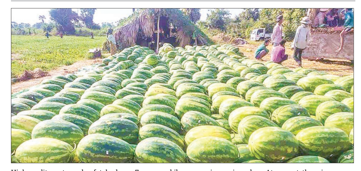
High-quality watermelon fetched over 7 yuan per kilogramme in previous days. At present, the price drastically dropped to below 5 yuan per kilogramme. Additionally, deterioration in fruit quality does not even cover the transport cost to China.

THE price of Myanmar's watermelon sent to China dropped again in recent days, Sai Khin Maung of the Khwanyo Trading Company said.