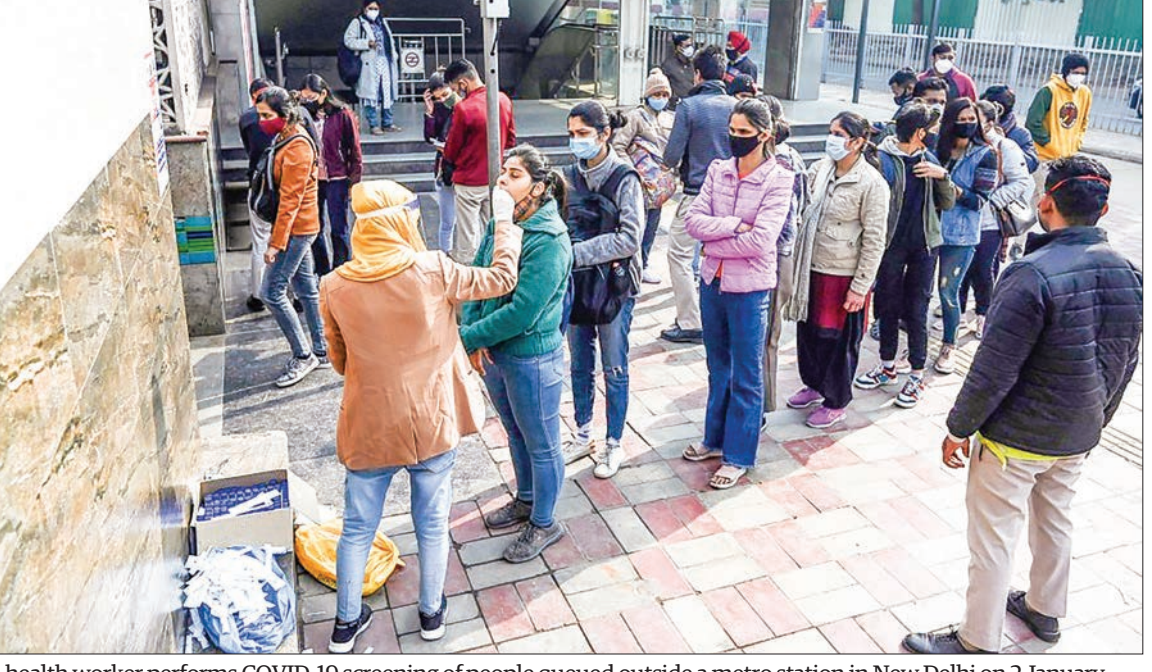
A health worker performs COVID-19 screening of people queued outside a metro station in New Delhi on 2 January

But local officials have watched the sharply rising case