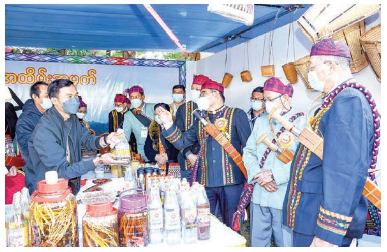
The SAC members and Union ministers, Northern Command Commander and party observe the exhibition booths at the event.

awards to 16, third awards to 22; second awards for Excellence in Business to five, third award to one; first awards for Excellence in Social Activities to six, second awards to 11 and third awards to nine.