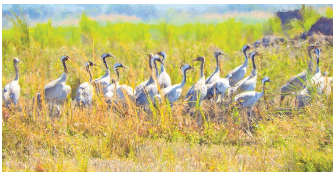
One of the threatened species – black-necked storks are seen at Indawgyi Lake.

The visitors can join bird-watching boat tours, trekking and hiking activities. They can also study the traditional