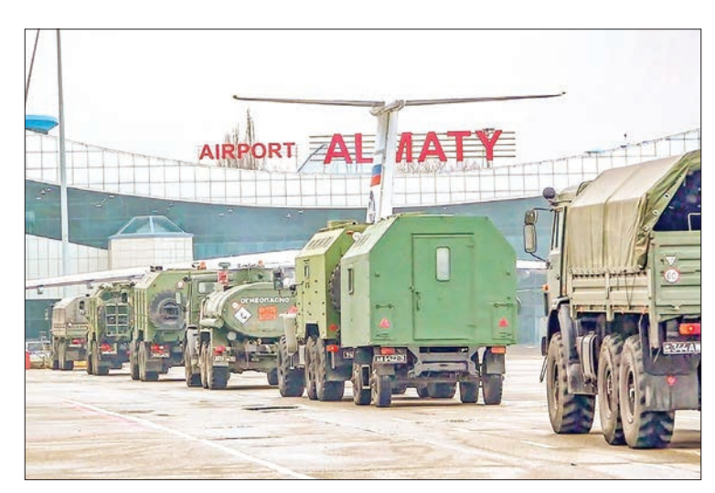
Russian military vehicles cross an airfield in Almaty.

Almaty, the country's main city and former capital, had