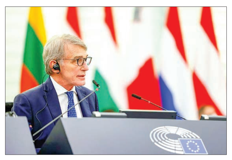
European Parliament President David Sassoli, who died Tuesday, was a former Italian television journalist who turned to politics in 2009.

ble again Monday morning but connections were far from stable.