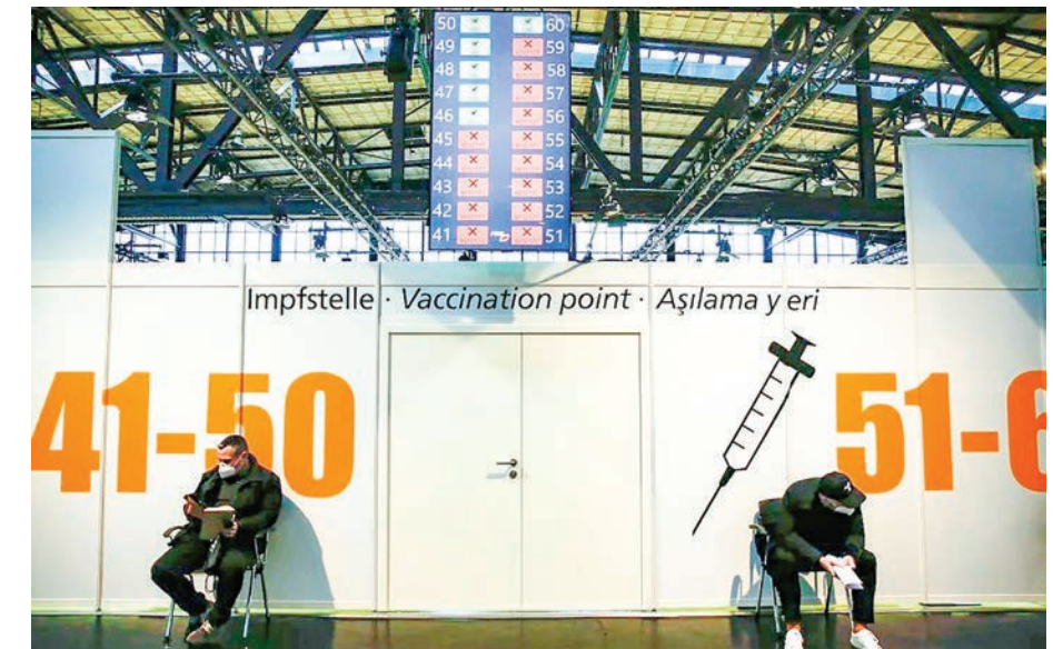
Two men wait for their vaccinations at Treptow Arena's vaccine center in Berlin, on 27 December 2020.

"We are discussing with public health leaders around the world to decide what we think is the best strategy for a potential booster for the fall of 2022," Bancel told the network. "We need to be careful to try to stay ahead of a virus and not behind the