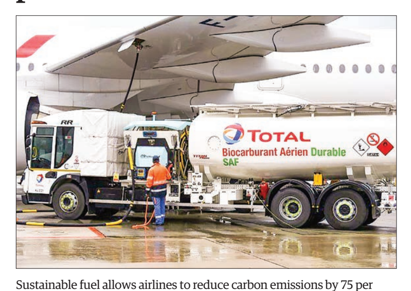
cent compared with kerosene.

AIR France-KLM said Monday it would add a surcharge of up to 12 euros ($13,50) on its tickets to try to offset the cost of using more expensive sustainable aviation fuel.