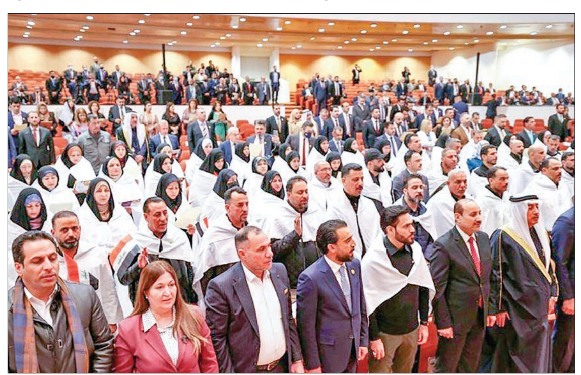
Iraqi lawmakers attend the inaugural session of parliament — analysts warn there are still several hard steps ahead before the formation of a new government.

THREE tense months after legislative elections, Iraq's parliament has finally held its inaugural session — but opening debates swiftly descended into furious arguments between Shiite factions.