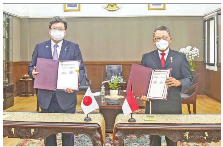
Japan's industry minister Koichi Hagiuda (L) and Indonesian energy minister Arifin Tasrif sign a memorandum on cooperation over power generation on 10 January 2022, in Jakarta.

Hagiuda asked that Indonesia understand the need to resolve the issue, saying Japanese companies have been bewildered by the ban. He also referred to a