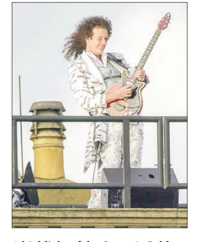
A highlight of the Queen's Golden Jubilee in 2002 saw Queen guitarist Brian May play on the top of Buckingham Palace.

The newly-elected members of parliament met for a swearing-in ceremony and to elect their speaker, but debate soon turned ugly. Videos filmed by MPs showing lawmakers becoming verbally aggressive with each other, highlighting divisions between Shiite groupings. Iraq's post-election period has been marred by high tensions, violence and allegations of vote fraud. One of parliament's first tasks must be to elect the country's president, who will then name a prime minister tasked with forming a new government.—AFP■