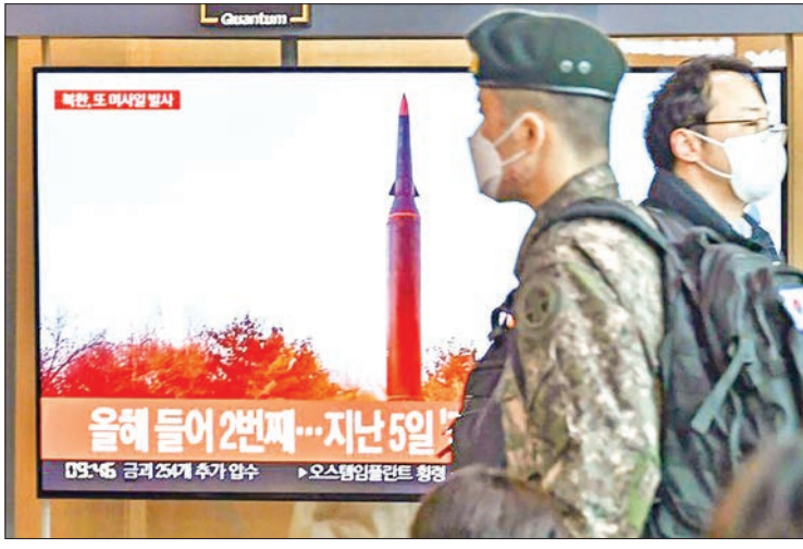
North Korea has launched its second suspected ballistic missile in a week.

in a week came after six countries, including the United States and Japan, urged North Korea Monday to cease "destabilizing actions" ahead of a UN Security Council closed-door meeting. France, Britain, Ireland and Albania joined the call for North Korea to "engage in meaningful dialogue towards our shared goal of complete denuclearization".—AFP ■