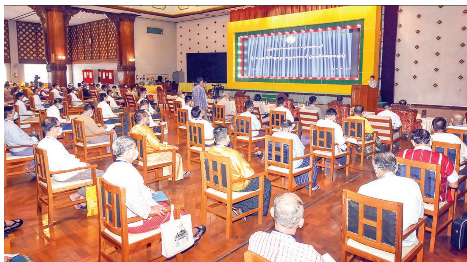
The Union Election Commission meets the representatives of political parties in Yangon on 5 November 2021.