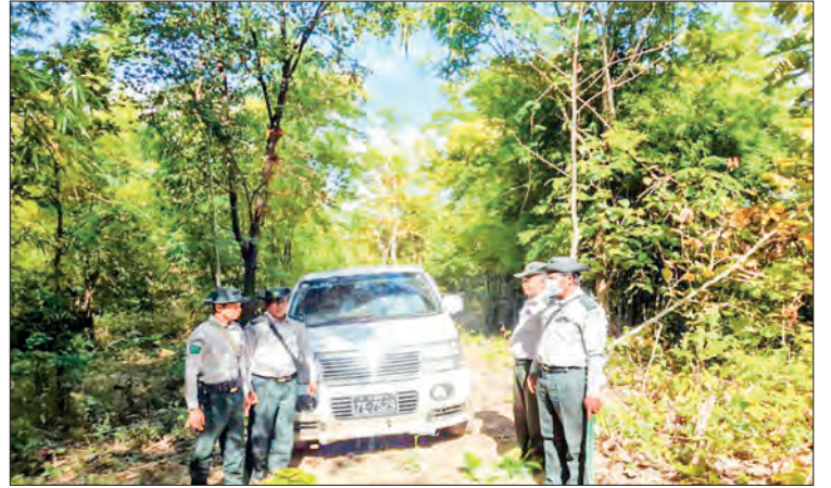
In Bago Region on 13 January.