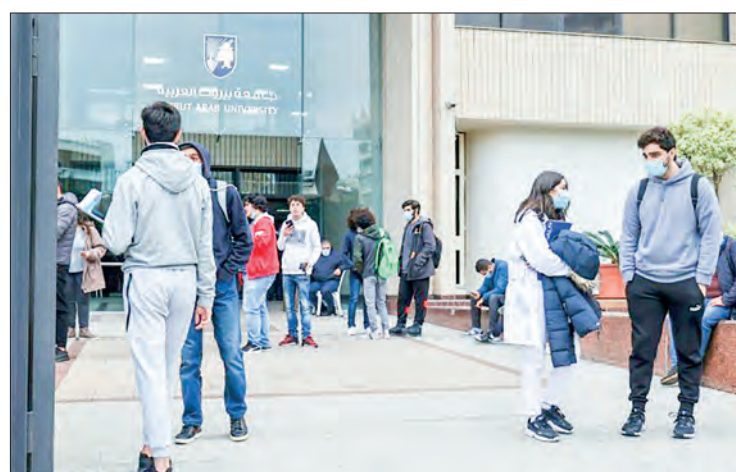
University students arrive at their campus in the Tariq al-Jdideh neighbourhood of Lebanon's capital Beirut -- for many others the expense of getting to class means in-person learning is out of reach.