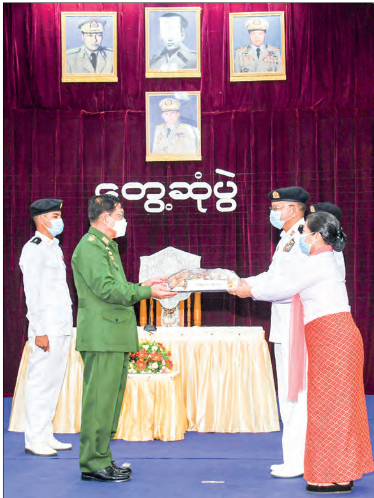
The Senior General gives foodstuffs for officers, other ranks and families.

The Tatmadaw arranges welfare for the Tatmadaw members for their conveni-