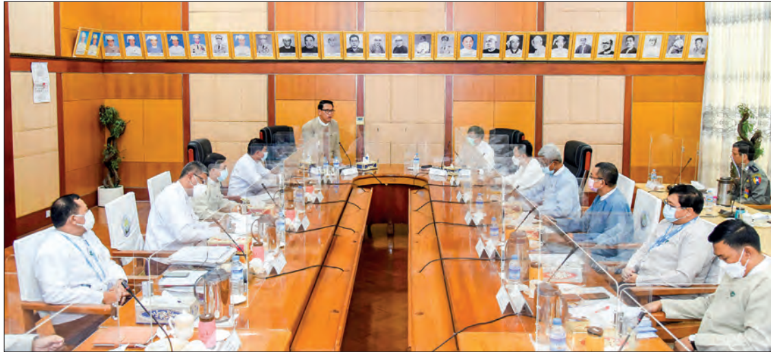
The coordination meeting on Youth and Literature Festival to mark Diamond Jubilee Union Day in progress.

First and foremost, Union Minister U Maung Maung Ohn, the chairman of the committee, stated that the festival was earlier scheduled to be held