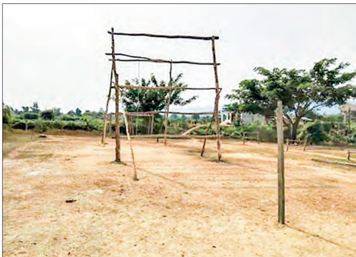
The camp of PDF terrorists.