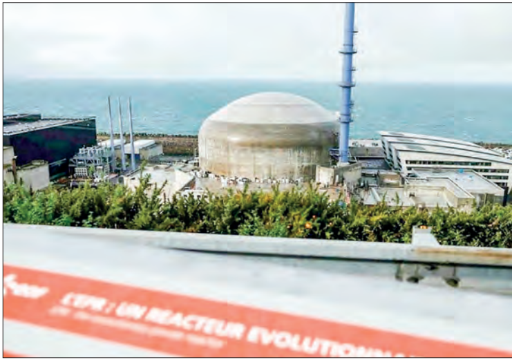
The French government is banking on new nuclear plants to hit its targets for reducing carbon dioxide emissions.