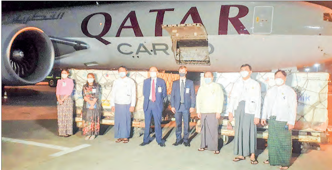
The Russian Ambassador, the MoH Union Minister and officials receive the Sputnik Light vaccines.

THE Ministry of Health received a total of 400,000 doses of Sputnik Light COVID-19 vaccines donated by the Russian Federation at Yangon International Airport yesterday evening.