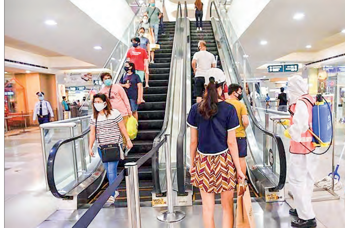
Lockdowns and other measures have shattered the Philippine economy and thrown millions out of work.

World Bank President David Malpass worries about the “huge toll” the pandemic is inflicting on people in poor countries, which