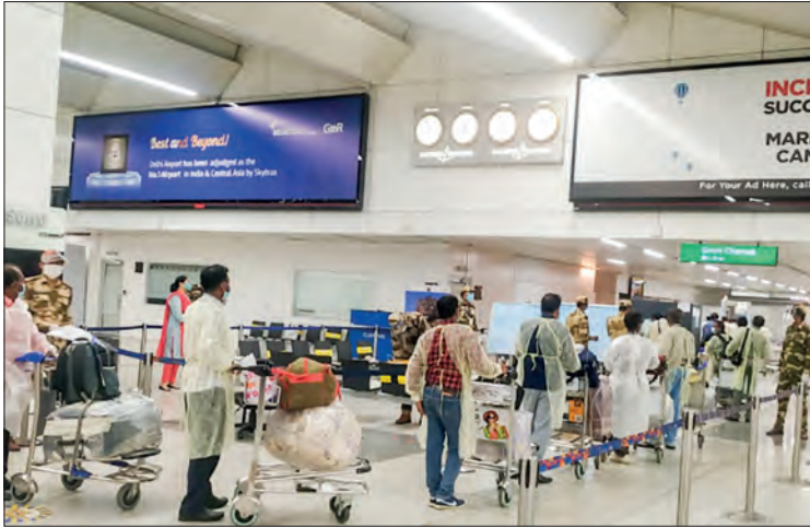
The International Civil Aviation Organization says preliminary data shows the number of air passengers was down by 49% last year from pre-pandemic levels in 2019. Passengers queue at Delhi Airport on 13 January 2022.

AIRLINE ticket sales have fallen sharply since the end of 2021, the International Air Transport Association (IATA) said Wednesday, blaming governments for having “over-reacted” to the Omicron Covid variant by closing borders.