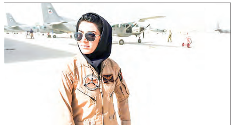
Nearly 150 US-trained Afghan military pilots have sought refuge in Tajikistan since the Taliban seized Kabul in August. Afghanistan's first female pilot, Niloofar Rahmani, poses for a photograph at an Air Force airfield in Kabul in April 2015

A number of Russian-made helicopters that were inactive due to technical problems have been repaired by the Islamic Emirate and were showcased on Tuesday. "Our future air force will be dependent on no country," the acting defence minister said,