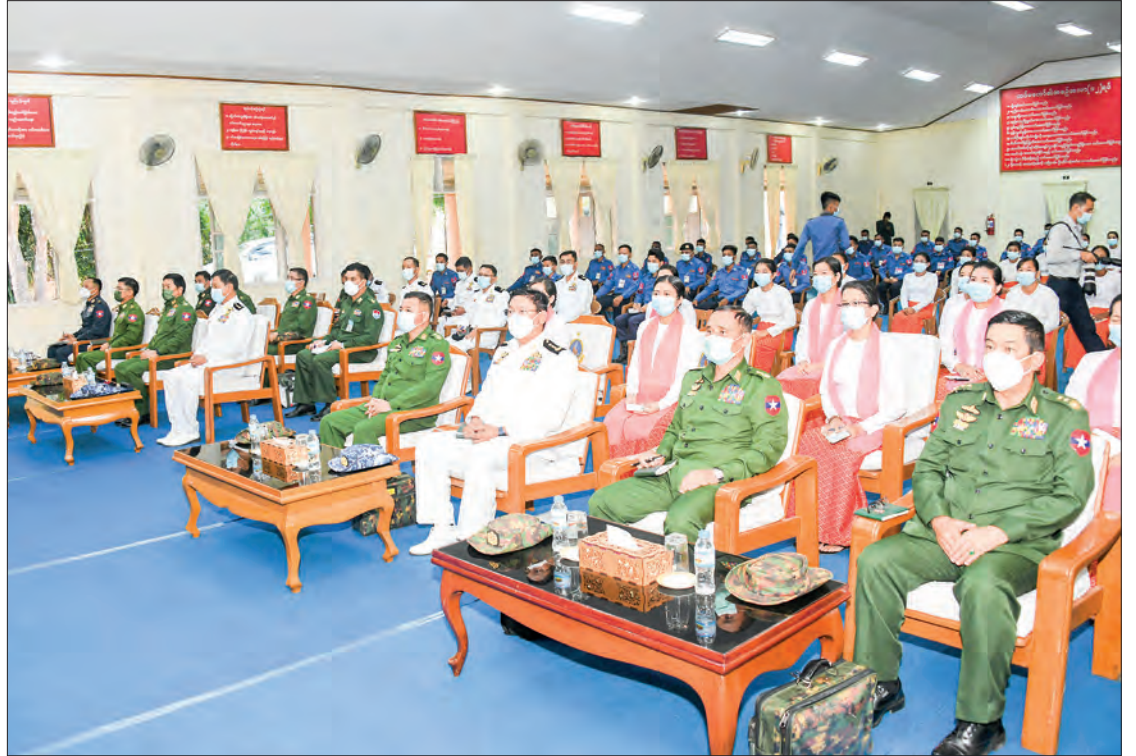
State Administration Council Chairman Commander-in-Chief of Defence Services Senior General Min Aung Hlaing addresses the meeting with officers, other ranks and families at the Coastal Region Command Headquarters and the Mawrawady Naval Region Command Headquarters yesterday.

ALL the Tatmadaw members need to read literature and encourage offspring to improve their education qualification, said State Administration Council Chairman Commander-in-Chief of Defence Services Senior General Min Aung Hlaing in meeting with officers, other ranks and families at the Coastal Region Command Headquarters and the Mawrawady Naval Region Command Headquarters yesterday afternoon.