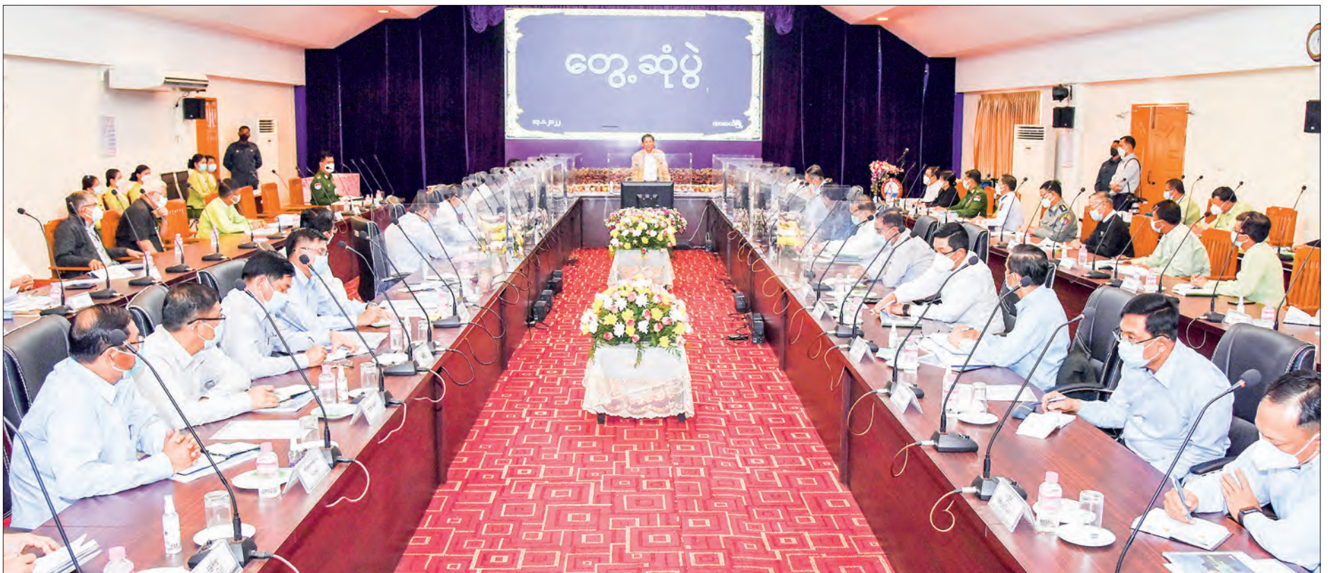
State Administration Council Chairman Prime Minister Senior General Min Aung Hlaing meets the cabinet members of Taninthayi Region government at the latter office in Dawei on 13 January 2022.

TANINTHAYI Region endowed with plentiful of natural resources as sound foundations has good potentials for the future, said State Administration Council Chairman Prime Minister Senior General Min Aung Hlaing in meeting with cabinet members of Taninthayi Region government, departmental officials and town elders at the hall of the regional government office in Dawei yesterday morning.