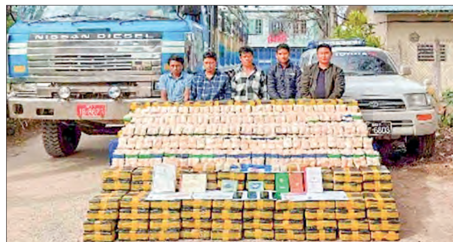
Arrestees along with seized drugs and vehicles.

Police have filed charges against them under the Anti-Narcotic Drugs and Psychotropic Substances Laws and are still investigating the perpetrators from chain crimes, it is learnt. —MNA