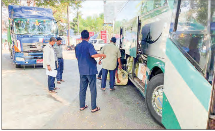
In Mon State on 12 January.