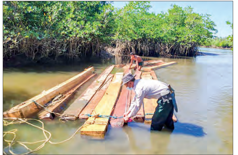
In Ayeyawady Region on 12 January.