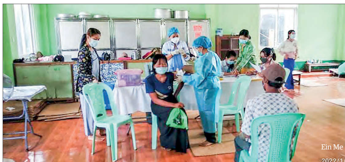
Ein Me 2022/1/1