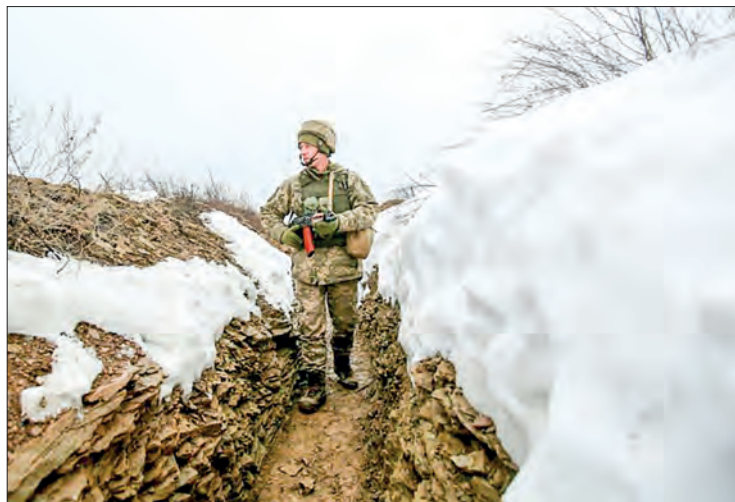
Diplomatic efforts are under way to try and defuse the mounting crisis on Ukraine's border with Russia.

But Moscow insists the military deployment is a response to what it sees as the growing presence of NATO in its sphere of influence, where it fiercely opposes the expansion of the Atlantic