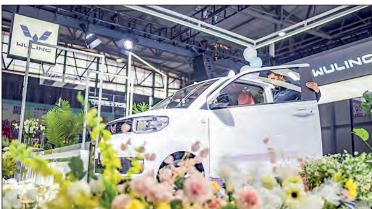
A visitor looks at a new energy vehicle (NEV) during a promotional activity for NEVs in rural areas held in Kunming, southwest China’s Yunnan Province, 4 Dec 2020.

CHINA ranked first globally in terms of the sales of new energy vehicles (NEVs) for a seventh straight year in 2021, despite economic uncertainties and supply-chain pressure, official data showed Wednesday.