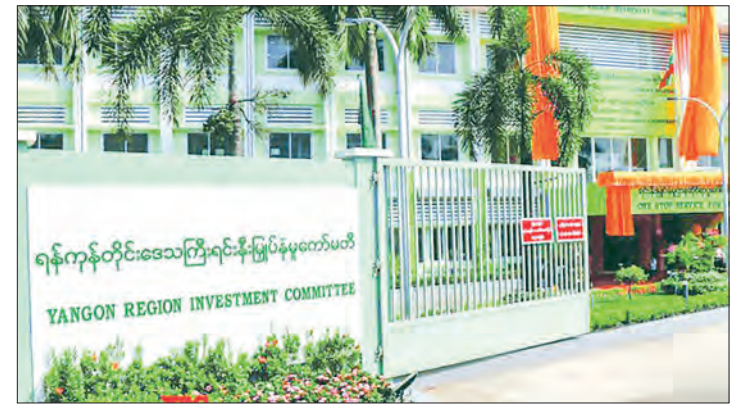
Yangon Region Investment Committee Office.

YANGON Region Investment Committee (YRIC) endorsed eight foreign enterprises and two domestic projects made by Myanmar citizens in the manufacturing sector, with an estimated capital of US$15 million and K2.39 billion, according to the YRIC's videoconferencing convened at the YRIC office on 12 January.