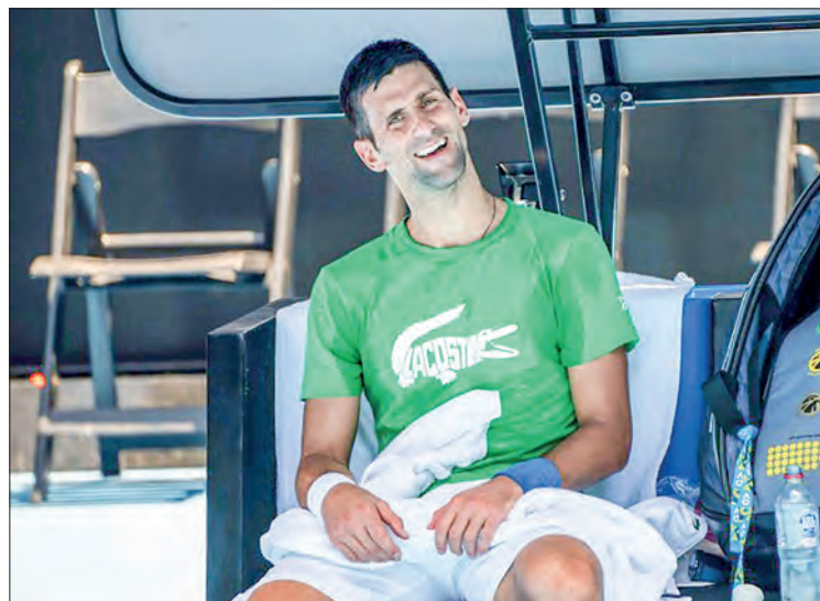
Novak Djokovic practising at Melbourne Park.

On the women's side, top seed and world number one Ashleigh Barty, who won the Adelaide International last week, will meet a qualifier first up as she targets a maiden Grand Slam title on home soil.—AFP ■