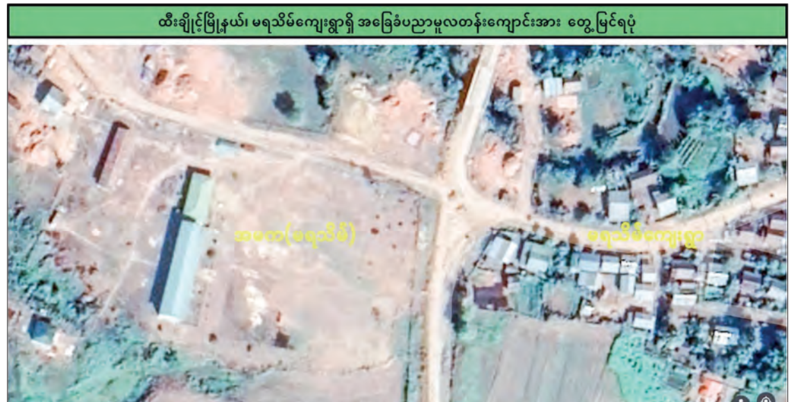
The primary school in Marathein in Htigyaing Township.

It is reported that the terrorists set up sandbags, mines around the school fence inside/outside the school and the school has been fortified with the construction of terrorist training camps and sandbag bunkers. Arms, including seven percussion lock arms, two homemade guns, 21 homemade launcher rockets, seven homemade mines, 32 training rifles,