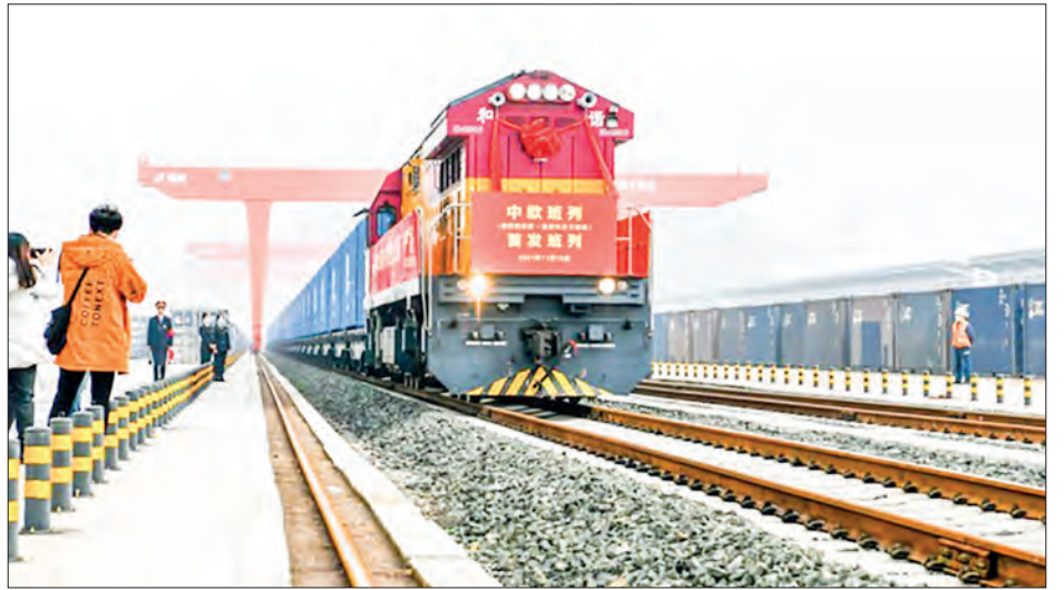
A new cargo train carrying 50 goods containers departed Wednesday from Urad Back Banner, north China's Inner Mongolia Autonomous Region, and is expected to arrive in Moscow in about 10 days.