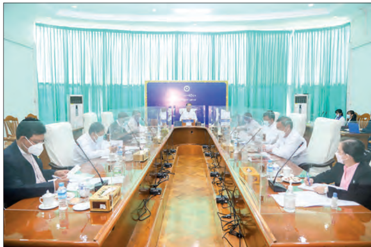
The National Committee on Child Labour Eradication hold its 4 th coord meeting yesterday.

THE fourth coordination meeting with a group of secretaries for the National Committee on the Elimination of Child Labour was convened on 13 January at the meeting hall of the Ministry of Labour in Nay Pyi Taw.