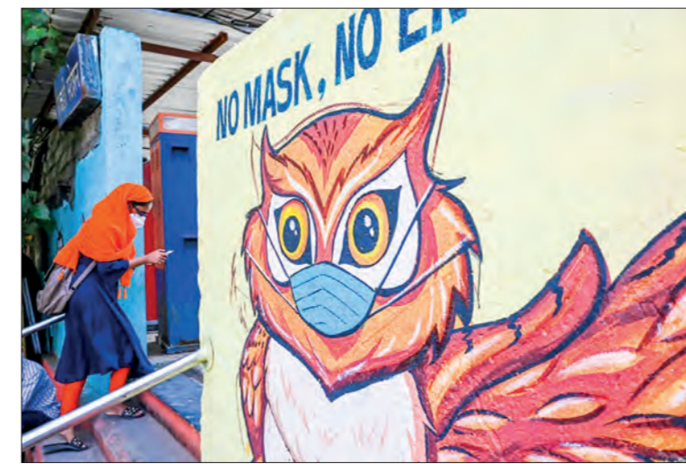
A pedestrian walks past a Covid-19 coronavirus awareness mural reading no mask, no entry in Mumbai.

But WHO emergencies director Michael Ryan said: “This is not the time to declare this is a