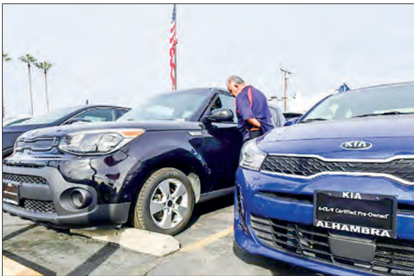
A shortage of computer chips has stalled auto manufacturing, driving a price increase for used vehicles.

data Wednesday showed US consumer prices surged seven per cent last year, the biggest increase in nearly four decades, fuelled in large part by the dizzying 37.3 per cent jump in prices of used cars and trucks. Given the struggles to get semiconductors from factories in Asia amid the pandemic that has limited new car inventories, rental companies have been hanging on to their