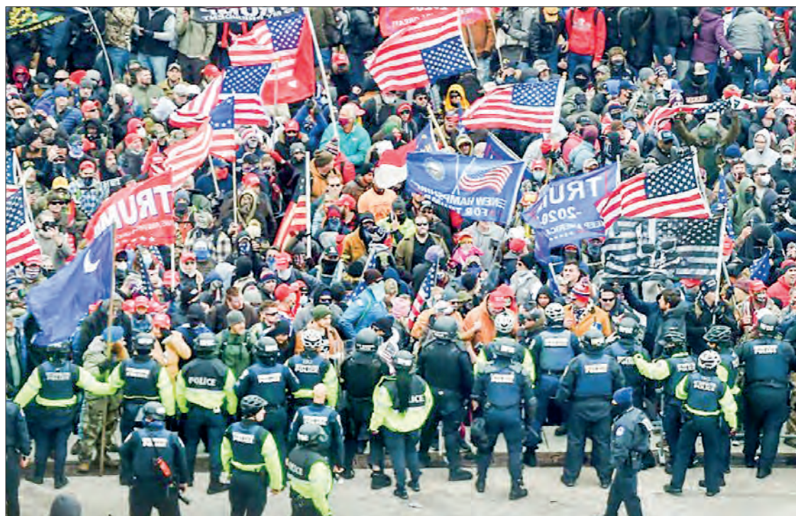
A year after the storming of the US Capitol by Donald Trump supporters, 58 per cent of Americans believe the country's democracy is in danger of collapse, according to a Quinnipiac poll.

ONE year after the storming of the US Capitol by supporters of Donald Trump, six out of 10