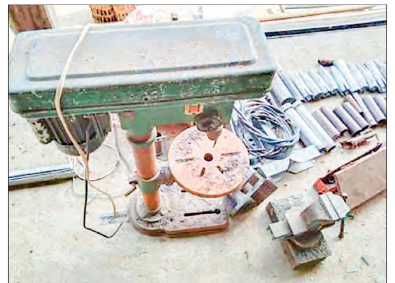
Seized arms and ammunition and explosives.