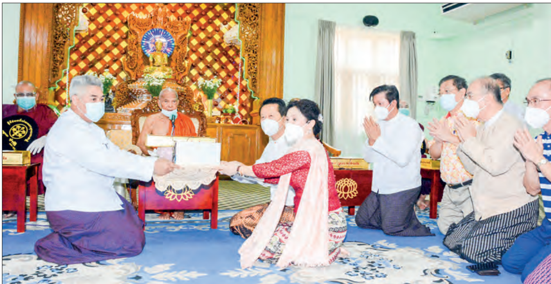
The donation of 5,000 units of Sinopharm vaccines is presented to the Bhamo Sayadaw.

A donation ceremony of Sinopharm COVID-19 vaccines to Chairman of the State Sang-