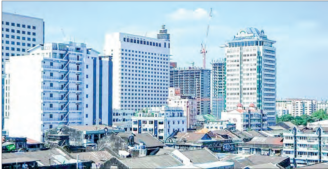
The contract signing ceremony for the construction of the telecommunication tower was launched in the Mingala hall of Yangon region government office on 12 January.

At the meeting, the chief minister delivered a speech that there should be complying with the terms and conditions of the contract, to launch dis-