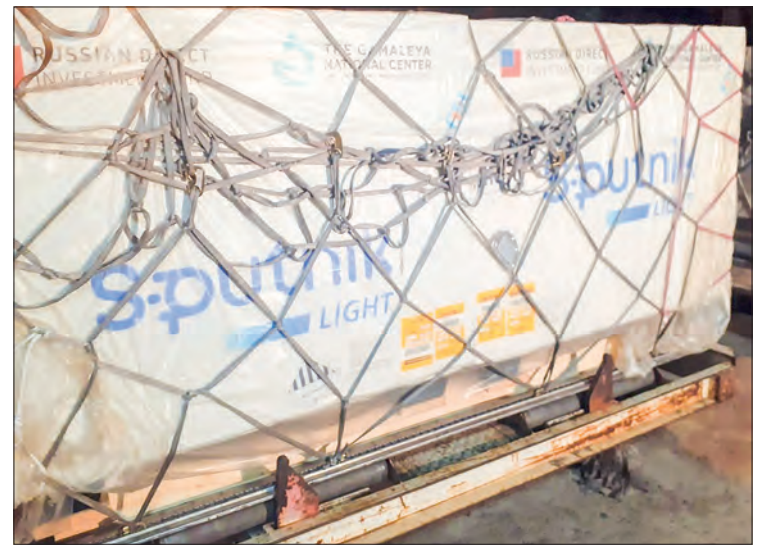
The 400,000 doses of Sputnik Light vaccine arrive in Yangon.

phial can be administered one time only so as to ensure more coverage of vaccination in Myanmar. A total of 400,000 doses of the Sputnik Light vaccine donated by Russia arrived yesterday and a total of 600,000 doses of the Sputnik Light vaccine purchased from Russia will arrive in Myanmar on 16 January, it is learnt. — MNA