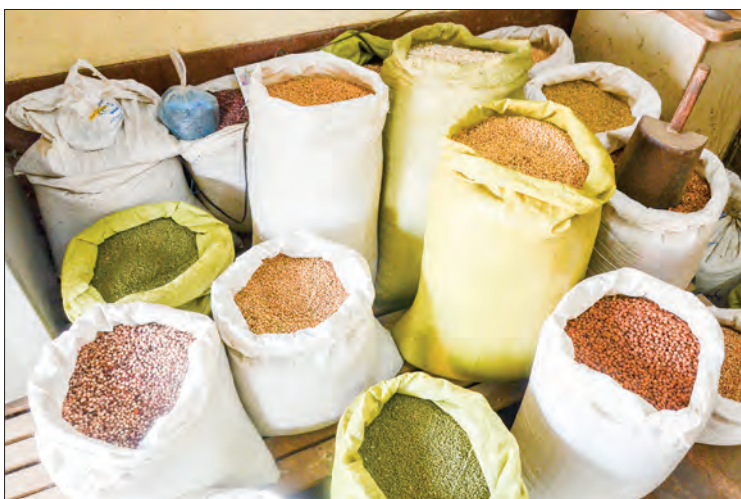
During the October-December 2021 period, the country shipped US$273.56 million worth of 334,612 tonnes of pulses and beans to foreign markets through the sea route, and $18.3 million-valued 19,605 tonnes were sent to the neighbouring countries through land borders.

Myanmar's agriculture sector is the backbone of the country's economy and it contributes to over 30 per cent of Gross Domestic Products. The country primarily cultivates paddy, corn, cotton, sugarcane, various pulses and beans. Its second-largest production is the pulses and beans, counting for 33 per cent of agro products and covering 20 per cent of growing acres. Among them, black beans, pigeon peas and green grams constitute 72 per cent of bean acreage. Other beans, including peanut, chickpea, soybean, black-eyed beans, butter bean and rice bean are also grown in the country. — KK/GNLM