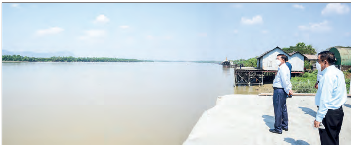
The Senior General inspects the jetty of Myanmar Port Authority.

It is necessary to produce educated human resources who must be well-versed for the development of a country. Lessening of pass rate in the matriculation examination must be based on the lower qualification of students in changing the grades and differences of the matriculation examination and high school examinations. Hence, it is necessary to teach the students to have actual knowledge and education to have better changes of grades.