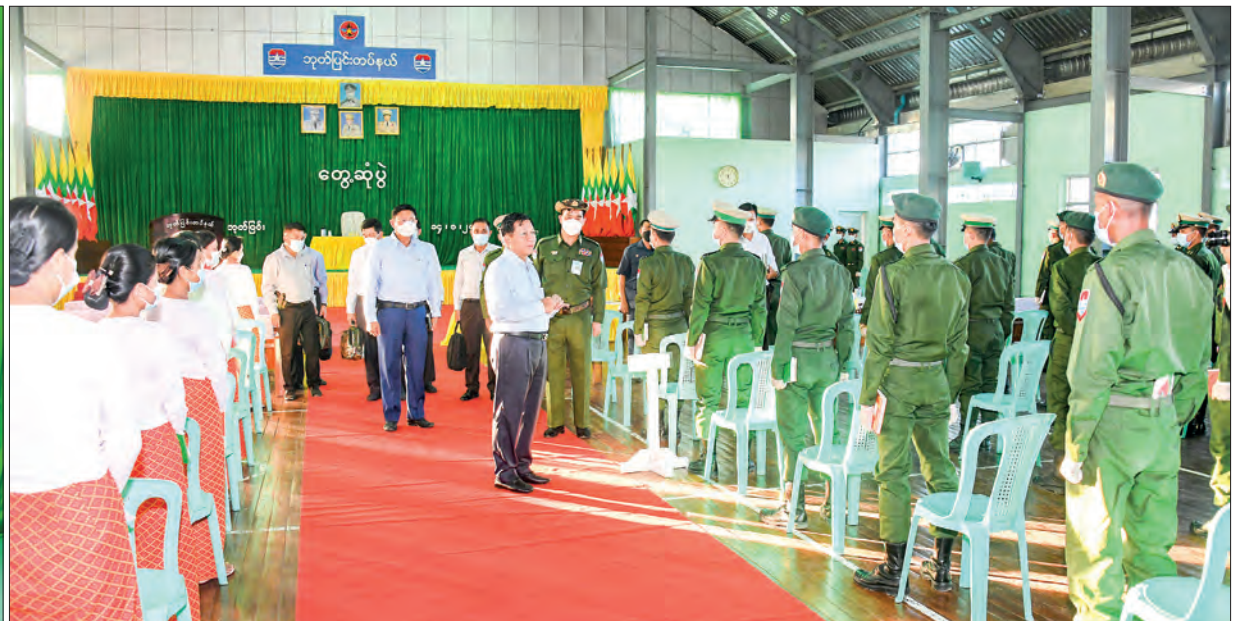
The Senior General warmly talks with officers, other ranks and family members.

duties. Obedience to orders is a good basic need for becoming a good soldier, and they have to abide by the 60 military codes of conduct to be a capable, good soldier. The military discipline means exhortation and prohibition. These are rules and regulations prescribed not to cause inappropriate events and to be soldierly moves. Following the military disciplines can bring