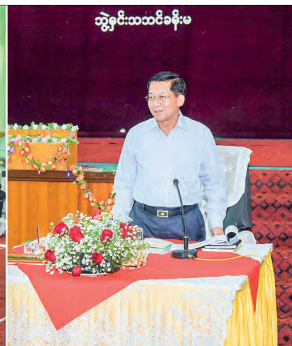
State Administration Council Chairman Prime Minister Senior General Min Aung Hlaing delivers the speech in inspecting the Dawei University on 14 January 2022.

THE university is not only for lecturing academic subjects to the students but also for sharing techniques as well as letting students learn technologies,