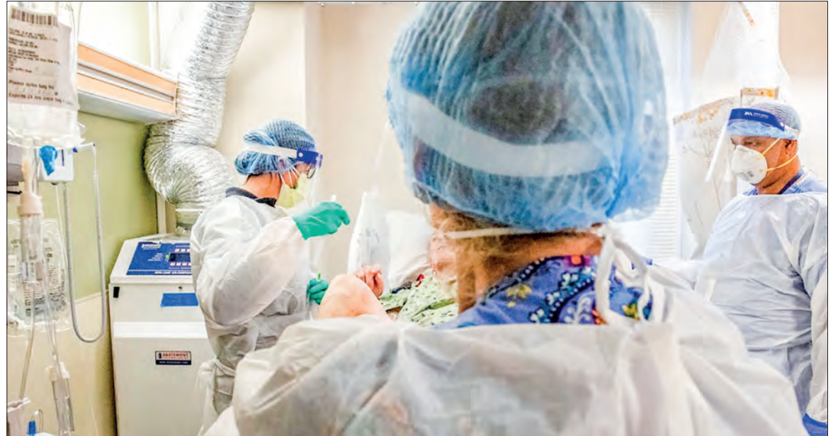
The latest recommended drugs are able to reduce the risk of hospital admission for the most vulnerable patients