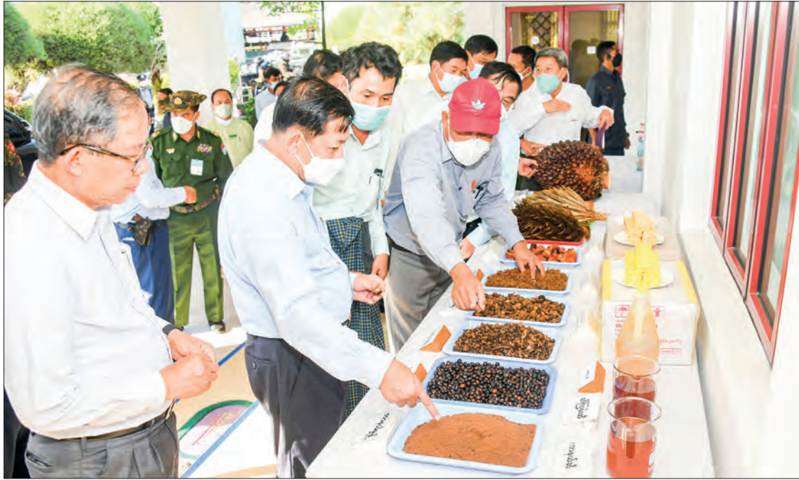
The Senior General looks into the quality control of fruits and production of crude palm oil at Taungdagon oil palm cultivation project.

Union Minister for Agriculture, Livestock and Irrigation U