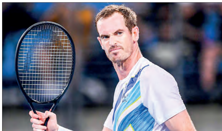
Andy Murray is into his first final since 2019.

He again was exceptional against towering Reilly Opelka at the Sydney Classic, battling through their semi-final 6-7 (6/8), 6-4, 6-4, successfully blunting the American's giant serve. Murray, who has been given a wildcard into next week's Australian Open,