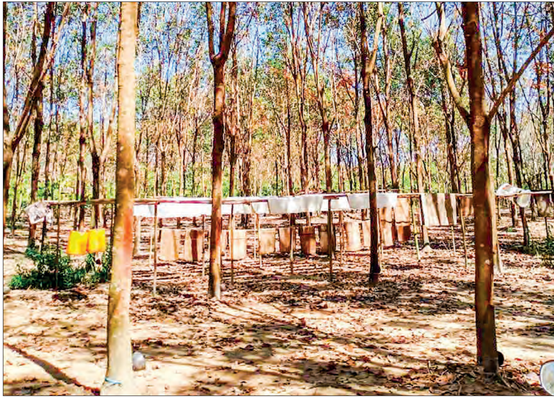
Myanmar's rubber export generated more than US$449 million in income in the financial year 2020-2021.

Yunnan Province which is close to Myanmar's Chinshwehaw border in Shan State gave the