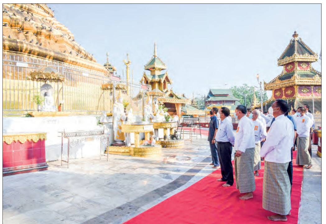
State Administration Council Chairman Prime Minister Senior General pays homage to the Shwetaungsar Pagoda in Dawei on 14 January 2022.