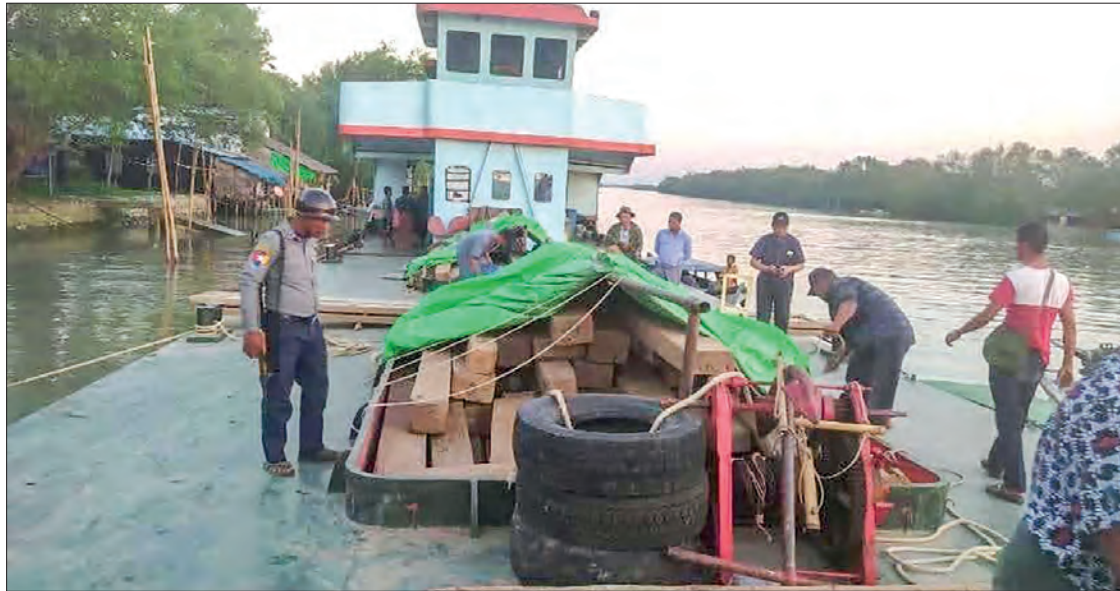
In Ayeyawady on 14 January.

Similarly, another vehicle (Toyota Hi-Ace (estimated value of K13,000,000) carrying 0.6712 tonnes of undocumented teak (estimated value of K2,013,600) was confiscated under the procedures of the Department of Forest near the