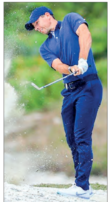
Rory McIlroy won the last of his four major titles in 2014.

He jumped back into the top 10 by claiming his 20th PGA Tour victory at the CJ Cup in October, becoming just the fourth non-American to