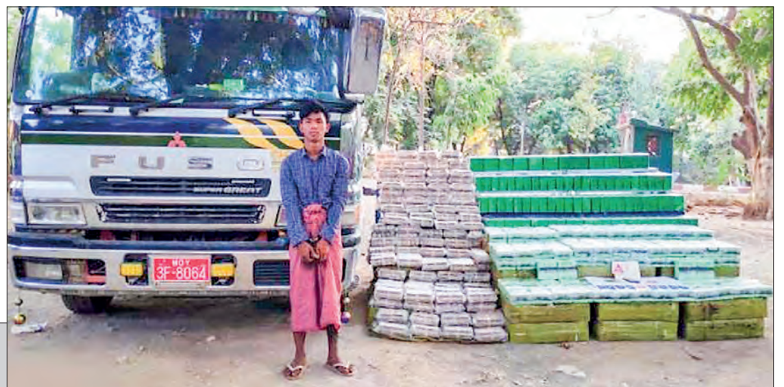
An arrestee along with seized drugs and vehicle.

It is reported that he has been charged under the law and the related suspects are being investigated. — MNA