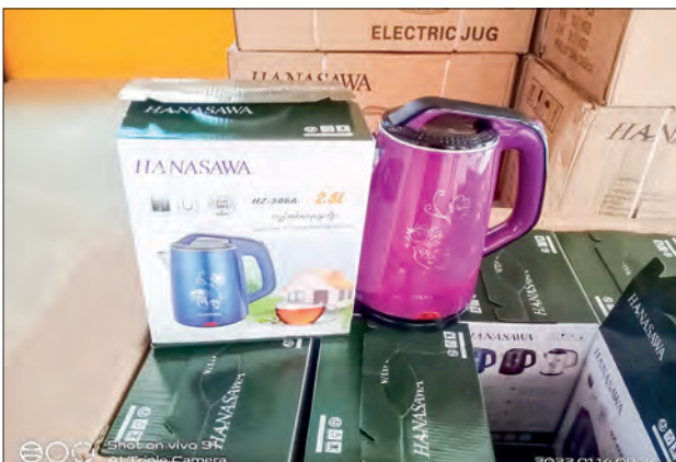
In Bago Region on 14 January.