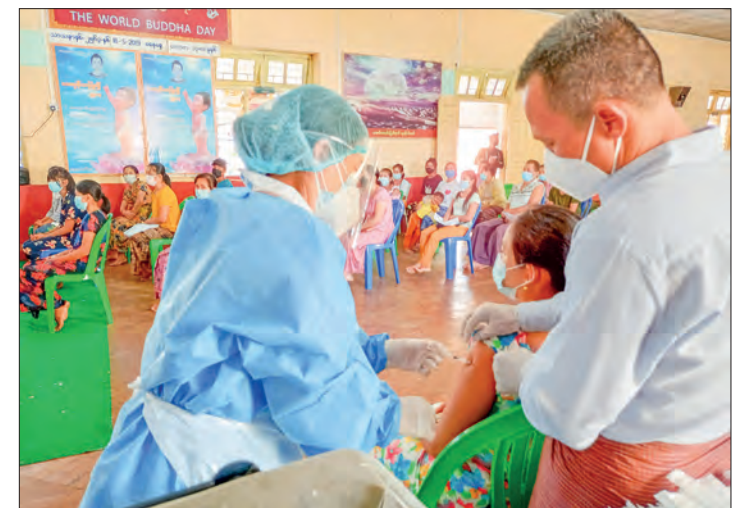
Vaccination drive in Mudon.

A total of 92,233 people has been fully inoculated against COVID-19 in Mudon Township, Mawlamyine District, Mon State as of 13 January, according to the Township Public Health Department.