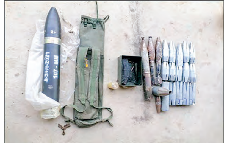
Confiscated 107mm rocket and mortar shells.

A press release has been issued regarding the seizure of bombs and weapons and ammunition, and terrorist equipment, including 107mm rocket launchers from PDF terrorists who were setting up sandbag bunkers, and terrorist training camps to carry out acts of violence at the school in Marathein village, Htigyaing Township, Sagaing Region.