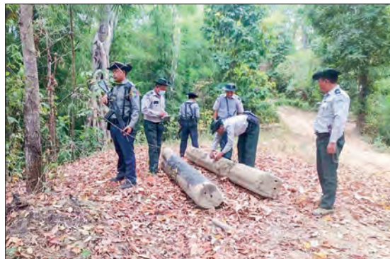
In Bago Region on 14 January.