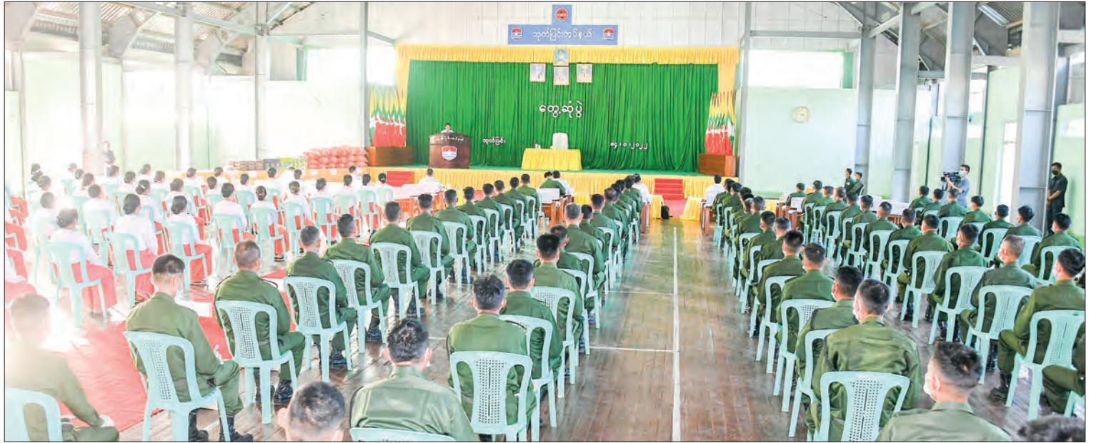
State Administration Council Chairman Commander-in-Chief of Defence Services Senior General Min Aung Hlaing meets officers, other ranks and families at Bokpyin Station yesterday.

Speaking on the occasion, the Senior General said that training must be taken for turning out capable and powerful servicemen and units in discharging the State defence