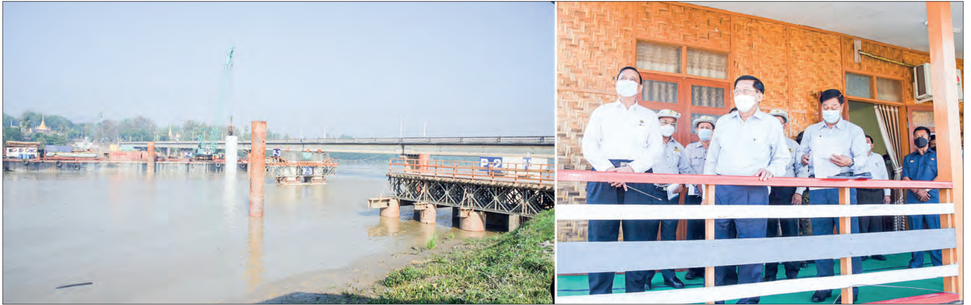
State Administration Council Chairman Prime Minister Senior General Min Aung Hlaing inspects the Kamyawkin Bridge on the Dawei-Kamyawkin-Launglon Road across the Dawei River on 14 January 2022.

CHAIRMAN of the State Administration Council Prime Minister Senior General Min Aung Hlaing inspected the progress of the Kamyawkin Bridge project yesterday morning.