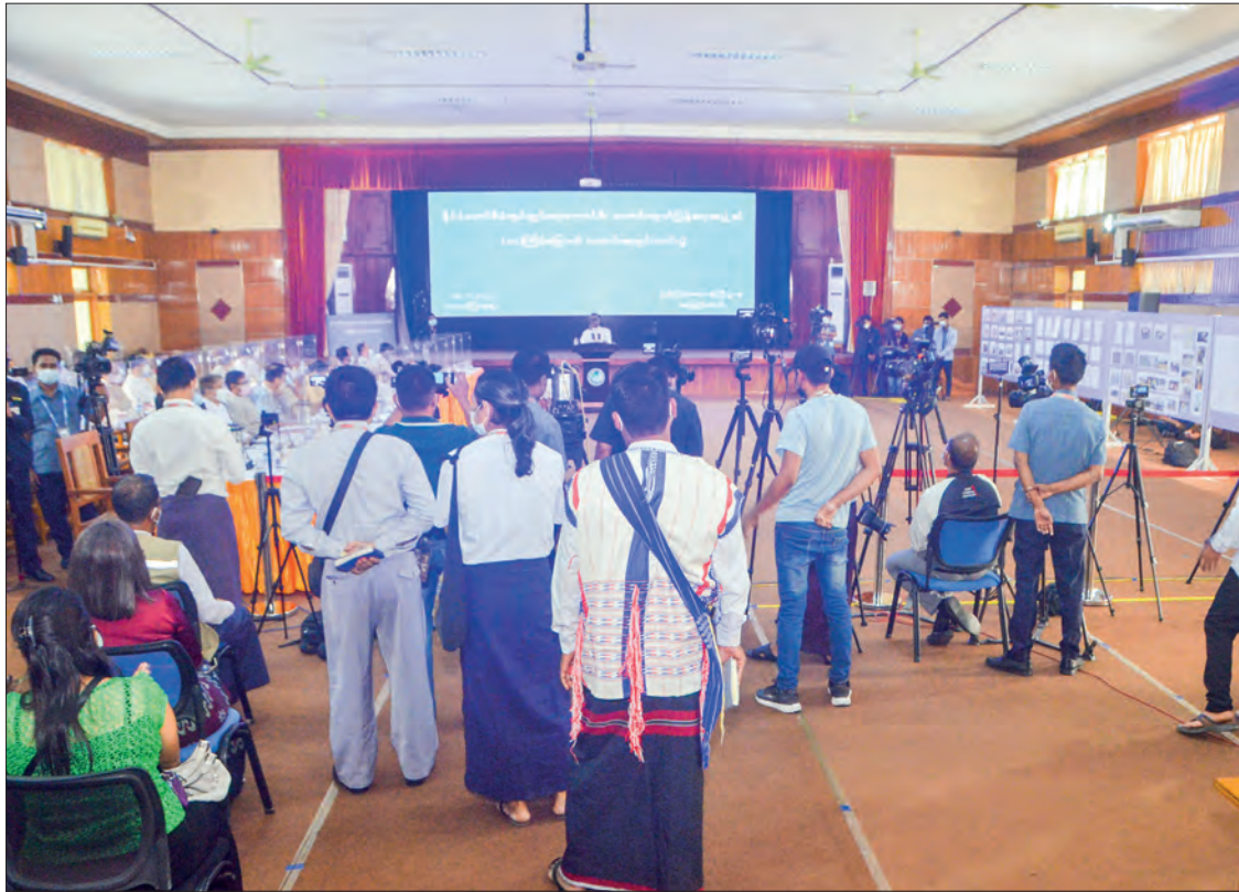
Media personnel are seen attending the 11 th press conference of the SAC Information Team.

First, Maj-Gen Zaw Min Tun widely explained the working visit of Cambodia Prime Minister Samdech Akka Moha Sena Padei Techo Hun Sen to Myanmar on 7 and 8 January, diplomatic relations between Myanmar and Cambodia, discussions and joint statement of two leaders of Myanmar and Cambodia, external factors that can affect Myanmar's relations with the