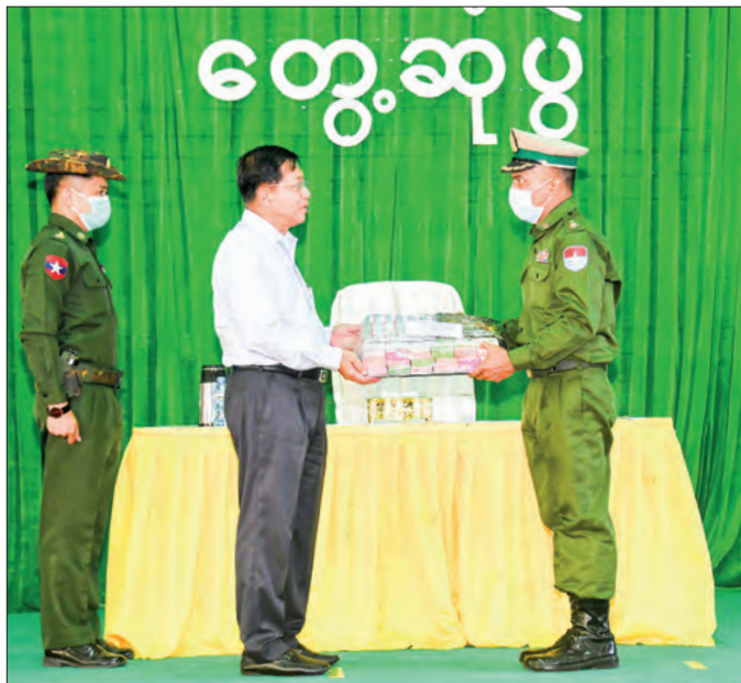
The Senior General gives foodstuffs to servicemen and families.