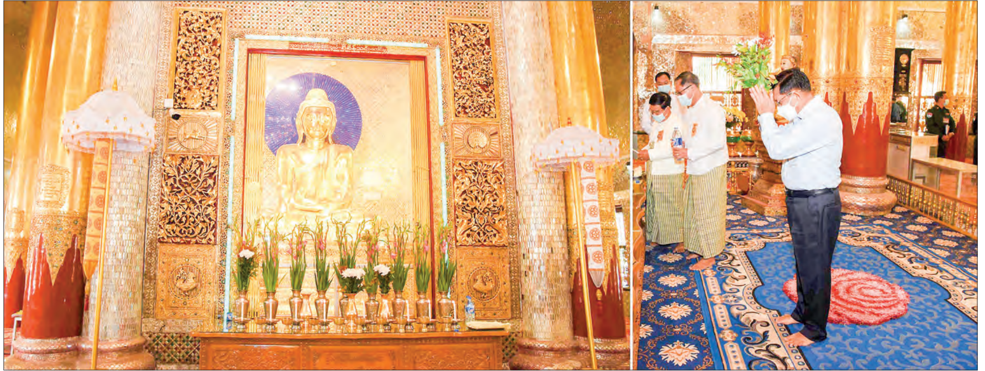
State Administration Council Chairman Prime Minister Senior General Min Aung Hlaing kowtows to the Lawkamarazein Buddha Image in Dawei on 14 January 2022.

CHAIRMAN of the State Administration Council Prime Minister Senior General Min Aung Hlaing yesterday morning paid homage to Lawkamarazein Buddha Image and Shwetaungsar Pagoda in Dawei.