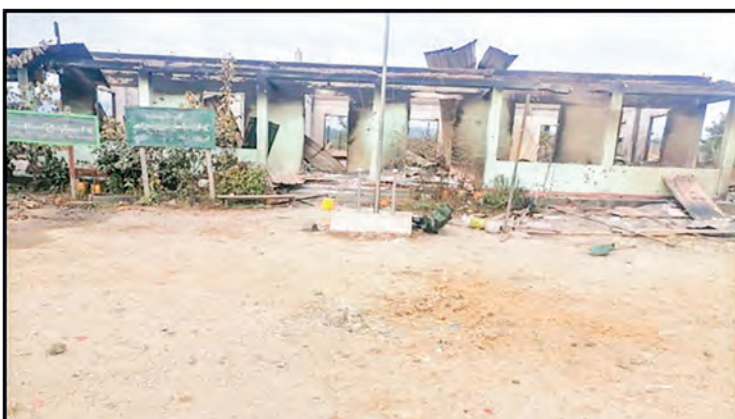
Ravages of school building.

fire to the school to destroy any evidence of their encampment.