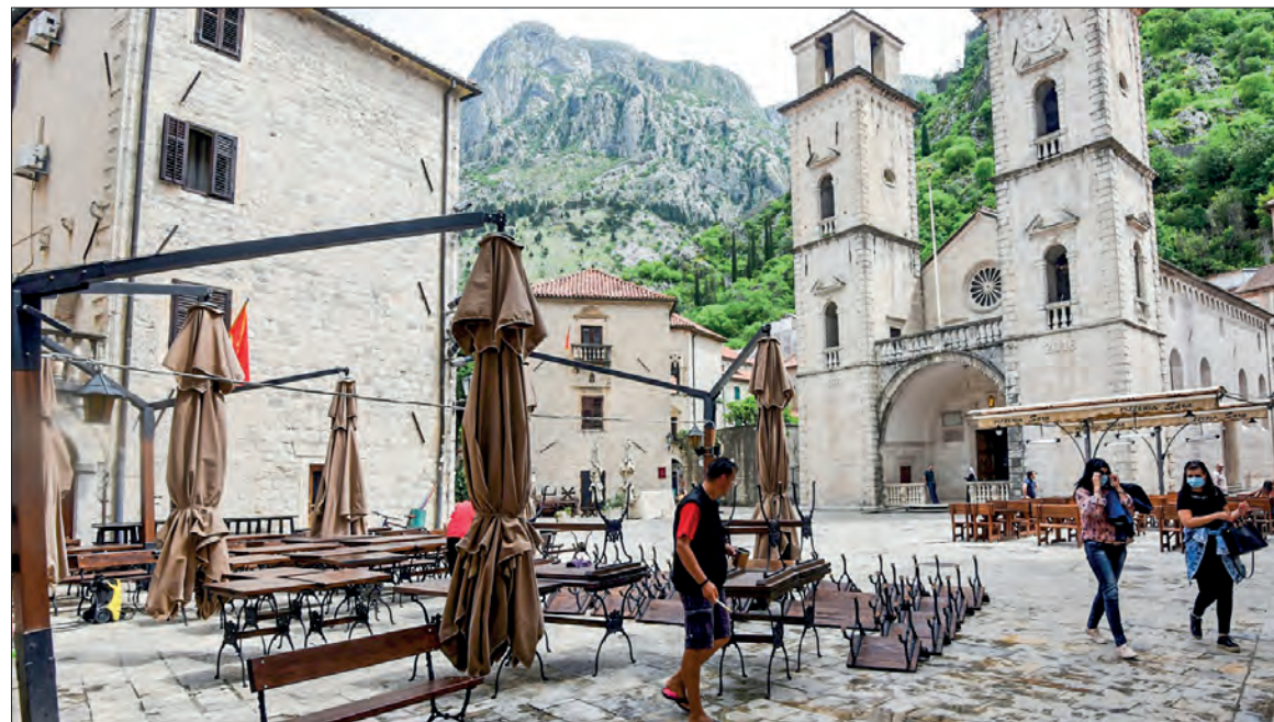
The travel industry was looking forward to a rebound in 2022 after it was devastated by border closures and lockdowns. A UNESCO world heritage site, the well preserved medieval walled town of Kotor sits at the foot of Mt. Lovcen at the southern end of the Boka Bay.

The head of the International Monetary Fund, Kristalina Geor-