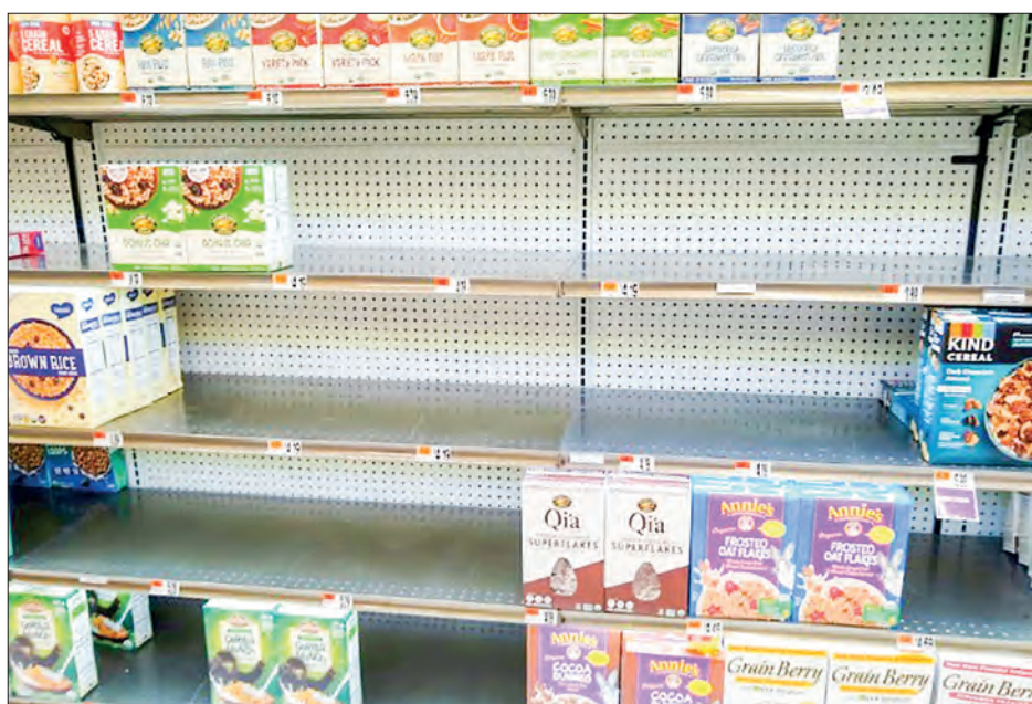
Empty shelves are pictured at a Giant grocery store in Bethesda, Maryland on 13 January 2021, a consequence of both the Omicron variant and a recent snow storm.

"Since the Omicron variant is so contagious, it's impacting the entire United States all at once. So many US grocery stores and food producers are dealing with employees being out sick, or being asked to quarantine," he said. Further up the supply chain, there are issues producing enough food, delivering it and even unloading it once it gets to the grocery stores.— AFP ■