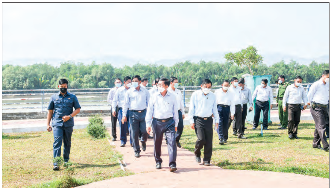
State Administration Council Chairman Prime Minister Senior General Min Aung Hlaing views around the Seikkantha Park in Dawei on 14 January 2022.