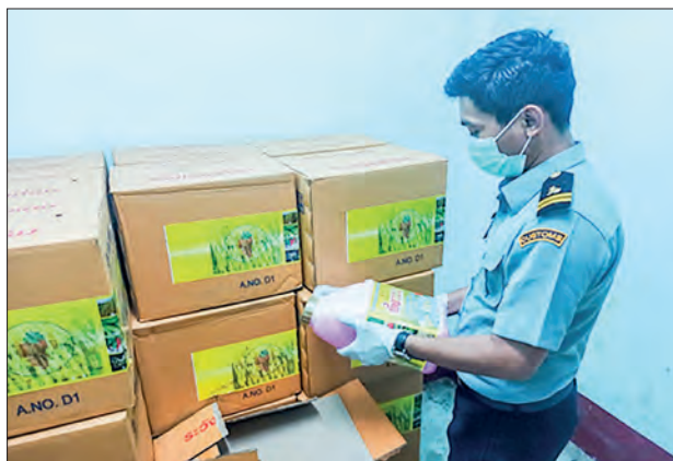
Confiscated commodities at Customs on 13 January.