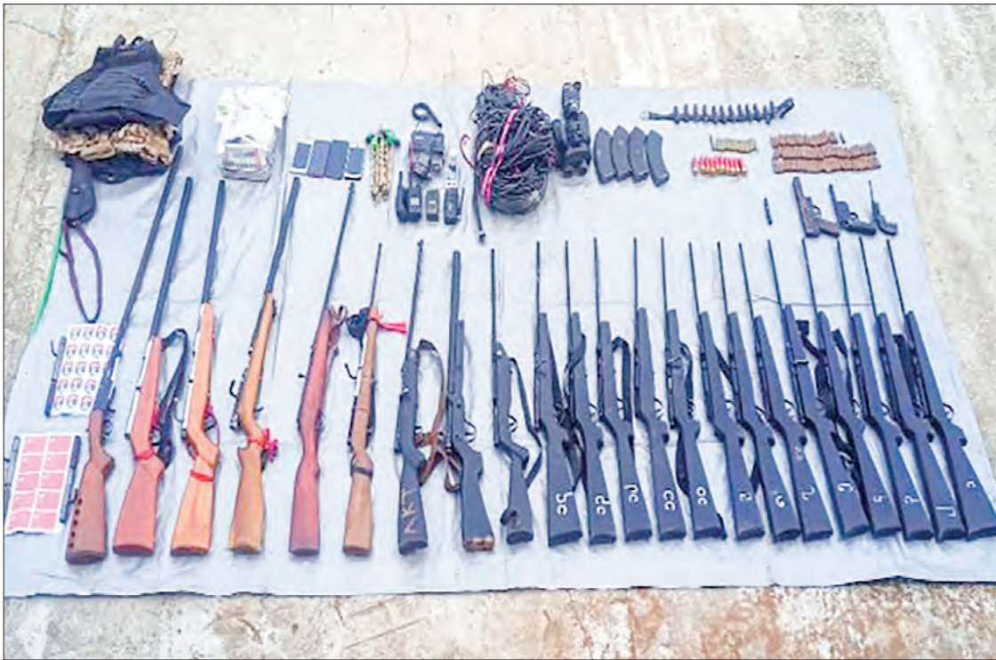
Seized weapons and related items.