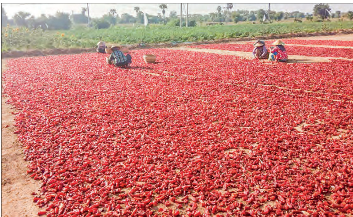
Myanmar's fresh chilli pepper is shipped to Viet Nam via the sea route and primarily sent to China and Thailand via cross-border trade zones.

The export varieties of fresh chilli peppers are 692,777, 999, Kartar, Demon, Sunshine, Lucky One and Tharmo. — NN/GNLM