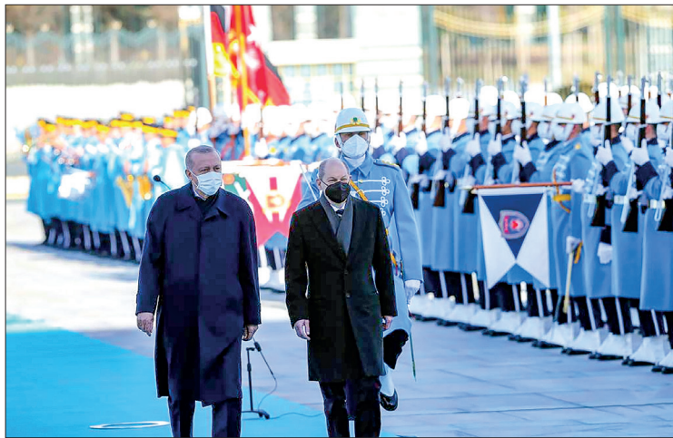
Turkish President Recep Tayyip Erdogan (L) welcomes visiting German Chancellor Olaf Scholz in Ankara, Turkey, 14 March 2022. Recep Tayyip Erdogan on Monday said his country has to maintain close ties with both Kyiv and Moscow.

For his part, Scholz said Turkey and Germany have common concerns regarding the Ukraine