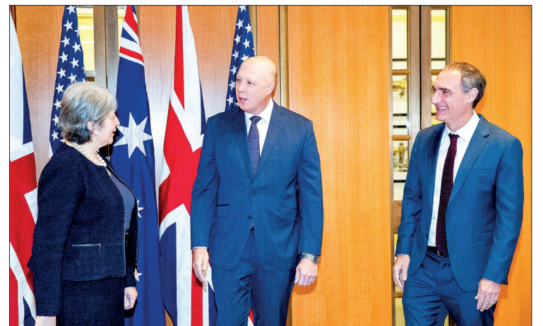
This handout photo taken and released on 22 November 2021 by the Australian Defence Force shows British High Commissioner Victoria Treadell (L), Australia's Minister for Defence Peter Dutton (C) and US Chargé d'Affaires Michael Goldman (R) after signing the Exchange of Naval Nuclear Propulsion Information Agreement during a ceremony at Parliament House in Canberra.

AUSTRALIAN Prime Minister Scott Morrison announced Tuesday his government is readying the country's ports to host nuclear-powered submarines from Britain and the United States.