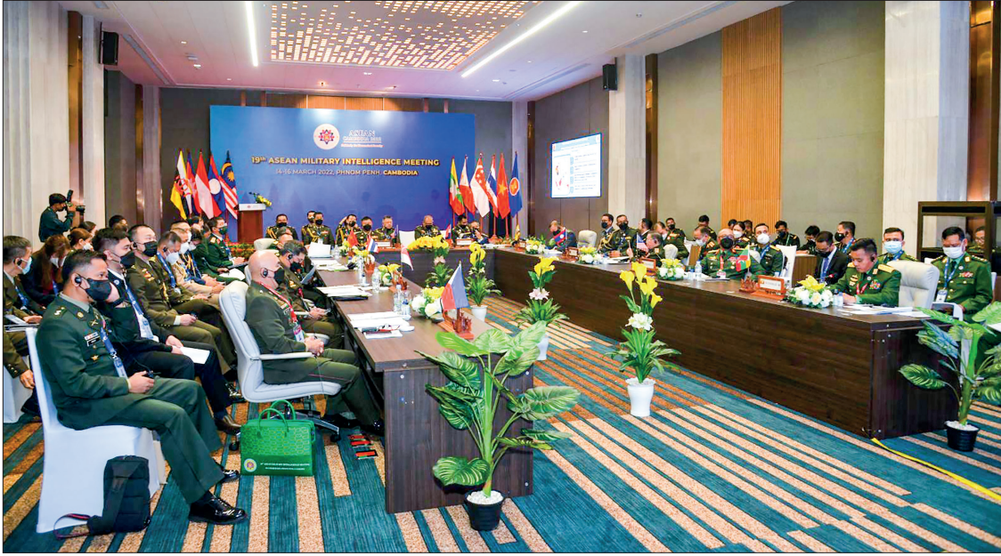
The 19 th ASEAN Military Intelligence Meeting AMIM-19 in progress in Cambodia.

THE Myanmar delegation with Chief of Military Security Affairs of the Myanmar Armed Forces Lt-Gen Ye Win Oo attended the 19 th ASEAN Military Intelligence Meeting – AMIM-19 held in Phnom Penh, Cambodia, yesterday morning.