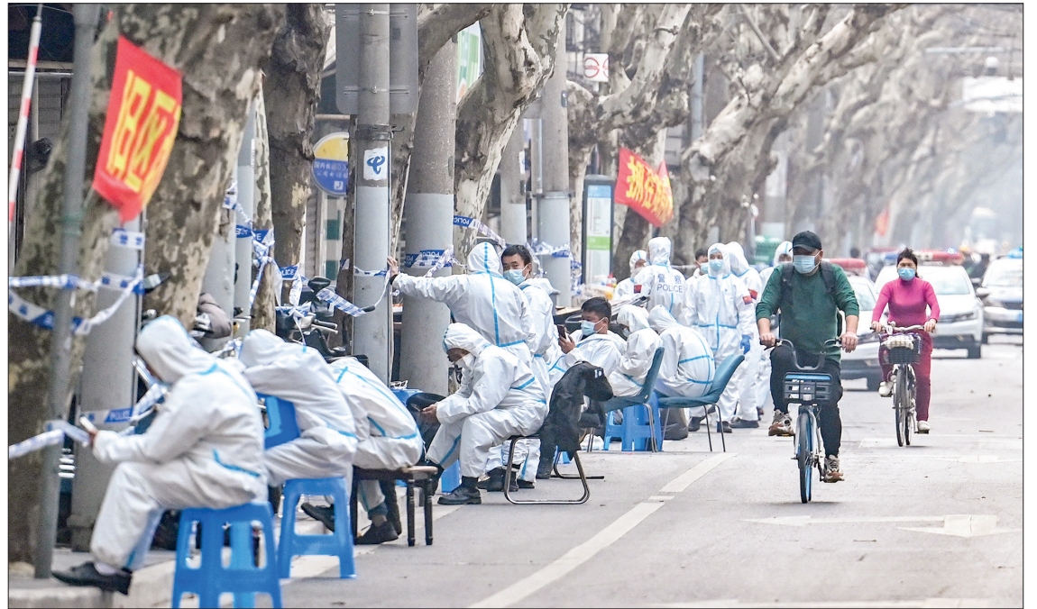
Workers are seen wearing protective clothes next to some lockdown areas after the detection of new cases of covid-19 in Shanghai on 14 March 2022.

NEARLY 30 million people were under lockdown across China on Tuesday, as surging virus cases prompted the return of mass tests and hazmat-suited health officials to city streets on a scale not seen since the start of the pandemic.