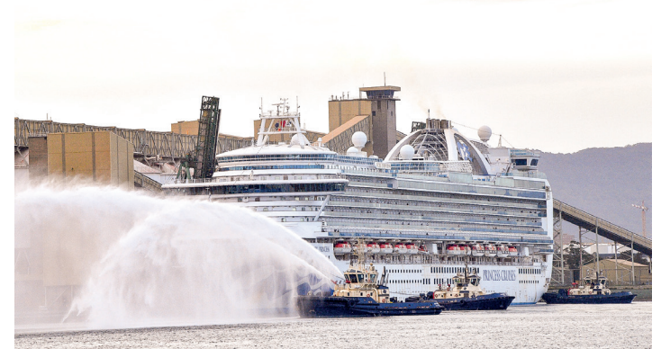
A tug boat gives a water salute as cruise liner Ruby Princess prepares to leave Port Kembla, some 80 kilometres south of Sydney on 23 April 2020. The Ruby Princess berthed after weeks stranded at sea to allow doctors to assess sick crew members and take the most serious cases ashore for medical treatment.

AUSTRALIA said Tuesday it will lift the entry ban on international cruise ships next month, effectively ending all major travel restrictions imposed in response to the coronavirus pandemic after two years.