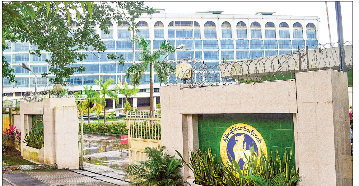
The Office of the Central Bank of Myanmar.

ed oil prices, the retail price of palm oil is shooting up around K7,000 per viss (a viss equals 1.6 kilogrammes) at present.