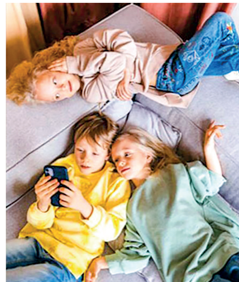
REPRESENTATIVE IMAGE: School children had almost doubled to more than three hours per day, while in Tunisia researchers reported an increase of 111 per cent in total screen time for children aged 5-12.