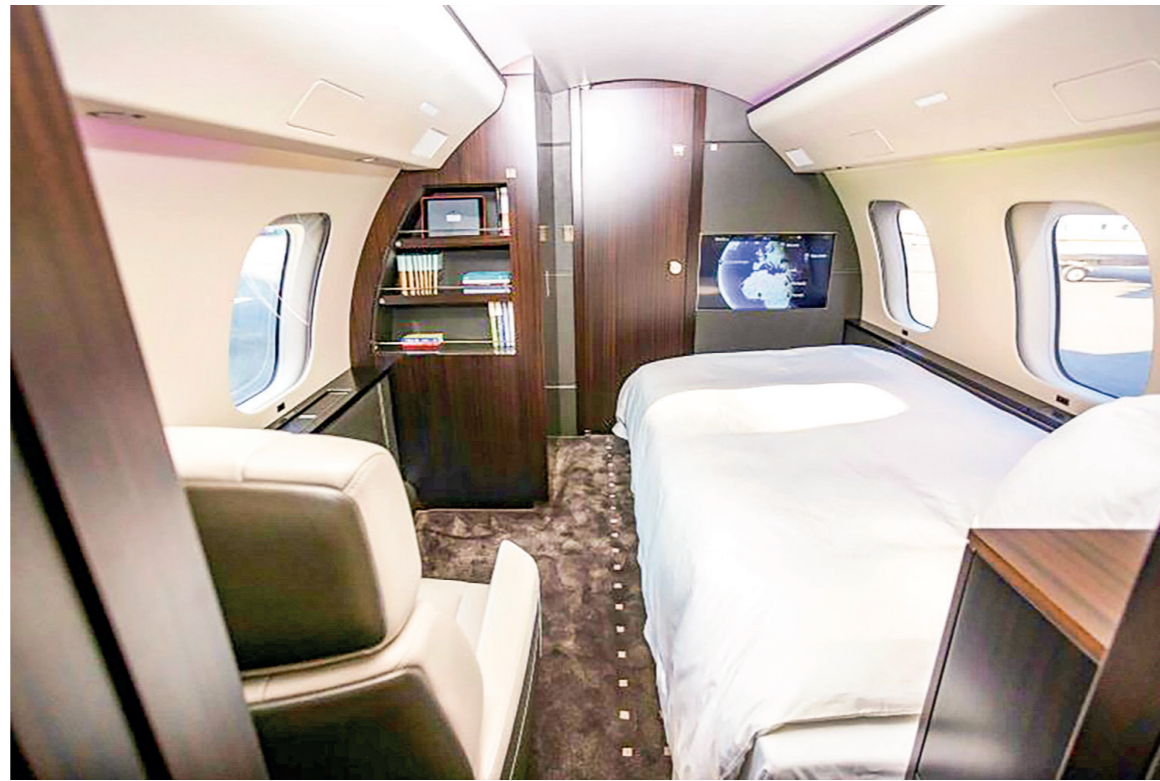
Clients enjoy plush cream-coloured leather chairs and a large double bed.

It found that private air travel nearly doubled its global market share between 2019 and 2021, when it stood at 12 per cent.