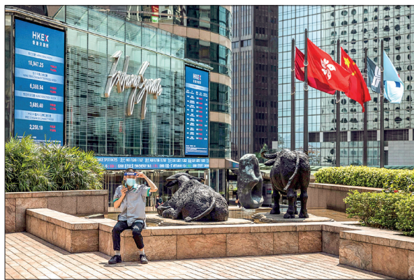
A man adjusts his face shield in front of Exchange Square displaying the Hang Seng Index (top L) in the financial district of Hong Kong on 15 March 2022.

ASIAN markets struggled again Tuesday, with Hong Kong tech firms leading another sharp equity sell-off in the city following the Covid-19 shutdown of tech hub Shenzhen and worries over Russia's military outreach to China.