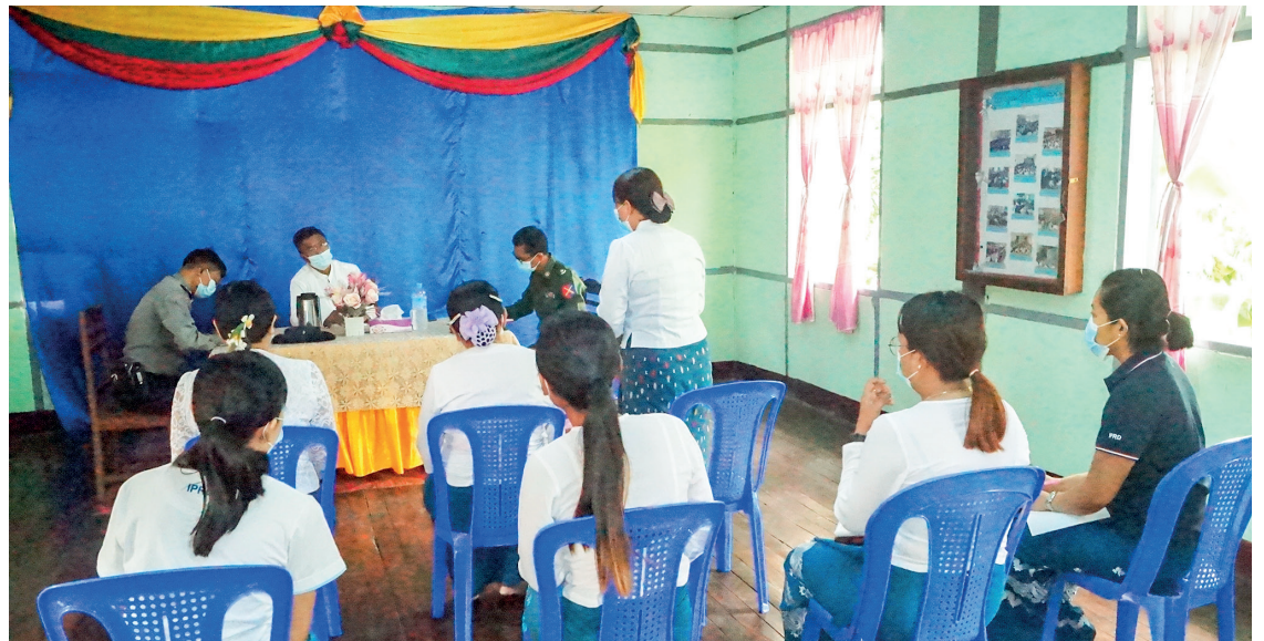
The MoI deputy minister meets the IPRD staff in Lewe Township.

He also said that the set up of IPRD was upgraded and it is more responsible to carry out the office responsibilities of the region, state, district and