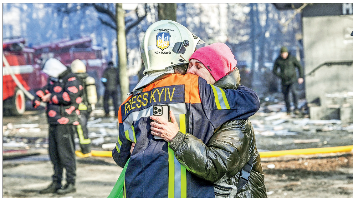
A fireman embraces a woman outside a damaged apartment building in Kyiv on 15 March 2022, after strikes on residential areas killed at least two people, Ukraine emergency services said as Russian troops intensified their attacks on the Ukrainian capital.

STRIKES on residential areas in Kyiv killed at least two people early on Tuesday, emergency services said, as Russian troops intensified their attacks on the Ukrainian capital.