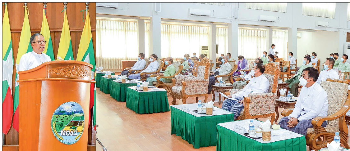
The MoALI Union Minister makes the speech to mark the golden jubilee of the Fisheries Department yesterday.

THE Department of Fisheries commemorated the 50 th anniversary (golden jubilee) at the meeting hall of the Ministry of Agriculture, Livestock and Irrigation on the morning of 15 March 2022.