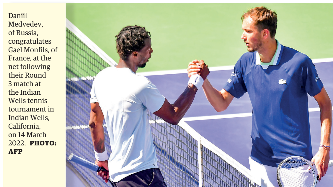
Daniil Medvedev, of Russia, congratulates Gael Monfils, of France, at the net following their Round 3 match at the Indian Wells tennis tournament in Indian Wells, California, on 14 March 2022.

DANIIL Medvedev was sent crashing out of the ATP/WTA Indian Wells Masters in a stunning defeat to Gael Monfils on Monday that ended the Russian's three-week reign as world number one.