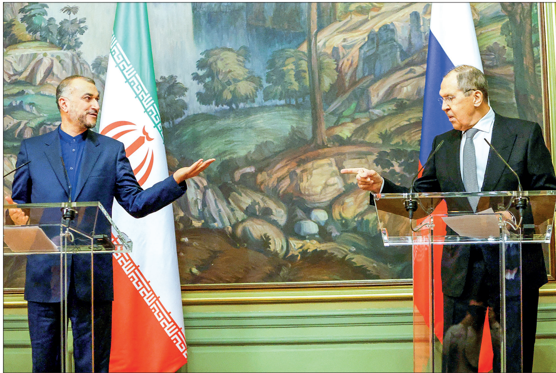
Russian Foreign Minister Sergei Lavrov (R) and Iranian Foreign Minister Hossein Amir-Abdollahian hold a joint press conference following their talks in Moscow on 15 March 2022.

ter Moscow earlier this month demanded guarantees that Western sanctions imposed following its military incursion into Ukraine would not damage its trade with Iran.