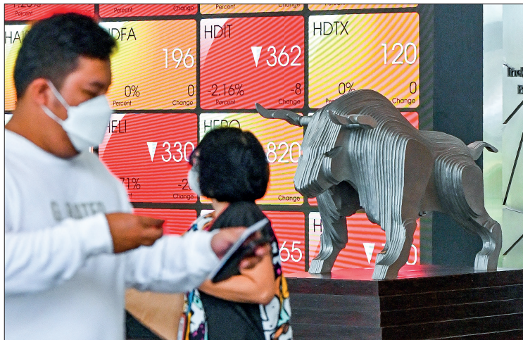
People walk past a big screen showing stocks trading at the Indonesia Stock Exchange in Jakarta on 22 September 2021.

INDONESIA'S largest tech firm said Tuesday it planned to raise up to $1.26 billion through an initial public offering this month, despite tumultuous world market conditions.