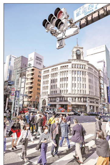
People walk in Tokyo’s Ginza area on a warm day on 14 March 2022, wearing face masks amid the coronavirus pandemic.

However, the government will keep a close eye on the number of infections in such areas as