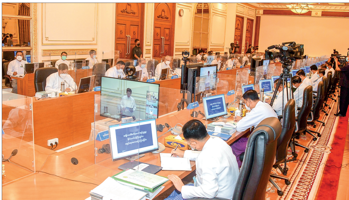
State Administration Council Chairman Prime Minister Senior General Min Aung Hlaing addresses the meeting 1/2022 of the National Planning Commission in Nay Pyi Taw on 15 March 2022.

P REPARATIONS must be made for minimizing risks in implementing the projects after taking lessons on advantages and disadvantages, said Chairman of the National Planning Commission Chairman of the State Administration Council Prime Minister Senior General Min Aung Hlaing at the meeting 1/2022 of the National Planning Commission at the SAC Chairman Office in Nay Pyi Taw