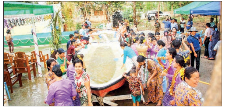
Maha Thingyan in Katha.