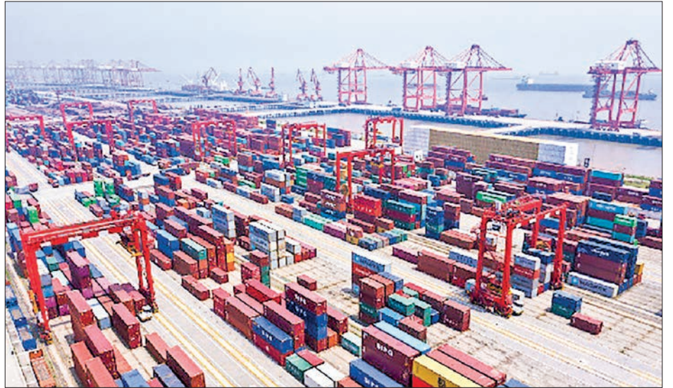
A bird's eye view of the busy Taicang Port in Suzhou, East China's Jiangsu province.

Taicang Port currently operates four container liner routes to Southeast Asia, providing convenient logistics services for trade enterprises in Suzhou, a national high- and new-tech industrial base in the province and other cities along the Yangtze River.—Xinhua