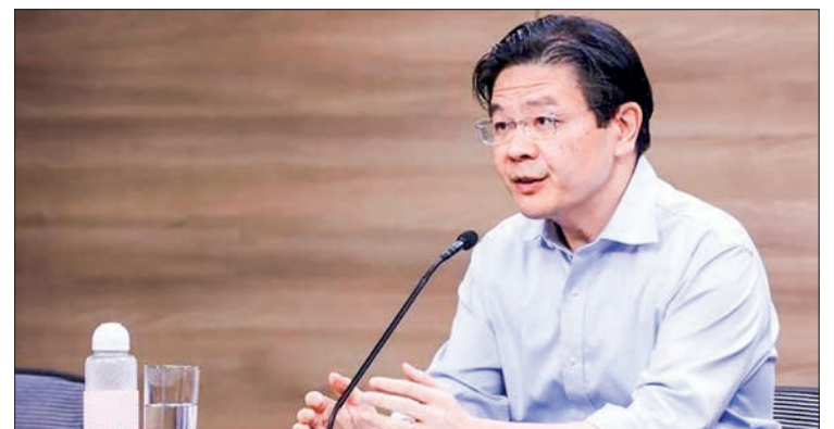
Singapore's Finance Minister Lawrence Wong has emerged as the likely successor to Prime Minister Lee Hsien Loong.

Wong was among three younger cabinet ministers