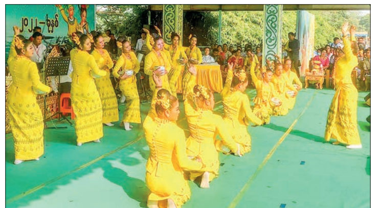
Maha Thingyan in Monywa.