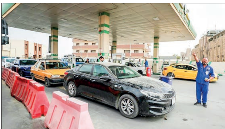
Iraqis crowd a Baghdad petrol station to fill up after some filling stations shut off their pumps to protest government policies on fuel.

owners of petrol stations have denounced the method of fuel distribution imposed by the authorities, complaining they end up paying more for the quantity of fuel they receive from the government than what they say it is worth. Iraq is the second largest producer in the Organization of the Petroleum Exporting Countries (OPEC), and oil provides more than 90 per cent of its income.—AFP