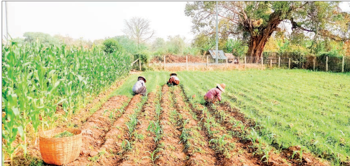
Myanmar exported 2.3 million tonnes of corns to foreign trade partners in the 2020-2021 financial year. The majority of them were sent to Thailand, and the rest went to China, India and Viet Nam.

The corn needs moisture content. Irrigation is utilized for adequate soil moisture in the summer and winter growing seasons. The growers have to take special care in corn pollination and fertilization. Corn can be grown by broadcasting or planting the seeds in rows. Drip agriculture, spraying fertilizer and clearing weeds and grass are required to grow them successfully. Approximately 10,000 plants can be produced per acre. The high