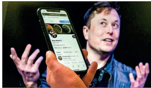
Elon Musk's fortune does not mean it will be easy for him to buy Twitter.

EVEN for the richest person on the planet, buying Twitter was always going to be a challenge—a highly