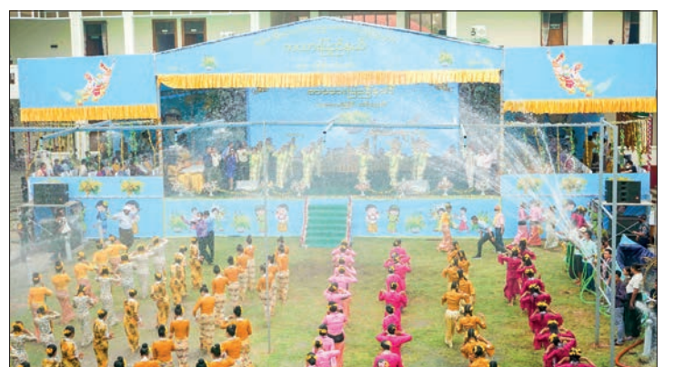
Maha Thingyan in Loikaw.