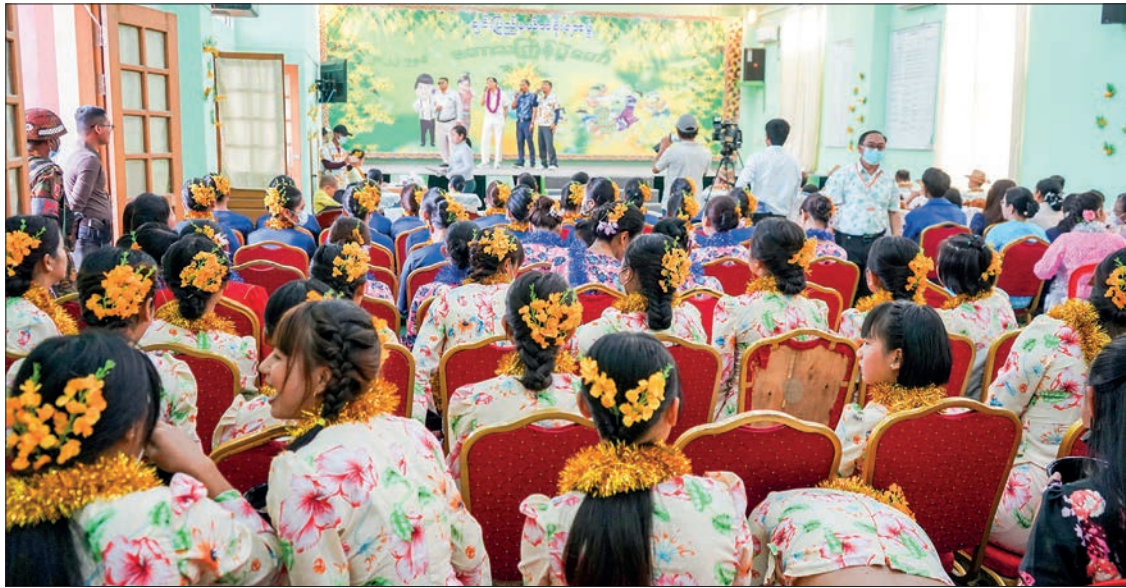
Maha Thingyan Water Festival closes in Chin State.

THE 1383 ME Myanmar Traditional Thingyan Festival Atet Day event was held at 9:30 am yesterday at the Maha Thingyan Festival Central Pandal at the Chin State Government Office in Haka Township.