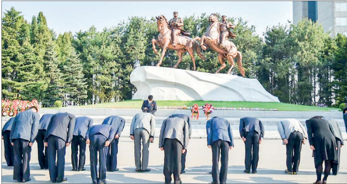
People bow before the statues of late North Korean leaders Kim Il Sung and Kim Jong Il at the Mansudae Art Studio, as part of celebrations marking the 110th anniversary of the birth of Kim Il Sung, known as the "Day of the Sun", in Pyongyang on Friday.

NORTH Korea marked the birthday of its founding leader on Friday, with a rare "live" broadcast of celebrations in Pyongyang, but no sign of the military parade or weapons tests that many analysts had predicted.