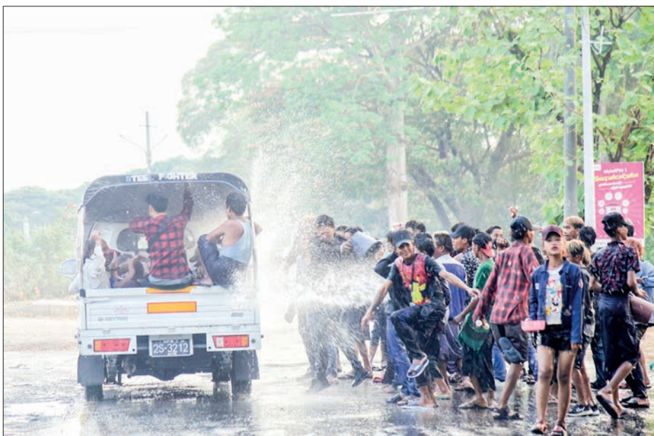
Maha Thingyan merry-makers are seen at one of the Nay Pyi Taw roads.

Water is poured into one another to remove the dirt from the old year and prevent it from entering the new year during the Thingyan Festival, in line with Myanmar's traditional culture.