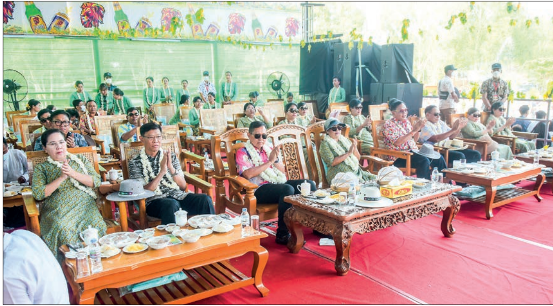
The Vice-Senior General, his wife and party praise the performance of the Thingyan choral dance troupe.

The ceremony was attended by State Administration Council Vice-Chairman Deputy Prime Minister Deputy Commander-in-Chief of Defence Services Commander-in-Chief (Army) Vice-Senior General Soe Win, SAC members, Union Ministers, Deputy Ministers, senior military officers of the Commander-in-Chief of Defence Services Office, their wives and family members. They enjoyed performances by artistes, sing-