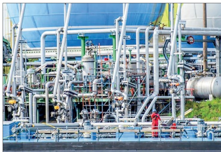
Russian oil and gas sales to the EU account for a far higher amount of revenue: between a quarter of a billion to a billion euros per day, per different estimates.

THE EU is working on broadening sanctions on Russia to include oil and gas embargoes but such measures would take "several months", European officials told AFP on Friday.