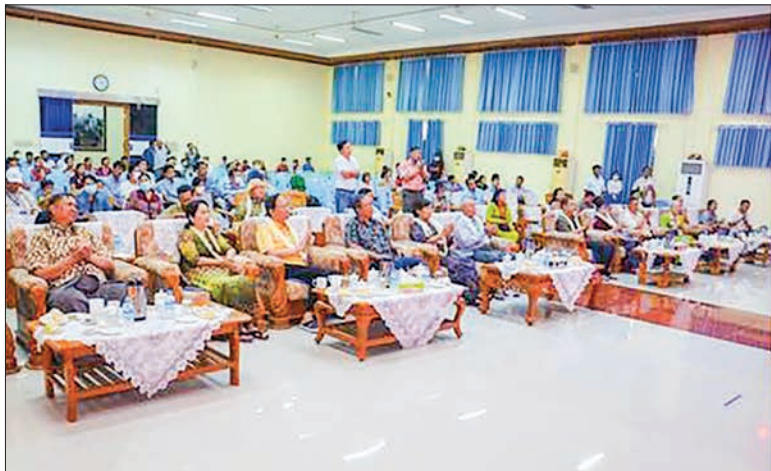
The SAC member and officials attend the MoEE Maha Thingyan Water Festival.