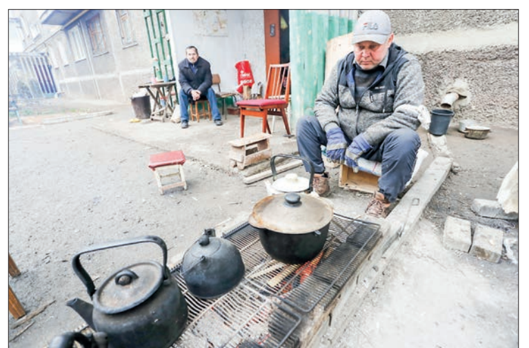
Residents cook outdoors in Mariupol, 12 April 2022.

The Ukrainian military recently carried out a tactical operation on joining the forces of two military units in Mariupol