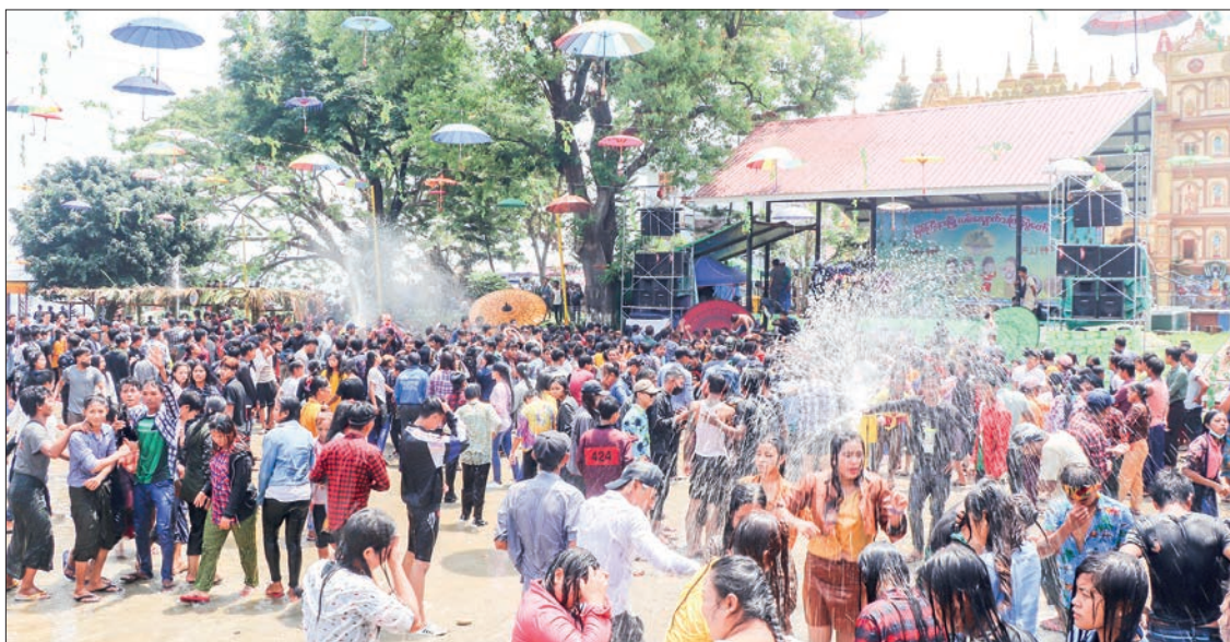
Maha Thingyan Water Festival winds up in Kachin State.

Afterwards, the choral dance troupes entertained with Mann Taung Yeik Kho song and officials concluded the event.