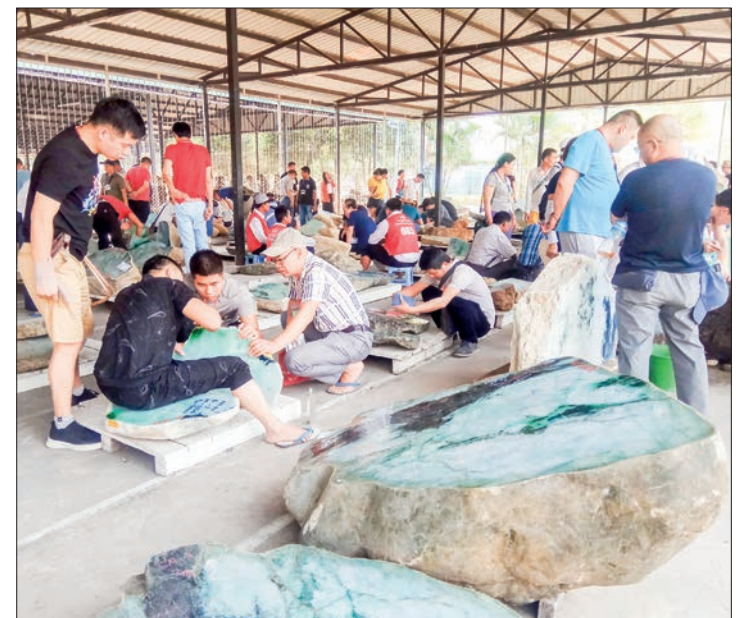
Gems merchants were pictured evaluating gem stones in the previous emporium.

Under the Ministry of Natural Resources and Environmental Conservation, the Myanma Gem Enterprise notified the miners on 1 April 2022 of the suspension of jade mining permit extension in Lonkhin, Phakant, Mawlu and Mawhan sites. It aims to have the sustainable utilization for future generations, ensure no environmental impacts and the safety measures. — NN/GNLM