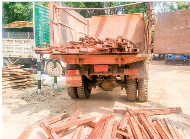
Seized timbers and lorry in Yangon.