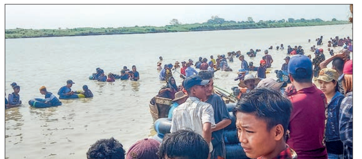
Maha Thingyan on Ohnma Dandy Beach.