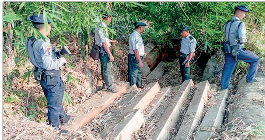
Confiscated teak logs.

gional Illegal Trade Eradication Special Task Force conducted inspections in Bago, Toungoo, Pyay and Thayawady districts and seized 13.2554 tonnes of teak, timbers and other wood (estimated value of K2,026,974) and took action under the Forest Law.