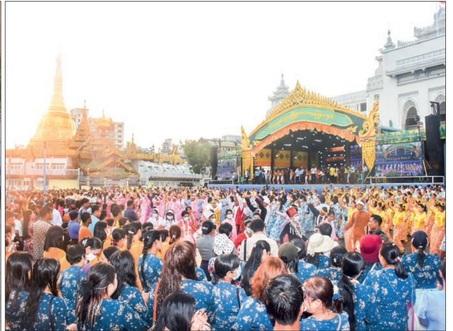
The closing ceremony in progress.

THE closing ceremony of the Yangon Maha Thingyan Pandal was held yesterday at 5 pm.