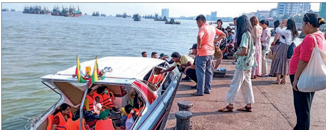
Travellers are seen going on island trips.

The island's day-trip tours can cost between K120,000 and 200,000 depending on the island while the overnight trip to Marcus Island K180,000 and K300,000 to Smart Island, Beli Island and Kyal Leik Island, according to the agencies. — Khine Htoo (Myeik/IPRD)/GNLM