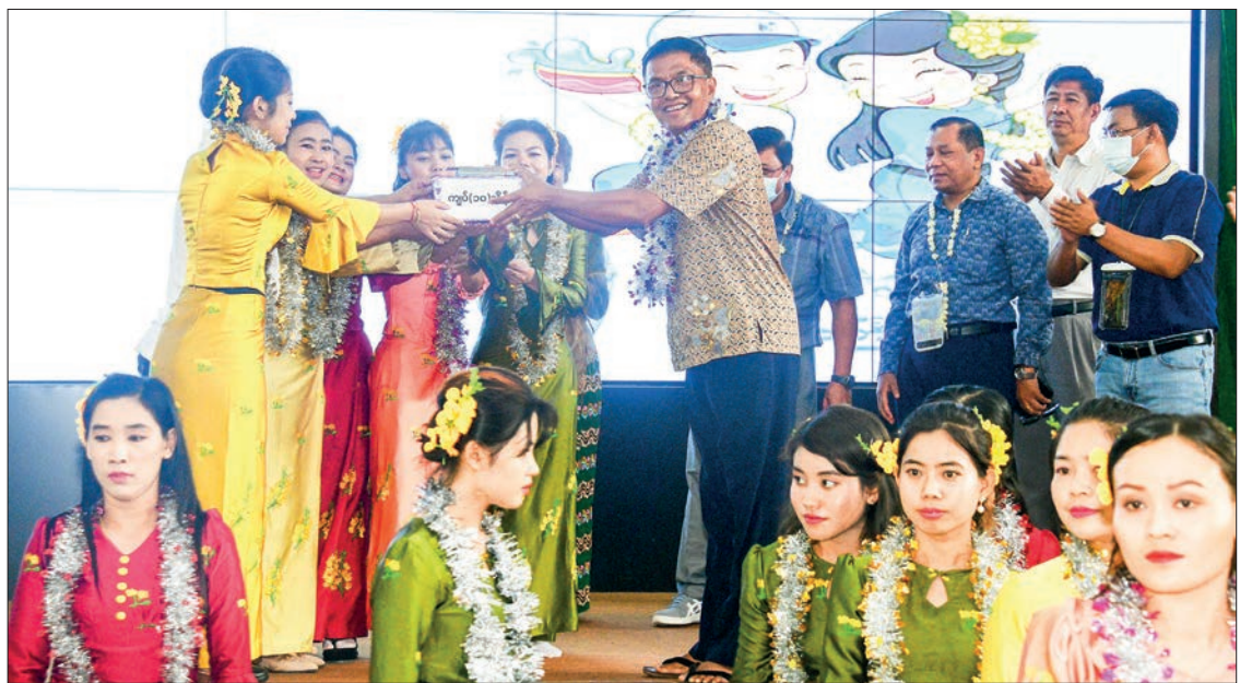
The MoI deputy minister gives the cash award to performers.