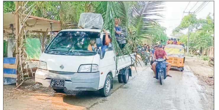
Maha Thingyan in Buthidaung.