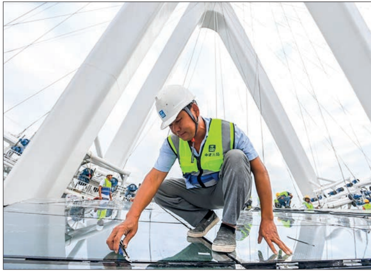
A staff member works at the construction site of a ferris wheel at Baoan coastal cultural park in Shenzhen, south China's Guangdong Province, on 6 Oct 2020.