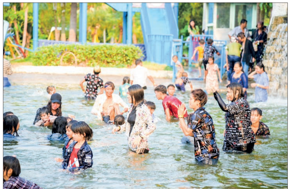
At the Nay Pyi Taw water fountain park.