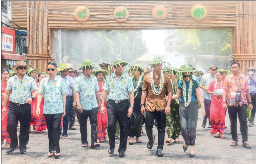
Dignitaries and foreign missions in Yangon take part in the Walking Thingyan.