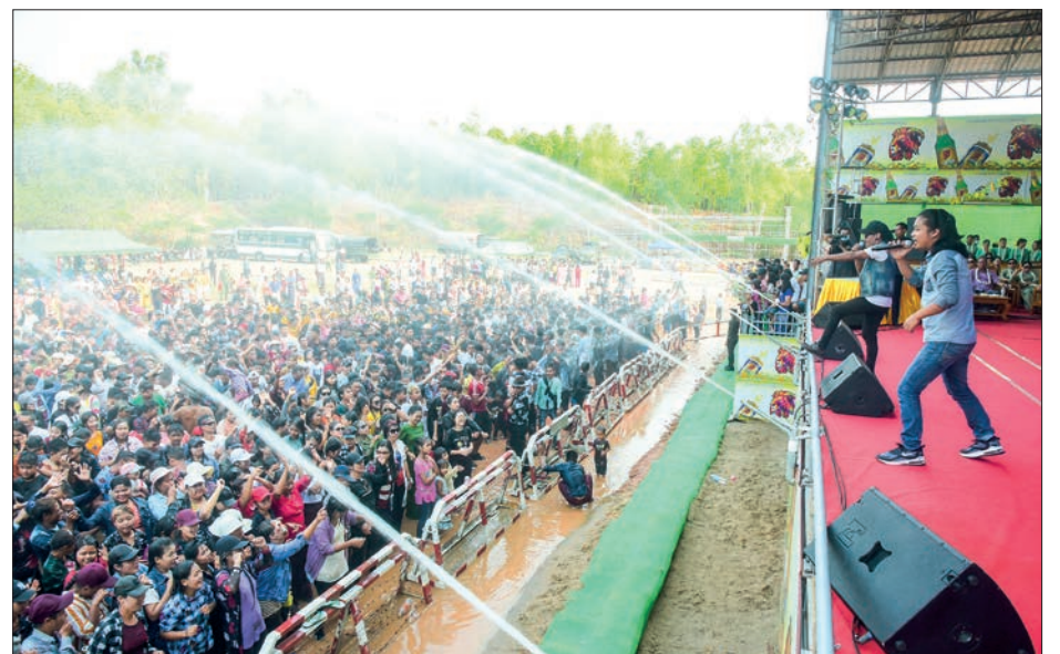
The Commander-in-Chief (Army, Navy and Air) Office Maha Thingyan Water Festival Pandal in progress.

ers and choral dance troupes. They then awarded the artistes