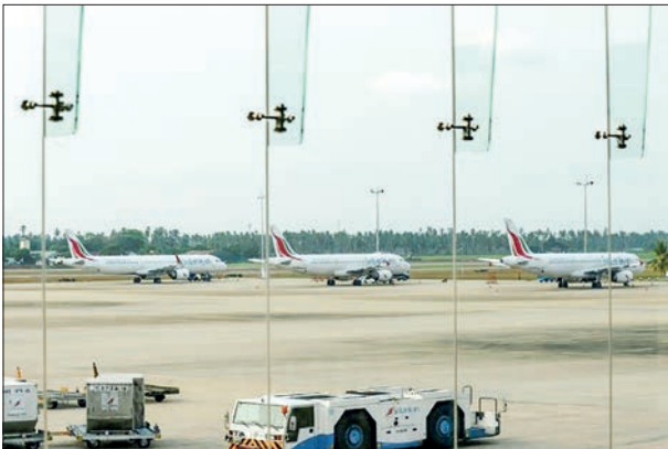
Sri Lankan Airlines will lease up to 21 extra aircraft.

Despite the crisis, state-owned Sri Lankan