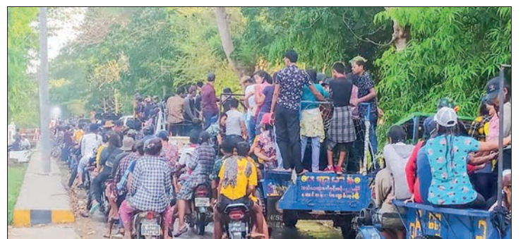
Maha Thingyan in Eainme.