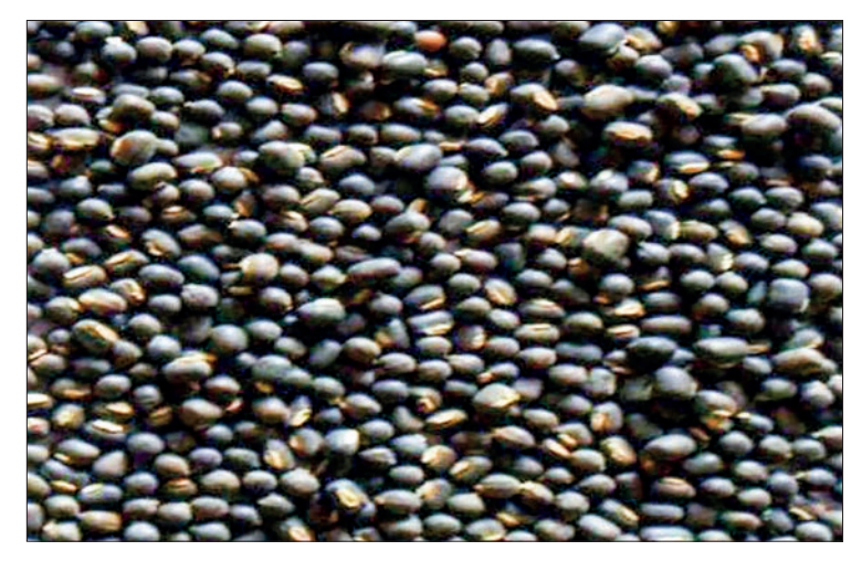
The bean cultivation rate was high in India and they temporarily suspended green gram and pigeon pea until March 2018.

The bean cultivation rate was high in India and they temporarily suspended green gram and pigeon pea until March 2018.