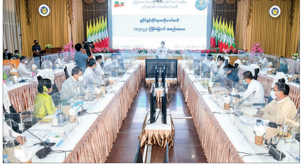
State Administration Council Vice-Chair Deputy Prime Minister Vice-Senior General Soe Win addresses the meeting 1/2022 of the Central Committee on Rights of Intellectual Property in Nay Pyi Taw yesterday.

economic policies, exercising the rights of intellectual property can contribute much to the development of businesses based on innovation and the emergence of the private sector capable of creation, innovation and competitiveness involved in the Myanmar sustainable development plan (2018-2030) while supporting the economic development of the State.