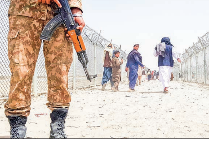
A Pakistani soldier stands guard as stranded Afghan nationals return to Afghanistan at the Pakistan-Afghanistan border crossing point in Chaman on 15 August 2021, after the Taliban took control of the Afghan border town in a rapid offensive across the country.

"In the two days of meeting substantial progress has been made and as a result of that the leadership of the TTP has extended the ceasefire until fur-