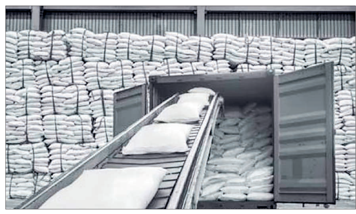
The wholesale price of sugar touched a high of K1,750 per viss in late 2010. On 31 May 2022, the price reached a fresh peak of K2,200.

The local sugar brands sell the sugar at the wholesale price of K2,140-2,200 per viss in Yangon. The sugar market collapsed in the past years owing to the COVID-19 impacts, resulting in a decrease in sugarcane sowing acres. This year, more sugarcane acres are added. The sugarcane processing started in mid-December and the season has not ended yet. Approximately 440,000 tonnes of sugar are expected to flow into the market, market