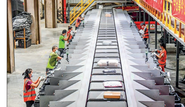
Employees work at an express distribution centre of the delivery company SF Express in Haikou, south China's Hainan Province, 8 Nov 2020.

A reading above 50 per cent indicates expansion