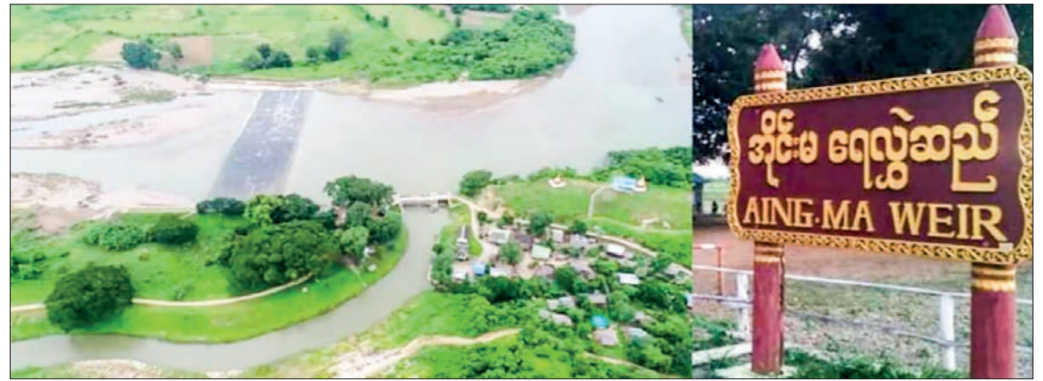
An aerial view of the Aing-Ma Weir.

in various stone inscriptions especially on the Pothugyi Thatta stone inscription in 606 ME, Khin Mami stone in-