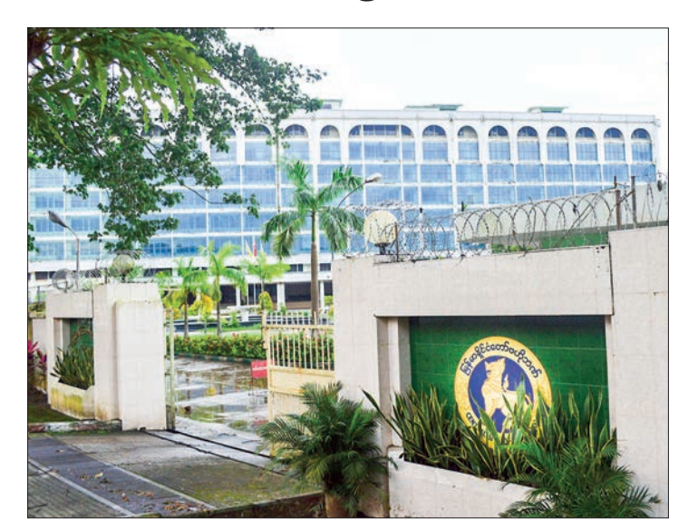
The Central Bank of Myanmar.

THE number of foreign exchange reserves was set for logistic services associations. according to the Foreign Exchange Supervision Committee's meeting (20/2022).