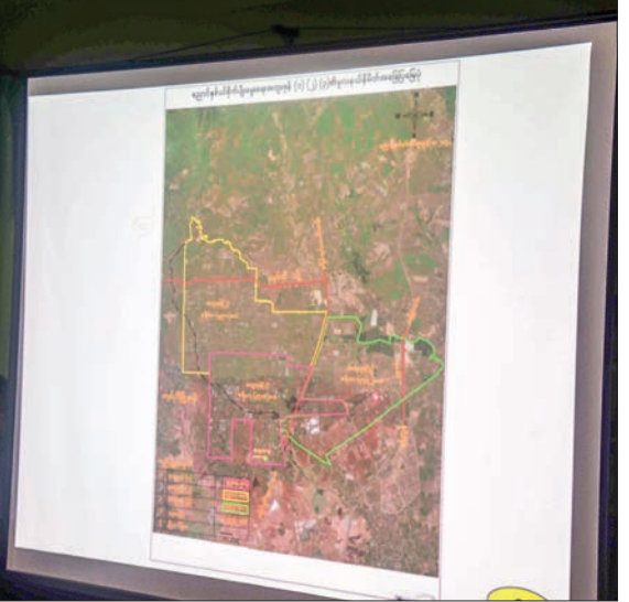
The Senior General hears the report on undertakings of agriculture and livestock farming works of the Nyaunghnapin Agriculture & Livestock

were maintained as much as possible in successive eras. Due to weakness in maintenance, the damaged parts have come out. Emphasis must be placed on maintenance for the long-term existence of buildings. It is necessary to repair the existing buildings. The Senior General stressed the need to systematic maintain exit and entrance roads.