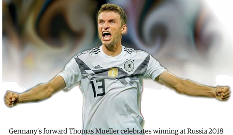
Germany's forward Thomas Mueller celebrates winning at Russia 2018 World Cup against Sweden.

THOMAS Mueller says Germany must be more consistent and score wins over the top nations if they are to be considered among the favourites for the looming World Cup finals.