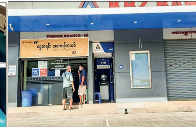
Robbery case at Kanbawza Bank