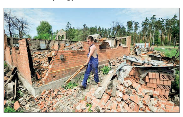
Vladimir Putin's troops have set their sights on capturing eastern Ukraine since Ukrainian forces repelled them from seizing Kyiv. A man cleans up debris of his house destroyed by shelling in the village of Moshchun, Kyiv region, on Thursday on the 99<sup>th</sup> day of the Russian invasion of Ukraine.

There are also jars of halal borscht soup supplied to Muslim Chechen fighers enlisted by their leader Ramzan Kadyrov, a fierce Vladimir Putin loyalist.—AFP