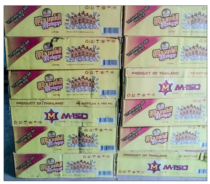
Confiscated commodities at the Mayanchaung Permanent Checkpoint.

Moreover, on the same day, a team led by Police Force captured an unregistered Honda Fit GD car (approximately K1,500,000) in Monywa township and an unregistered Nissan AD Van car at approximately value of K2,000,000 in