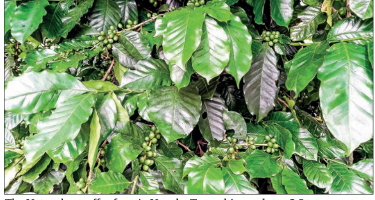
The Natyaykan coffee farm in Ngaphe Township produces 2.8 tonnes of coffee seeds and the private farms produce approximately 43 tonnes, totalling over 45 tonnes.

LOCALS engaged in Vietnamese highland coffee plantation (Arabica coffee) on 1,066 acres in Ngaphe Township, Minbu District, Magway Region, which is suitable to the climate, reap success.