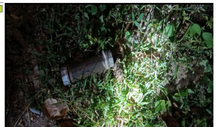
A handmade bomb.