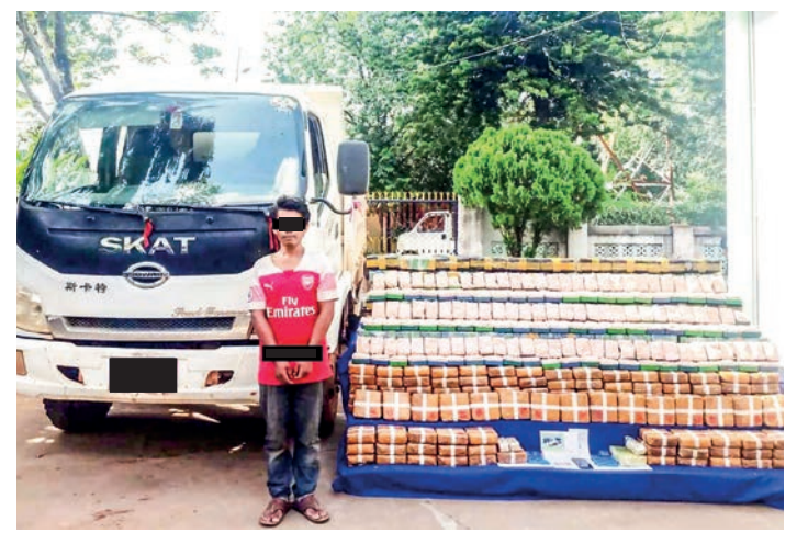
An arrestee is pictured along with seized drugs.

According to the investigation, the suspect admitted the seized drugs to be carried from Shan State (North) to Mandalay Region. Police are investigating and he is being prosecuted under the Narcotic Drugs and Psychotropic Substances Law, the Myanmar Police Force stated. — MNA