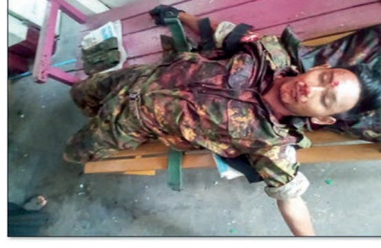
A security forces member was killed on 21 May 2021.

seven gun powder packs and one binocular and attacked the traffic police outpost at the Bakaya traffic light of Kyimyindine Township and one security member was injured.