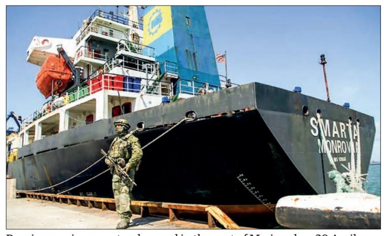
Russian serviceman stands guard in the port of Mariupol on 29 April 2022, amid the ongoing Russian military action in Ukraine.