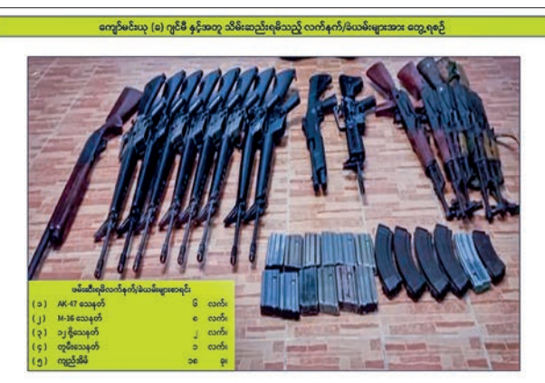
Seized weapons and ammunition.