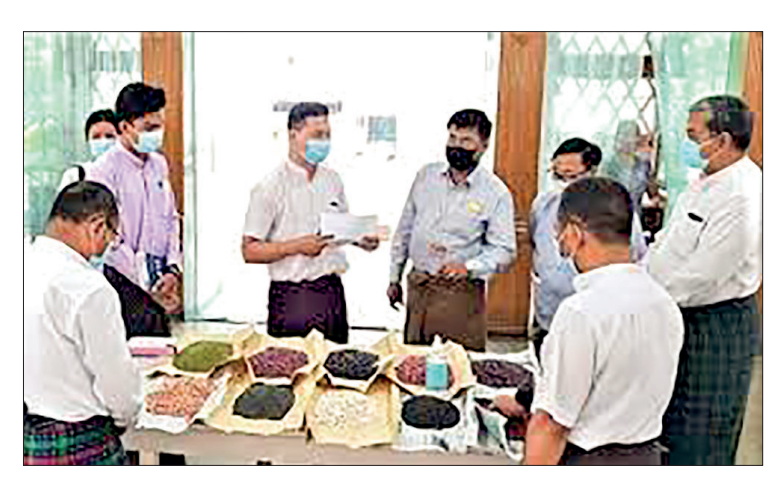
Pulses and beans traders are pictured evaluating beans and pulses.

Myanmar growers have a cost burden of agricultural inputs as the prices nearly doubled and tripled this year. As a result of this, only a small profit is generated for the growers. Despite the increase in the black gram demand, supply is pretty low at the moment. Consequently, the black