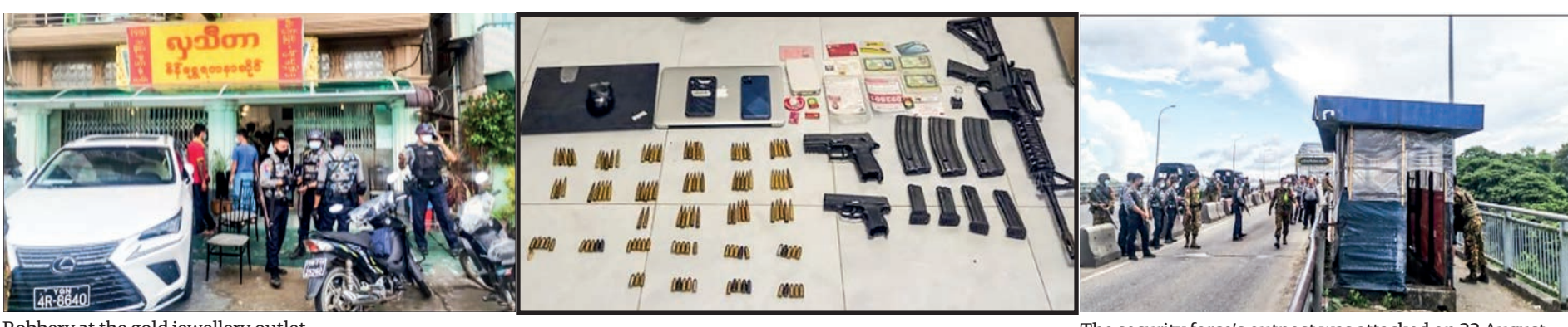
Robbery at the gold jewellery outlet.