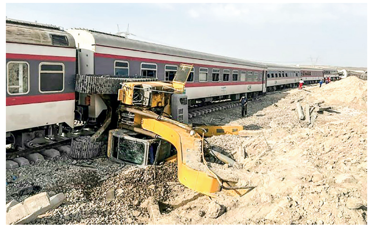
Iranian state media reported that the train derailed after hitting an excavator left too near the tracks.

Five of the train's 11 coaches came off the track in the 5:30 am (0100 GMT) accident, the Iranian Red Crescent's head of emergency operations, Mehdi Valipour, told state television.—AFP