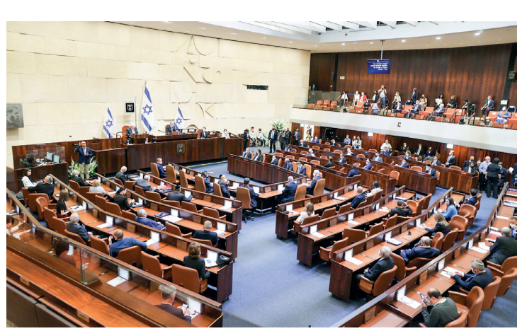
The Plenary Hall during the swearing-in ceremony of the 24th Knesset in Jerusalem, 6 April 2021.

Their rebellion does not for the moment call into question the continuation of Israeli law