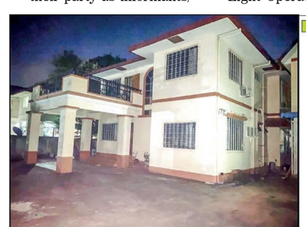
The residence where Jimmy was arrested.