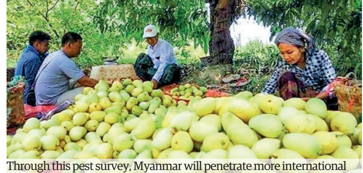
Through this pest survey, Myanmar will penetrate more international markets and ensure food safety for the consumers.

Through this pest survey, Myanmar will penetrate more international markets and ensure food safety for the consumers. If mango farms can achieve pest management in the coming years, mango quality will be improved.