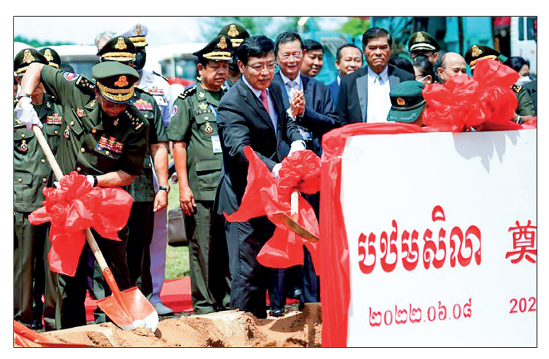
Cambodia's defence minister Tea Banh (L) and China's ambassador to Cambodia Wang Wentian (C) take part in the groundbreaking ceremony at the Ream naval base.

The project, paid for with a Chinese grant, also includes upgrading and expanding a hospital as well as donations of military equipment and repair of eight Cambodian warships, Tea Banh said. "There are allegations that the modernised Ream base will be used by the Chinese military exclusively. No, it is not like that at all," the minister told several hundred people including foreign diplomats at the ceremony.—