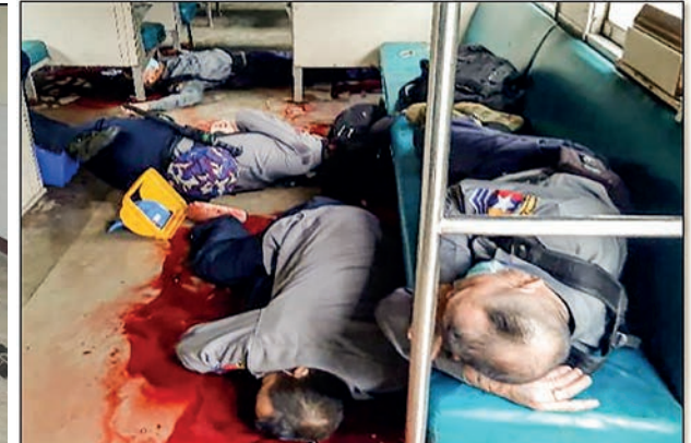
Police members were attacked on the circular train on 14 August 2021.