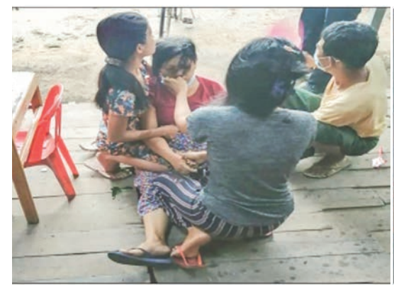
One innocent civilian was attacked on 5 August 2021.

He kept the arms and ammunition at houses, for CRPH, NUG and PDF which were declared terrorist groups with Order No (2/2021) of the Anti-Terrorism Central Committee of the Republic of the Union of Myanmar, launched bomb attacks in Yangon by leading 20 terrorist groups, instructed to attack security outposts, police stations, departmental offices and stations, kill the innocent civilians. and so the Martial Law tribunal was organized on 21 January 2022 and ordered the death sentence under the Counter-Terrorism Law Section 49 (a), 50 (i) and 50 (j). — MNA