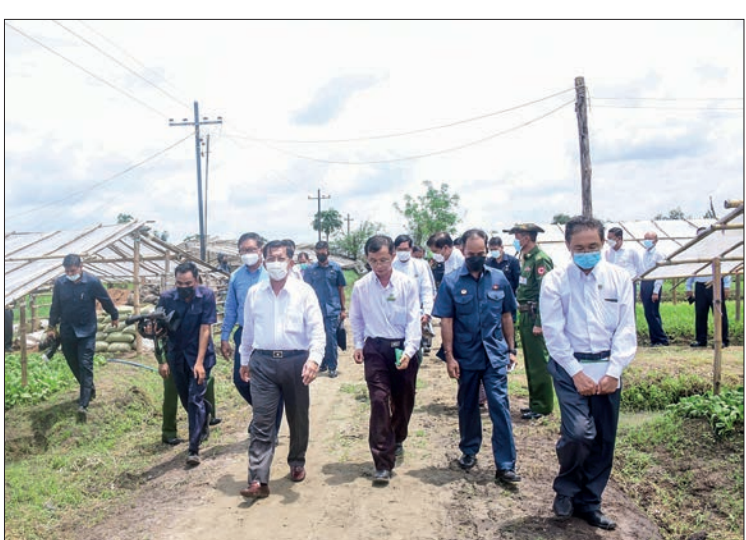
The Senior General views round the organic vegetable plantation and the poultry farm of the CJ Feed Myanmar.