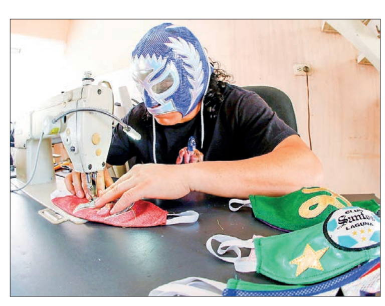
Researchers at the National Autonomous University of Mexico (UNAM) have created a facemask using silver and copper nanolayers that neutralizes SARS-CoV-2.

"We have to go back to wearing face masks, washing our hands frequently, social distancing, using ventilated spaces and continuing vaccination to avoid mutations," he said —Xinhua