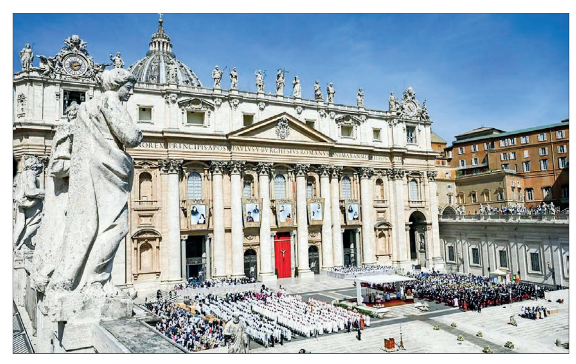
The Vatican has been rocked by a scandal centred around the costly purchase of a prestigious building in London as part of the Holy See's investment activities. A general view shows Pope Francis leading a canonisation mass at St. Peter's Square in The Vatican on 15 May 2022.

VATICAN investments will from now on be scrutinized by an inhouse committee on the orders of Pope Francis, following a scandal over the controversial purchase of a luxury London property.