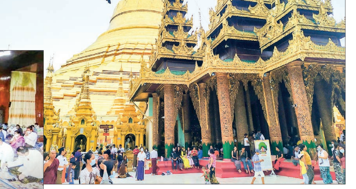
The Maha Samaya Day was held in 2021 (left photo) at the Shwedagon Pagoda.

Then, the Maha Samaya Day ceremony will be held at Chanthagyi Tazaung at the Yahu corner.