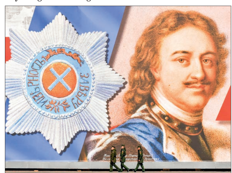
Peter the Great, who ruled Russia from 1682 to 1725, founded Saint Petersburg as the country's 'window to Europe'.

The defeat of Sweden in the Great Northern War (1700-1721) made Russia the leading power in the Baltic Sea and an important player in European affairs.—AFP