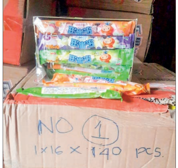
Seized commodities at the Mayanchaung checkpoint (left) and in Shan State (right).