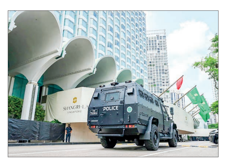
A police vehicle drives past the venue of the Shangri-La Dialogue summit in Singapore on Friday. The summit is a forum for the world's top military officials, diplomats and weapons firms.