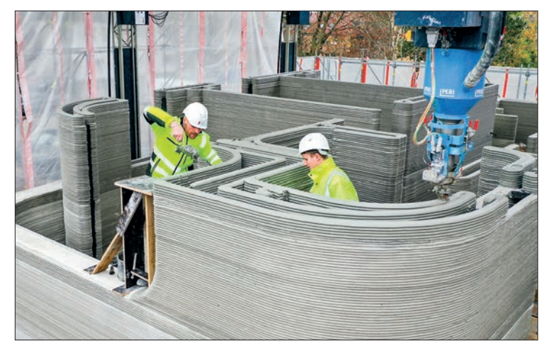
Construction workers stand in the scaffolded construction site of a house, where several layers of concrete have already been applied by a 3D printer, and the next printing stage is already underway, in Beckum, western Germany, on 26 November 2020.

In the first quarter of 2022, Germany's economy barely grew by 0.2 per cent quarter-on-quarter, according to the Federal Statistical Office (Destatis). GDP