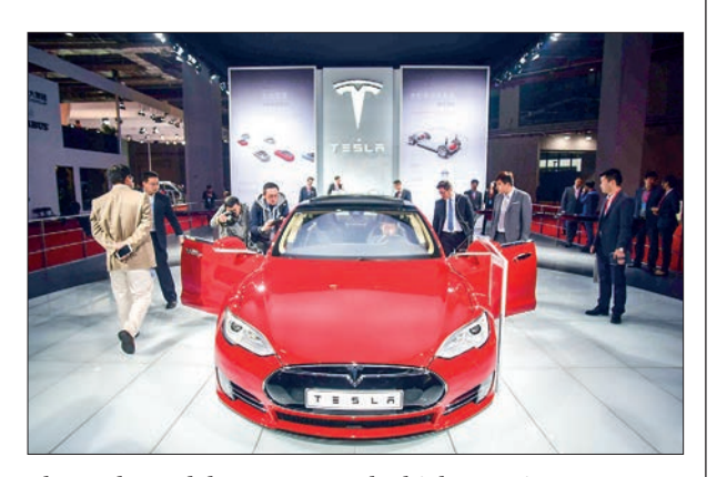
The Tesla Model S P85D won the highest rating Consumer Reports has ever awarded.

Additional forensic data on 11 of the incidents showed the drivers took no action to avert a crash between two and five seconds prior to impact, although they had their hands on the steering wheel.—AFP