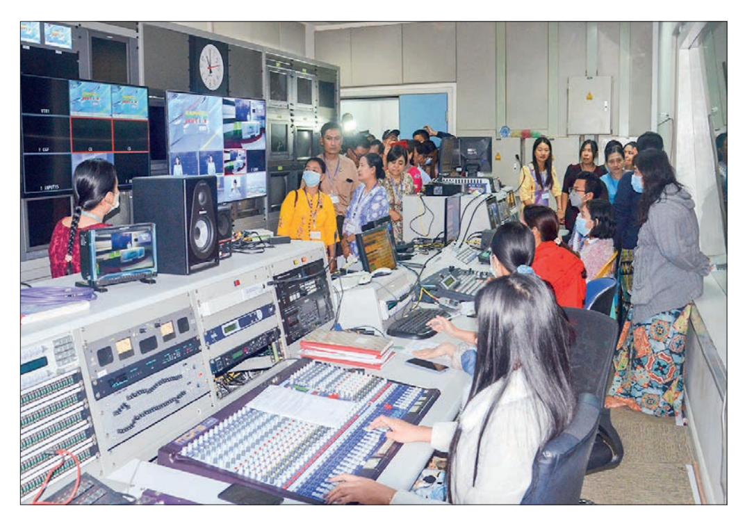
IPRD trainees pay study tours in the broadcasting studio of MRTV, Nay Pyi Taw yesterday.