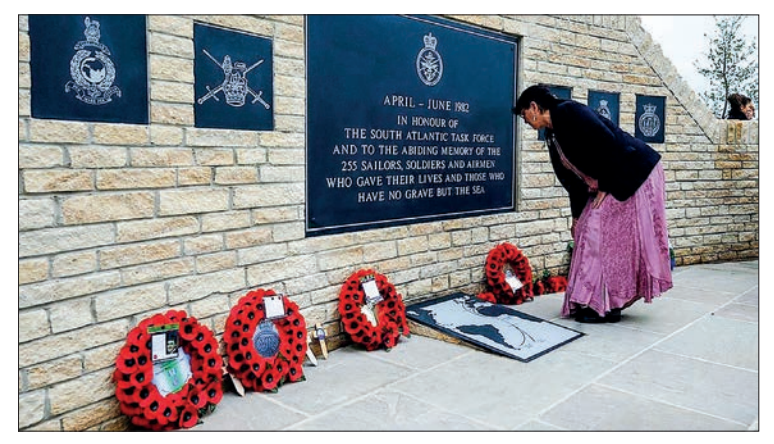
A woman laid a wreath after the dedication ceremony of the Falklands Memorial.

Britain's prime minister at the time, Margaret Thatcher, announced the surrender to parliament on the same day, vindicating for many her high-risk decision to send nearly 30,000