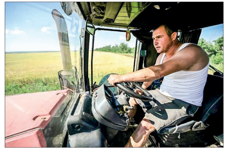
A farmer drives a tractor as he mows grass on a field of a farm in southern Ukraines Mykolaiv region, on 11 June 2022, amid the Russian invasion of Ukraine.

Despite the significant loss of land to the Russians, "the cur-