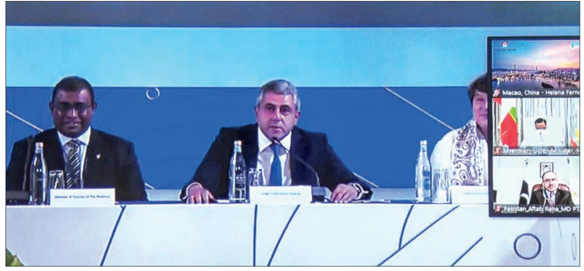
The MoHT Union Minister joins the 34^{\rm th} Joint Commission for East Asia Pacific and South Asia meeting held by the WTO

Myanmar's tourism industry, like other countries, was affected by the COVID-19 crisis, and is trying to recover as soon as possible. Efforts are being made to turn pandemic challenges into opportunities to become more resilient and revitalize tourism in