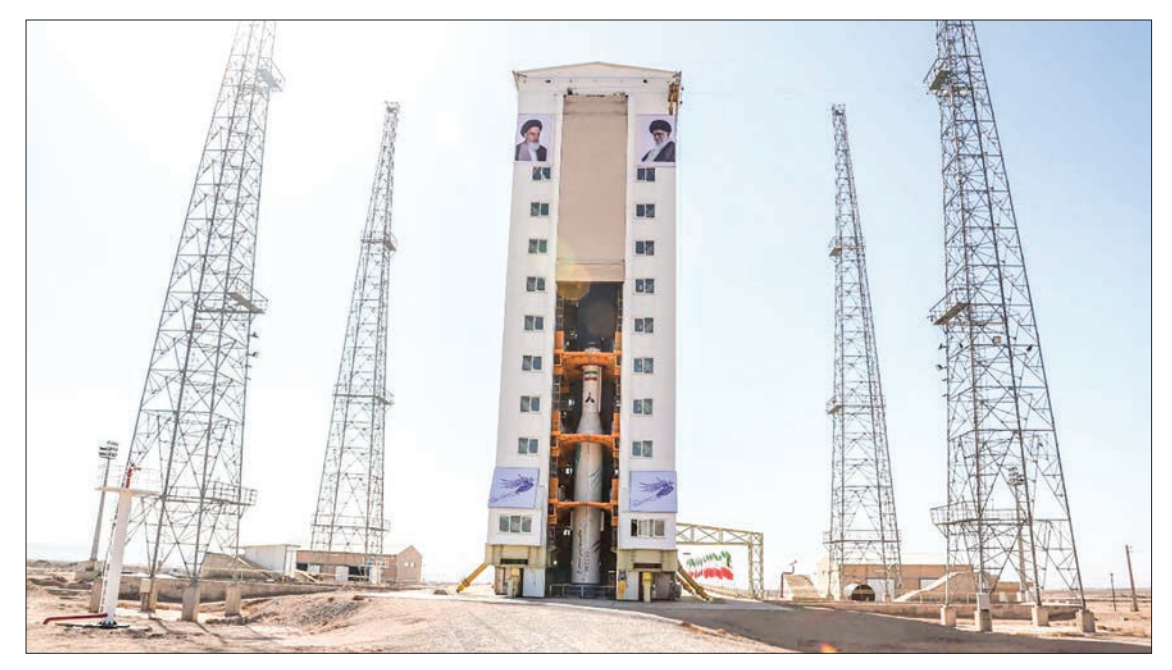
The Semnan Space Centre is home to the Iranian Space Agency's satellite launch site and ballistic missile testing.

TWO Iranian aerospace officials, including a member of the Revolutionary Guards' Corps, were "martyred while on mission" in separate incidents inside the country, the Fars news agency reported today.