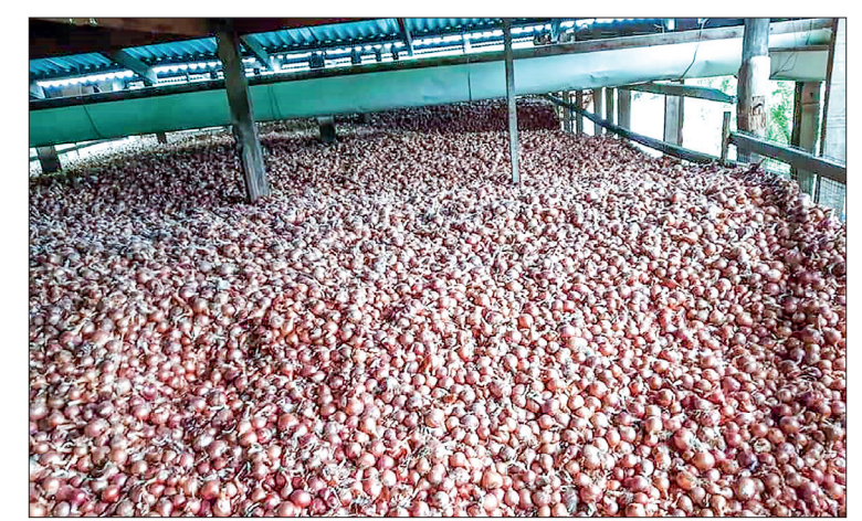
An abundant supply of summer onions from Myingyan, Pakokku, Monywa and Meiktila is seen in the Mandalay market. PHOTO: MIN HTET AUNG

Myanmar exports onions to external markets beyond self-sufficiency. The onions are commonly grown in Mandalay, Sagaing and Magway regions. It is cultivated near the riverbank with an irrigation system in the upper Myanmar region. — Min Htet Aung (Mandalay Sub-Printing House)/GNLM