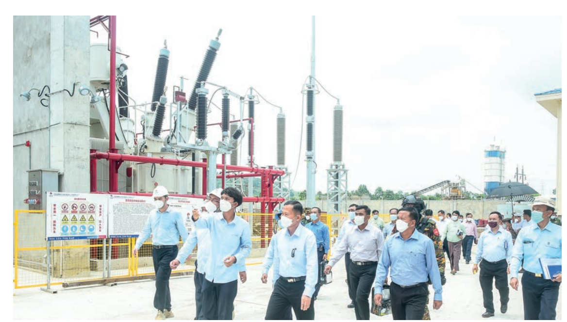
The Vice-Senior General pays inspection tours at the construction site of the power plant project.

When it comes into operation, the plant will generate 135 MW. The State Administration Council Vice-Chairman gave suggestions on measures to be taken to safeguard the natural environment and contribute to Corporate Social Respon-