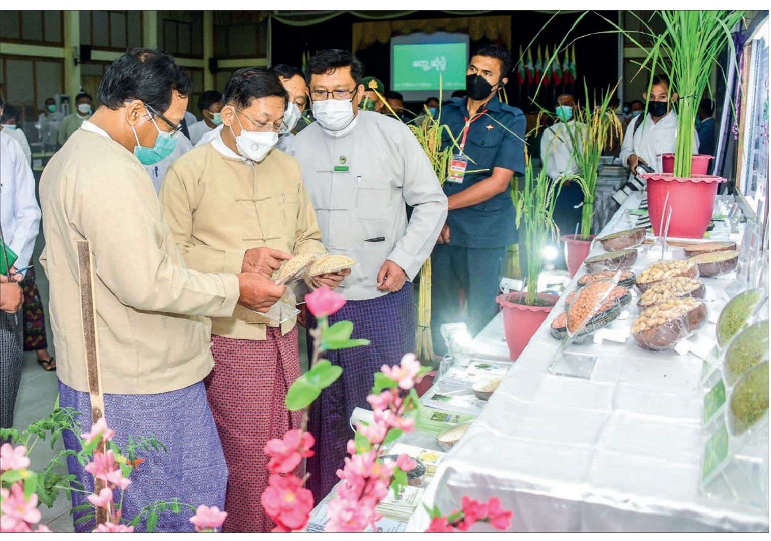
State Administration Council Chairman Prime Minister Senior General Min Aung Hlaing views round the booths at the Agricultural Research Department in Zeyathiri Township of Nay Pyi Taw Council Area on 14 June 2022.

Union ministers and the chairman of Nay Pyi Taw Council gave supplementary reports on respective sectors.