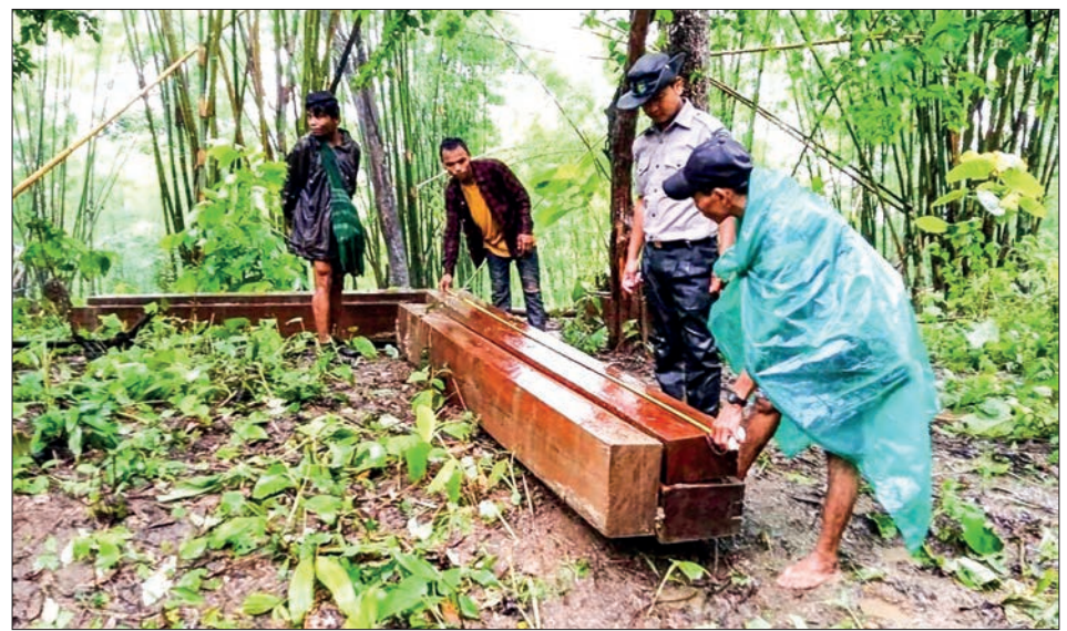
Officials confiscate illegal timbers.

Seventy cartons of Mevius cigarettes and foodstuffs at an estimated