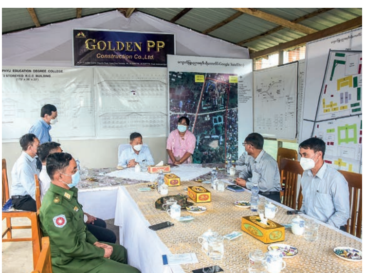
The Vice-Senior General meets responsible personnel at the Kyaukpyu Education Degree College.

sibility (CSR) tasks related to the health and education of local people and on timely implementation of the project in accordance with the required standards.