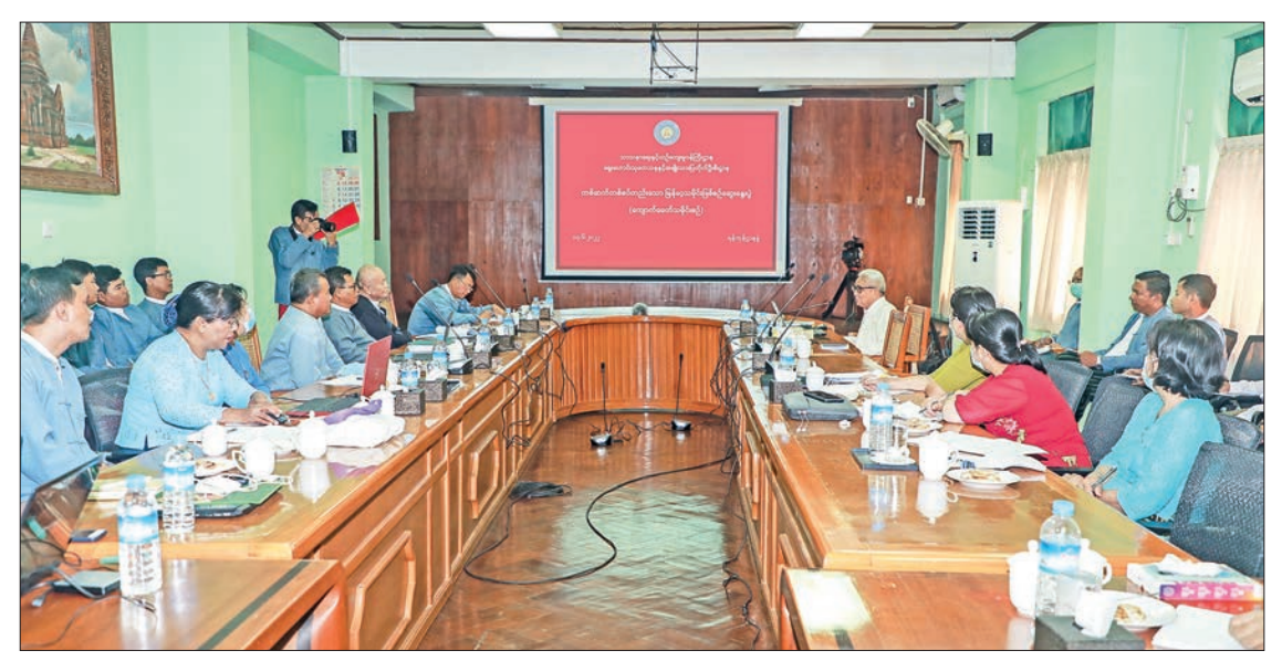
The coordination meeting on the Stone Age historical process was held on 13 and 14 June 2022.

A coordination meeting on the Stone Age historical process took place at the Yangon Branch of the Department of Archaeology and National Museum on 13 and 14 June.