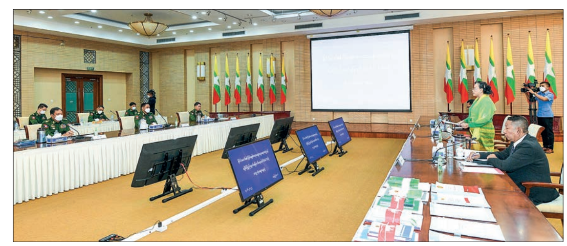
The peace talks between the government's Peace Talks Team and the delegation led by the ALP Vice-Chairperson is in progress.

They then discussed peace and development-related matters. The discussion will continue on 15 June. — MNA