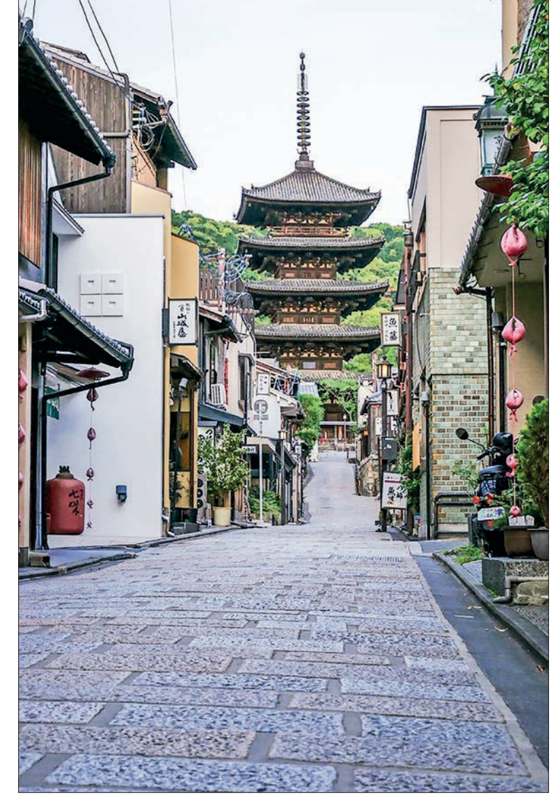
The road in front of temples is paved by Kyoto city for tourists/visitors to make it easier to walk. But temples do not pay the income tax.

On the other hand, expenditures are 32.0 per cent (320.7 billion yen = $2.47 billion) of social welfare expenses, which is higher than the tax revenue collected from residents, and the amount is increasing year by year as the ageing of Kyoto residents progresses. The next largest are industrial-economic expenses 24.1 per cent (241.1 billion yen = 1.85billion dollars), education and culture expenses 11.7 per cent (116.4 billion yen ≒ 900 million dollars), and urban construction expenses 7.8 per cent (77 billion yen ≒ 600 million dollars). Health and hygiene expenses continue to be 6.5 per cent (64.9 billion yen = 500million dollars). Expenditures include subway construction costs and bus route maintenance costs. There is still debate about whether