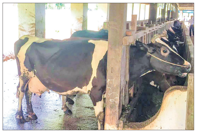
There are approximately 16,000 heads of dairy cattle in Yangon Region, with Jersey accounting for 20 per cent and Friesian constituting 80 per cent.

in dairy farming. In Myanmar, the price of milk evaluates on the measurement mostly. Friesian cattle produce a high milk yield but cow milk contains only 3.5 per cent milk fat. Friesian can produce 10 visses (a viss equals 1.6 kilogrammes) while the milk yield of Jersey is estimated at eight visses. Jersey cow has five per cent milk fat. There are taste differences. However, Friesian cattle are primarily farmed here. Milk composition depends on the types of breed although the same feedstuffs are utilized in dairy farming. We have to look forward to the outlook of the future for milk consumers," said U Min Nyunt Oo, deputy director of the Yangon Region Livestock Breeding and Veterinary Department.