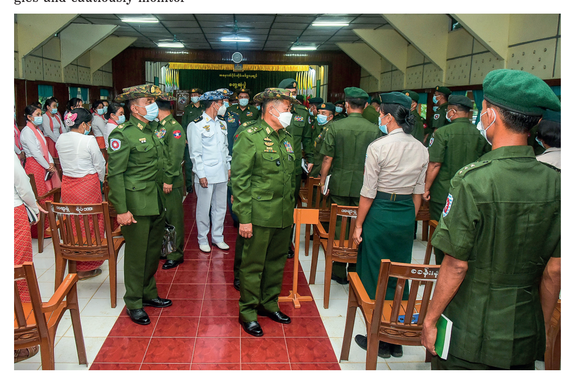
The Vice-Senior General cordially greets Tatmadaw members and families from An Station.

the dangers threatening the country. Despite an unwillingness to cause fighting and armed conflicts due to their experiences, Tatmadaw members sacrifice their lives and limbs in discharging important duties of defending the State.