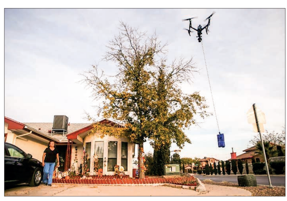
The drones can carry loads as heavy as five pounds (2.2 kilogrammes) in packages about the size of a large shoe box.

AMAZON plans to start flying some purchases to customers later this year, the e-commerce giant said Monday, announcing drone delivery that will debut in a California town.