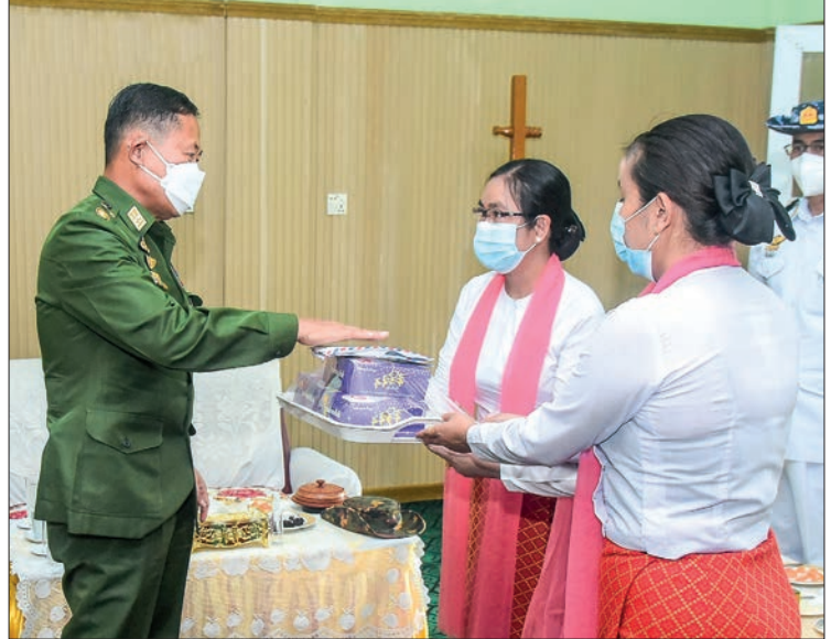
The Vice-Senior General gives foodstuffs to family members of the Kyaukpyu Station.

In inspecting the staff housings of a local battalion in the An station, the Vice-Senior General presented foodstuffs and cash assistance to families of the Tatmadaw members. —