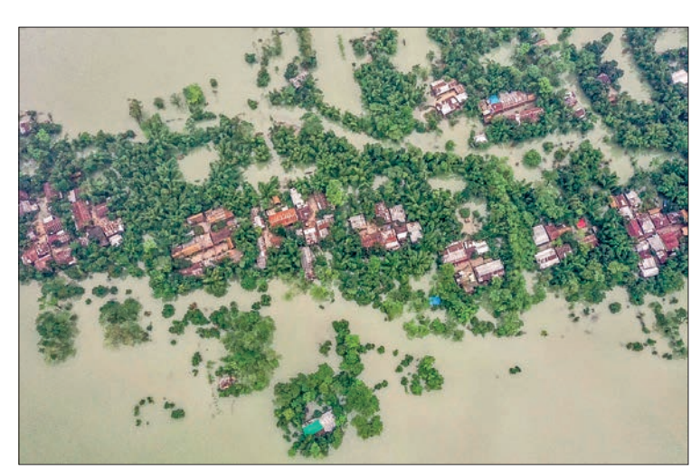
This aerial picture shows a flooded area following heavy monsoon rainfalls in Goyainghat on 19 June 2022.

Assam continued to reel under severe flooding, with 5,140