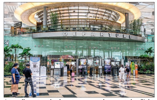
A traveller enters the departure area on her way to her flight from Changi International Airport in Singapore on 11 March 2022.

AIR passengers are ex- an upgraded industry pected to hit 83 per cent of forecast for 2022. pre-pandemic levels this year and the aviation industry's return to profit is "within reach" in 2023, the International Air Transport Association said on Monday.