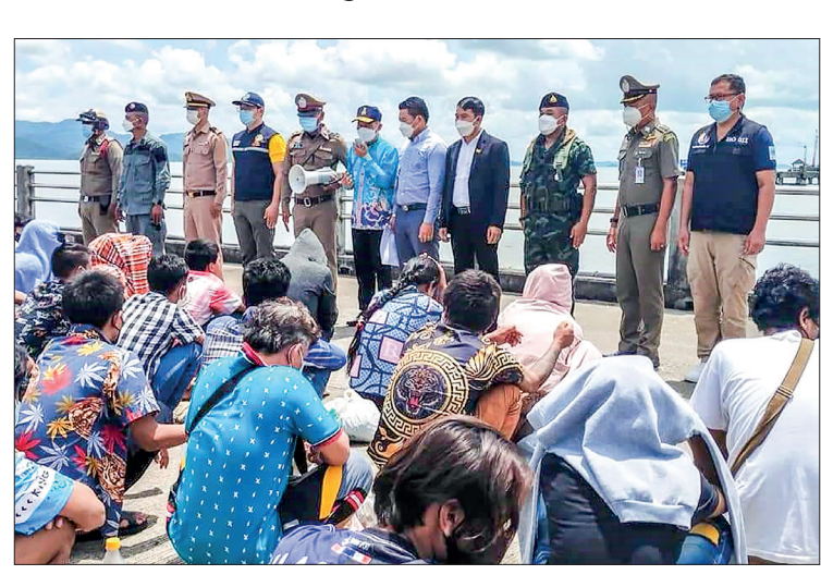
The transferred Myanmar migrants are seen on the Ranong-Kawthoung border.

THAI authorities handed over 155 Myanmar workers to Myanmar authorities on 17 June, said officials.