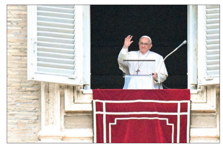
Pope Francis waves from the window of the apostolic palace overlooking St. Peter's square during the weekly Angelus prayer on 19 June 2022 in The Vatican.

As a child, Francis had one of his lungs partially removed.