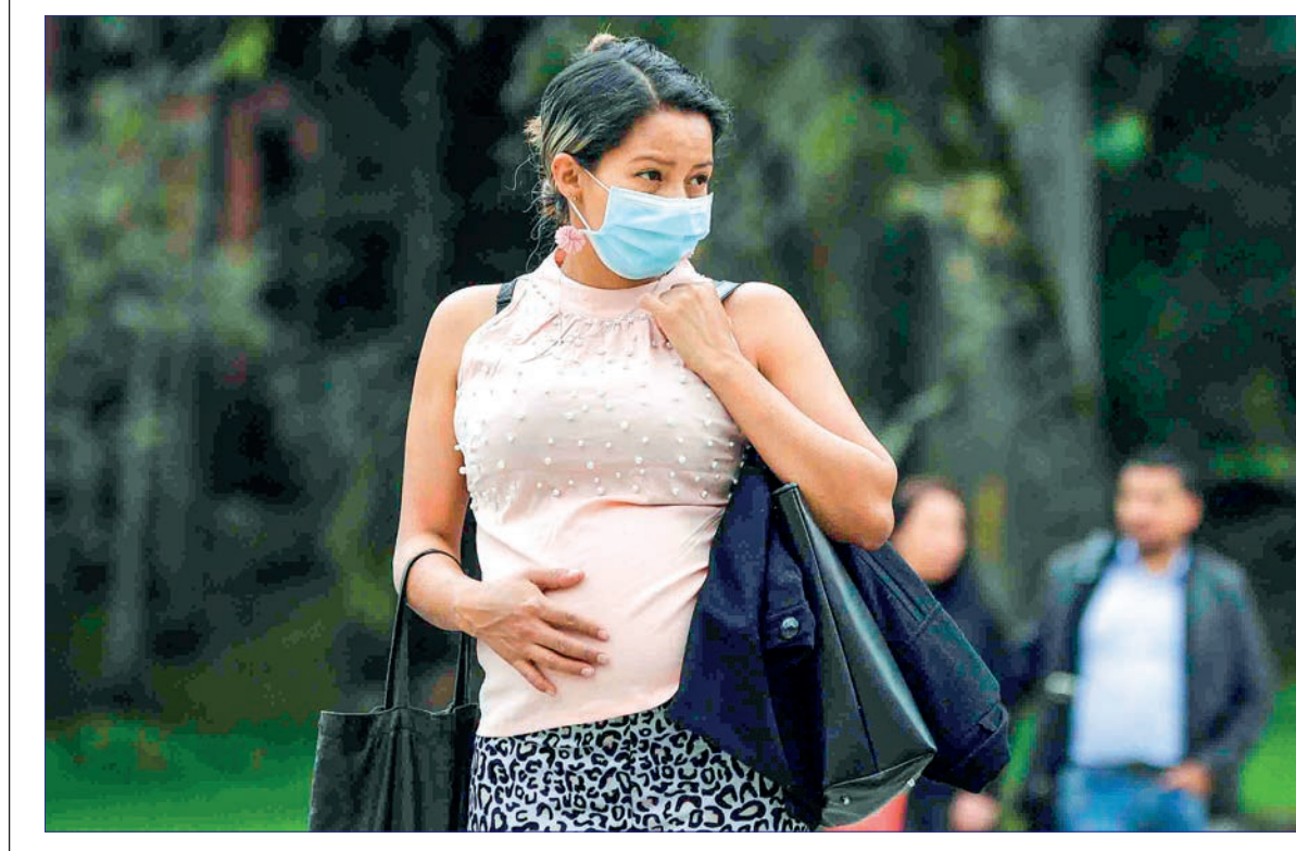
A pregnant woman wears a face mask as a preventative measure against the spread of the new coronavirus, COVID-19, as she waits for the bus in Bogota, on 16 March 2020.

subtle molecular change allows immunoglobulin to take on an expanded protective role during pregnancy, according to a study by the Cincinnati Children's Hospital Medical Centre.