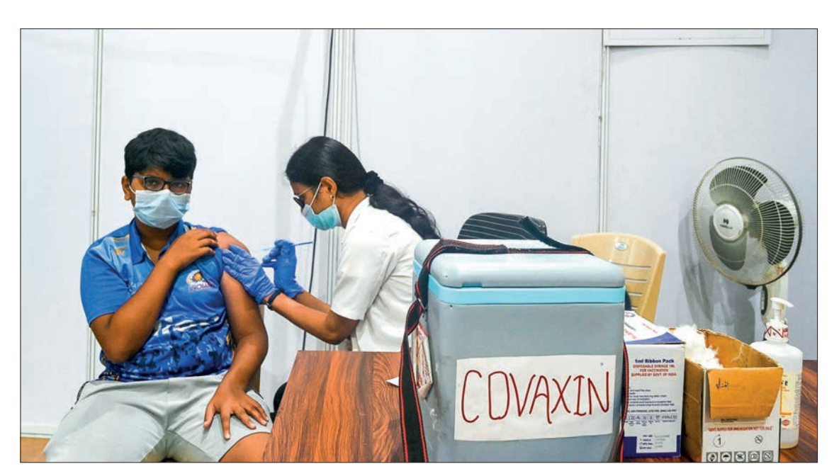
A health worker inoculates a teenage boy with a dose of the Covaxin vaccine against the Covid-19 coronavirus at a vaccination centre in Mumbai on 9 June 2022.

So far, 42,707,900 people have been successfully cured and discharged from hospitals, of whom 8,537 were discharged during the past 24 hours. —Xinhua