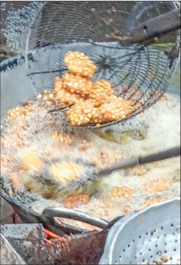
Palm oil is seen at one retail outlet (top). A vendor is frying snacks with palm oil.

THE palm oil price outside Yangon was K8,400 per viss last week and the price fetched about K7,200 per viss this week on 20 June, according to the purchasers.