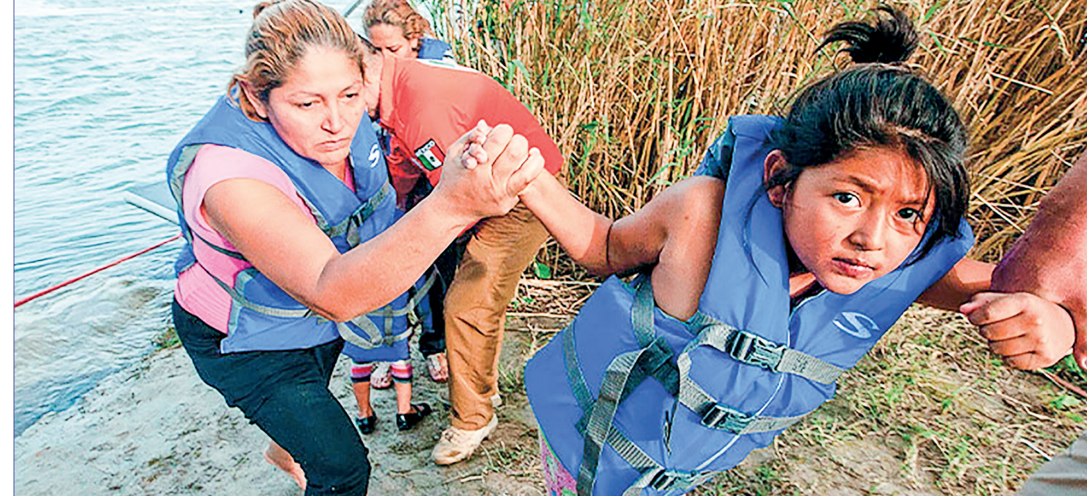
Migrants and refugees can be exposed to various stress factors which affect their mental health and well-being. Central American migrants cross the Rio Bravo into Texas.

The situation is more dramatic for cases of depression, WHO said, pointing to gaps in assistance across all countries - including high-income ones where only one third of people who suffer from depression receive formal mental health care.