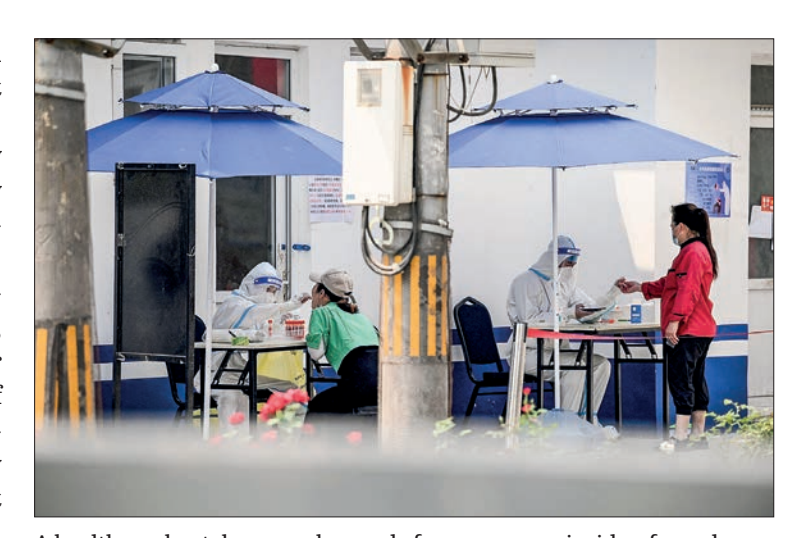
A health worker takes a swab sample from a woman inside a fenced residential area under lockdown due to Covid-19 coronavirus restrictions in Beijing on 20 June 2022.

Each positive case — typically a few dozen a day nationwide — unspools a trail of used test kits, face masks and person-