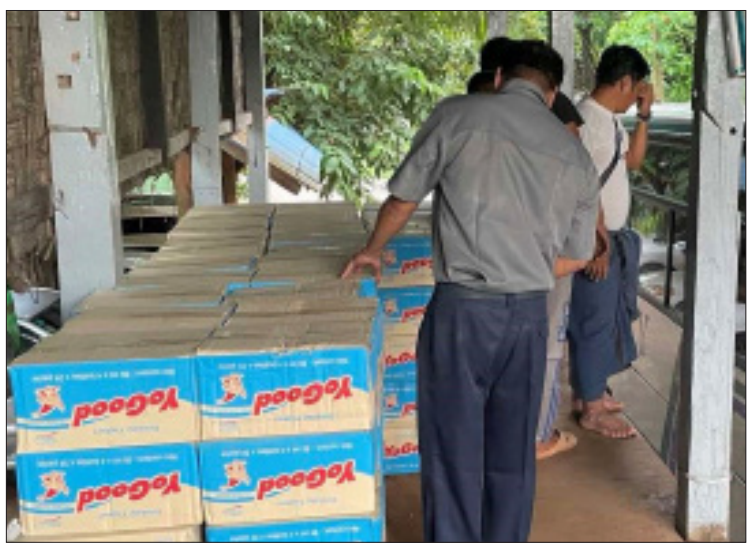
Seized illegal commodities in Mon State.

Therefore, seven arrests (approximately K51,711,644) were made on three consecutive days from 18 to 20 June, according to the Anti-Illegal Trade Steering Committee. — MNA