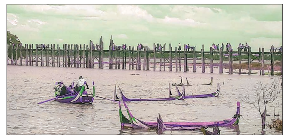
Domestic toursits enjoy boat rides in Taungthaman Lake.

vice does a roaring business with foreign tourists. At present, the tourist arrival is rarely witnessed. local visitors seldomly ride the