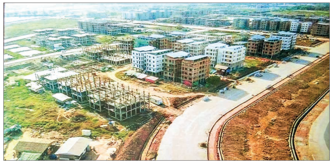
One of the Public Rental Housing projects in Yangon Region.

Maha Bandoola Public Rental Housing is located at the corner of Maha Bandoola Road and No.2 Highway in Dagon Myothit (South) Township. The housing includes 50 eight semi-detached buildings with five floors (1,200 apartments). Yangon Region government supervised the housing project with the fund of K20 billion allocated by the Union Government in the 2015-2016FY and apartment units are rented out. The Department of Urban and Housing Development takes the role of supervising the housing.