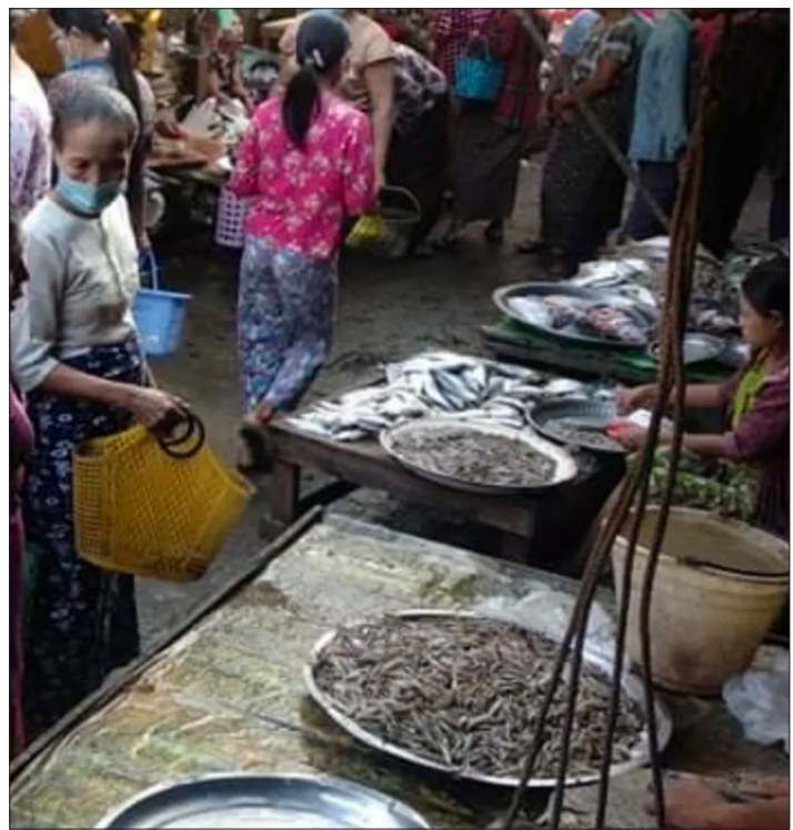
The decrease in prices of fishery products also makes the chicken price drop in the market.

The decrease in prices of fishery products also makes the chicken price drop in the