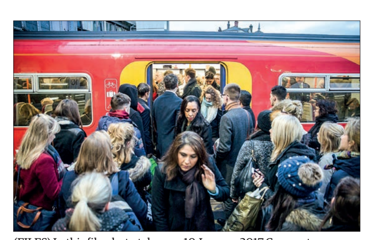
(FILES) In this file photo taken on 10 January 2017 Commuters attempt to board a full Southwest Train carriage toward central London as others alite at Clapham Junction station in London after strike action by Southern Rail caused another morning of travel disruption in the British capital.

BRITAIN'S railway network this week faces its biggest strike action in more than three decades in a row over pay as soaring inflation erodes earnings.