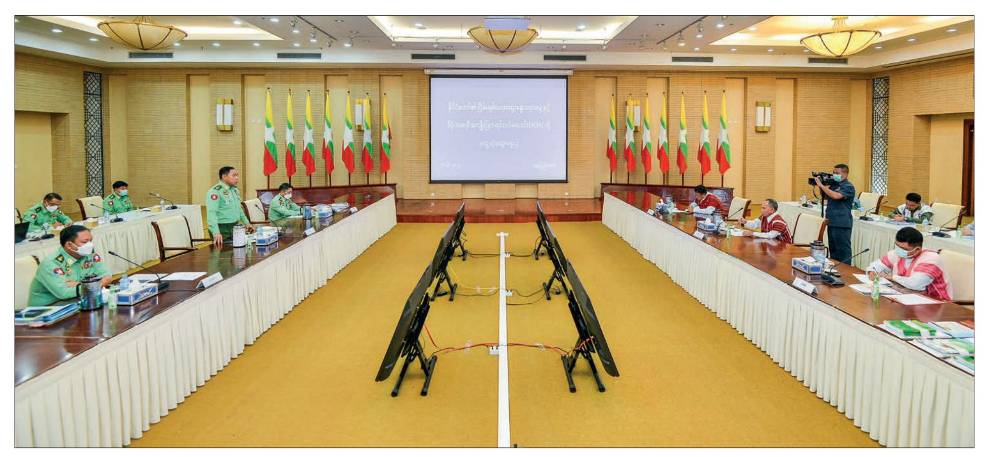
The discussion between the government Peace Talks Team and the DKBA delegation is in progress in Nay Pyi Taw on 20 June 2022.

MEETING between the Peace Talks Team of the State and the Democratic Karen Benevolent Army-DKBA delegation was held at the National Solidarity and Peacemaking Centre in Nay