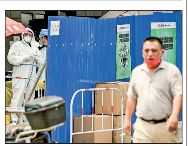
A health worker (L) wearing a personal protective equipment (PPE) works inside a fenced residential area under lockdown due to Covid-19 coronavirus restrictions in Beijing on 20 June 2022.

"We hope that China is really waking up," Bettina Schoen-Behanzin, vice-