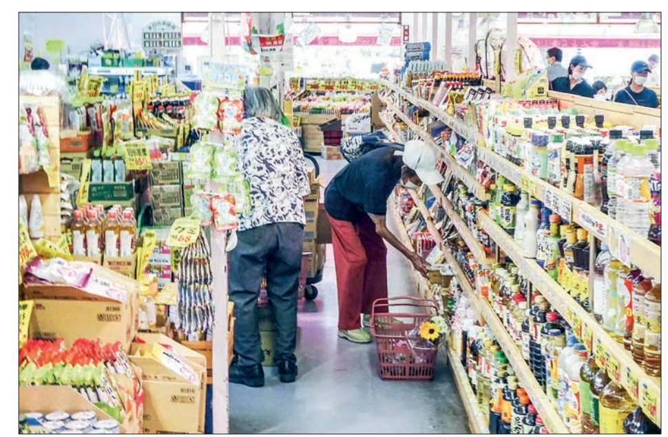
Customers shop at a supermarket in Tokyo on 20 June 2022.

Raw material and crude oil costs have risen in line with higher demand as economies recover from the coronavirus pandemic and due to global supply chain disruptions. Japan has also seen the