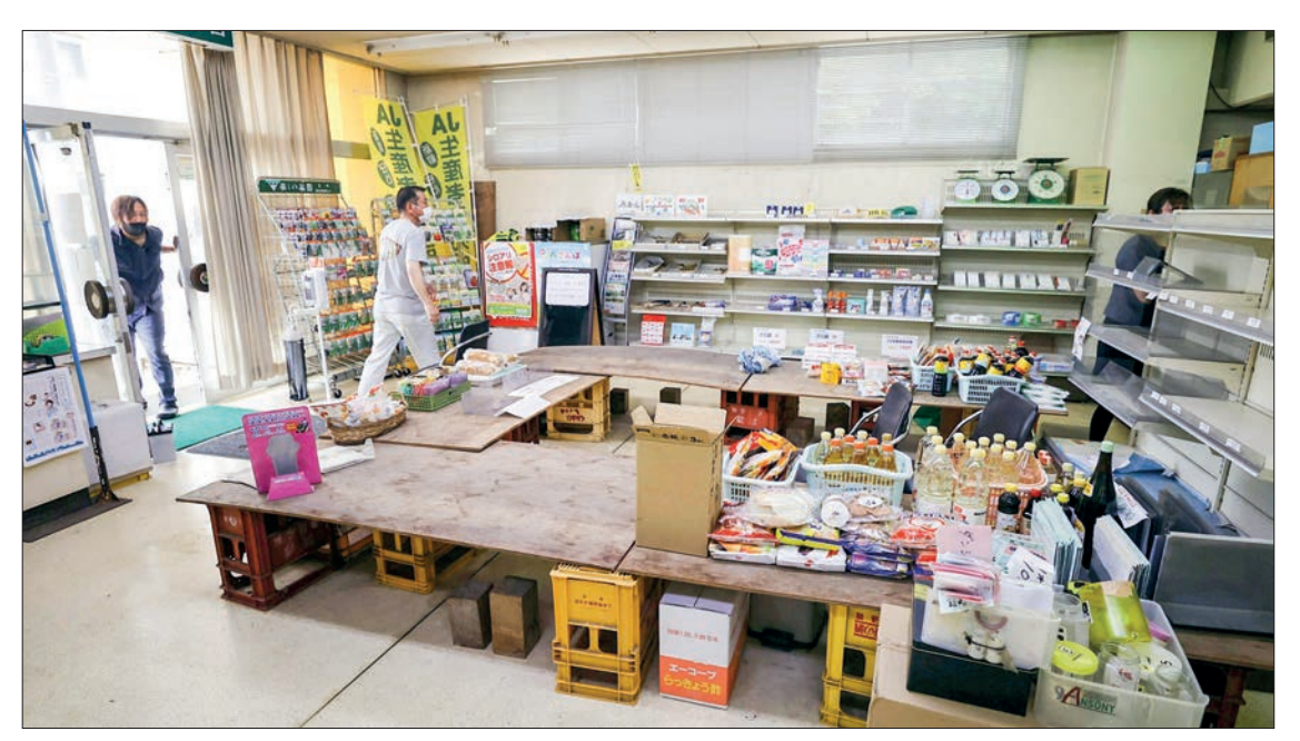
People call on others to evacuate as a strong earthquake hit Suzu, Ishikawa Prefecture, at 10:31 am on 20 June 2022, just as they were cleaning up merchandise that had fallen off the shelves due to another strong quake a day earlier.

At around 3 pm Sunday, an earthquake with an estimated magnitude of 5.4 struck the region, leaving at least six people injured in Ishikawa. It registered lower 6 on the Japanese intensity scale in Suzu. —Kyodo