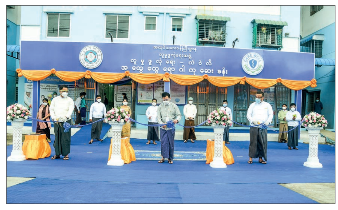
The Social Security Board of the Ministry of Labour opens a clinic in Dagon Myothit (Seikkan) Township.

There are 33,868 workplaces covered by the social security benefits and 1,107,338 insured workers. The insured workers are entitled to receive free medical treatment for any illness, financial benefits for illness, maternity and death, access to healthcare for children under a year old of an insured woman, financial benefits for injuries, temporary/permanent disability and death in the workplace, financial benefits for the death of the insured worker, funeral, and his/her family. — TWA/GNLM