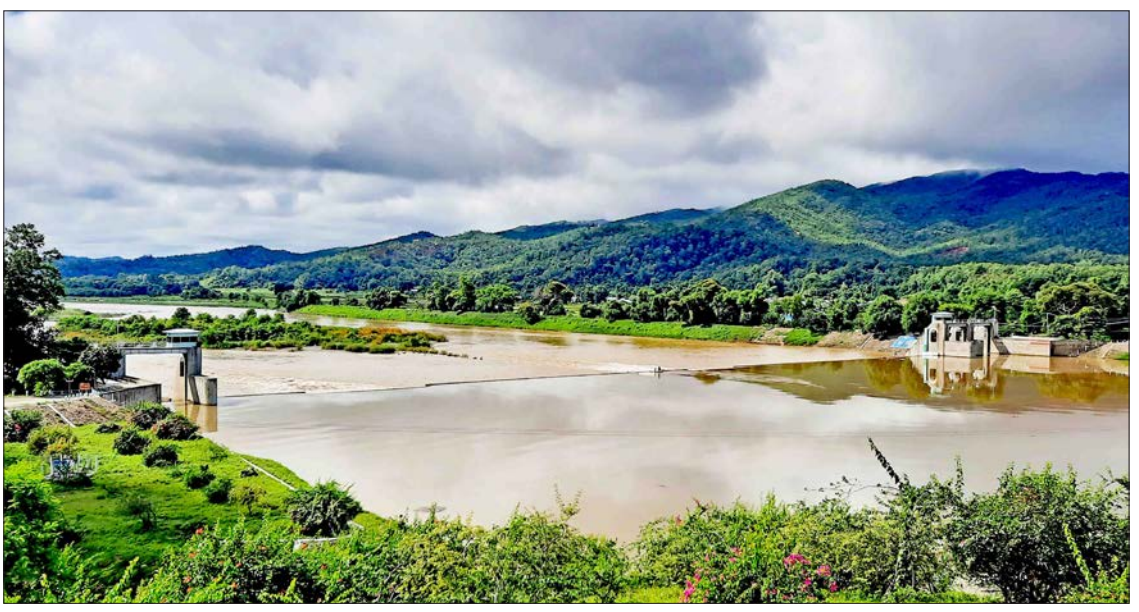
An undated photo shows the scenic view of the Mezali diversion weir in Magway Region.

"Our department has been irrigating farming acres since 15 June. We distribute agricultural water through a network of canals and ditches from the dam so that the locals efficiently utilize the water supply and meet