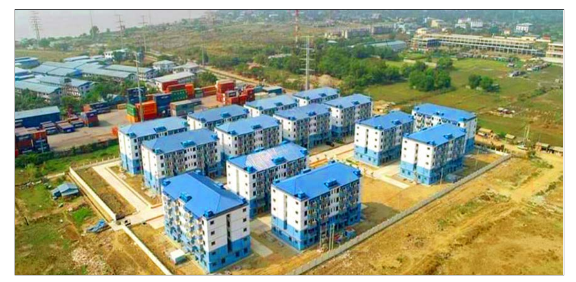
One of the Public Rental Housing projects in Yangon Region.

gon Myothit (South) Township, eastern Yangon District.