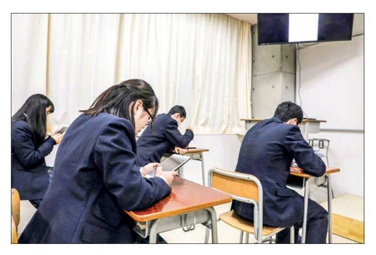
Most of the 48 foreign IT companies, including Google LLC, Meta Platforms Inc. and Twitter Inc., that have received registration requests from the Justice Ministry and the communications ministry have so far failed to comply. Smartphone and tablet computer apps are seeing increasing use in Japanese schools.

According to Japan's corporate law, local representatives of a foreign company that fails to register despite an intent to conduct business in Japan will be subject to a fine of up to one million yen ($7,400).—Kyodo