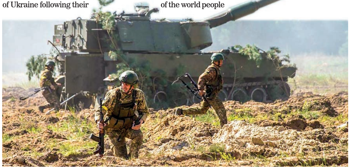
Self-propelled howitzers M109A3 shooting on the front line with Russian troops in an unknown place of Ukraine.