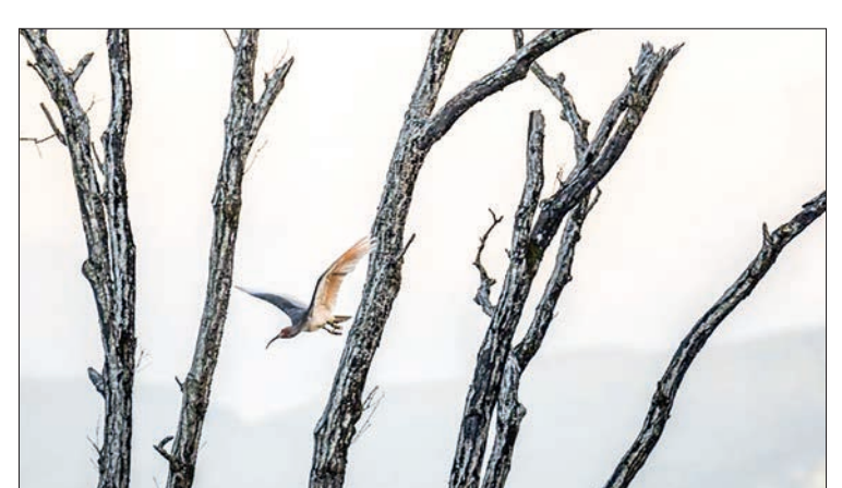
Wild tokis have been brought back from local extinction on Japan's Sado island.

where the bird's delicate pink plumage and distinctive curved beak now draw tourists. It's a rare conservation success story when one in eight bird species globally are threatened with extinction, and involved international diplomacy and an agricultural revolution on a small island off Japan's west coast.—AFP