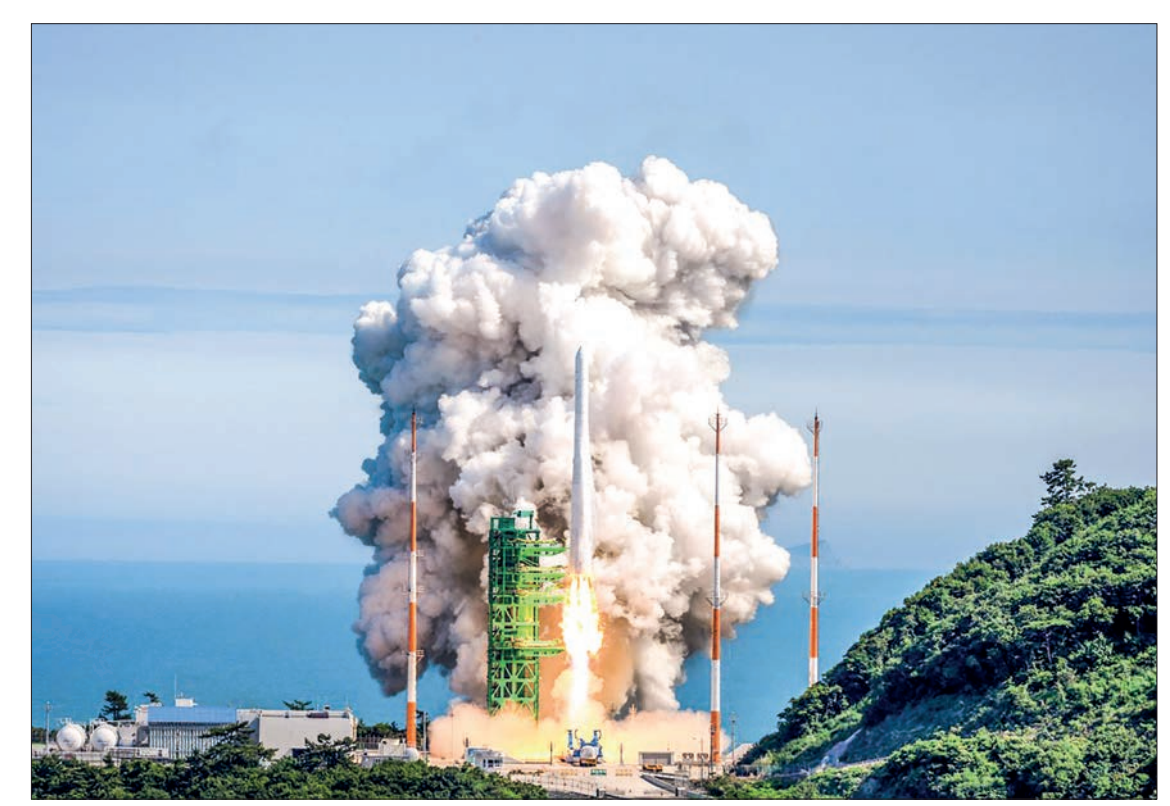
South Korea's 'Nuri' rocket successfully reached its target altitude of 700 km and put a satellite into orbit.

"Nuri separates dummy satellite," South Korea's YTN Television reported minutes after lift-off, adding shortly after that the launch "appears to be a success". In Tuesday's test, in addition to the dummy satellite, Nuri carried a rocket performance verification satellite and four cube satellites developed by four local universities for research purposes.—AFP