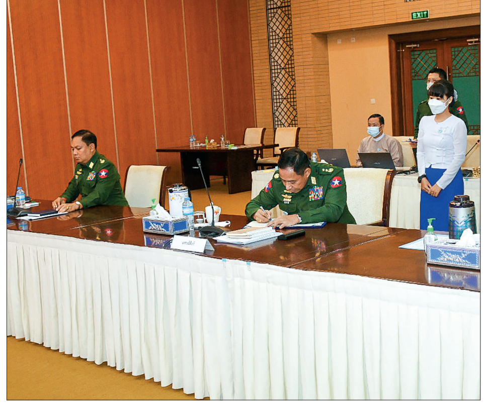
The State Peace Talks Team leader and the DKBA delegation leader are pictured signing the agreements received during the three-day peace talks in Nay Pyi Taw on 21 June 2022.

HE State Peace Talks Team met represent-Solidarity and Peacemaking Centre's meeting room in Nay Pyi Taw yesterday.