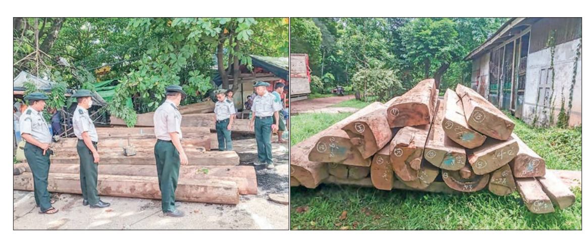
Officials confiscate timbers in Yangon Region.

They confiscated K2 million worth of a Toyota Mark II car and K2.5 million worth of a Toyota Alphard car in Yenangyoung