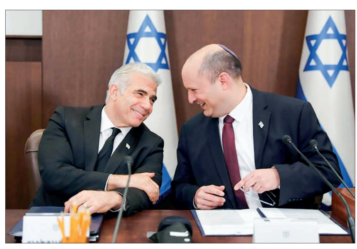
Israeli Prime Minister Naftali Bennett has said Foreign Minister Yair Lapid will take over as premier within days.

Bennett said that Lapid, a centrist, will take over as prime minister of the caretaker government in line with last year's power-sharing deal.—AFP