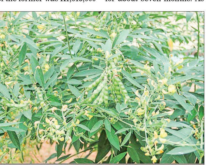
Pieces of pigeon peas (top right) and a plantation of pigeon peas

Of many types of pigeon peas, the red type is the most expensive, and hence, most cultivated. In the last week of August 2017, the Yangon pulses market was closed for four days due to a temporary ban on pulses imports to India for about seven months. As