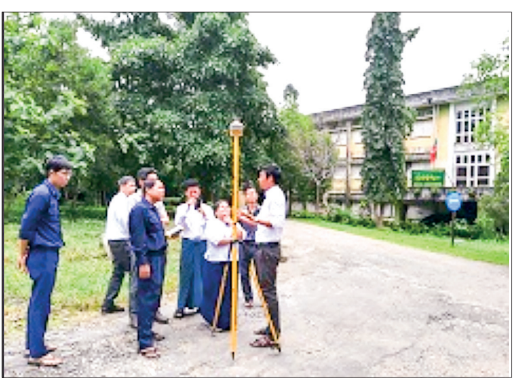
Yangon's first Informative Digital Map project is underway.

Urban planning staff and JICA Team staff were divided