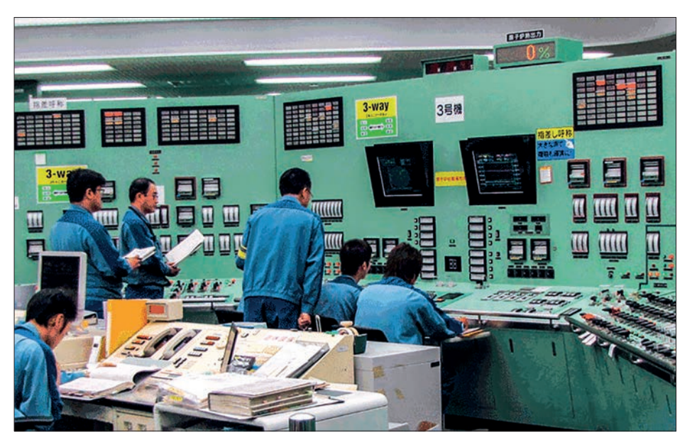
In this September 2010 photo, Tokyo Electric Power Co. workers are seen at work at the central control room of reactor Unit 3 of the Fukushima Dai-ichi nuclear complex at Okumamachi, northeastern Japan.

PRIME Minister Fumio Kishida said Tuesday the government plans to ease the impact of rising electricity prices on the public by awarding power-saving households points that can be used to help lower their utility bills.