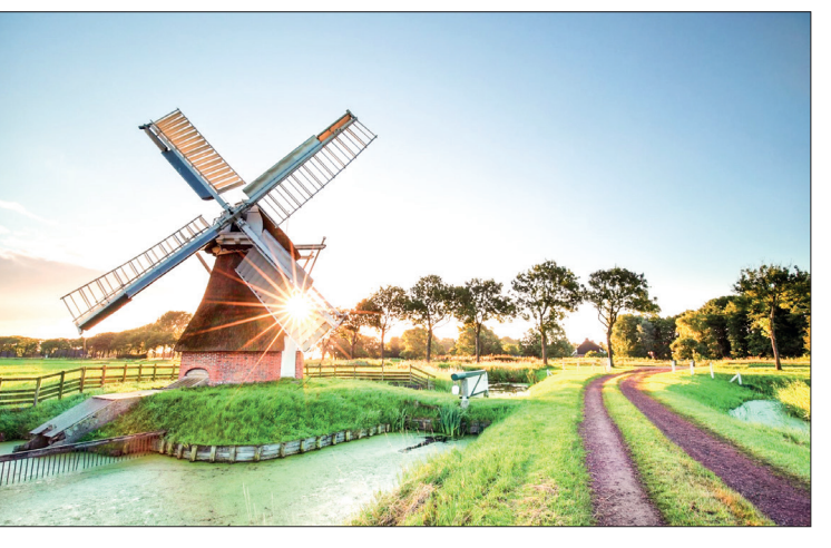
Several Dutch villages are known for their concentration of windmills, including Kinderdijk, Zaanse Schans, and Schiedam, home to the tallest windmill in the world.

Berlin and Vienna made similar announcements on Sunday as Moscow, facing biting sanctions over Ukraine, cuts