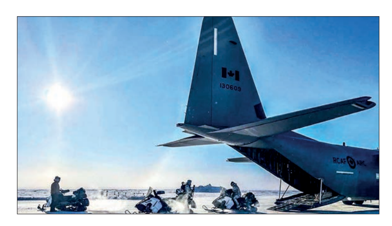
US Special Forces loading snowmobiles onto a Canadian aircraft during an exercise on 12 March.

CANADA'S defence minister announced upgrades to Arctic air and missile defences with the United States on Monday, citing growing threats from Russia and new technologies such as hypersonic missiles.