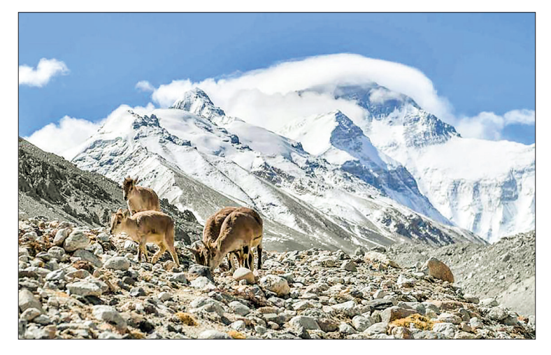
Animals live wild on the slopes of Qomolangma, the Tibetan name for Everest.

A repeatedly postponed UN summit tasked with protecting nature and halting accelerating