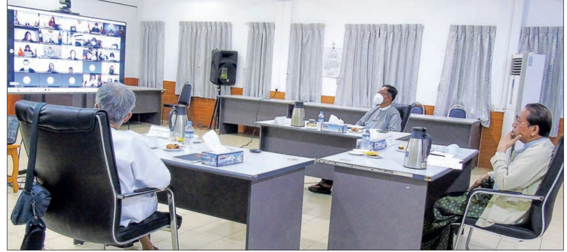
A virtual meeting of the AICHR and SEANF is in progress.

THE ASEAN Intergovernmental Commission on Human Rights (AICHR) and the Southeast Asia (SEANF) held a virtual meeting today.