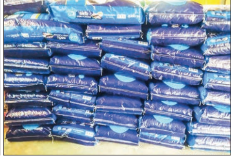
Seized illegal feedstuffs in Kayin State.