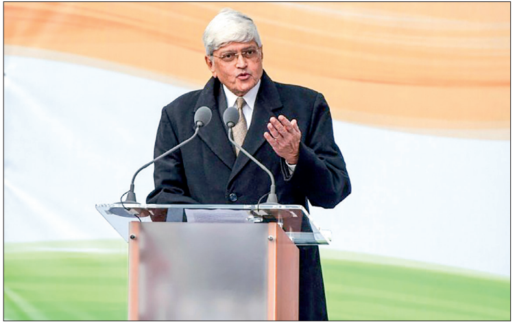
Gandhi was governor of West Bengal state between 2004 and 2009 after being appointed by the then-ruling Congress party.

The BJP is likely to announce its own candidate this week and may again put forward the incumbent, Ram Nath Kovind, a member of India's marginalised Dalit community, to serve another term.— AFP