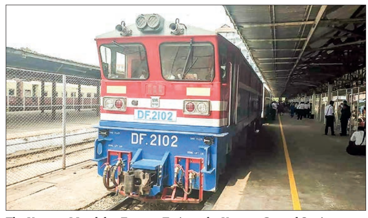
\label{thm:continuous} The \ Yangon-Mandalay \ Express \ Train \ at the \ Yangon \ Central \ Station.

MYANMA Railways is planning to resume express trains soon, which have been temporarily suspended, with a cheaper fare than long-distance express buses to make it easier for the public. This includes the No 5 Yangon-Mandalay up train and the No 6 down train, No 61 Yangon-Pyay up train and the No 62 down train.