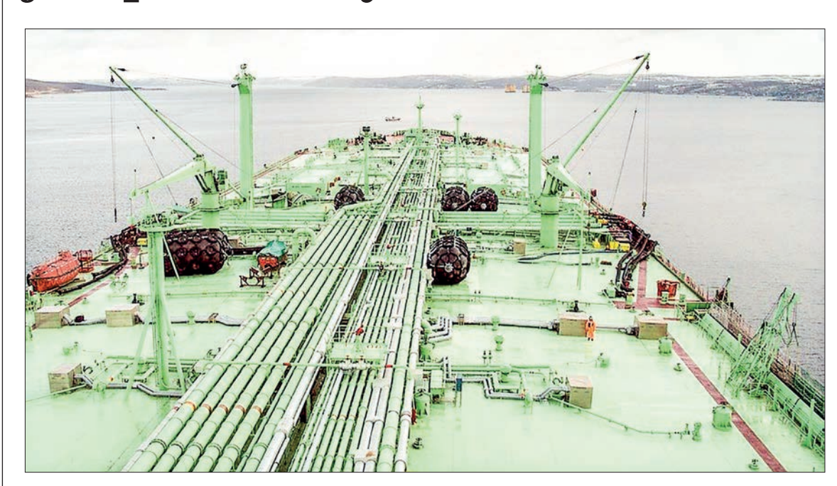
A picture shows the "Rosneft" oil tanker "Belokamenka" anchored in Kola bay, near the Russian nothern seaport of Murmansk.

CHINA'S imports of oil from Russia rose 55 per cent in May, customs data showed on Monday, with the West sanctioning fuel imports from Moscow over its invasion of Ukraine.