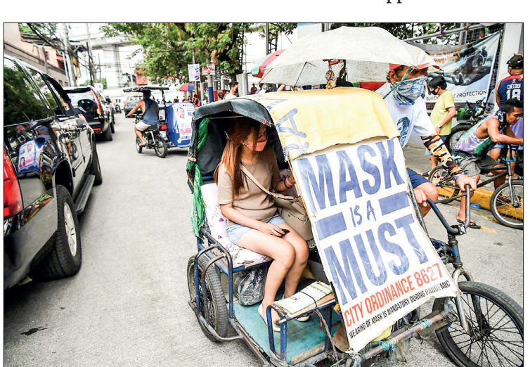
A passenger sits inside a tricycle covered with a reminder to wear a mask, part of the Covid-19 health protocols in Manila on 16 Febautry 2022.

four COVID-19 waves since the pandemic hit the country in Jan-