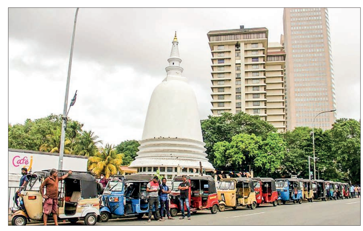
Motorists queue to buy scarce petrol in Colombo earlier this month as Sri Lanka grapples with shortages of essential goods.

Long queues form outside gas stations each day for scarce petrol supplies, while regular blackouts and runaway inflation