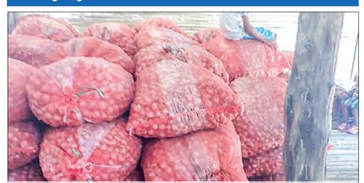
The onions are grown in Mandalay, Magway and Yangon regions, Nay Pyi Taw and Shan State.

THE prices of onions in the Pyay market, Bago Region jumped to K2,000 per viss (a viss equals 1.6 kilogrammes), which reflects an increase of K800 within two weeks.