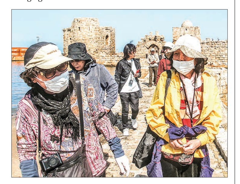
Japanese tourists wearing health face masks, due to fears of COVID-19 coronavirus, tour in the Sidon Sea Castle in the southern Lebanese city of Sidon on 7 March 2020.

Reservations show that three quarters of the arrivals will be Lebanese nationals from the diaspora, he said.— AFP