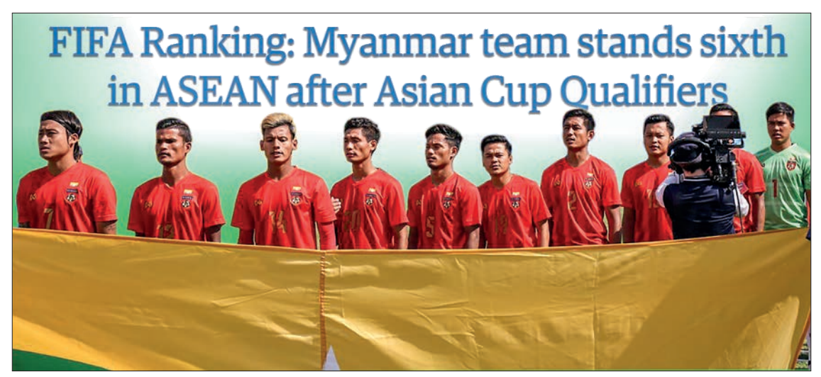
Myanmar national footballers sing the National Anthem before their Asian Cup Qualifiers match against Singapore on 14 June 2022.

THE Myanmar men's national football team is currently standing sixth in the ASEAN region and ranked 158th in the world with 1,012 points, according to the FIFA rankings released after the third round of Asian Cup Qualifiers.