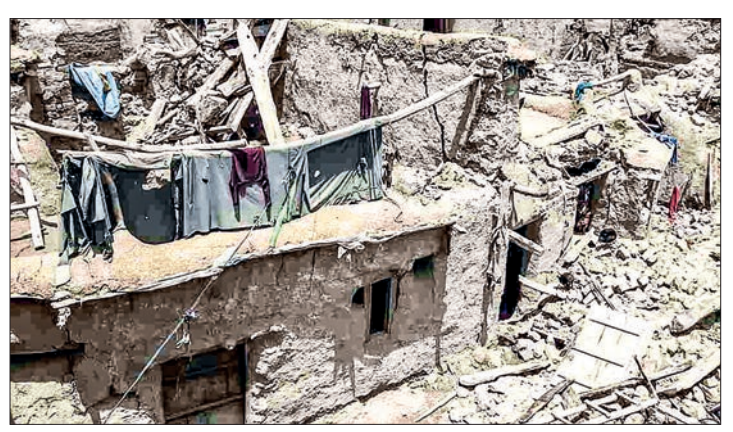
Damaged houses are pictured following an earthquake in Gayan district, Paktika province in Afghanistan on 22 June 2022. PHOTO:

The death toll climbed steadily Wednesday as news of casualties filtered in from hard-to-reach areas in the mountains, and the country's supreme leader, Hibatullah Akhundzada, warned it would likely rise further.—AFP