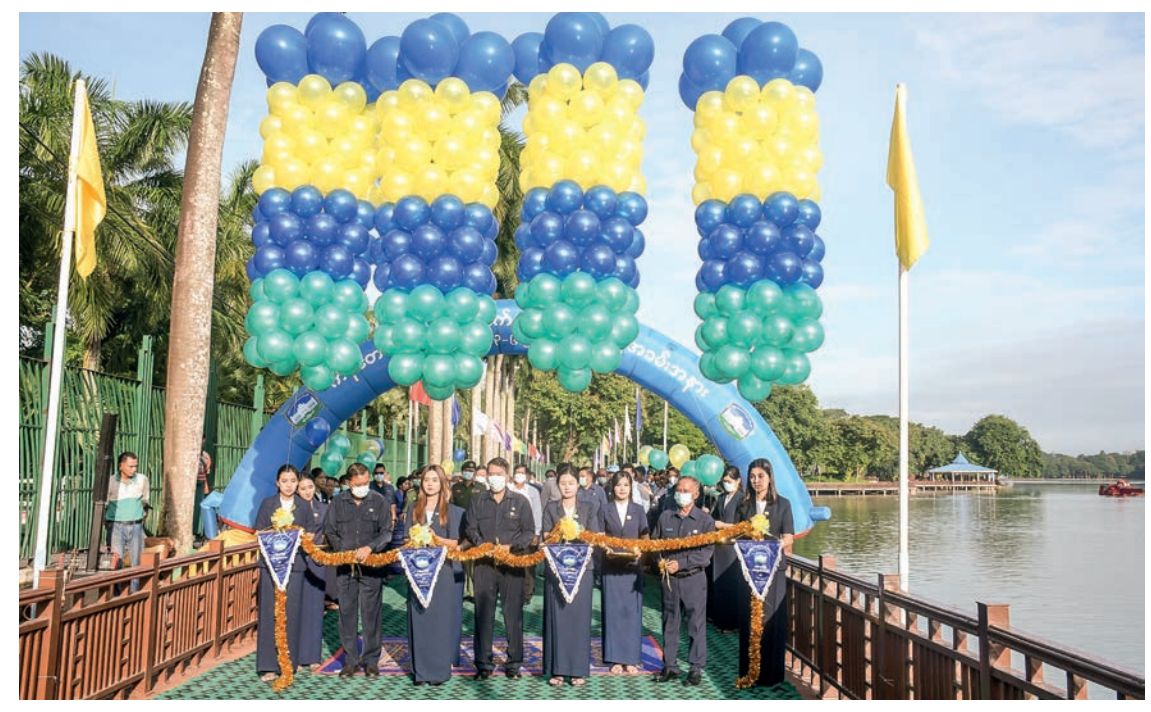
The Yangon mayor and officials cut the ribbon to reopen the walking bridges in Kandawgyi Park yesterday.

There are seven pedestrian bridges in the lake, 886 feet from Karaweik Park to Baganlone Island Park, 3,205 feet from Baganlone Island Park to the former Aquarium Park, and 2,170 feet from the Former Aquarium Park to Pearl Island Park, 520 feet from Pearl Island Park to Maha Myaing Island Park, 350 feet from Freshwater Fish Park to Bogyoke Park, 126 feet from Bogyoke Park to Rock Garden Island, 70 feet from Bogyoke Park to Oval-Shape Walking Bridge. The total length of the bridge is