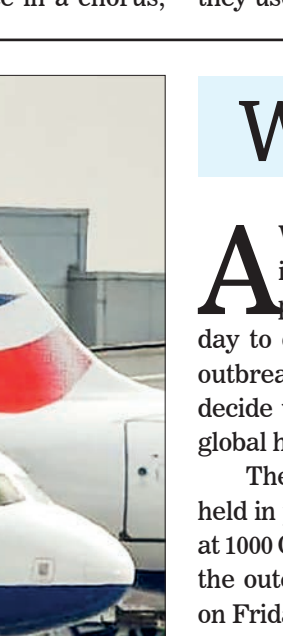
British Airways said on Wednesday (22 June) that it is working closely with Singapore health authorities after the country confirmed one imported case of monkeypox.