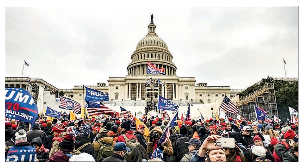
Pro-Trump supporters stormed the US Capitol following a rally with President Donald Trump on 6 January 2021.

The most prized haul though will be hours of footage