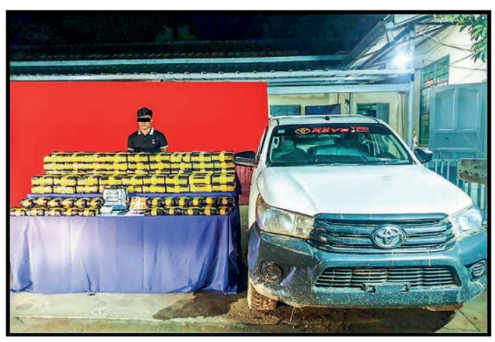
The suspect is pictured along with seized drugs and a vehicle.

HEROIN and stimulant tab- cording to the information lets worth over K300 million were confiscated in Namhkam, northern Shan State, according to the Myanmar Police Force.