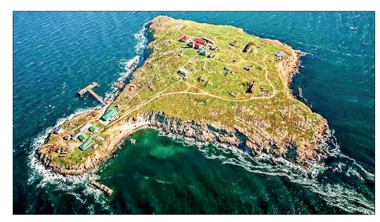
Zmiinyi (Snake) Island is located 48 kilometres (30 miles) south of Ukraine's mainland in the Black Sea.

"On 20 June at 5:00 am, the Kyiv regime undertook another mad attempt to take possession of Snake Island," Russia's defence ministry said in a briefing.