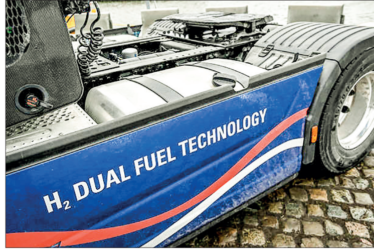
Illustration picture shows a truck with hydrogen fuel technology.

AS Europe seeks to move way from fossil fuels, Spain is racing ahead in developing green hydrogen, aided by a growing wind and solar power complex in efforts to decarbonize its economy.