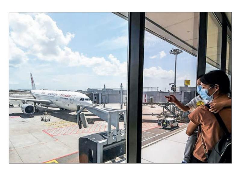
Passengers of a chartered flight wait for boarding at Singapore Changi Airport in Singapore, 5 February 2020.

According to a MOH statement issued here on Tuesday night, the patient is a 42-year-old male British national who works as a flight attendant and was in Singapore between 15-17 June and again on 19 June as he flew in and out of Singapore. He was tested positive for monkeypox on 20 June.— Kyodo /Xinhua