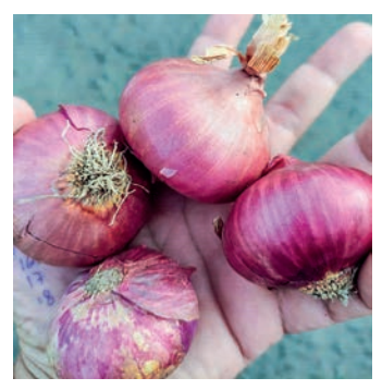
Onions from China are seen entering the Yangon market on

In 2022, the people will grow monsoon onion earlier and the new monsoon onion will enter the Yangon market in early December. —TWA/