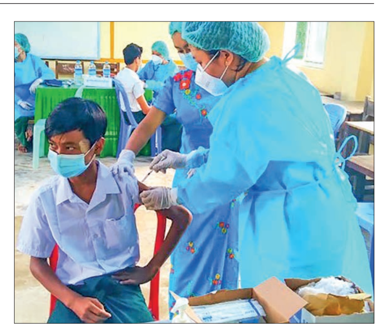
A student in Kyaukyu Township in Rakhine State gets COVID-19 vaccine shot.

It is reported that officials from the respective Military commands visited the site and coordinated the necessary work.