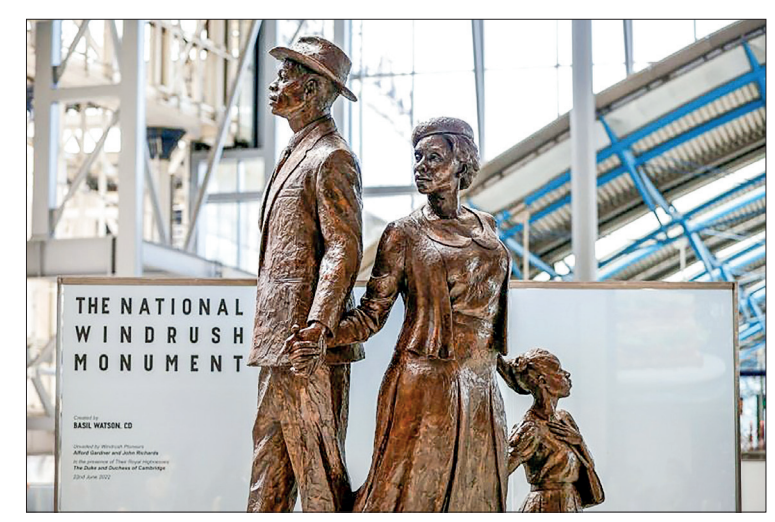
Prince William unveiled the new national monument to the 'Windrush' generation of Caribbean migrants who moved to Britain following World War II.

monument followed a scandal that first emerged in 2017 and caused much soul-searching about racism past and present in Britain.—AFP