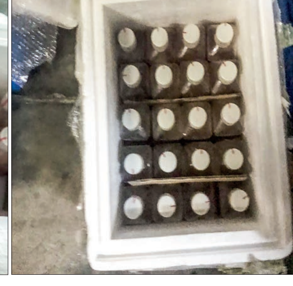
Seized goods at Yangon International Airport.

Similarly, inspections were carried out under the supervision of the Kayin State Anti-Illegal Trade Task Force on 22 June.