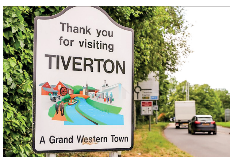
Dems the Conservative party's 24,000-majority in a by-election in Tiverton and Honiton in southwest England on Thursday.

His ruling Conservatives are tipped to lose both contests, for the parliamentary seats of Tiverton and Honiton in southwest England and Wakefield in the north, after both Tory MPs resigned in disgrace.