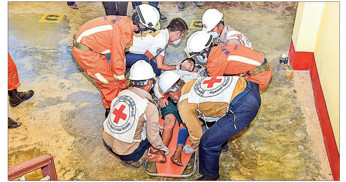
A demonstration of role-play drill in response to the earth quake.

TWELVE townships in Yangon Region have conducted earthquake preparedness drills for 15 times, according to the Ministry of Social Welfare, Relief and Resettlement.