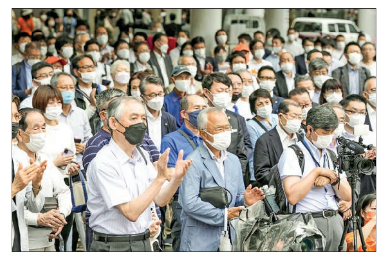
People listen to a politician making a stump speech in Nagoya on Wednesday, the first day of campaigning for the 10 July House of Councillors election.

OFFICIAL campaigning began Wednesday in Japan for the House of Councillors election on 10 July, as the ruling and opposition parties rush to address inflation concerns and spar over whether a more robust defence posture is necessary in the wake of Russia's war on Ukraine.