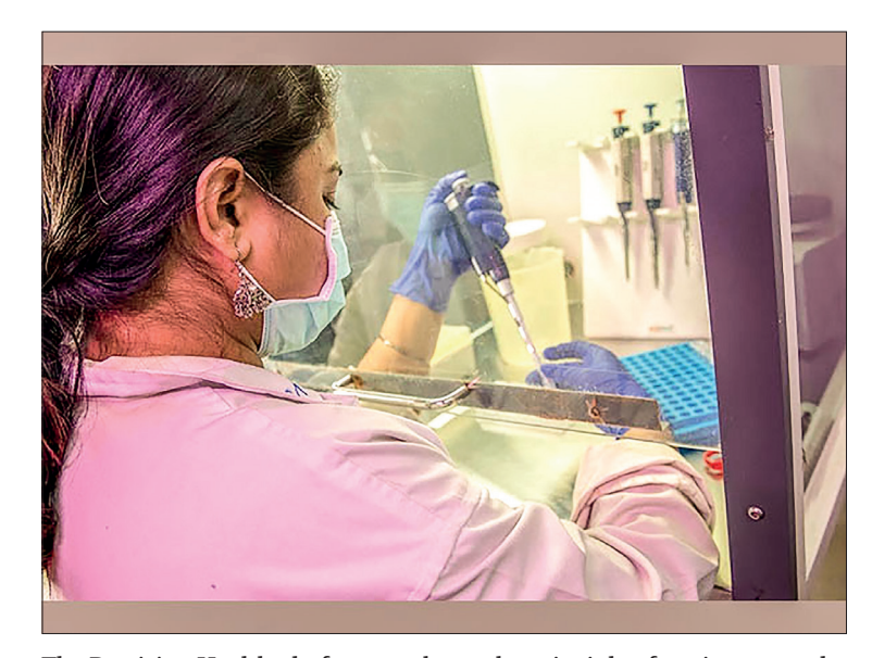
The Precision Health platform works on the principle of environmental surveillance.

THE Government of Karnataka through the Bruhat Bengaluru Mahanagara Palike (BBMP) with support from COVIDActionCollab (CAC) and its partners celebrated the successful