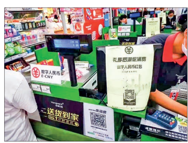
Photo taken on 12 Oct 2020 shows a sign reminding customers that digital yuan is accepted at a supermarket in Shenzhen, south China's Guangdong Province.

Consumption scenarios have been the primary test ground of the digital yuan. Many Chinese cities have leveraged e-CNY coupons to invigorate local consumer spending after COVID-19 outbreaks snarled consumption.—Xinhua