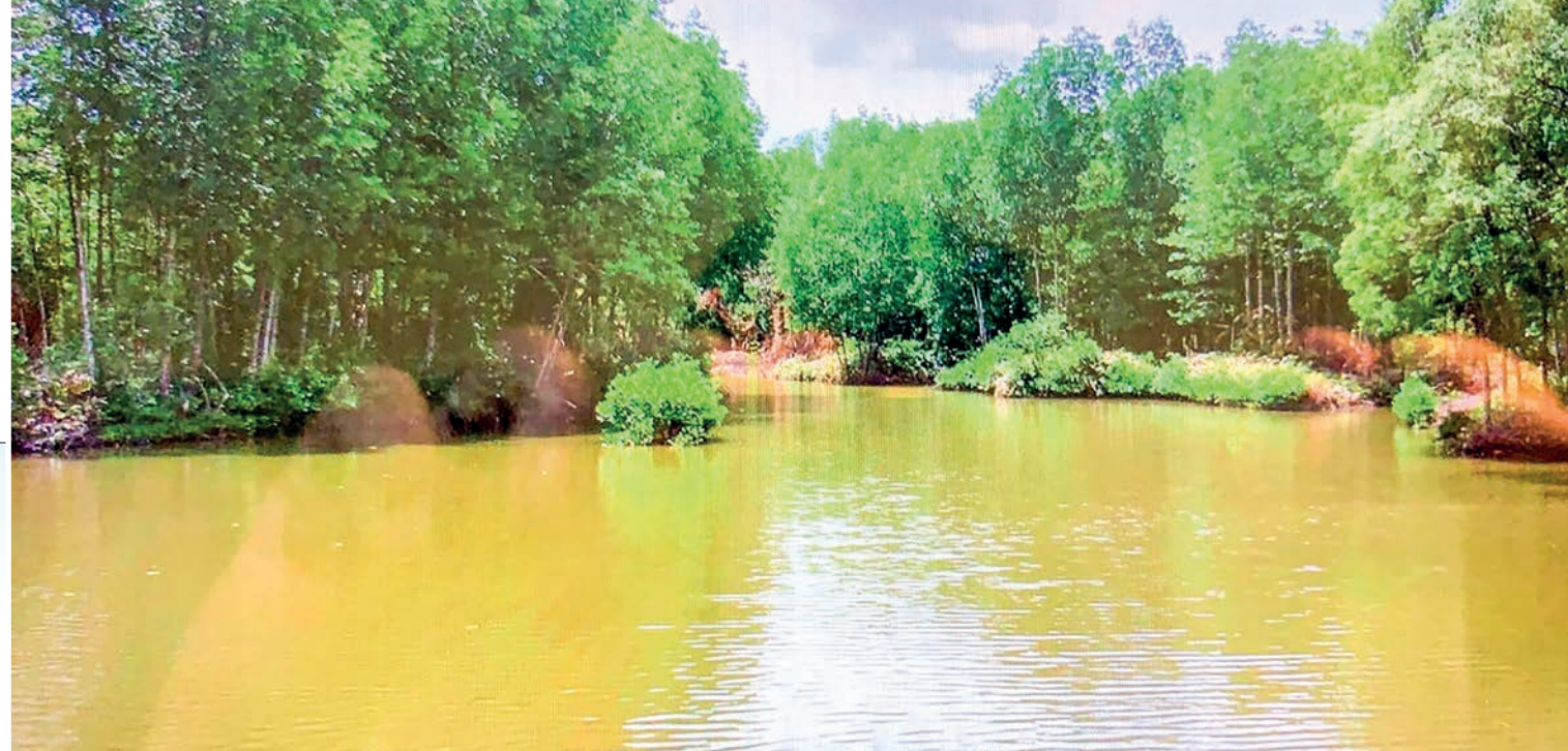
The freshwater fish and prawns farming with non-degradation of the mangrove.

Rakhine State Economic Affairs Minister U San Shwe Maung met with local livestock