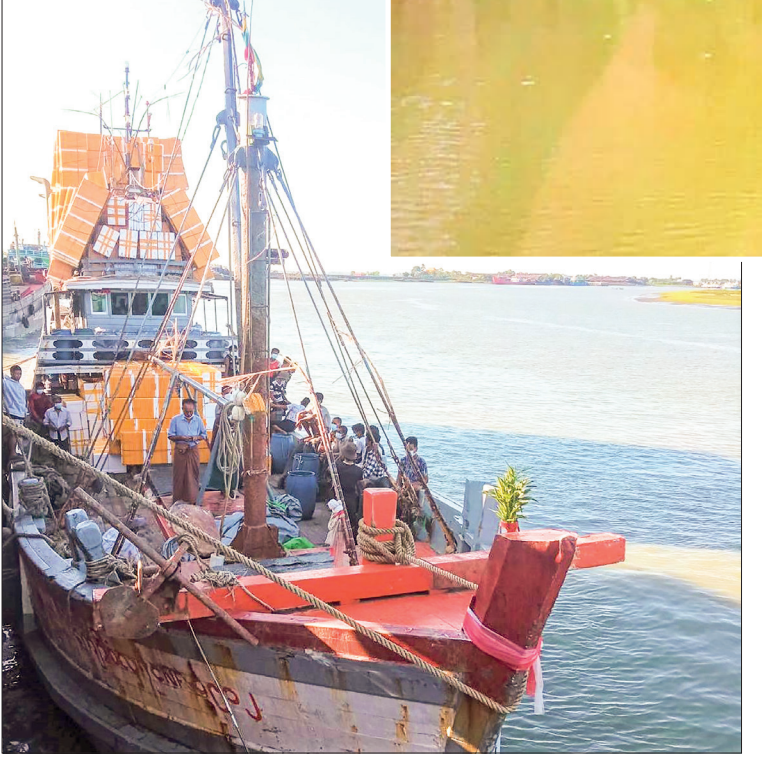
Fishery products are exported to Bangladesh through the Maungdaw border.

farming business persons on 15 June and discussed plans to support techniques for freshwater fish, prawn and soft-shell crab businesses and to organize fishery associations to grant loans.