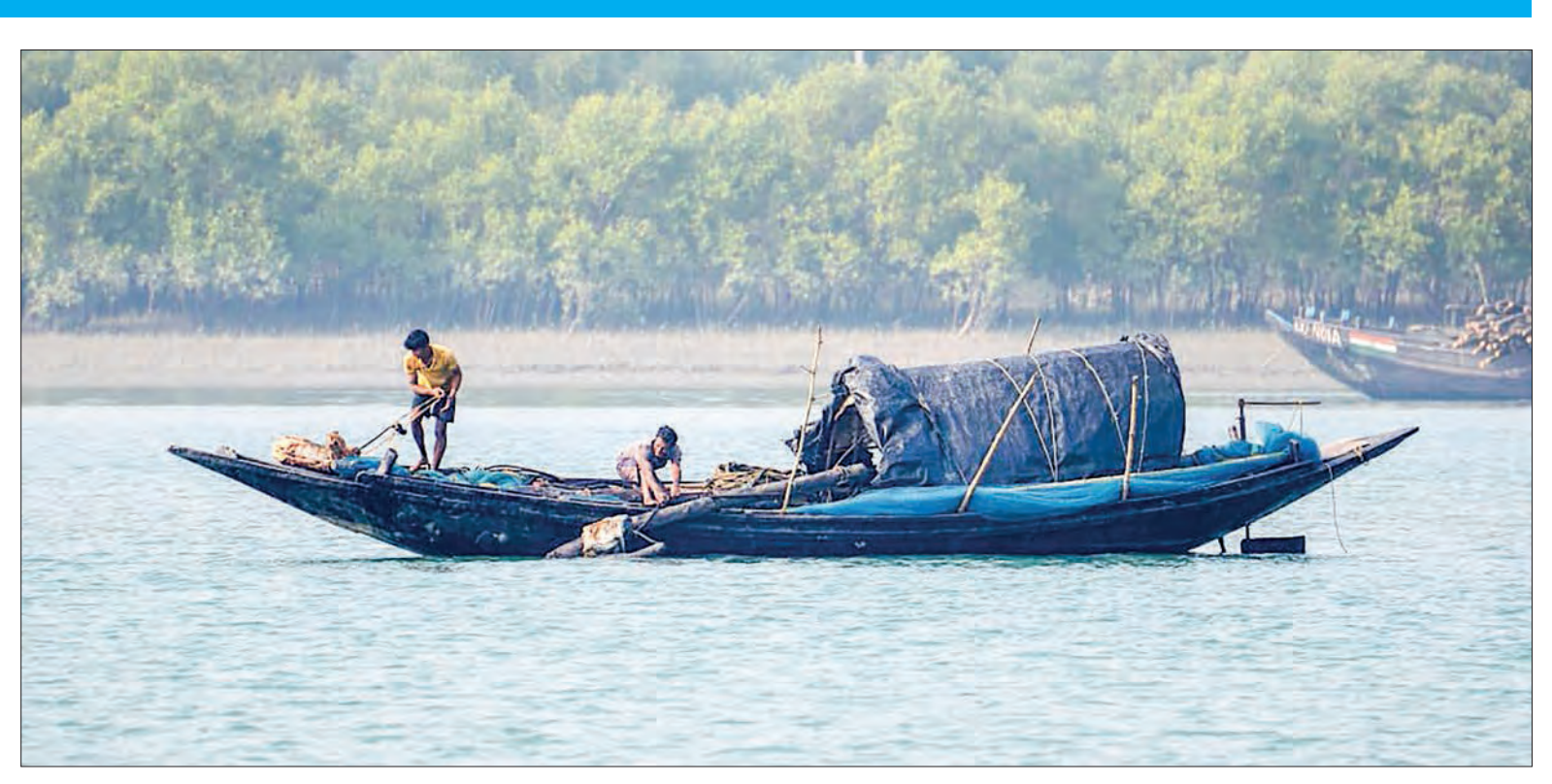
From the mangroves of West Bengal to the vast archipelago that makes up Indonesia, and from the bustling port city of Guayaquil, Ecuador, to the tropical shores of southern Togo, systemic risks from the COVID-19 pandemic have been exposed in stark human terms. Indian Fishermen catch fish on a oggy morning on the Matla river in the Sundarbans delta, some 120 kms southeast of Kolkatta.

The report, "Rethinking risks in times of COVID-19" shows how, in each of these four locations part of five field studies carried out in 2021 by the UN University's Institute for Environment and Human Security (UNU-EHS) and the UN Office for Disaster Risk Reduction (UNDRR) - a clear picture emerges of a domino effect, resulting from the outbreak of COVID-19, that rippled across