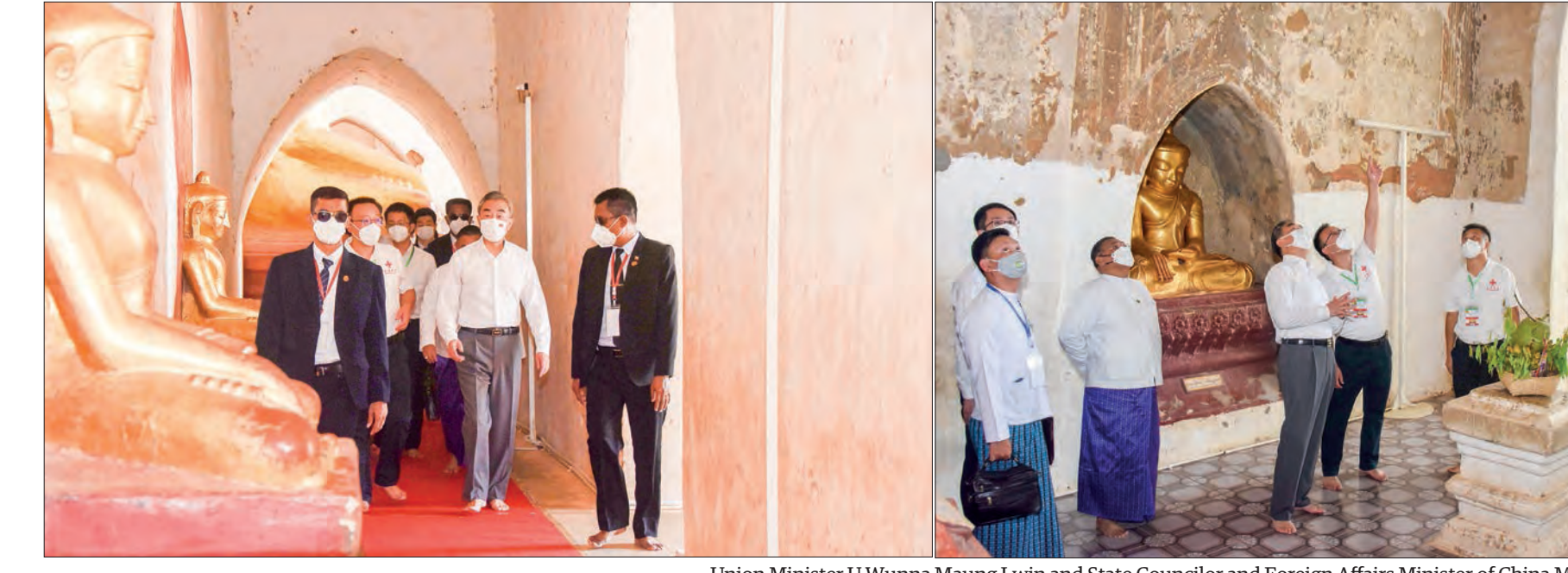
Union Minister U Wunna Maung Lwin and State Councilor and Foreign Affairs Minister of China Mr. Wang Yi view round renovation at Thabbyinnyu Pagoda in Bagan on 3 July.

A magnitude 6.8 earthquake on 24 August 2016 caused damage to 425 pagodas in Ba-