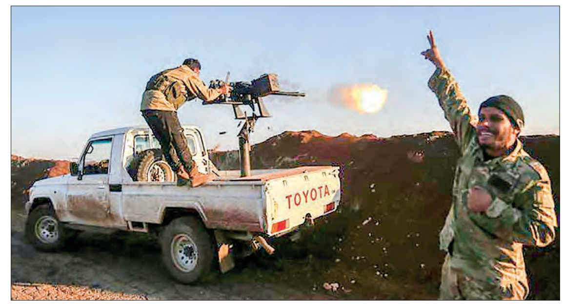
Free Syrian Army (FSA) was positioned as the official army of the opposition during Syrian civil war.

In recent weeks, Erdogan said he planned to launch a military offensive against Kurdish fighters in Syria waging an insurgency against his country.