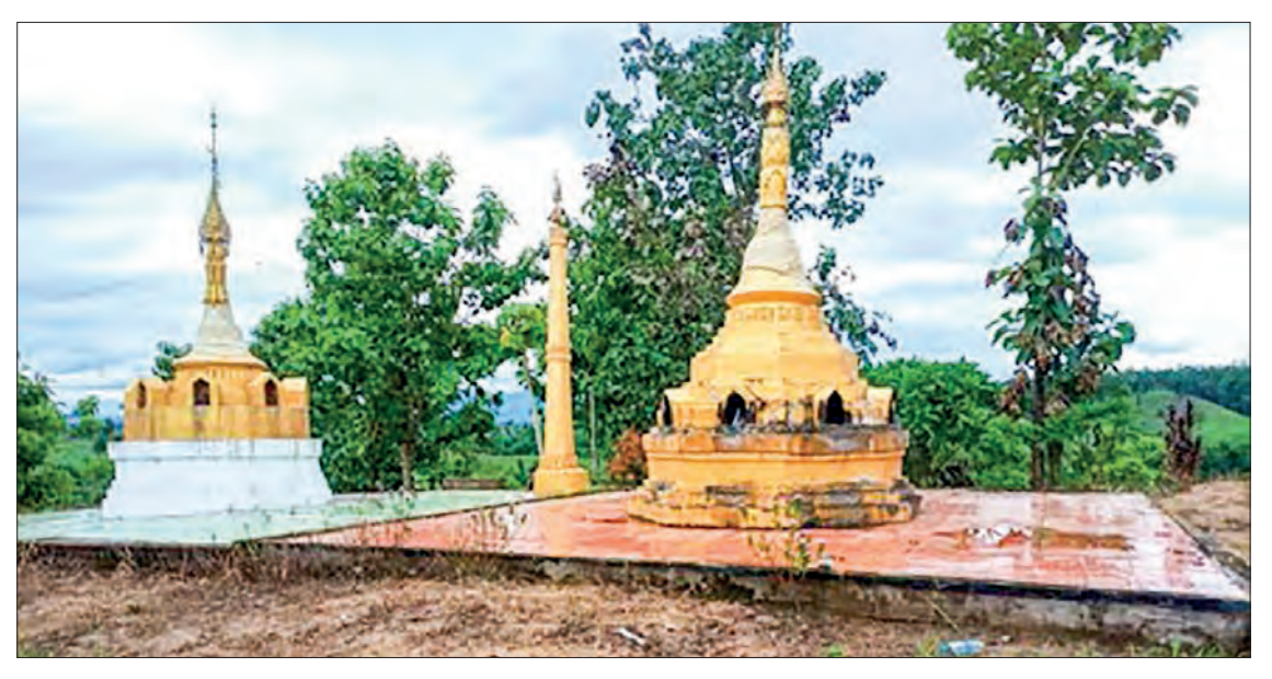
A record photo where terrorists took positions at pogodas and religious buildings to attack Tatmadaw column.

During the security measures in the vicinity of the camp, it was found that the KNLA and so-called PDF terrorists took religious buildings and residential buildings to cover them during their attacks. Tatmadaw troops are continuing to provide the necessary security measures so as to prevent terrorists from taking refuge in the Ukarithta area.—MNA