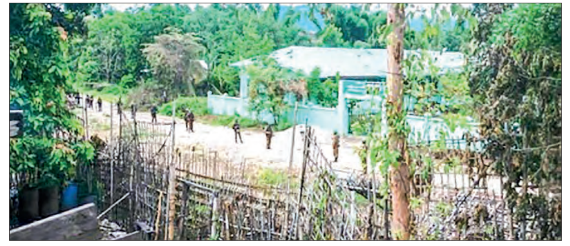
Tatmadaw members of Ukarithta Camp and those from reinforcement troops conduct defence duty together in front of the camp.