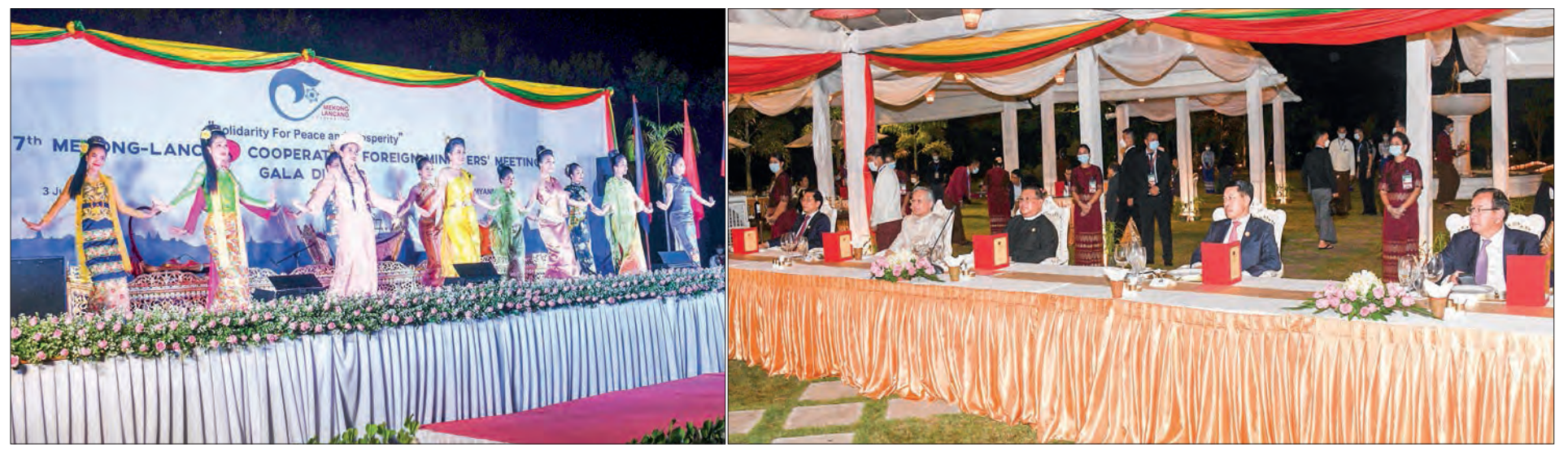
Foreign Ministers of Mekong-Lancang Cooperation enjoy entertainments of artistes at Gala dinner on 3 July.