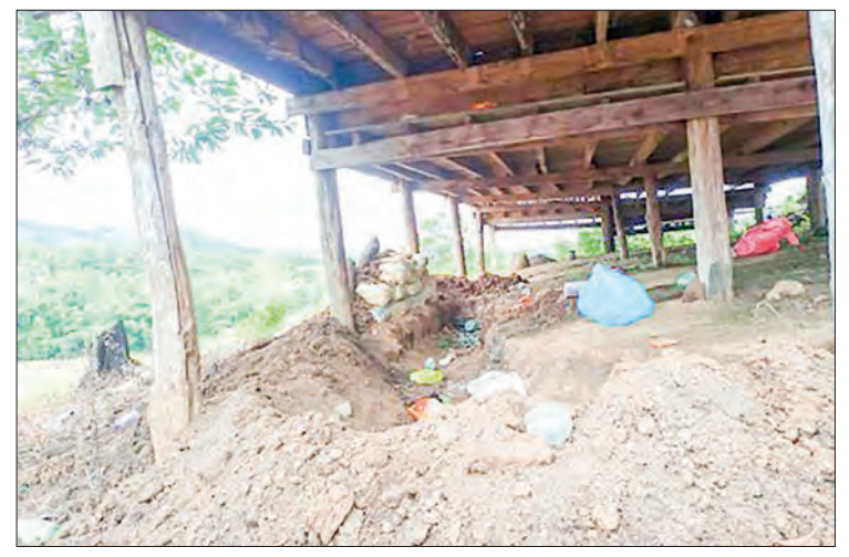
Record photo shows the sites where terrorists took positions at residential buildings in the village to attack Tatmadaw column.