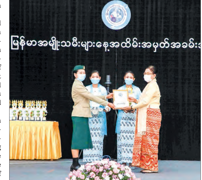
An outstanding woman was awarded on 3 July.

review the advantages and disadvantages of the plan while cooperating with relevant ministries and organizations to draw the national strategic plan for advancement of women (phase II).