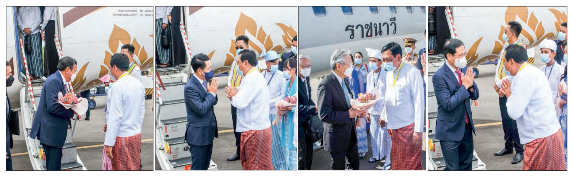
Foreign Minister of 7th Mekong-Lancang Cooperation Foreign Ministers' Meeting are being welcomed by officials at NyaungU airport on 3 July.