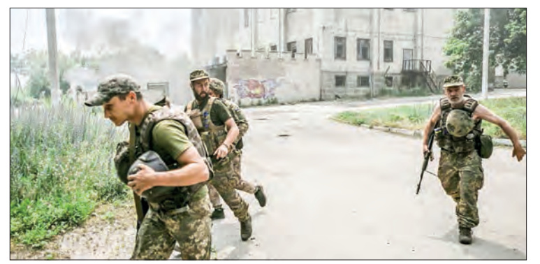
Fighting raged for the strategic Ukrainian city Lysychansk on Saturday. Ukrainian servicemen run for cover during an artillery duel between Ukrainian and Russian troops in the city of Lysychansk, eastern Ukrainian region of Donbas, on 11 June 2022.

The city's capture would allow Russian forces to push deep-