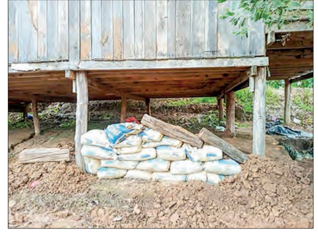
Record photos show the sites where terrorists took positions at residential buildings in the village to attack Tatmadaw column.