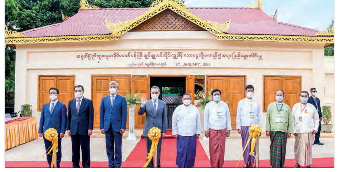
Union Minister U Wunna Maung Lwin, State Councilor and Foreign Affairs Minister of China Mr. Wang Yi pose for documentary photo in front of Zhou Enlai prayer hall on 3 July.

THE reopening ceremony of the renovated Zhou Enlai Prayer Hall took place yesterday morning in the precinct of Shwezigon Pagoda in Bagan Ancient Cultural Zone. The ceremony was attended by Union Minister for Foreign Affairs U Wunna Maung Lwin, State Councilor of the People's Republic of China and Foreign Affairs Minister Mr. Wang Yi, Deputy Minister U Kyaw Myo Htut, Chinese Ambassador to Myanmar Mr Chen Hai, Mandalay Region Natural Resources and Environmental Conservation Minister U Myo Aung and officials.