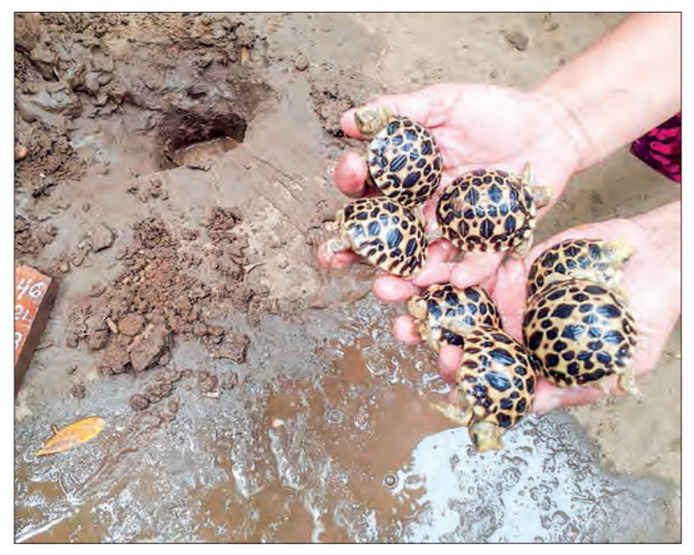
Star tortoises are being released into natural water at Lawkananda Wildlife Sanctuary.

A total of 1,576 baby tortoises hatched at Lawkananda Sanctuary this year and the number of star tortoises was up by 266 against the year-ago period, according to the Forest Department in NyaungU Township, Mandalay Region.