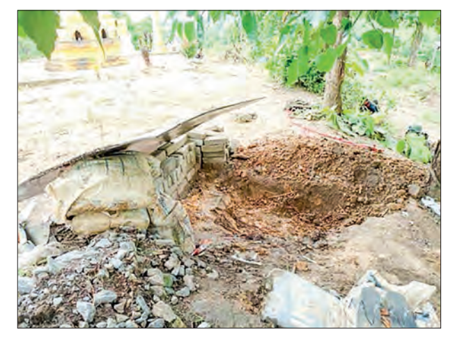
A record photo where terrorists took positions at pogodas and religious buildings to attack Tatmadaw column.