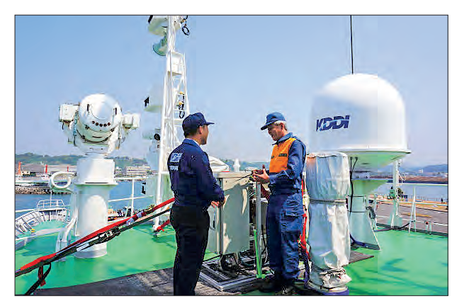
Coast Guard members inspect KDDI's cellphone base station equipment installed on their patrol vessel on 23 May 2014 in Shibushi, Kagoshima, Japan.

KDDI Corp, one of Japan's top three cellular carriers, said Sunday up to 39.15 million mobile connections