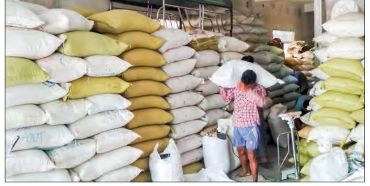
Bags of green gram are stored in warehouse.

China accounts for 60 per cent of Myanmar's green gram exports. China prefers green gram (golden) varieties. China makes value-added products from green grams and re-exports them to foreign markets. Moreover, it produces bean by-products as feedstuffs. Myanmar conveyed US$176.7 million worth over 230,239 tonnes of green grams to foreign trade partners between 1 April and 26 June of the current financial year 2022-2023, according to the Ministry of Commerce's trade data.—KK/GNLM