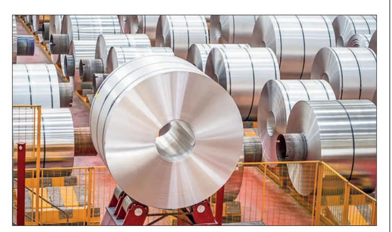
RUSAL is a leading company in the global aluminium industry, producing metal with a low carbon footprint. PHOTO: ISTOCK/AFP

A large number of key Russian companies are facing serious problems in the supply of equipment and spare parts, the sale of which to Russia has been banned.—AFP