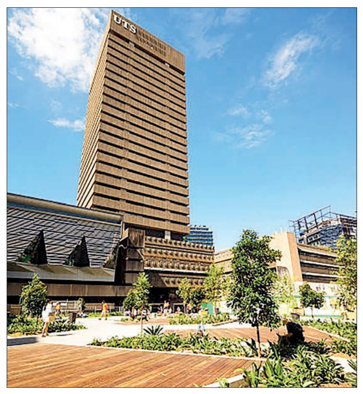
Researchers at Australia's Centenary Institute and the University of Technology Sydney (UTS) have identified a new drug target for the treatment and prevention of chronic obstructive pulmonary disease. UTS Tower is prominent landmark on Broadway at the southern gateway to Sydney's central business district.

Subsequent investigation also confirmed that mMCP5 in mice, an enzyme equivalent of CMA1, plays a pivotal role in COPD. Mice with deficient mMCP5 levels were protected against cigarette smoke-induced inflammation, macrophage accumulation, airway remodelling, emphysema