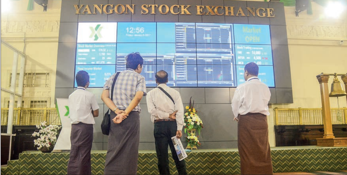
Share traders look on the index panel at the Yangon Bourse.

At present, shares of seven listed companies — First Myanmar Investment (FMI), Myanmar Thilawa SEZ Holdings (MTSH), Myanmar Citizens