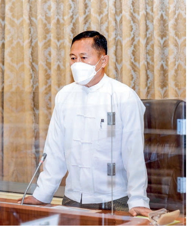
State Administration Council Vice-Chair Deputy Prime Minister Vice-Senior General Soe Win presides over the work coordination meeting of compiling the voter lists for the election, in Nay Pyi Taw on 6 July 2022.

Urapid manner by applying the facts and figures from the national database main server, said Vice-Chairman of the State Administration Council Deputy Prime Minister Vice-Senior Gen-