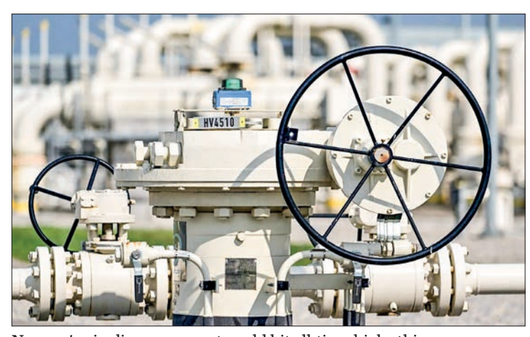
Norway's pipeline gas export could hit all-time highs this year. Picture taken on 9 May 2022 shows equipment operated by GCA (Gas Connect Austria) and TAG (Trans Austria Gas pipelines) at one of the largest interconnection gas hubs in Europe at Baumgarten an der March, Lower Austria.

"Norwegian deliveries account for a quarter of European energy supplies, and Europe is