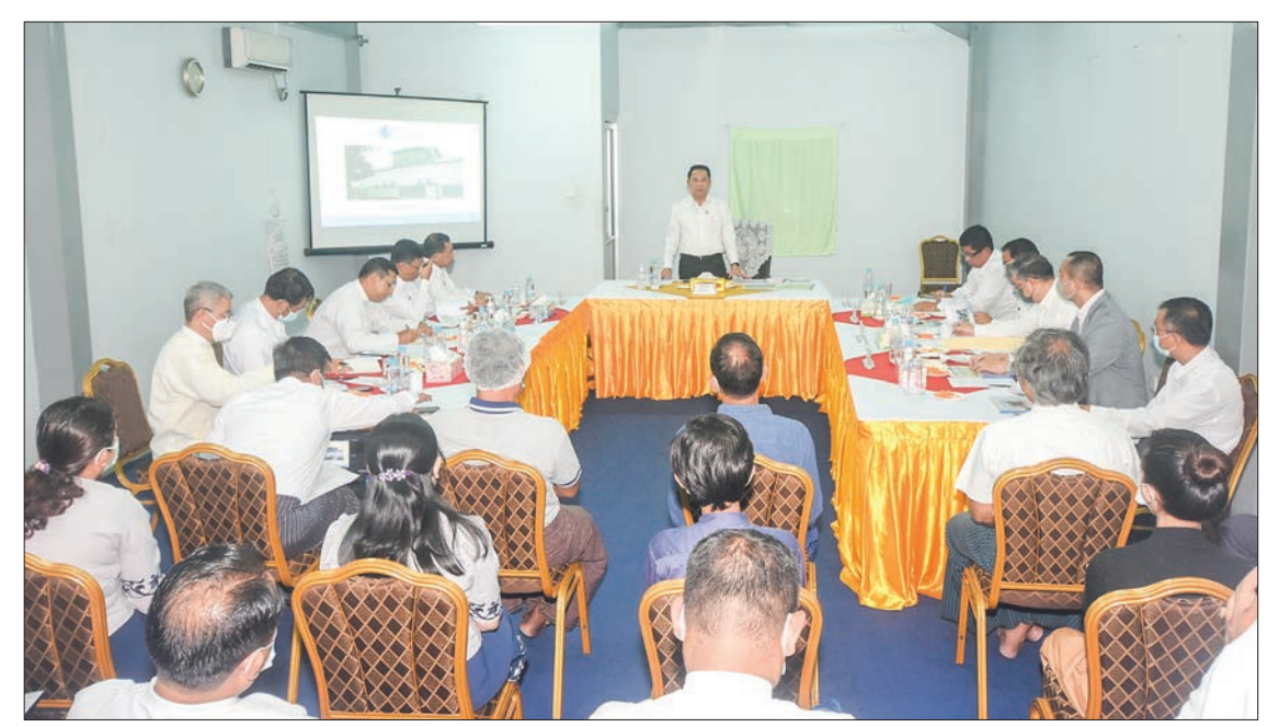
MoI Union Minister U Maung Maung Ohn meets the employees of The Global New Light of Myanmar English newspaper yesterday.

gramme will be broadcast by MRTV HD on Friday night at around 9 pm on 8 July 2022. The