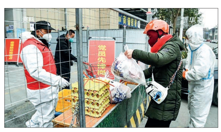
A deliveryman carries daily necessities at a residential area under closed-off management in Xi'an, northwest China's Shaanxi Province, 31 December 2021. Xi'an imposed closed-off management for communities and villages on 23 December in an effort to curb the spread of the latest COVID-19 resurgence.

story, Putuo district is sending out vegetables again," read one resident's viral WeChat post.