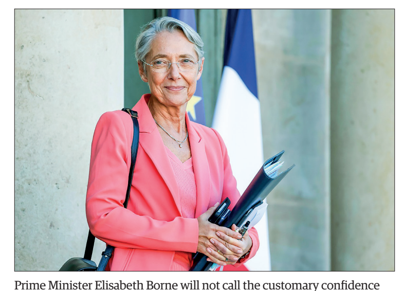
vote in parliament.

But the hard-left France Unbowed (LFI) party, one of the big gainers in June's parliamentary polls, announced that it would immediately call for a censure motion on Tuesday which would also bring Borne down if she lost. — AFP