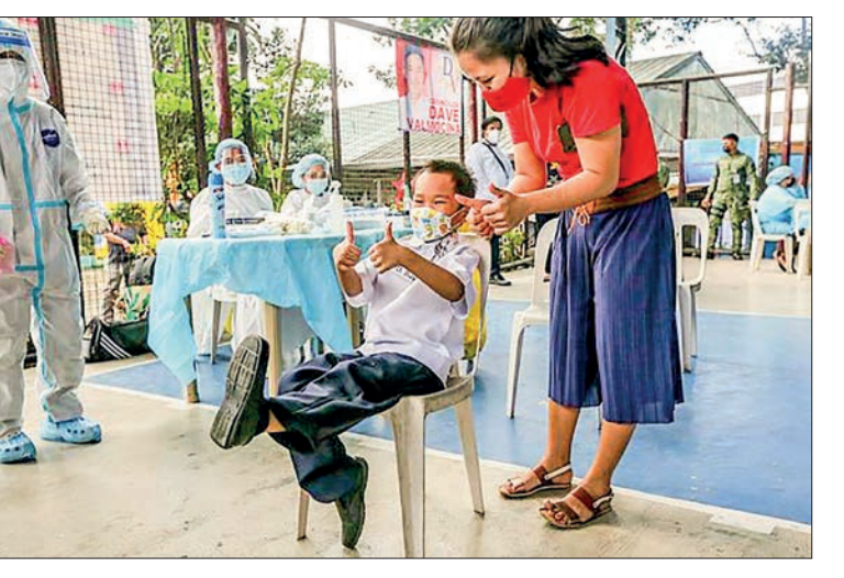
A student wearing a face mask gestures after undergoing a voluntary COVID-19 test before attending a face-to-face class at an elementary school in Quezon City, the Philippines, 6 December 2021. Selected schools in the Philippines started the pilot run of limited face-to-face classes as the country continues to record declining COVID-19 cases.

Former president Rodrigo Duterte allowed children to return to classrooms in just 100 schools out of more than 61,000 in November last year, but ruled out a full resumption before his term ended last month, citing health concerns.—AFP