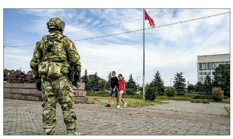
A young couple walks past a Russian soldier guarding an area in Kherson on 20 May 2022.

Moscow has since launched a campaign of so-called Russification, trying to introduce the ruble, giving out Russian passports and opening a first Russian bank at the end of June.