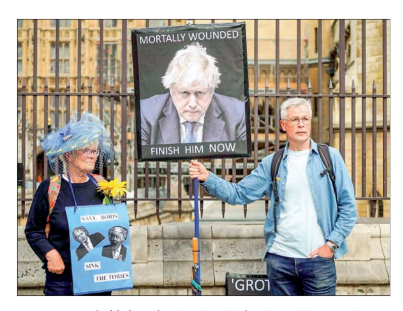
Demonstrators hold placards picturing British Prime Minister Boris Johnson in front of Parliament in London on 6 June 2022.