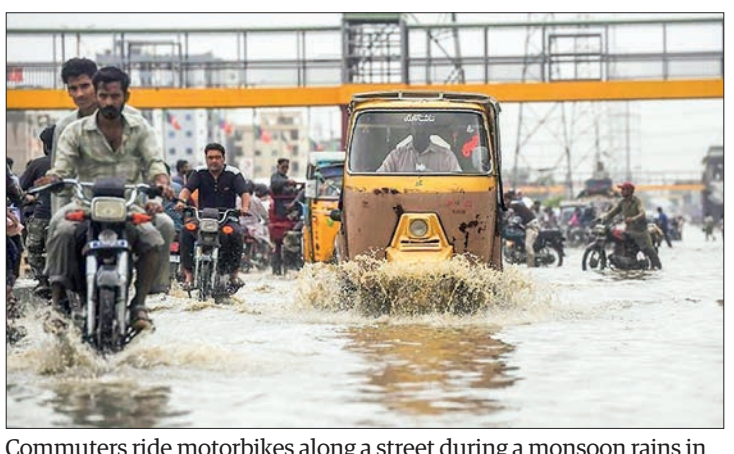
Commuters ride motorbikes along a street during a monsoon rains in Karachi.

Scientists at Japan's University of Yamanashi wanted to see whether they could solve those problems by freeze-drying somatic cells — any cell that isn't a sperm or egg cell — and attempting to produce clones. They experimented with two types of mice cells, and found that, while freeze-drying killed them and caused significant DNA damage, they could still produce cloned blastocysts — a ball of cells that develops into an embryo.—AFP