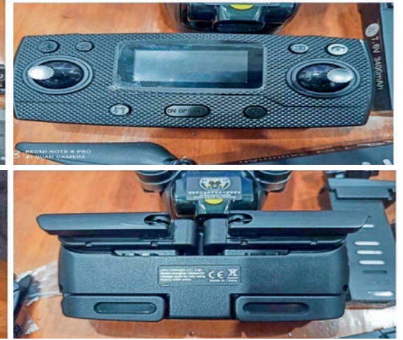
Seized electronics at Yangon International Airport.

SUPERVISED by the Anti-Illegal Trade Steering Committee, effective action is being taken to prevent illegal trade under the law.