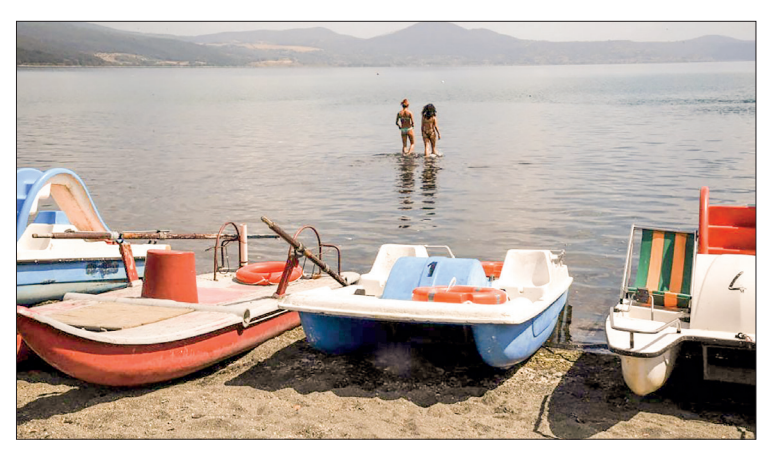
Italy has declared a state of emergency in five northern regions amid the worst drought in 70 years. Two women wade into Lake Bracciano, 32 km northwest of Rome.

Lakes Maggiore and Garda were also hit by lower than normal water levels for this time of year, while further south the Tiber River, which runs through Rome, also dropped.