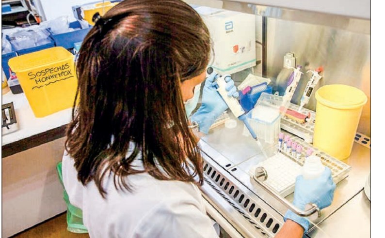
A medical laboratory technician inactivates suspected monkeypox samples to be tested at the microbiology laboratory of La Paz Hospital on 6 June 2022 in Madrid, Spain.