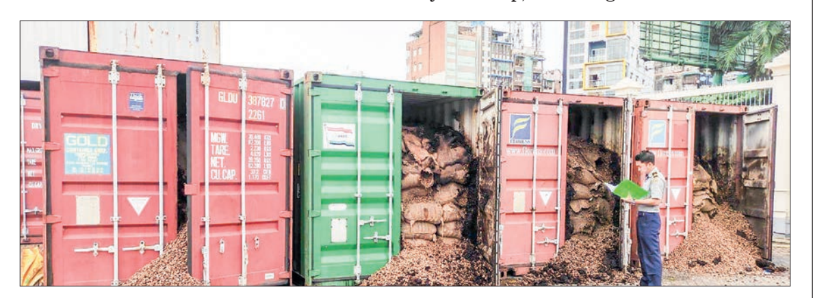
An official checks confiscated illegal goods.

Therefore, four arrests estimated at K103,904,800 were made on 5,7 and 8 July, according to the Anti-Illegal Trade Steering Committee. — MNA