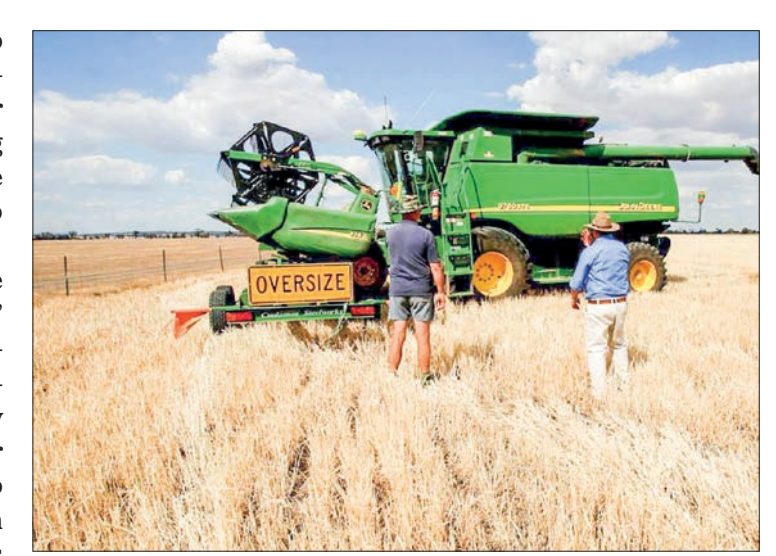
On 19 May 2020 China imposed a combined 80.5 per cent tariff on Australian barley.

China — Australia's biggest trading partner — imposed tariffs and disrupted more than a