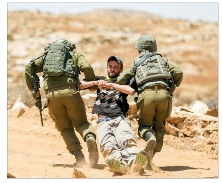
Israeli forces remove a demonstrator during a protest by Palestinians and international activists in the Masafer Yatta area of the Israeli-occupied West Bank on 1 July 2022.

"If there were to be mass evictions and forced displacement, it would be the largest forced displacement in decades — that's our concern here," he told AFP. Israel's Supreme Court ruled that the more than 1,000 residents of the Masafer Yatta villages had "failed to prove" their right to permanent residence in the area before the