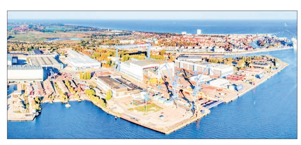
The German state has acquired the shipyards of MV Werften in Rostock, northeastern Germany, which went into bankruptcy in January.

for the German armed operational readiness of the (German) navy," she said. The ministry did not say how much money was paid for the shipyards, but said it would offer an "appropriate price". The German military, under-equipped and under-funded in recent years, faces new challenges because of the war in Ukraine. —AFP