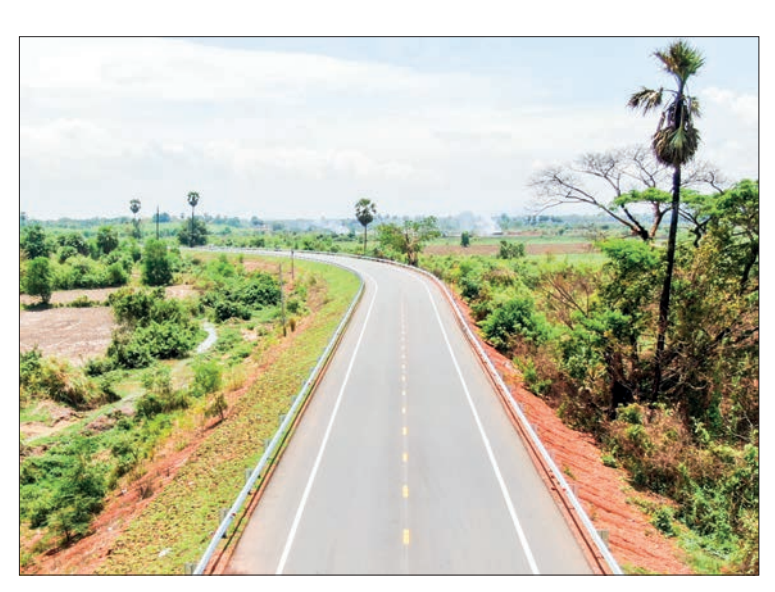
This undated photo shows one section of the Eindu-Kawkareik Road.

ACCORDING to the contract between the Ministry of Planning and Finance, Ministry of Industry and ADB, the Eindu-Kawkareik Road in Hpa-an District of Kayin State was upgraded with US$100 million under the ADF loan and $20 million under the AIF loan (net value of $120 million).