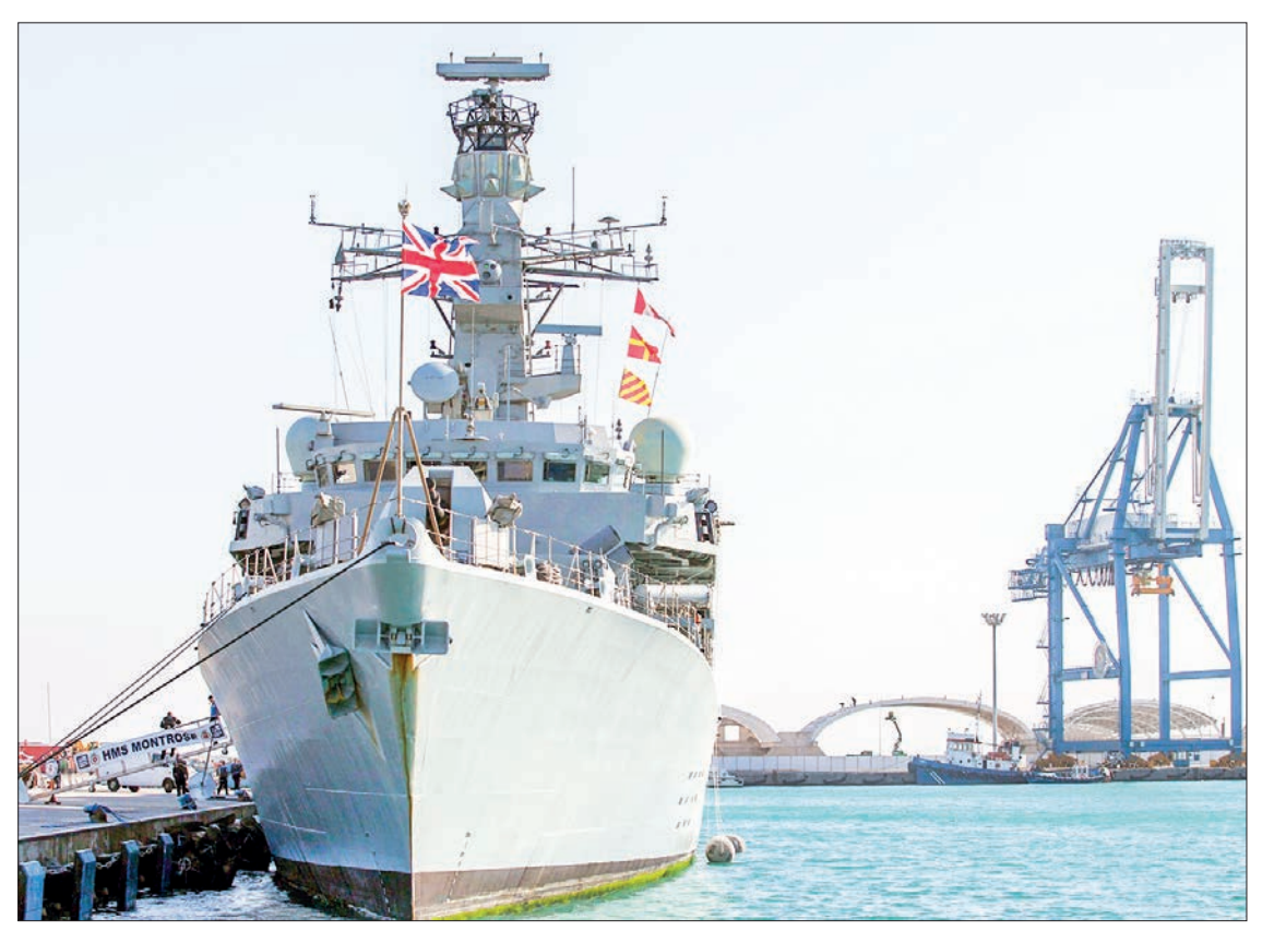
The HMS Montrose's helicopter had been scanning for illicit goods in the Gulf of Oman on 28 January and 25 February when it spotted small vessels speeding away from the Iranian coast.

The second operation on 25 February also involved a United States Navy destroyer, the USS Gridley, which deployed a Seahawk helicopter "to provide critical overwatch", the ministry said.—AFP