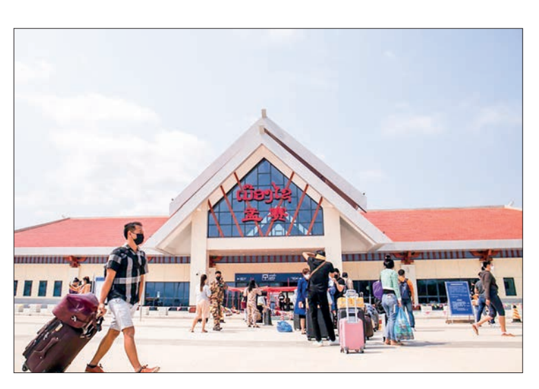
Photo taken on 9 March 2022 shows people at the Muangxay Railway Station in Muangxay, northern Laos

THE COVID-19 pandemic has affected essential health services and, even though the virus outbreak in Laos has subsided, some healthcare services are not able to recover to pre-pandemic levels, according to Lao Minister of Health Bounfeng