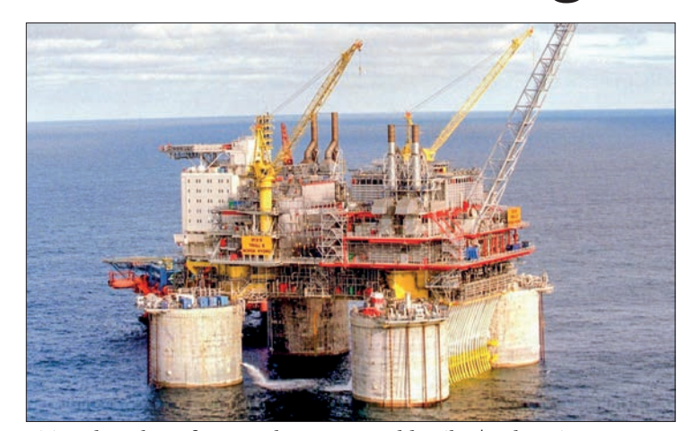
Citi analysts have forecast that Brent could strike $65 later in 2022 in the event of a prolonged worldwide economic downturn. A Norwegian oil production platform Troll B in the North Sea.

that Brent could strike $65 later this year in the event of a prolonged worldwide economic