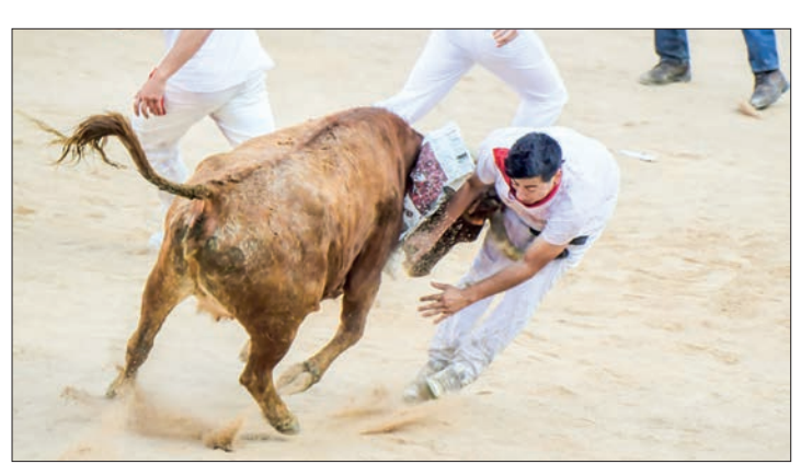
About 40 per cent of all runners come from abroad, with Australia, the United States and Great Britain providing the most foreigners. PHOTO: AFP

"There is nothing else like it, it's totally unique," he told AFP in the northern Spanish city on Wednesday when the nine-day fiesta officially opened.—AFP