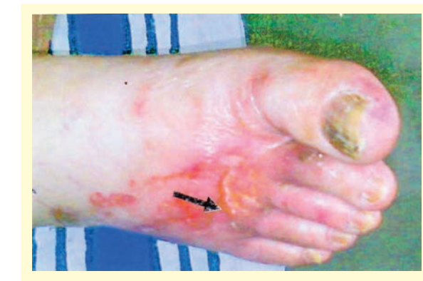
If a diabetic develops rednes and discoloration of foot at this stage, one should be careful.