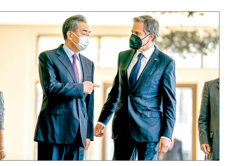
US Secretary of State Antony Blinken (R) and China's Foreign Minister Wang Yi talk before a meeting in Nusa Dua on the Indonesian resort island of Bali on 9 July 2022.

Years of rising tensions between the two has alarmed