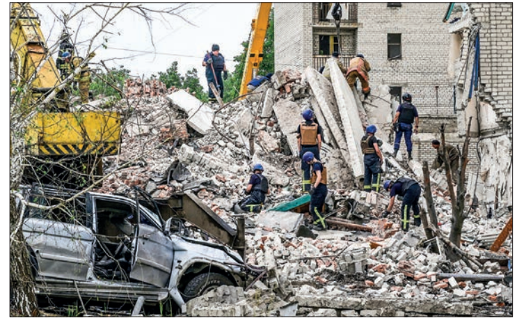
Rescuers clear the scene after a building was partially destroyed as a result of Russian missile hit on a four-storey residential building in Chasiv Yar, Bakhmut District, eastern Ukraine, on 10 July 2022.

"During the rescue operation, 15 bodies were found at the scene and five people were pulled out of the rubble" alive in the town of Chasiv Yar, the