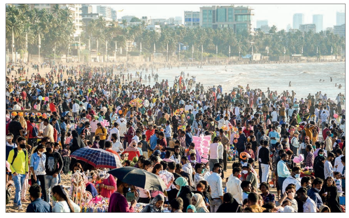
A general view shows beachgoers thronging Juhu beach in Mumbai on 9 January 2022.

While a net drop in birth rates is observed in several developing countries, more than half of the rise forecast in the world's population in the coming decades will be concentrated in eight countries, the report said. It said they are the Democratic Republic of Congo, Egypt, Ethiopia, India, Nigeria, Pakistan, the Philippines and Tanzania. — AFP