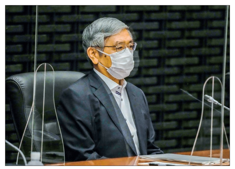
Bank of Japan Governor Haruhiko Kuroda attends a meeting with BOJ branch managers at the central bank's head office in Tokyo on 11 July 2022.

THE Bank of Japan on Monday upgraded its view on seven of the nine regional economies, reflecting the diminishing negative impact of COVID-19 on private