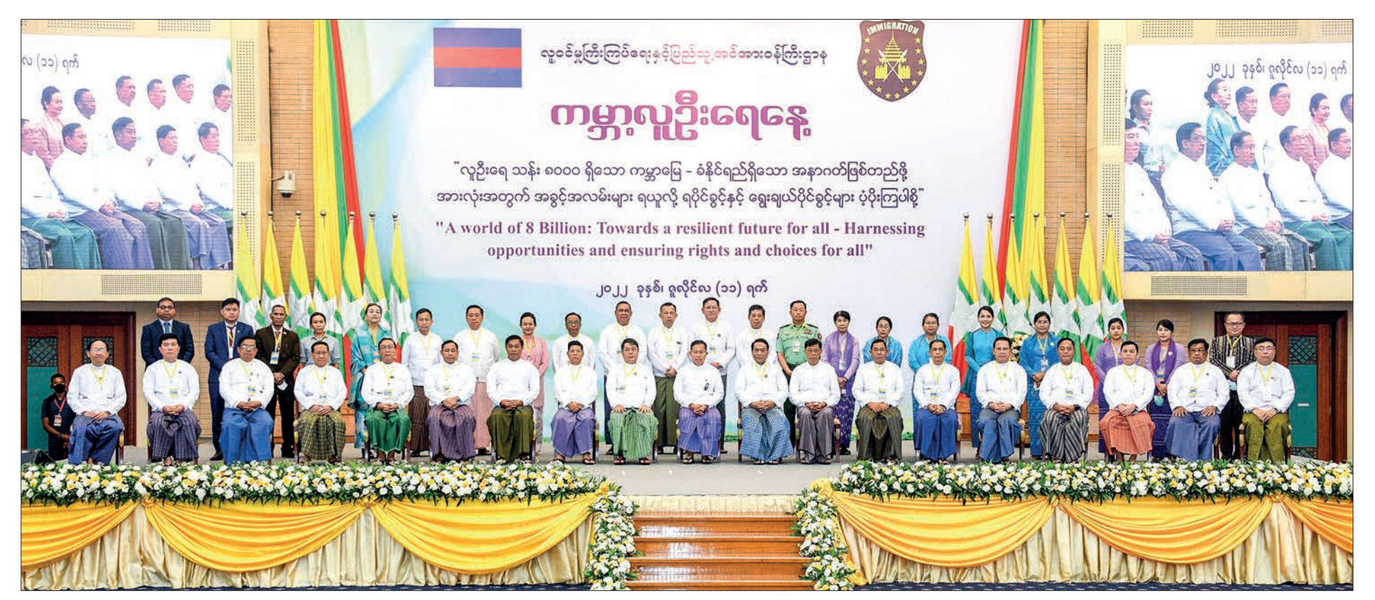
State Administration Council Vice-Chair Deputy Prime Minister Vice-Senior General Soe Win takes the documentary group photo with attendees at the event.