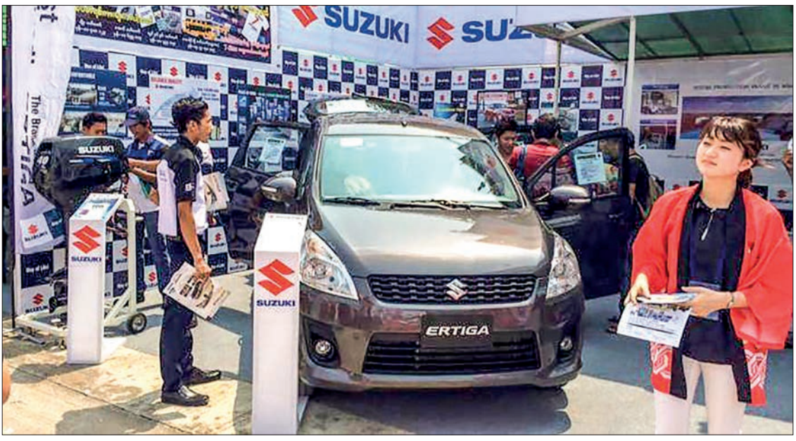
A Suzuki Ertiga was displayed at one car show in 2016.

vehicles from Japan, Korea and China occupy most of the market shares.