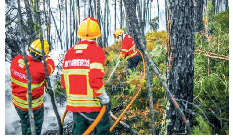
Firefighters work to extinguish a wildfire at Casais do Vento in Alvaiazere on 10 July 2022.

The total harvest is yet to be measured, but production is already short by at least 20 to 40 per cent in most areas, according to Gohram Baloch, a senior official at the Sindh provincial government's agriculture department. Umar Bhugio, who owns