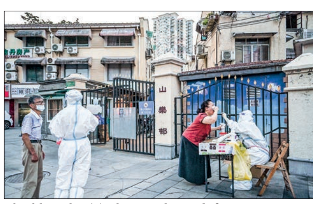
A health worker (R) takes a swab sample from a woman to test for the Covid-19 coronavirus on a street next to a residential area in the Jing'an district of Shanghai on 5 July 2022.

The prospect of another lockdown sparked a