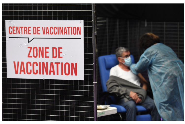
(FILES) In this file photo taken on 2 March 2021 an elderly man receives a dose of the Pfizer-BioNtech Covid-19 vaccine, at a vaccination centre in Garlan, western France.

recommended a second booster, or a fourth dose, for people over the age of 80, since April.