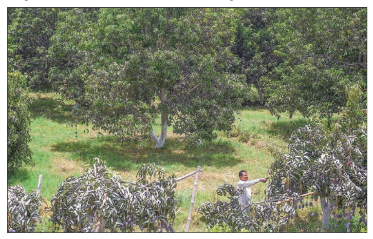
In this picture taken on 15 June 2022, Hari Mali, a farm worker plucks mangoes from a tree at a farm outside Mirpur Khas city in Pakistan's southern Sindh province.

MANGO farmers in Pakistan say production of the prized fruit has fallen by up to 40 per cent in some areas because of high temperatures and water shortages in a country identified as one of the most vulnerable to climate change. The arrival of mango season in Pakistan is eagerly anticipated, with around two dozen varieties arriving through the hot, humid summers.