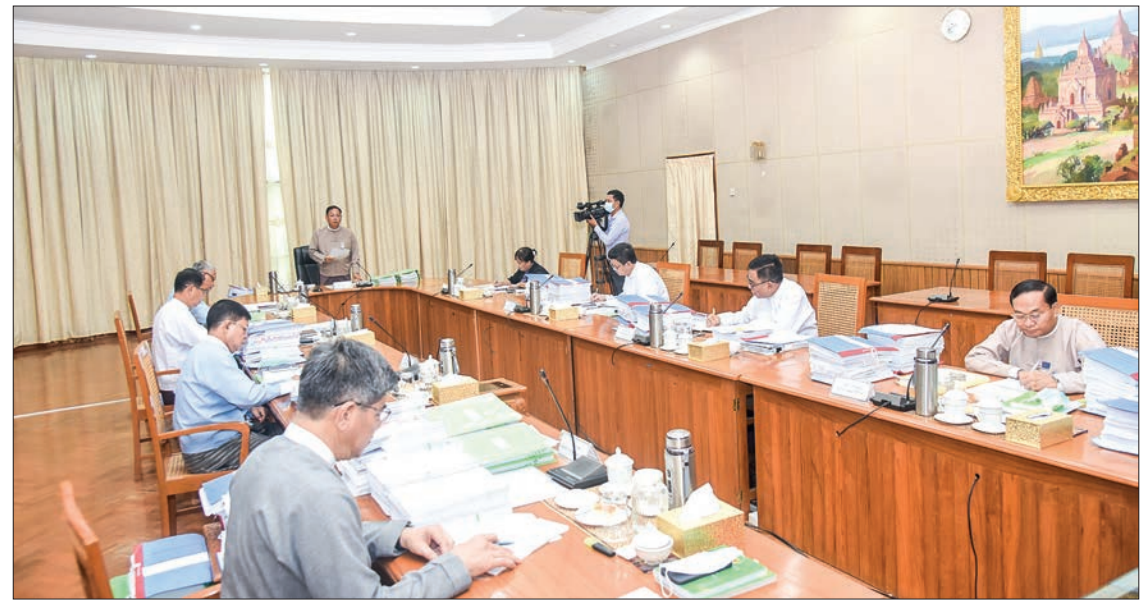
MIC Chair Lt-Gen Moe Myint Tun presides over the meeting 3/2022 in Nay Pyi Taw yesterday.

THE Myanmar Investment Commission-MIC held its meeting (3/2022) at No 18 Union Government Office yesterday morning in Nay Pyi Taw.