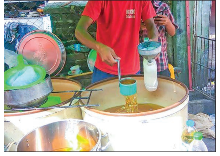
A vendor is seen selling the palm oil.

ALTHOUGH the wholesale ref- rate for edible oil on a weekly