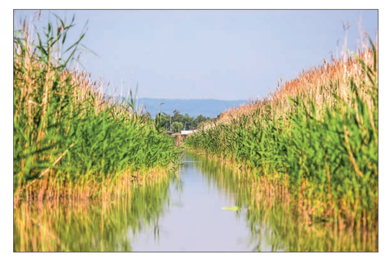
A driving channel pictured in the reed belt in Rust at Lake Neusiedl in the Bay of Rust, Burgenland on 5 June 2022. About 120 people took part in the first edition of the Lakemania/ SOS Neusiedler See meeting on Lake Neusiedl with boats, canoes and paddles to draw attention to the drying out of the lake.

Meszaros, who is close to Prime Minister Viktor Orban, is already in charge of a vast real estate project on the Hungarian side of the lake, including the