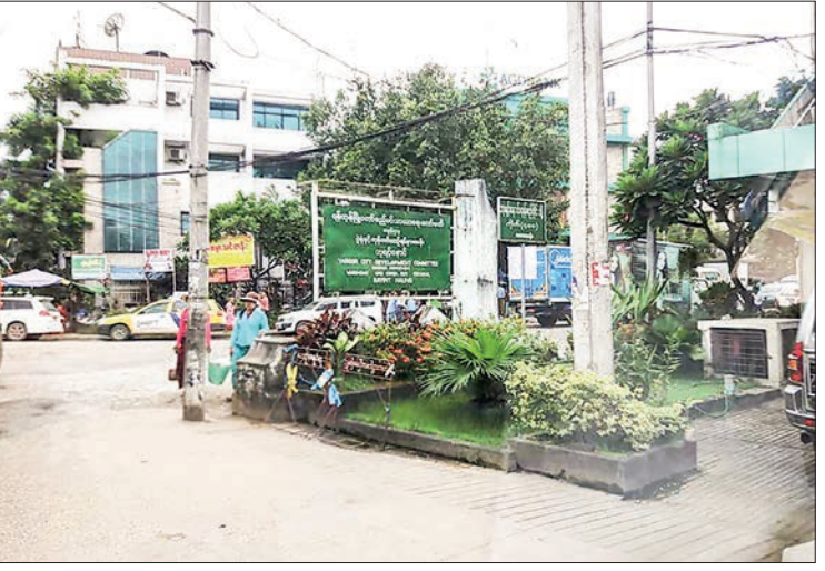
Bayintnaung wholesale centre.

On 11 July, the Kyukok garlic was priced at K2,800-2,850 per viss. On the same day, the Monywa onion was set prices of K1,275-1,475-1,575-1,700 per viss and K1,150-1,400-1,525-1,650 per viss and Shan garlic from Aungban K2,000-2,500-3,100-3,600 per viss.