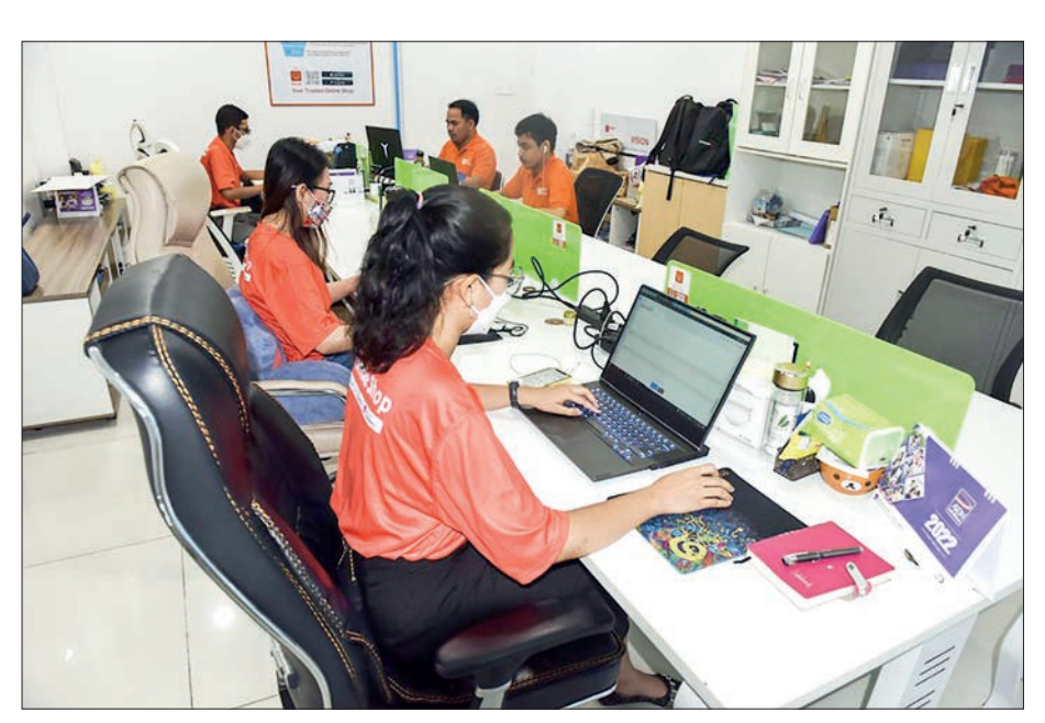
Employees work at online market Smile Shop in Phnom Penh, Cambodia, 21 Dec

THE Regional Comprehensive Economic Partnership (RCEP) trade pact and the Cambodia-China Free Trade Agreement (CCFTA) have given a boost to the fledgling e-commerce industry in Cambodia, experts said on Monday.