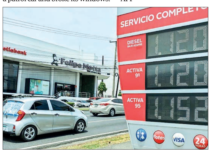
The stabilization or freezing of fuel prices is a measure for which carriers have been pressing through protests. PHOTO: AFP/FILE

In Panama City, a group of students clashed with police around the University of Panama, where a group of people temporarily seized a patrol car and broke its windows. — AFP