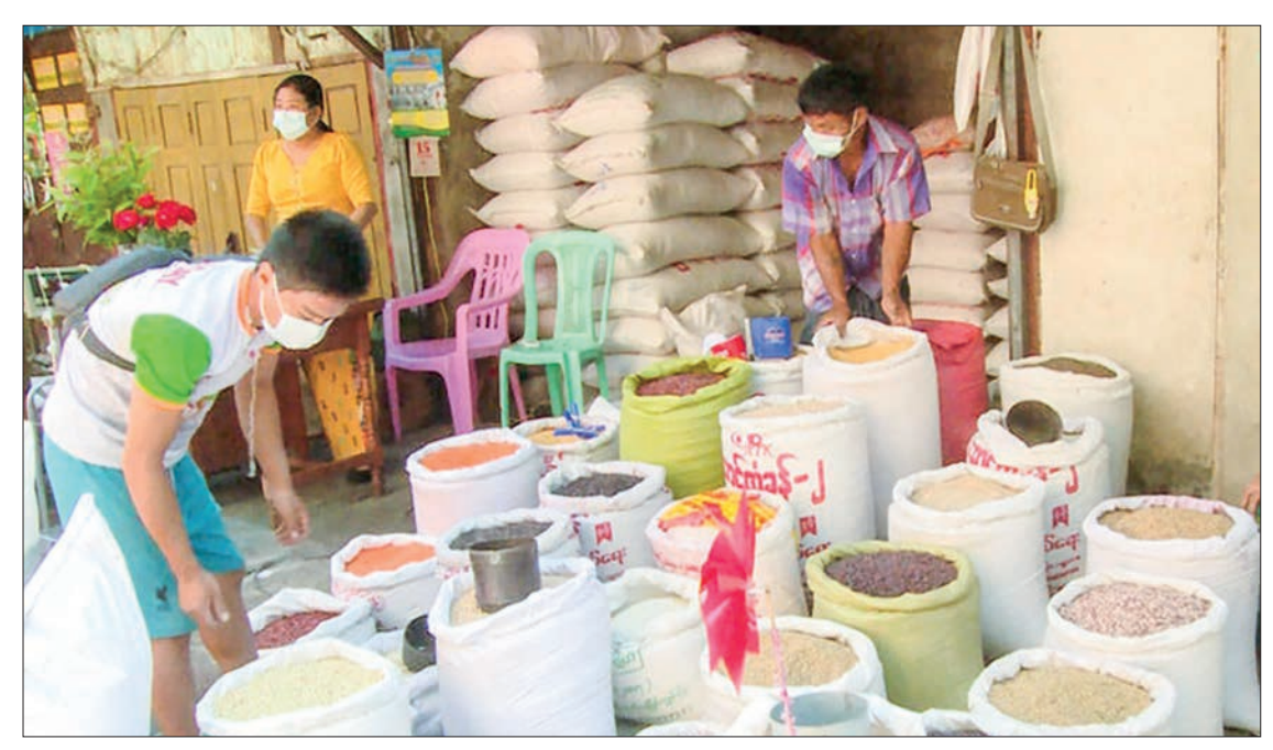
The black gram hit a high of over K1.7 million per tonne on 2 July, whereas the price rolled back to K1,595,000 per tonne on 11 July.

India is possible to import 50,000-75,000 tonnes of black