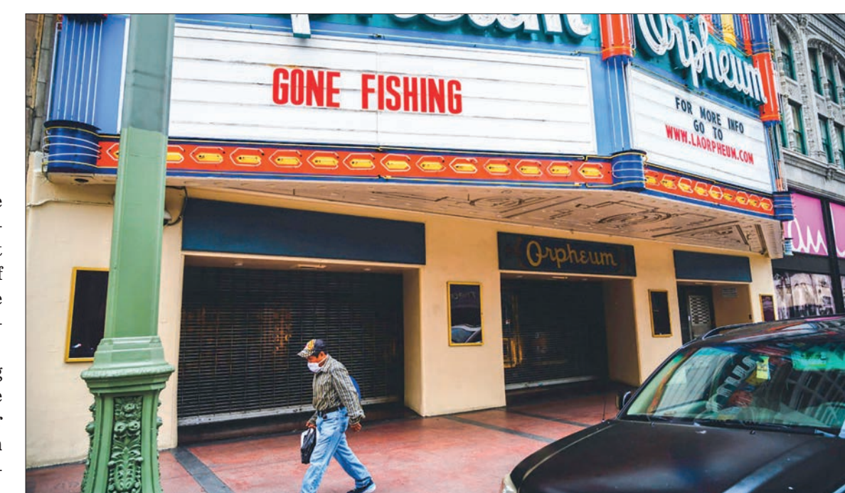
The scene in downtown Los Angeles on April 30, 2020.