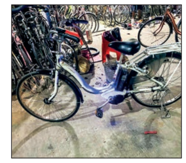
A repaired and modified Japan' second hand bike.

Those who can afford choose the used bikes from Japan as they like and there are some people who buy Chinese bikes at the licensed pawn shops that cost between K30,000 and K50,000. — TWA/GNLM