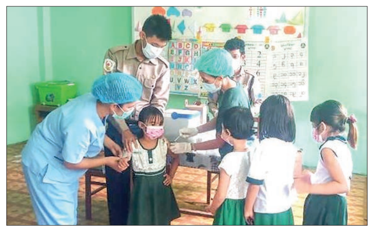
A schoolgirl in Yankin Township in Yangon Region gets COVID-19 vaccine shot on 11 July 2022.

Yesterday, doctors and nurses from public hospitals, medical teams from the Tatmad-