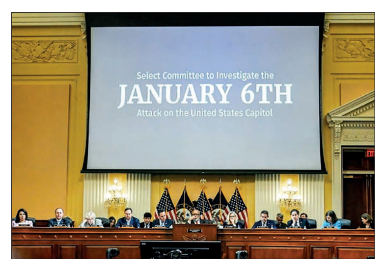
The House committee investigating the 6 January 2021 attack on the US Capitol is to hold its seventh hearing. PHOTO: AFP/SERGEY BOBOK

More than 850 people have been arrested in connection with the storming of Congress by Trump supporters, but only those 16 face seditious conspiracy charges, which carry a sentence of up to 20 years in prison.—AFP