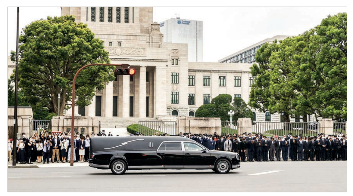
The vehicle carrying the coffin of former Japanese Prime Minister Shinzo Abe passes in front of the parliament building in Tokyo on 12 July 2022, following his funeral. Abe was fatally shot during upper house election campaigning in Nara on 8 July.

THE funeral of former Prime Minister Shinzo Abe, who was shot dead while delivering a stump speech last week, was held Tuesday at a Buddhist temple in the heart of Tokyo, with a crowd of people gathering outside the venue while the private ceremony was held.