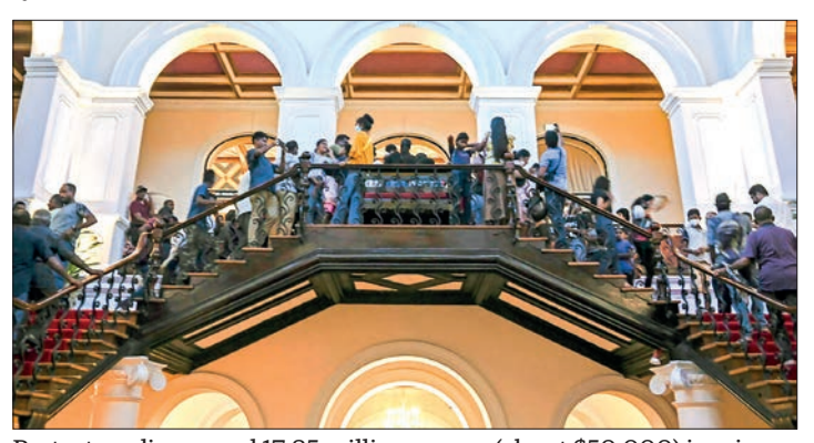
Protesters discovered 17.85 million rupees (about $50,000) in crisp new banknotes at President Gotabaya Rajapaksa's official residence in Colombo.

But four commercial flights subsequently took off for Middle Eastern destinations without him, airport officials