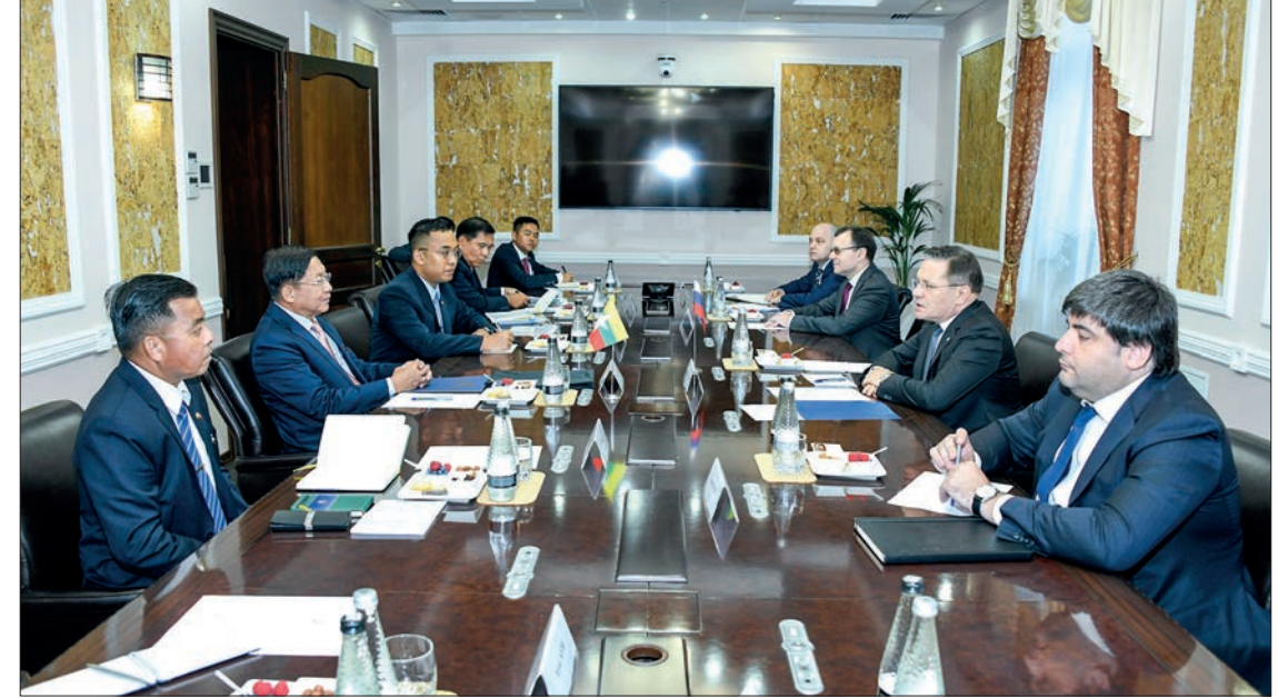
The Senior General holds talks with the Director-General of the Rosatom State Corporations of Russia

At the Myanmar embassy and the office of the Myanmar military attaché, the Senior General met with officers and staff. On the occasion, the Senior