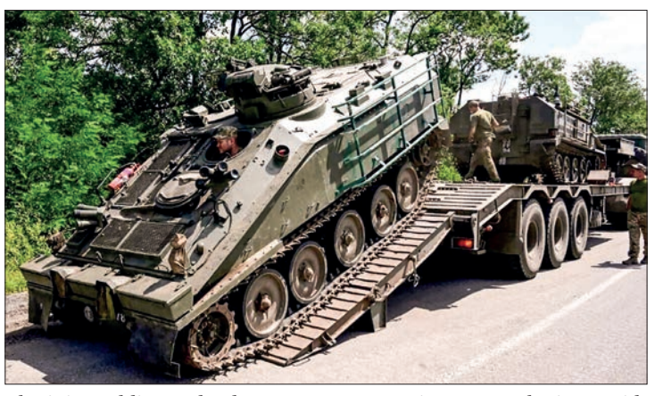
Ukrainian soldiers unload two FV103 Spartan in eastern Ukraine, amid the Russian invasion of Ukraine on 9 July 2022.

On his first visit to Kyiv since Russia invaded Ukraine on 24 February, Rutte said his country would supply Ukraine