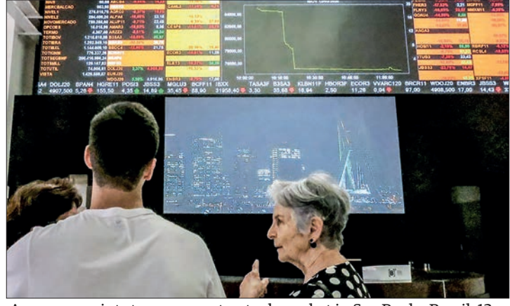
A woman points to a screen at a stock market in Sao Paulo, Brazil, 12 March 2020.

bank's weekly survey of the country's leading financial institutions, a government tax cut on a segment of products led to a decrease in the National Consumer Price Index.