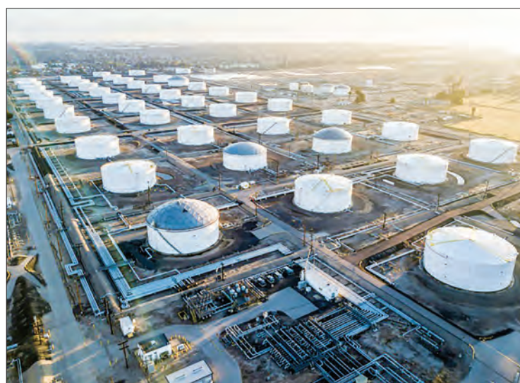
A number of oil and gas companies have pledged to reach net zero emissions by 2050.

It concluded that European companies such as ENI and Repsol -- which include in their reduction plans so-called Scope 3 emissions that make up the vast majority of their footprints -- as among the most Paris-friendly majors. In contrast, it said that US behemoths ExxonMobil, Chevron and ConocoPhillips were failing to align their business plans with the world’s carbon budget -- that is, how much more we can pollute before the Paris goals are out of