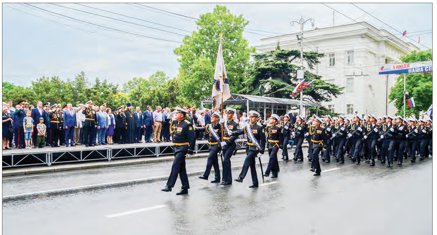
Commander-in-Chief of Defence Services Senior General Min Aung Hlaing attends the 75 th Anniversary parade for Victory Day of Great Patriotic War in Russian Federation on 24 June.

C O M M A N D - ER-IN-CHIEF of Defence Services Senior General Min Aung Hlaing, together with Myanmar Tatmadaw delegation members attended the parade held in Moscow's Red Square to commemorate the 75 th Anniversary Victory Day of Great Patriotic War in the Russian Federation yesterday.