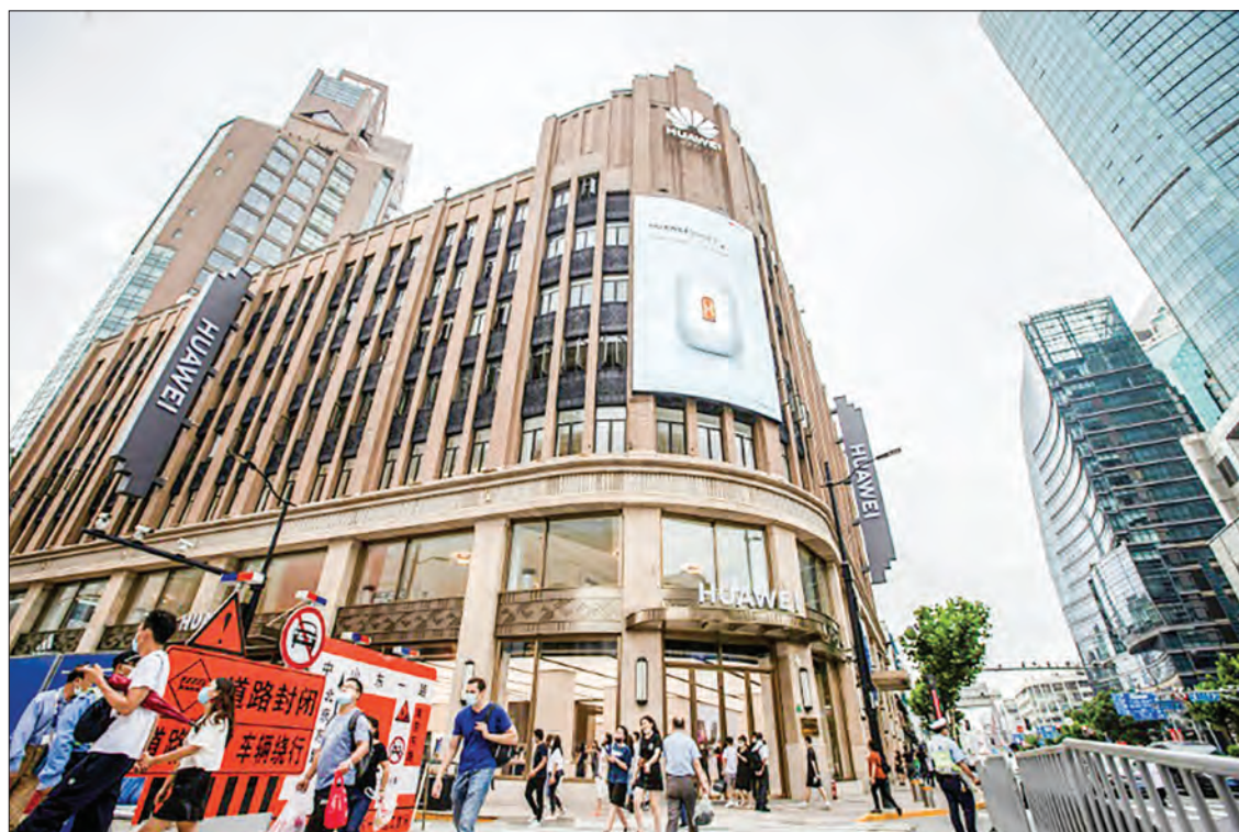
Huawei's opened its second global flagship store in Shanghai.

The Trump administration accuses Huawei of stealing American trade secrets and says its telecommunications equipment could be used by Beijing for espionage.—AFP ■