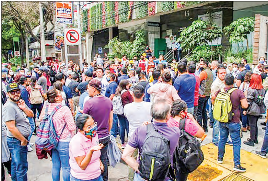
People remain outside buildings in Mexico City during a quake on June 23, 2020 amid the COVID-19 novel coronavirus pandemic. - A 7.1 magnitude quake was registered Tuesday in the south of Mexico, according to the Mexican National Seismological Service.

All the deaths occurred in Oaxaca, with the majority due to the collapse of buildings. A woman died near Crucecita, and five other people died in towns located within 150 kilometres of the epicentre, officials said. The 7.4 quake struck at a depth of 23 kilometres, the US Geological