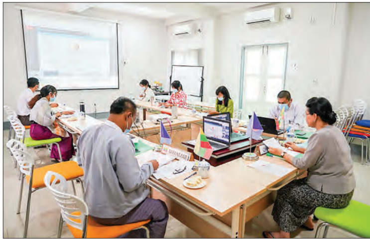
ASEAN tourism development committees hold meetings via videoconference on progress of implementation in tourism sector on 22 and 23 June.

THE 9 th edition meeting of ASEAN Sustainable and Inclusive Tourism Development Committee and the 9 th edition meeting of ASEAN Tourism Resourcing, and Monitoring and Evaluation Committee were held on 22 and 23 June.