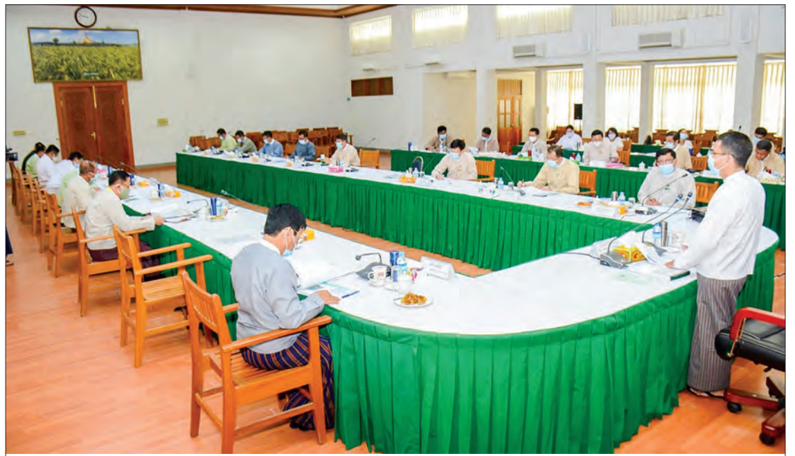
Land administration committee of MoALI discusses equal right of citizens to apply for the use of vacant, fallow and virgin lands.

The meeting discussed the tax exemption period for levying land tax for allotted lands and setting the rate for land tax in line