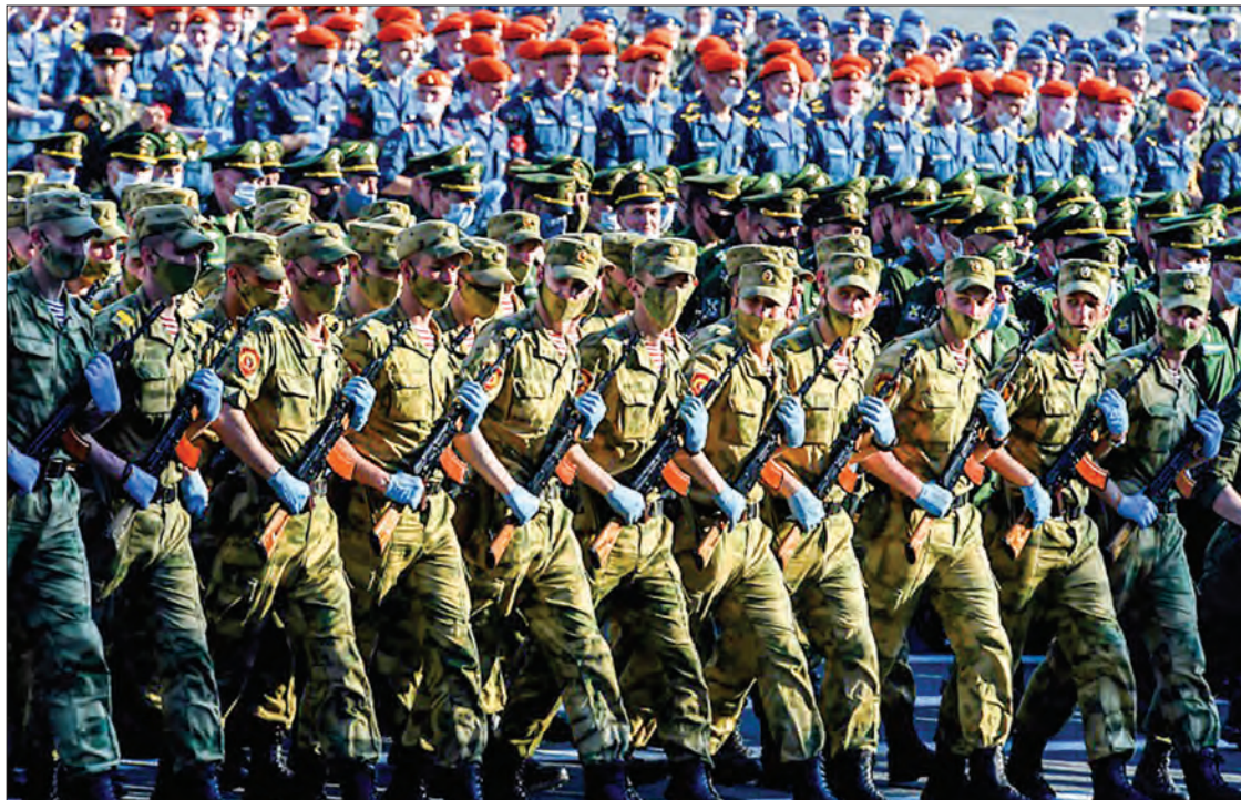
Russian military cadets and servicemen gear up for the parade—a chance for the country to show off its military might although dozens of regions have elected not to hold events citing concerns about the coronavirus.

has fallen in recent weeks and cities including Moscow have lifted anti-virus lockdowns, but critics accuse Putin of rushing ahead with public events to pursue his own political ends.