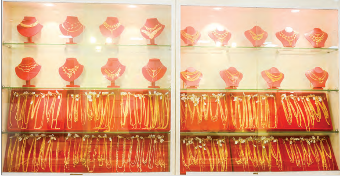
Gold jewellery on display at a shop in Yangon.