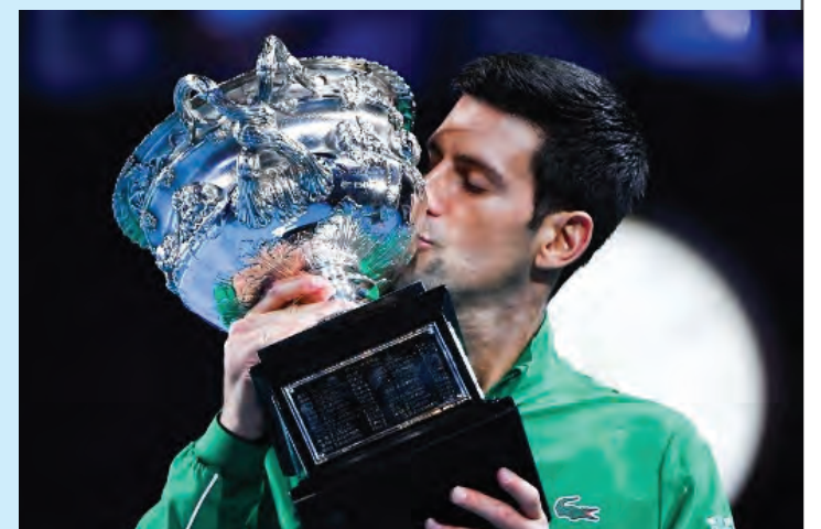
Serbia’s Novak Djokovic kisses the Norman Brooks Challenge Cup trophy following his victory against Austria’s Dominic Thiem in their men’s singles final match on day fourteen of the Australian Open tennis tournament in Melbourne early on February 3, 2020.

gest since the tennis season was halted because of the pandemic.—AFP ■