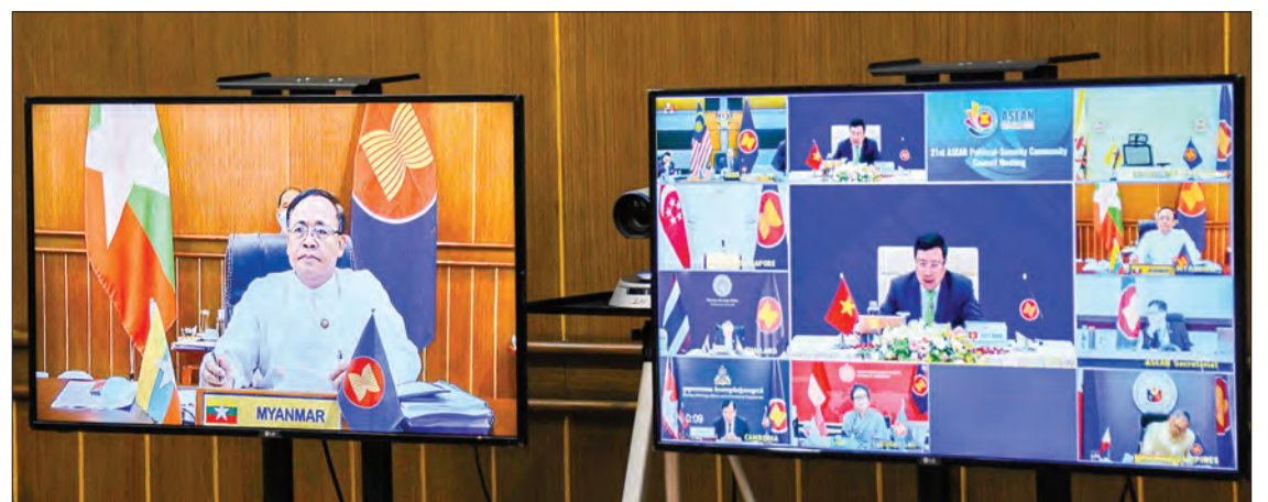
Union Minister U Kyaw Tin participates in meetings of ASEAN members countries on 24 June.

Present also at the Meetings were senior officials from the Ministry of Foreign Affairs, Ministry of Investment and Foreign Economic Relations and the Ministry of Religious Affairs and Culture.—MNA