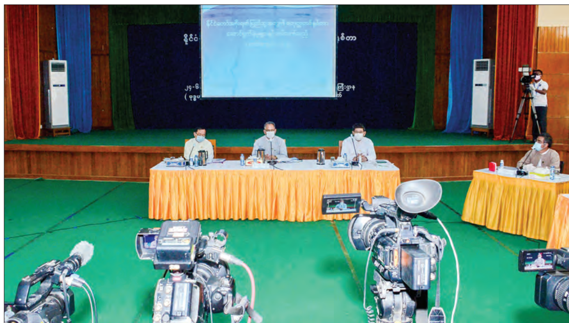
The Ministry of Investment and Foreign Economic Relations explains 4 th -year performances under the present government on 24 June.