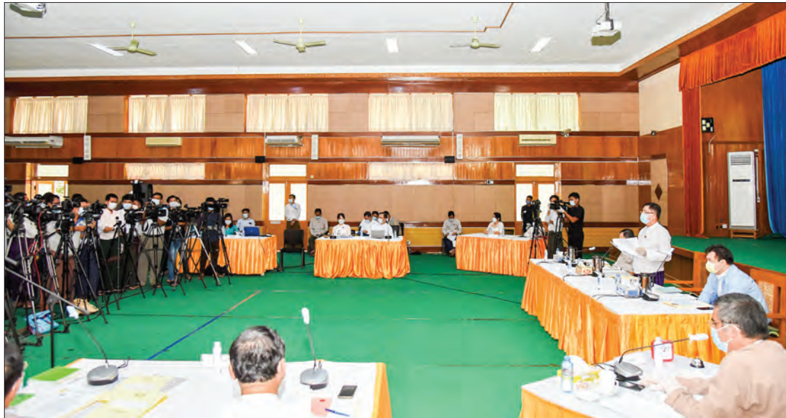
Ministry of Planning, Finance and Industry briefs on its 4 th -year performances under this administration, on 24 June.

In financial sector, the Myanmar Economic Bank is giving out low-interest loans after received two step loan from Japan, the first loan of Yen5.033 billion and the second one Yen15 billion, through the Myanmar Economic Bank and the 10 private banks. The Myanmar Economic Bank is providing 1 per cent and 1 year-term loan to the hotel and tourism sectors, SMEs and the