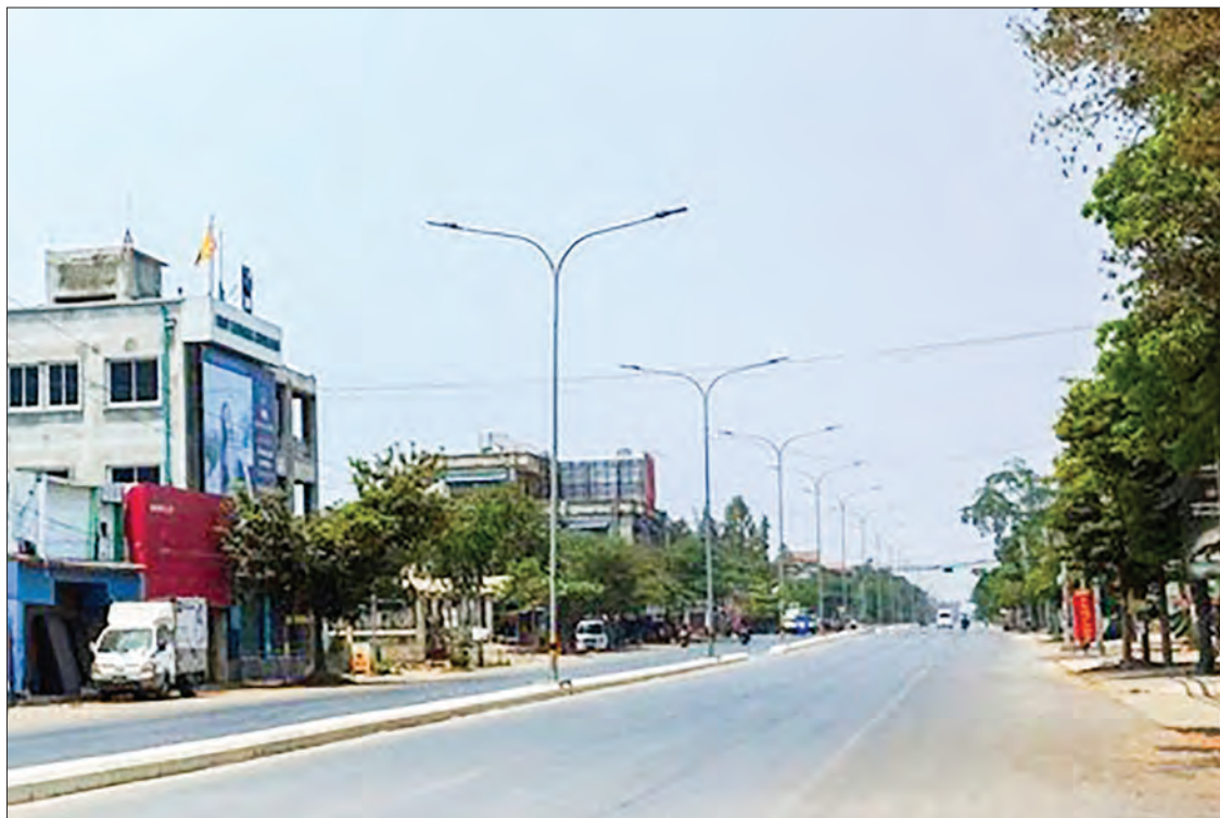
Installed lamp posts are seen in Pyigyidagun township in Mandalay.

The lamp posts have already been installed on the main roads such as 62 nd road, 58 th road, Ka Naung road, Yaw