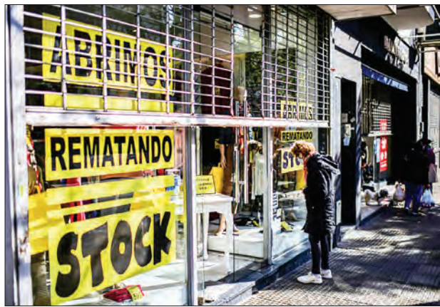
Buenos Aires' business federation says that at least 18 per cent of the city's 110,000 businesses have closed down since the beginning of the pandemic.