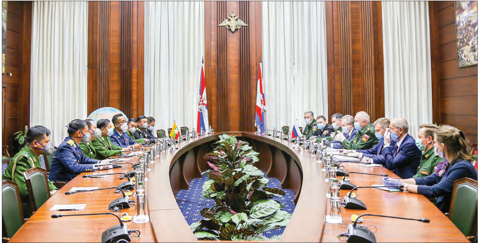
Senior General Min Aung Hlaing holds discussions with Deputy Minister of Defence Colonel General Alexander V. Fomin in Moscow on 23 June afternoon.

After the meeting, Senior General Min Aung Hlaing received the medal 'For Strengthening Military Cooperation' conferred by the Deputy Defence Minister. The Senior General