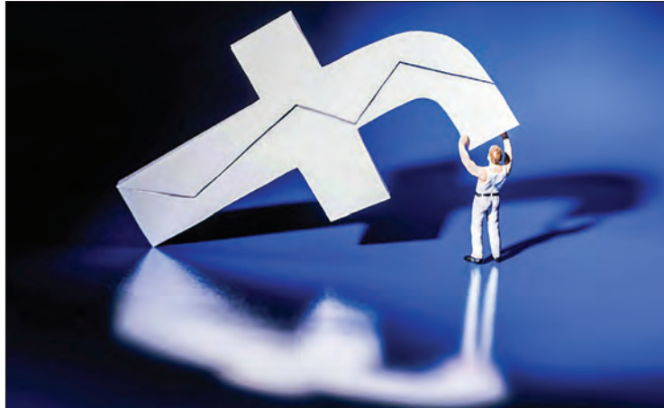
Ben & Jerry's joins a growing list of prominent brands boycotting the social network over its failure to crack down on hate speech and incitements to violence.

It is the latest company to pledge to halt ad spending on Facebook over concerns hate