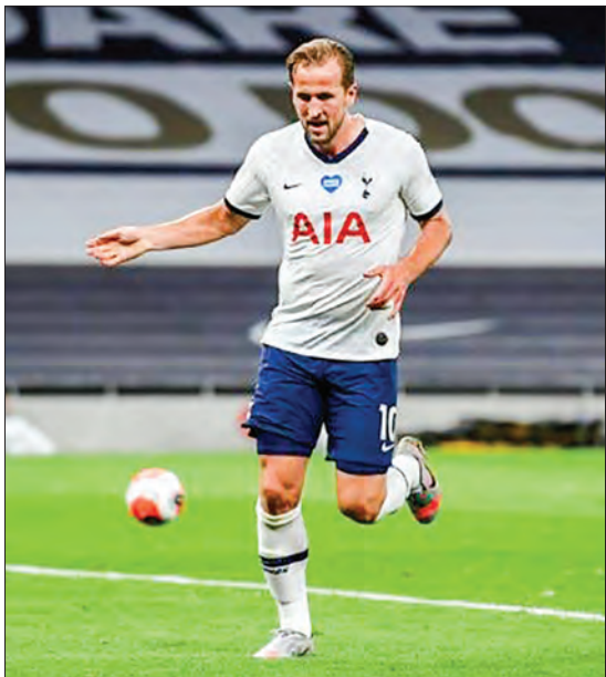
Back in business: Harry Kane scored his first goal of 2020 for Tottenham against West Ham.

“When you have been out for six months it is just getting that feeling back on the pitch. You can train as much as you want but being out here is