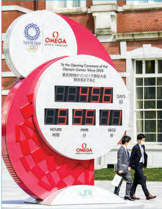
A large clock in front of JR Tokyo Station shows a countdown to the Tokyo Olympics on April 23, 2020.

TOKYO— The organizing committee of the Tokyo Games said Wednesday they have given up on holding celebrations this summer marking one year before the delayed Olympics open on July 23, 2021.