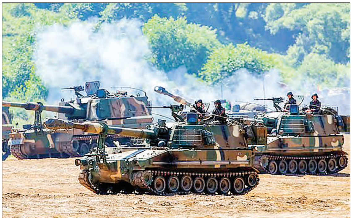
South Korean Army’s K-55 self-propelled howitzers move at a military training field in the border city of Paju on June 22.

On June 16, North Korea blew up the inter-Korean liaison office in the nation’s border city of Kaesong – one of the symbols of reconciliation on the Korean Peninsula. The following day, Pyongyang said its troops would redeploy to two areas that had been demilitarized under agreements with the South in retaliation for the scattering of anti-Pyongyang leaflets, sparking concern that