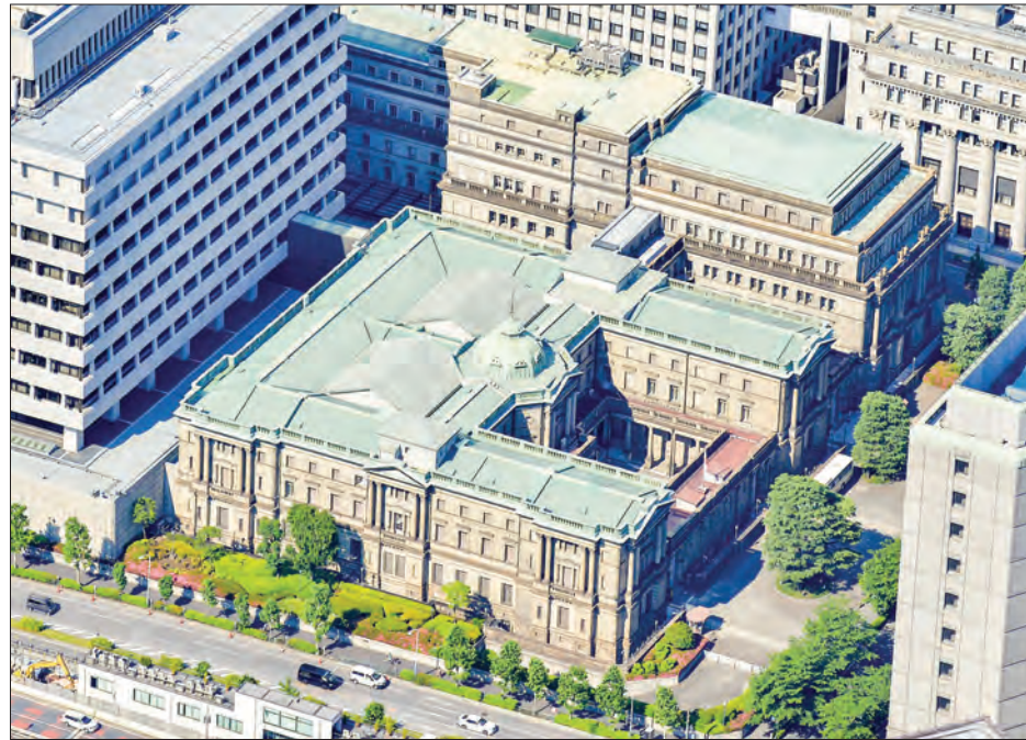
Photo taken on May 18, 2016, from a Kyodo News helicopter shows the Bank of Japan's head office in Tokyo.

TOKYO —Some Bank of Japan policymakers voiced concern at a meeting last week that the coronavirus pandemic could tip the country back into deflation, a summary of opinions released Wednesday showed.