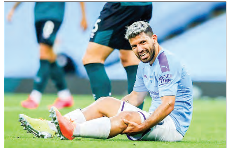
Manchester City striker Sergio Aguero suffered a knee injury against Burnley.

“It’s a pity but I’m in good spirits and so focused to come back as soon as possible. Thank you very much for all your messages!”—AFP ■