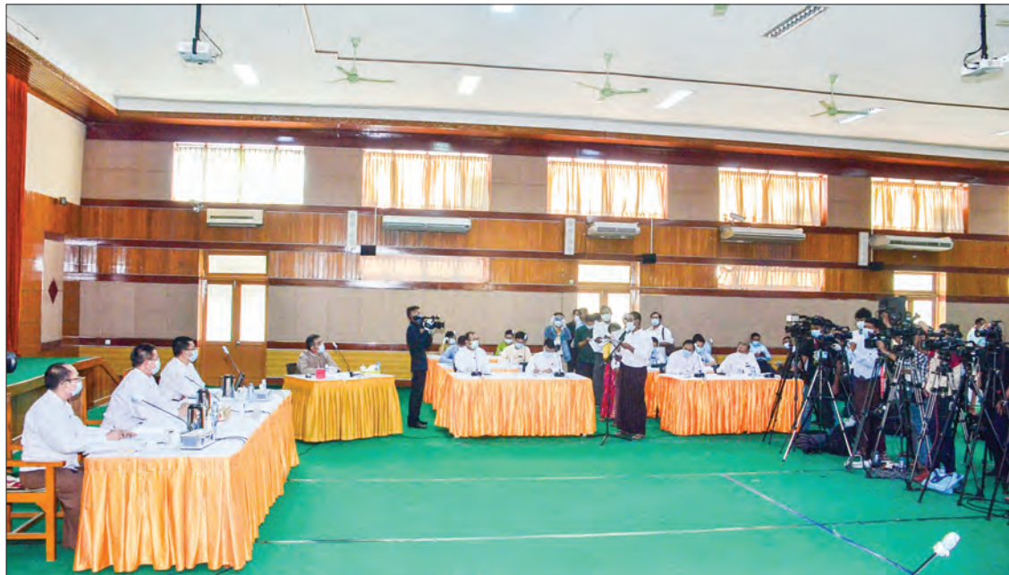
The Ministry of Commerce holds press briefing on 4 th -year performances under the present government on 24 June.