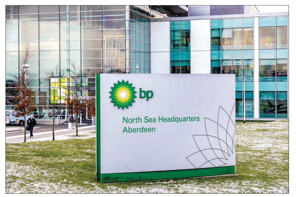
File photo shows the headquarters of BP (British Petroleum) are seen, in Aberdeen, Scotland on 21 January 2015.

Prices have however rebounded sharply in recent weeks as govern-