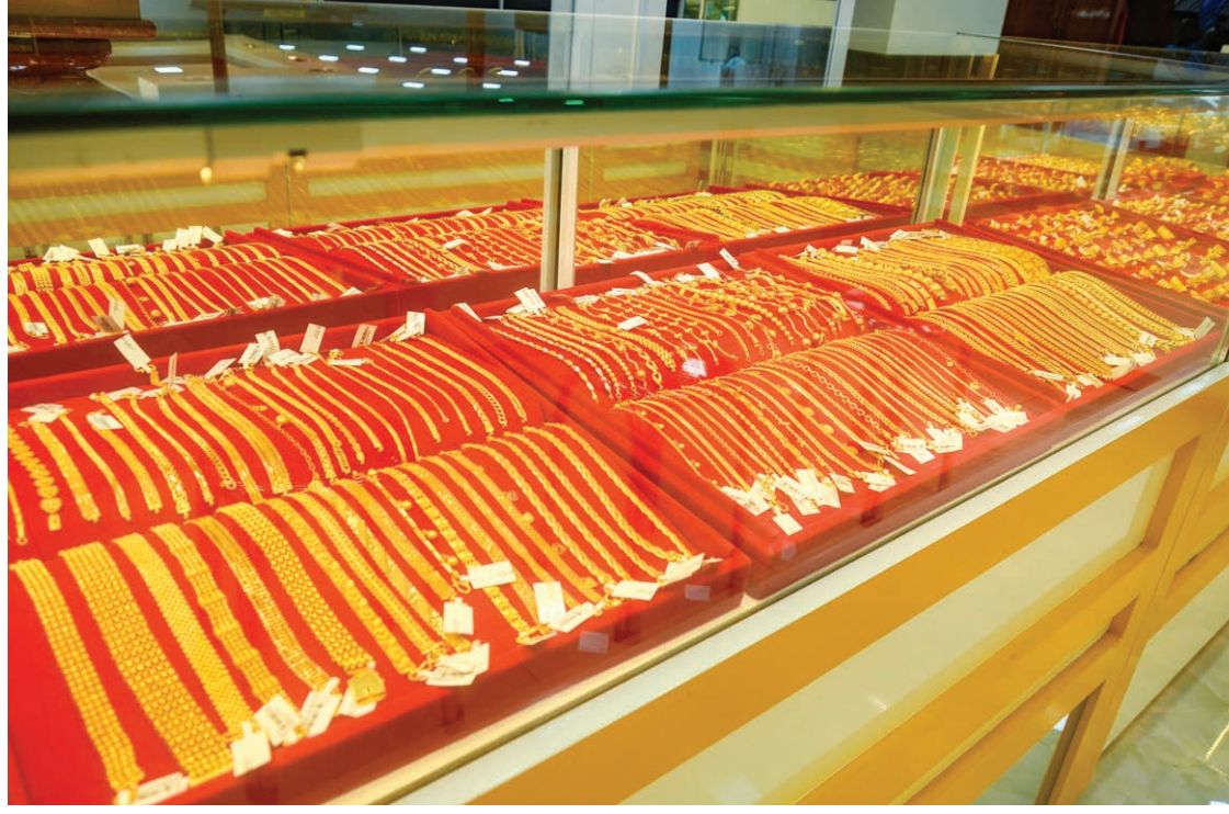
Gold jewellery on display at a shop in Yangon.

"The domestic gold price should have reached K1.3 million along with a rise in the global gold market. Myanmar people like to wear gold accessories. It is a kind of investment for local people. Some cash out gold during an emergency. When some purchased gold at K1.2 or 1.3 million,