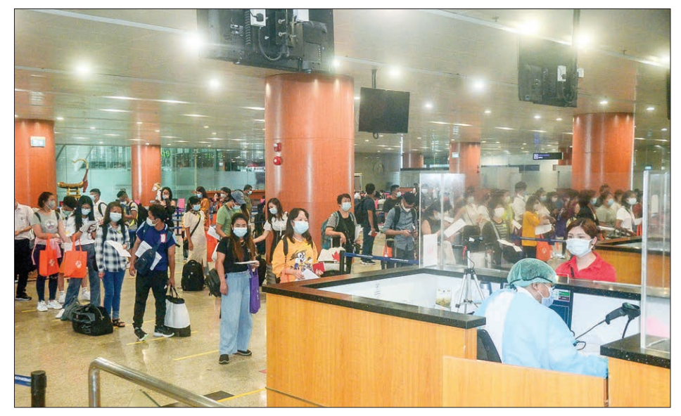
Myanmar returnees from Hong Kong and Macau are seen at Yangon International Airport on 29 June.

THE Myanmar National Airlines landed at Yangon International Airport at 3:20 pm with 121 nationals who were stranded in Hong Kong and Macau due to suspensions of flights to Myanmar amid the outbreak of COVID-19.