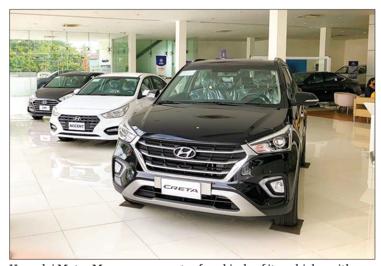
Hyundai Motor Myanmar promotes four kinds of its vehicles with special sales from 9 June to end of July.

Hyundai sells its cars in promotion prices to Myanmar customers