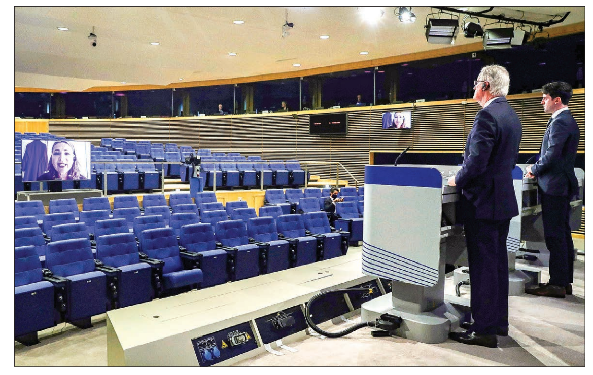
EU's Brexit negotiator Michel Barnier gives a press conference after a Brexit negotiations meeting, at the EU Commission, in Brussels on 5 June 2020.

German Chancellor Angela Merkel -- whose government takes over the presidency of the EU next week -- has also sharpened her public stance, questioning whether London actually