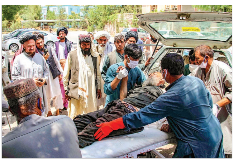
A victim, injured in an explosion at a cattle market in Sangin district, is brought to a hospital in LashkarGah city of Helmand province on 29 June 2020.

Rockets hit the market at 9:00 am local time after which a car bomb exploded, the gover-