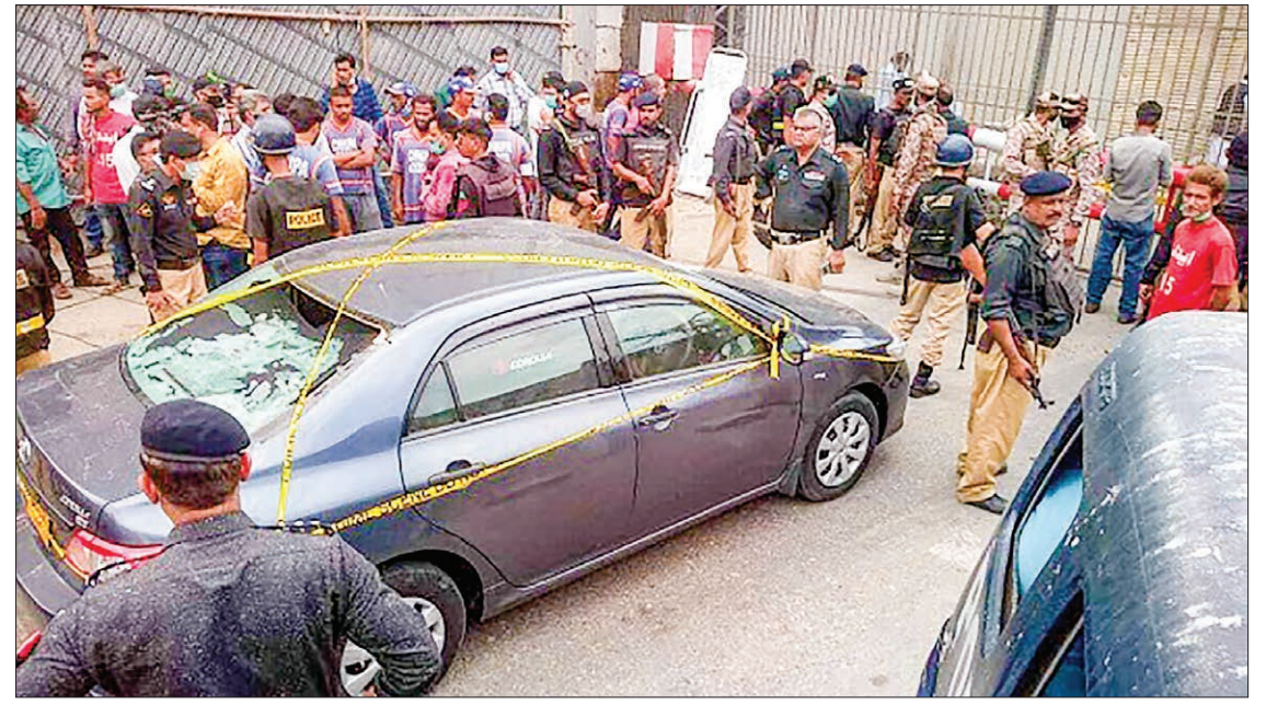
Police officers inspect the site after gunmen attacked the Pakistani stock exchange building in Karachi, Pakistan on 29 June.

KARACHI (Pakistan) — Baloch separatists opened fire and hurled a grenade at the Pakistan Stock Exchange in Karachi Monday, authorities said, killing six people including a policeman.