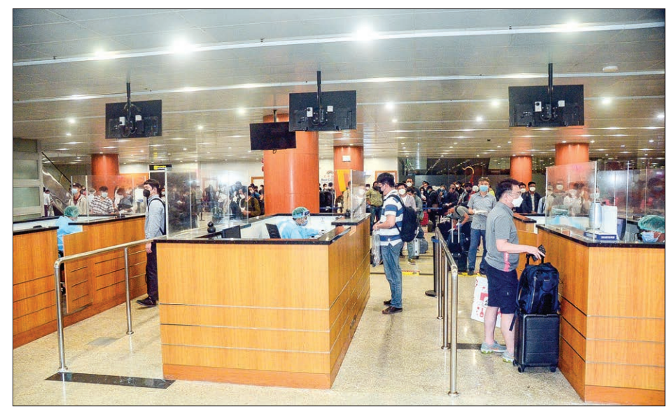
Myanmar nationals returned from Republic of Korea queuing for immigration process at Yangon International Airport on 29 June.

As per the directives of National-Level Central Com-