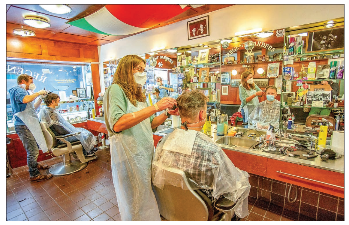
A hairdresser, wearing PPE (personal protective equipment), of a face mask or covering as a precautionary measure against spreading COVID-19, is reflected in a mirror as she cuts the hair of a customer, also wearing a face covering, in Dublin on 29 June 2020.

PARIS (France) — Here are the latest developments in the coronavirus crisis: