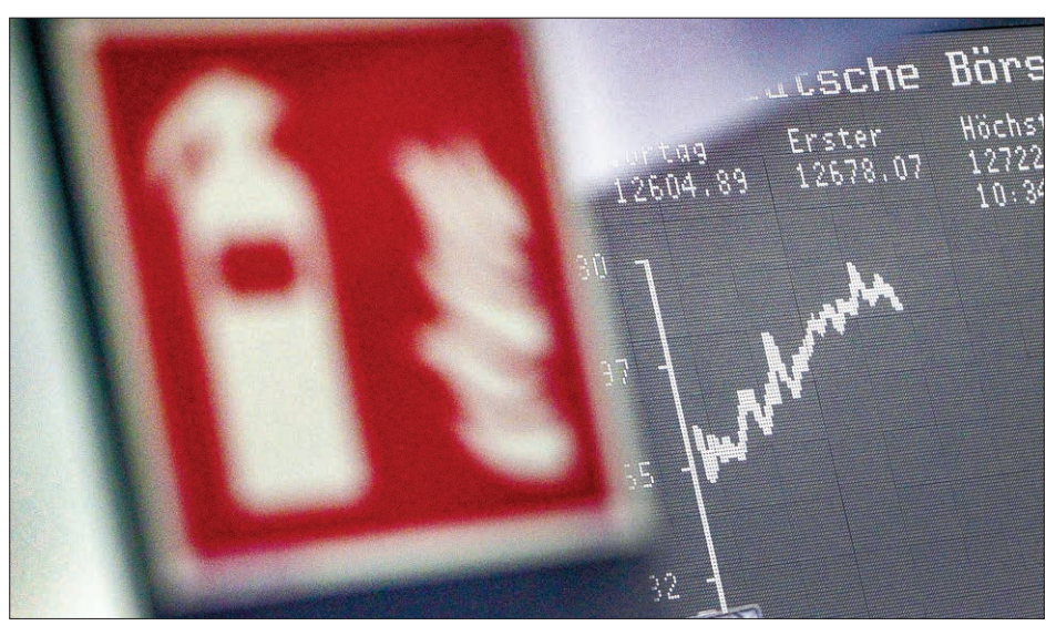
File photo shows A board displaying the chart of Germany's share index DAX is seen behind a sign indicating the location of a fire extinguisher on 1 June 2018 at the stock exchange in Frankfurt am Main, western Germany.