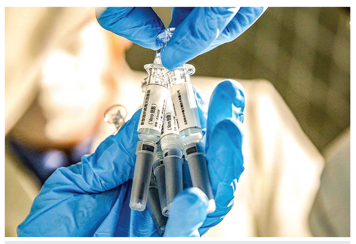
A staff member displays samples of the COVID-19 inactivated vaccine at Sinovac Biotech Ltd., in Beijing, capital of China, on 16 March 2020.

In fact, new infections have emerged in many countries as they reopen. In Europe, 30 countries had seen increases in new