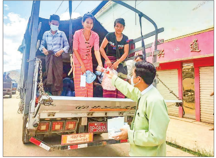
Local authorities are helping returnees from China at Chinshwehaw border town with medical tests and providing foods and supplies to them.

LOCAL authorities in Chinshwehaw border town of northern Shan State received 80 Myanmar returnees from China on 28 and 29 June.