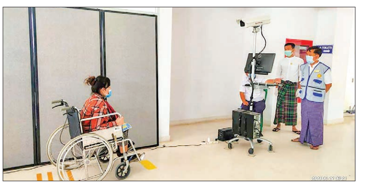
Health workers are conducting medical tests to a returnee from Thailand at Myawady border Town on 29 June.

608 Myanmar nationals come back home via Myawady border bridge on 29 June