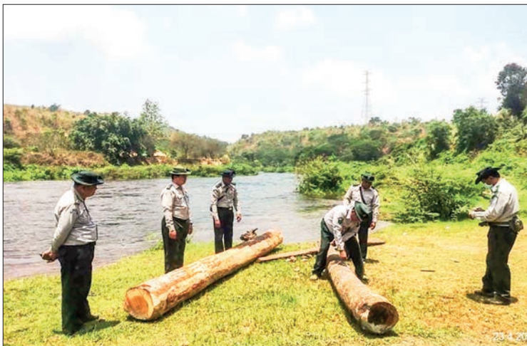
Officials confiscate illegal teak logs.

SUPERVISED by the Anti-Illegal Trade Steering Committee, effective action is being taken to prevent illicit trade under the law.