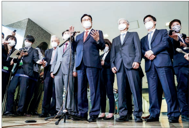
Chung Jin Suk (C), deputy speaker of South Korea's National Assembly and the head of a delegation to Japan sent by South Korean President-elect Yoon Suk Yeol, speaks to reporters at the Japanese Foreign Ministry in Tokyo on 25 April 2022, after holding talks with Japanese Foreign Minister Yoshimasa Hayashi.

FOREIGN Minister Yoshimasa Hayashi and members of a delegation sent by South Korean President-elect Yoon Suk Yeol pledged Monday to improve the two nation's ties, which have sharply deteriorated over war-time issues, the delegation's