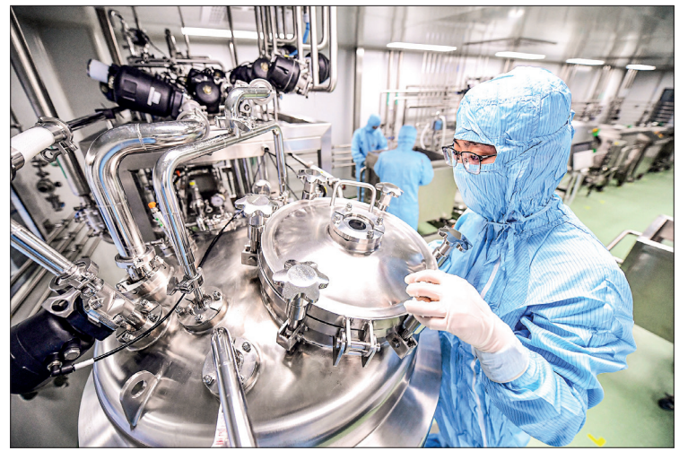
An employee works at a facility producing a Covid-19 coronavirus vaccine, which is currently undergoing clinical tests, in Shenyang in China's northeastern Liaoning province on 19 April 2022.

Since British physician Edward Jenner came up with the first vaccine in 1796 for smallpox, several different kinds have been developed. Inactivated vaccines, which are used for polio and influenza, kill or inactivate the germ, but retain its ability to produce antibodies to fight future infections. Attenuated vaccines — used for measles, mumps and rubella as well as chickenpox — contain a weakened version of the virus, again to boost antibodies. More recently, viral vector vaccines, used for Ebola or AstraZeneca and Johnson & Johnson's Covid vaccines, take a modified version of a different, harmless virus to smuggle genetic instructions to the body's cells, telling them to make antibodies. The newest