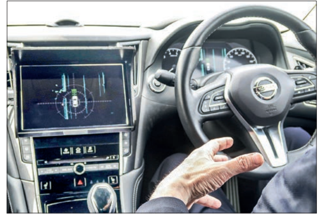
Photo taken in Yokosuka, Kanagawa Prefecture, on 18 April 2022, shows a monitor screen on a Nissan Motor Co test vehicle showing the position of objects in the vehicle's surroundings detected by sensors.

Nissan's domestic rival Honda Motor Co is integrating artificial intel-