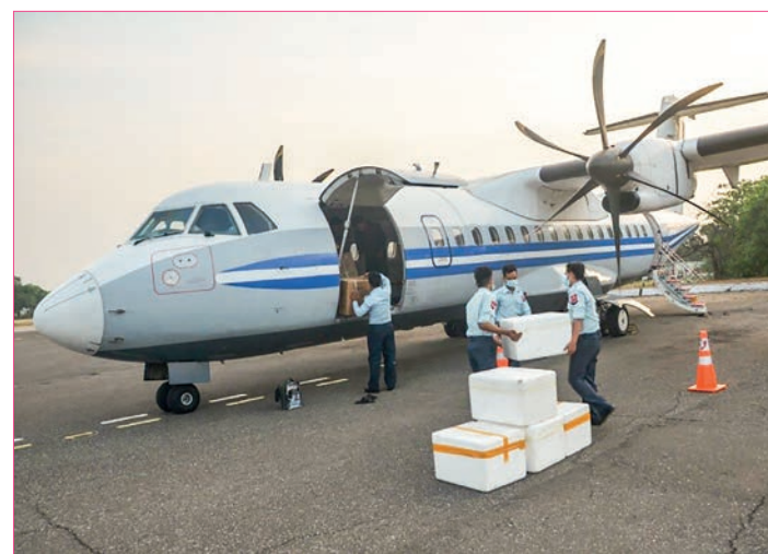
Tatmadaw aircraft transport vaccines to regions/ states.

tra Zeneca COVID-19 vaccine and 16,000 doses of Sinovac to Kengtung, 2,000 doses of Astra Zeneca and 2,728 doses of Covishield to Lashio, 24,130 doses of Sinovac to Dawei, 15,650 doses of Sinovac to Myeik, 5,920 doses of Sinovac to Kawthoung, 3,750 doses of Sinovac to Loikaw, 3,450 doses of AstraZeneca, 5,307 doses of Covishield and 7,8570 doses of Sinovac to Sittway, 1,975 doses of Astra Zeneca, 5,387 doses of Covishield and 23,590 doses of Sinovac to Thandwe were transported by Tatmadaw air-