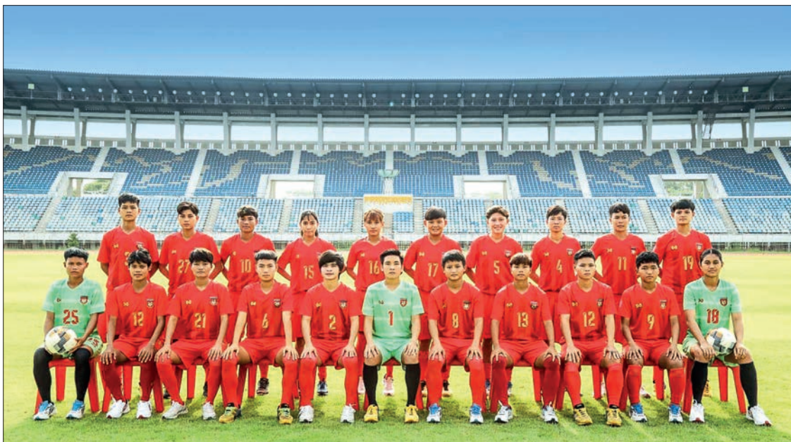
Myanmar Women's Footballers pose for a group photo at the Thuwunna Stadium in Yangon.

THE Myanmar women's national team left for South Korea on the morning of 24 April to play friendly matches in preparation for the 31 st SEA Games.