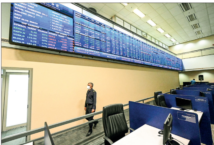
A man walks inside Colombo Stock Exchange (CSE) in Colombo on 18 April 2022.

CRISIS-HIT Sri Lanka's stock exchange halted again Monday after a nearly 13 per cent plunge, derailing the bourse's tentative reopening after a two-week break aimed at forestalling a market collapse.