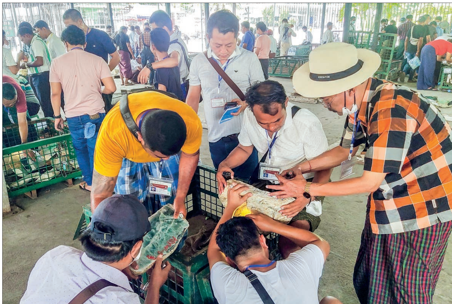
Gems merchants are pictured evaluating gemstones at the 57 th Myanma Gems Emporium in Nay Pyi Taw on 25 April 2022.

The 57 th Myanma Gems Emporium is held at Mani Yadana Jade Hall from 22 to 28 April.