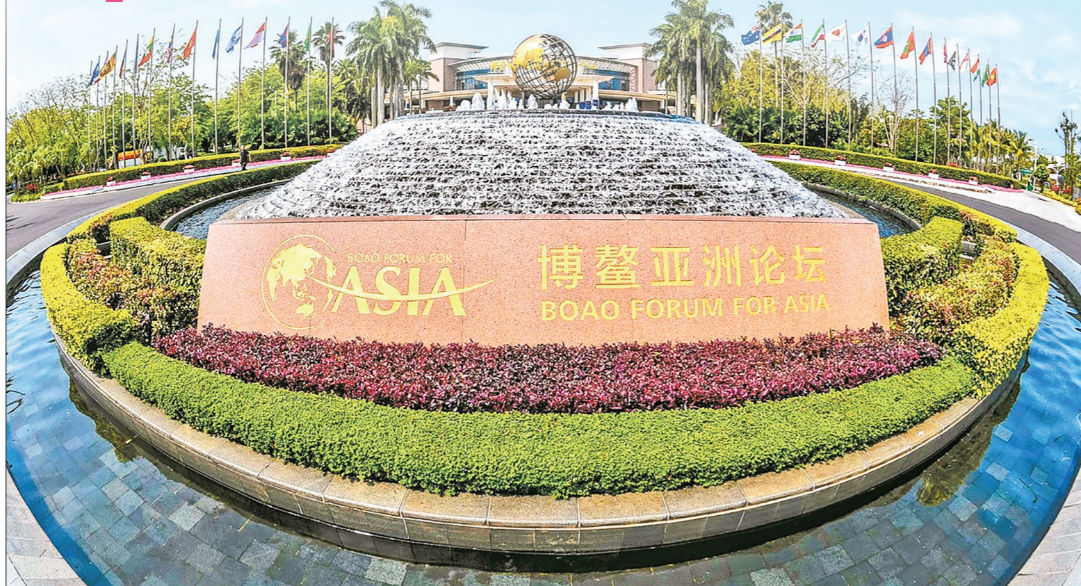
Photo taken on 19 April 2022, shows the Boao Forum for Asia (BFA) International Conference Centre in Boao, south China's Hainan Province.

DEFYING headwinds from the lingering COVID-19 pandemic, fragile global economic recovery and complex geopolitics, the Boao Forum for Asia (BFA) Annual Conference 2022 has voiced the importance of an open mind and coordinated global actions loud and clear.