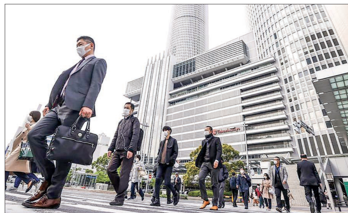
People wearing masks walk on the street in Nagoya, Japan, 17 April 2020.