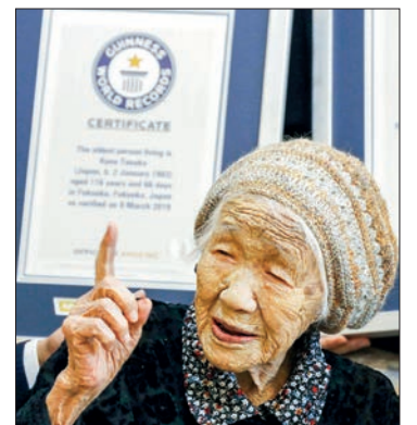
File photo taken March 2019 in the southwestern Japan city of Fukuoka shows Kane Tanaka when she was recognized as the world's oldest living person by Guinness World Records at 116. Tanaka has died aged 119.

She was recognized by Guinness World Records as the world's oldest person in March 2019, at the age of 116. In addition, she became the