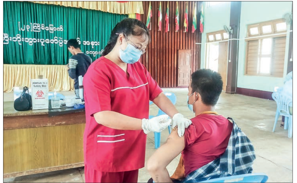
A local in Shan State (North) is seen receiving a vaccine against COVID-19.

It is reported that officials from the respective military commands visited the site and coordinated the necessary work. — MNA