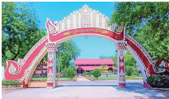
The Lacquerware College in Bagan.