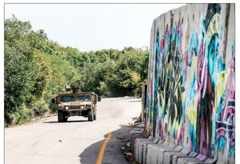
An Israeli military jeep patrols the border fence with Lebanon, near the northern Israeli settlement of Shtula on 25 April 2022, after a projectile was fired from Lebanon into northern Israel, prompting a retaliation. The projectile fell in an open field near a kibbutz, Israel's army said in a statement which made no mention of casualties.

oldest person ever on record in Japan after turning 117 years, 261 days old in September 2020. — Kyodo