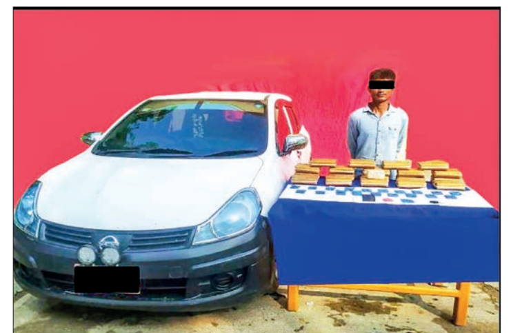
An arrestee is pictured along with seized drugs and a car.