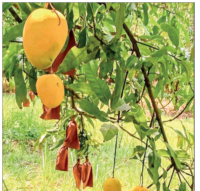
Prevailing prices of Seintalone mangoes are K33,000-K35,000 per 16-kilogramme basket, which contains 50-60 packed mangoes in protection bags.

The prices of protection bags increased from K27 to K47 per bag this year. Some farm owners cannot bear the cost burden and make outright mango purchases. — Min Htet Aung (Mandalay Sub-Printing House)/GNLM