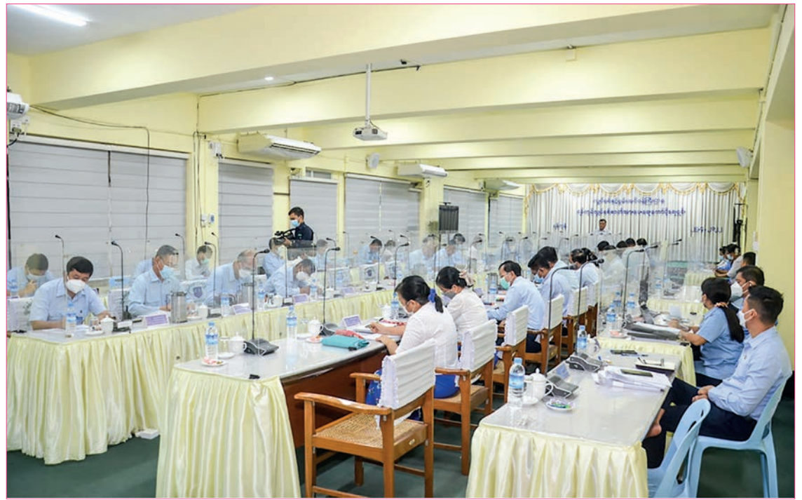
The meeting was also attended by Yangon Region Minister for Natural Resources U

Arrangements are being made to generate electricity from other sources to meet electricity consumption, and the main goal of the ministry is to generate and distribute electricity to the people with minimal loss of power and full voltage in a timely manner. He also urged attendees to work together for regular meter readings, meter distribution and electricity billing, including collecting previous electricity bills.