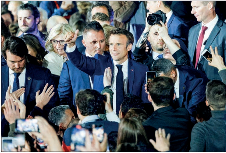
French President and La République en Marche (LREM) party candidate for re-election Emmanuel Macron (C) gives a thumbs up as he greets supporters after his victory in France's presidential election, at the Champ de Mars in Paris, on 24 April 2022.

FRENCH President Emmanuel Macron was Monday to launch efforts to unite a deeply divided nation after winning re-election in a battle against rival Marine Le Pen that saw the far right come its closest yet to taking power.