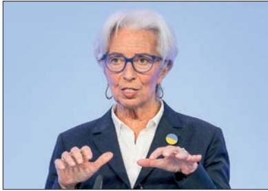
Christine Lagarde, President of the European Central Bank (ECB) holds a news conference following the meeting of the governing council of the ECB in Frankfurt am Main, western Germany, on 10 March 2022.

A European Central Bank rate hike will not reduce energy prices, the cause of half of the continent's inflation, ECB president Christine Lagarde said Sunday, even as the institution faces pressure to raise interest rates.