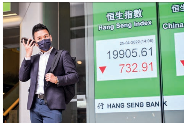
A man uses his phone next to a sign showing the numbers for the Hang Seng Index before the close, as Hong Kong shares fell on 25 April 2022.

Officials' determination to continue with a zero-Covid policy as well as a lack of government stimulus, "that all points to lower China stocks and we are going to see a weaker yuan going forward".