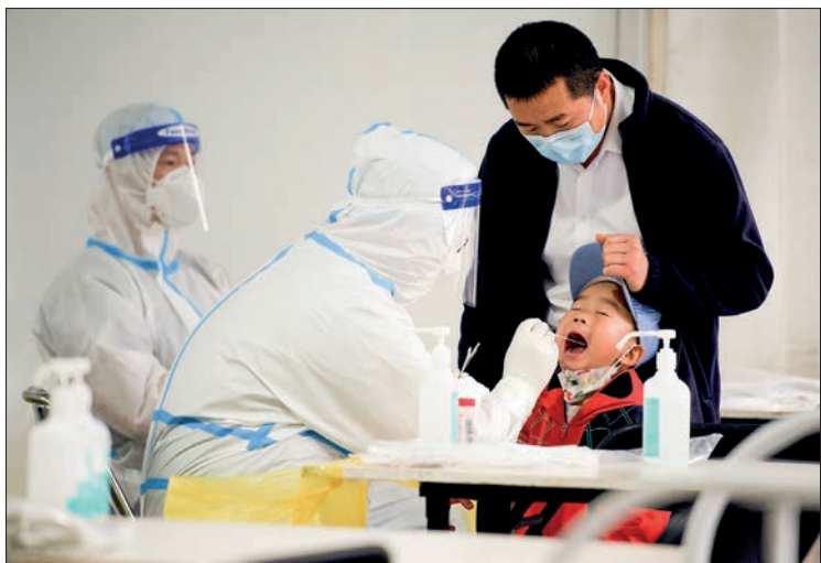
A health worker takes swab sample on a child to be tested for Covid-19 coronavirus at a swab collection site along a street in Beijing on 25 April 2022.

FEARS of a hard Covid lockdown sparked panic buying in Beijing on Monday, as long queues for