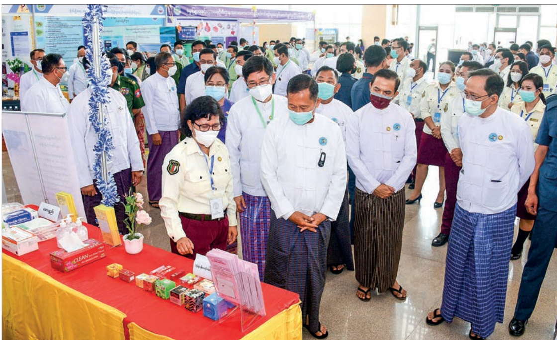
The Vice-Senior General looks around the booths to initiate the National Food Safety Policy at the event.

In the second session of the meeting, the director-general of the Department of FDA introduced the national food safety policy, and the Consumer Affairs Department officials discussed it. — MNA