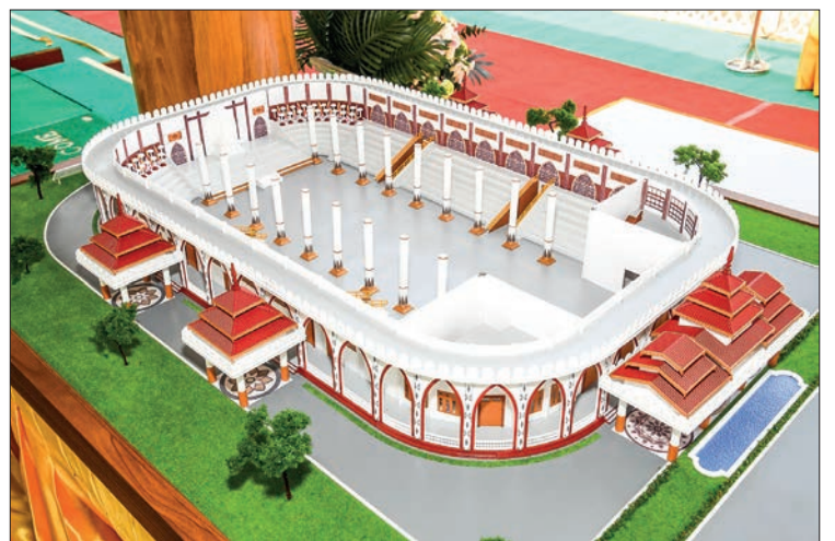
A miniature of the ordination hall.

a stand for 180 members of the Sangha and 1,890 laypersons capacity on the hall and both side rows. It will be the largest ordination hall in Myanmar. — MNA