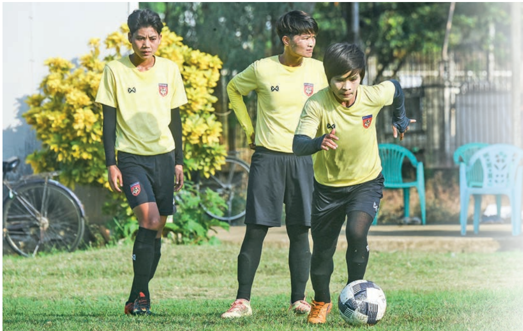
Myanmar women's team is seen under training in Yangon before leaving for South Korea.

THE Myanmar women's soccer team, taking a training in South Korea in preparation for the 31 st SEA Games, will start a friendly match on 29 April.