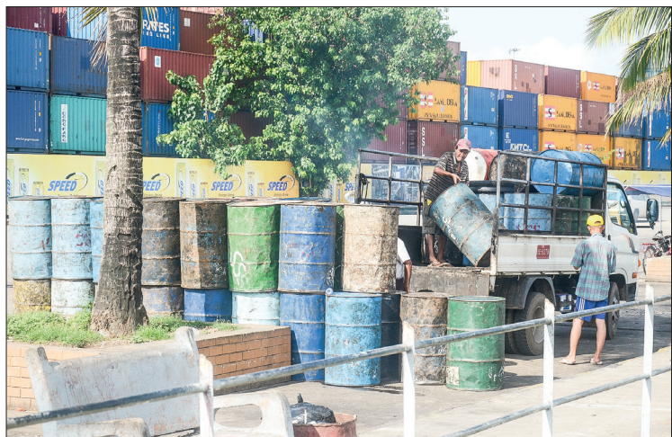
The price of palm oil rocketed up to over K7,000 per viss in the domestic market, tracking Indonesia's palm oil export policy.

THE reference price of palm oil is set at K5,620 per viss (a viss equals 1.6 kilogrammes) on 1 May, and the Department of Consumer Affairs is controlling the market to ensure price stability.