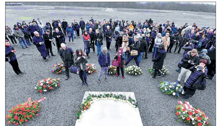
People attend a commemoration ceremony at a memorial plate for the victims of Nazism on 26 January 2018 in Weimar, central Germany, at the roll call area of the former Buchenwald Nazi concentration camp, one day before the International Holocaust Remembrance Day.

AUSTRIA on Tuesday dissolved a fund set up in 2001 to compensate victims of Nazism, saying it had "fully completed its tasks", according to a statement sent to AFP.