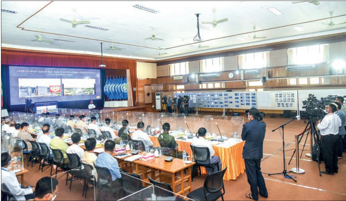
The SAC's Information Team holds its 13 th press conference in Nay Pyi Taw yesterday.