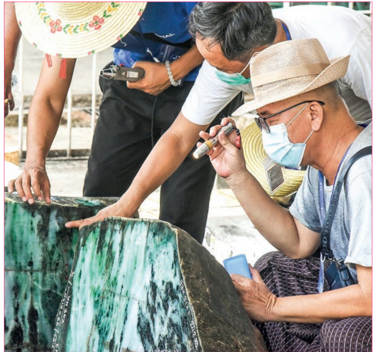
Gemstone traders are looking into the jade at the 57 th Myanmar Gems Emporium.