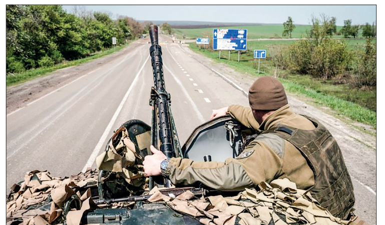
26 April: A Ukrainian soldier sits on an armoured personnel carrier driving on a road near Sloviansk, a city of more than 100,000 in eastern Ukraine.

The defence ministry said that Russian forces had pushed out Kyiv's army from Velyka Komyshevukha and Zavody in the Kharkiv region and had gained control over Zarichne and Novotoshkivske in the Donetsk region.