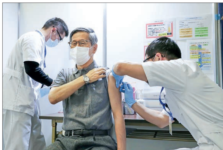
Shigeru Omi, the Japanese government's top COVID-19 adviser, receives his third shot of coronavirus vaccine at a mass vaccination centre in Tokyo's Otemachi area on 5 February 2022.

The booster shot vaccination rate in countries like Singapore and Britain is higher. Singapore's rate stood at 73 per cent as of Saturday. A study at Nagasaki University in southwestern Japan found that among those aged