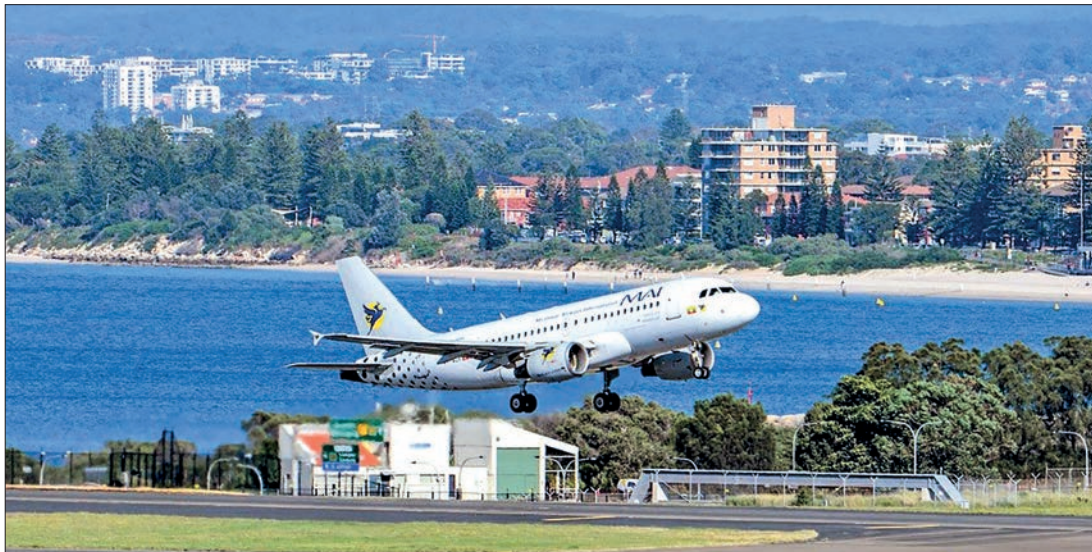
One of the MAI aircraft.

INTERNATIONAL flights were reopened at Yangon International Airport on 17 April, with