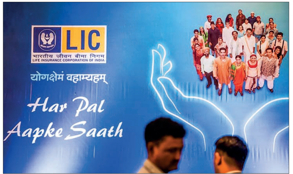
People walk past a promotional poster for the Life Insurance Corporation of India in Mumbai.

The long-awaited IPO — originally slated for March — will open next week, the filing seen by AFP showed, after the government chose to wait out recent market volatility triggered by the Russian invasion of Ukraine.