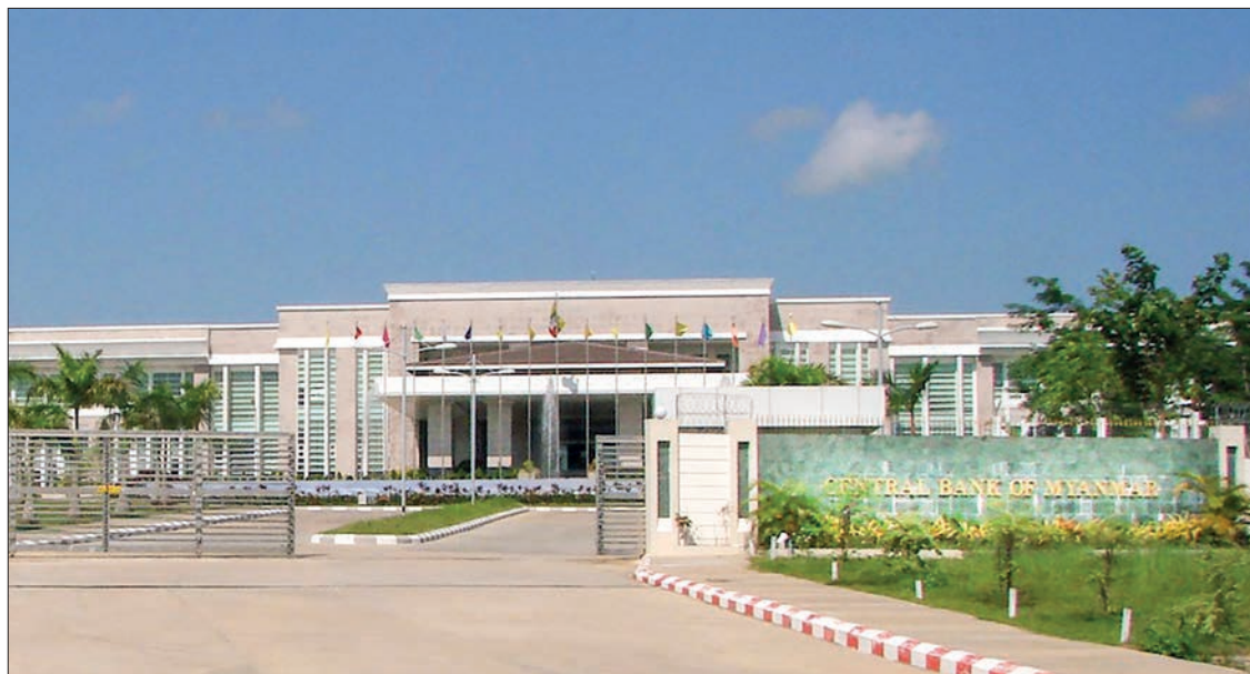
The Office of the Central Bank of Myanmar.

has issued a statement saying Myanmar Apex Bank Limited bank do not have to worry. — that those who have savings in and people working with the