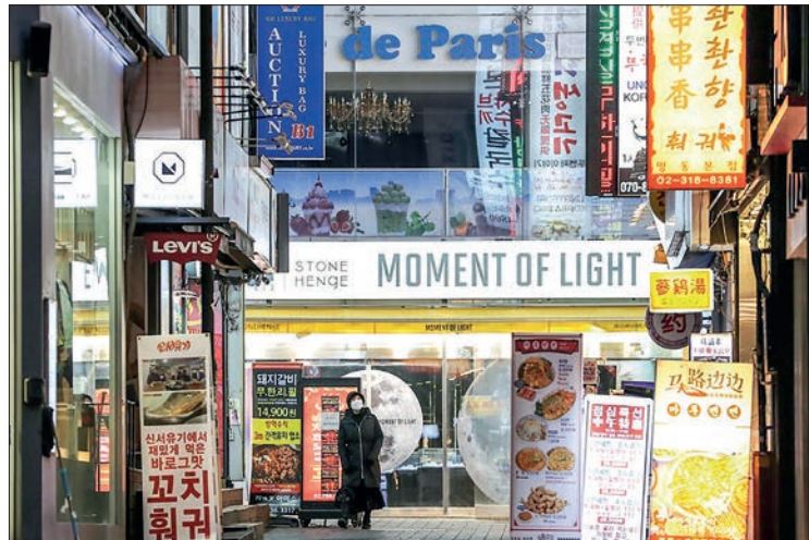
A woman wearing a face mask visits the Myeongdong shopping area in Seoul, South Korea, 8 December 2020.