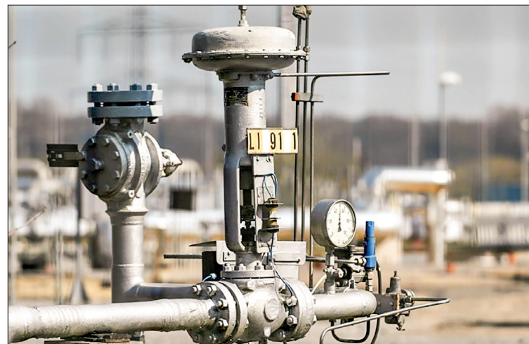
Russia halted gas supplies to Poland and Bulgaria on Wednesday, after blasts in a breakaway region of neighbouring Moldova led Kyiv to accuse Moscow of seeking to expand the Ukraine war further into Europe. PHOTO: AFP

Explosions this week targeting the state security ministry, a radio tower and military unit in neighbouring Moldova's region of Transnistria — occupied by Moscow's forces for decades — followed a Kremlin commander's claims Russian speakers in the country were being oppressed. That triggered alarm that Moldova could be Russia's next target in its push into Europe, with Moscow having exploited similar fears after launching its bloody invasion of Ukraine on 24 February.—AFP