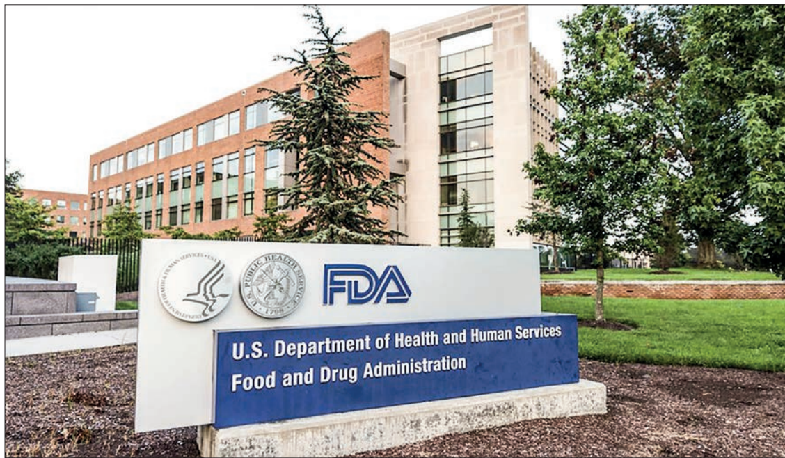
Photo taken on 23 August 2021 shows the US Food and Drug Administration in Silver Spring, Maryland, the United States.

THE US Food and Drug Administration (FDA) on Monday expanded its approval of the COVID-19 treatment Veklury, also known as remdesivir, to include paediatric patients 28 days of age and older weighing at least 3 kilogrammes who are infected