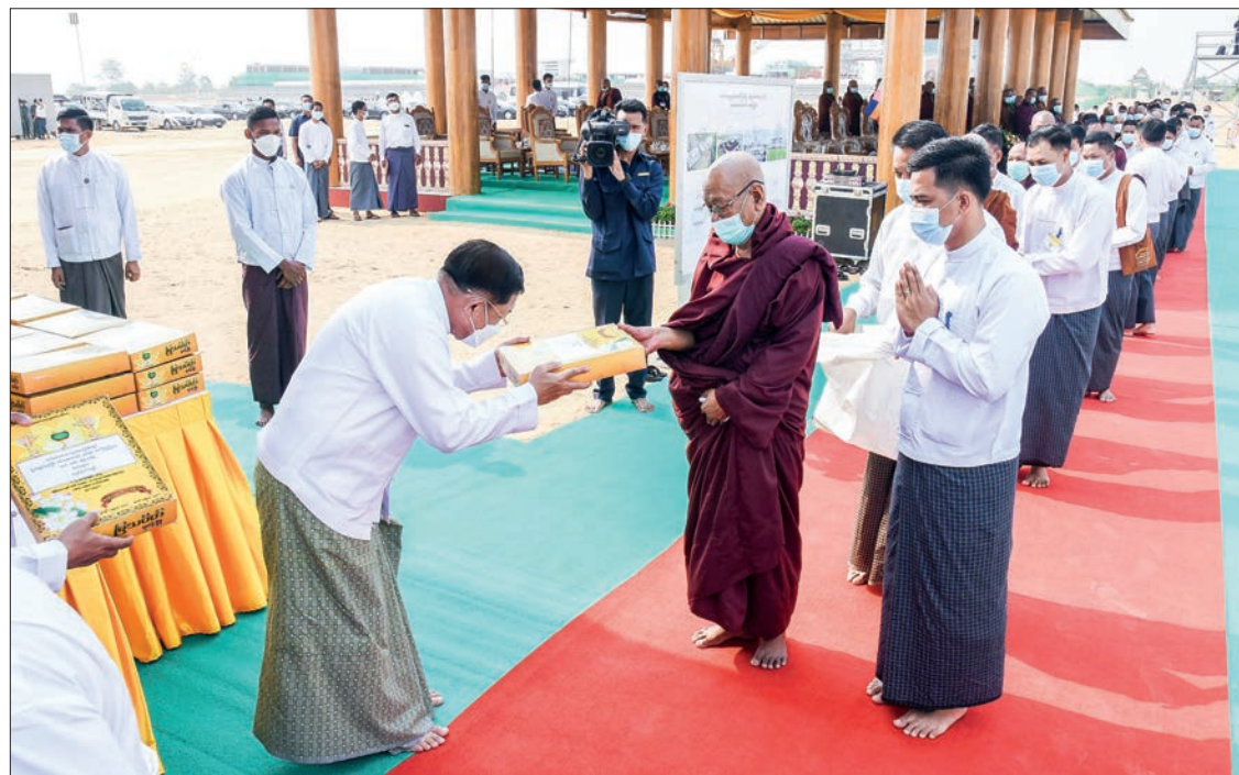
The Senior General presents offerings to members of the Sangha.

pati Visumgama ordination will be consecrated with the advice of venerable Sayadaws and the guidance of the Senior General. The ordination hall will be 208 feet long and 205 feet wide, with