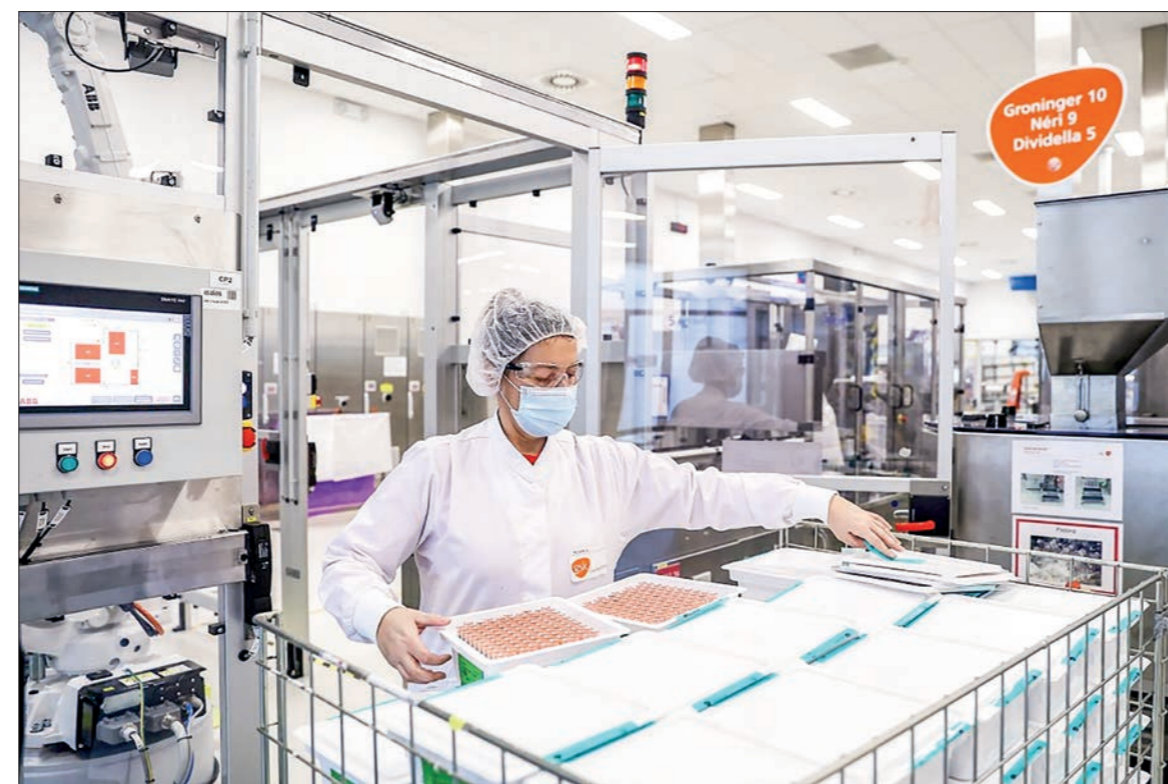
A GSK employee is at work at the factory of British pharmaceutical company GlaxoSmithKline (GSK) in Wavre on 8 February 2021 where the Covid-19 CureVac vaccine was produced.

“That makes it a little bit trickier, because now you're fighting head-to-head with the virus,”