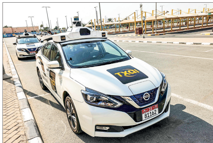
One of the self-driving taxis being used in a tech demonstration to transport passengers to the nearby Yas Island, in the capital Abu Dhabi, United Arab Emirates, 30 November 2021. PHOTO: AFP

The UAE's stated goal is to become one of the leading AI nations by 2031, creating new economic and business opportunities and generating up to 335 billion dirhams ($91 billion) in extra growth.—AFP