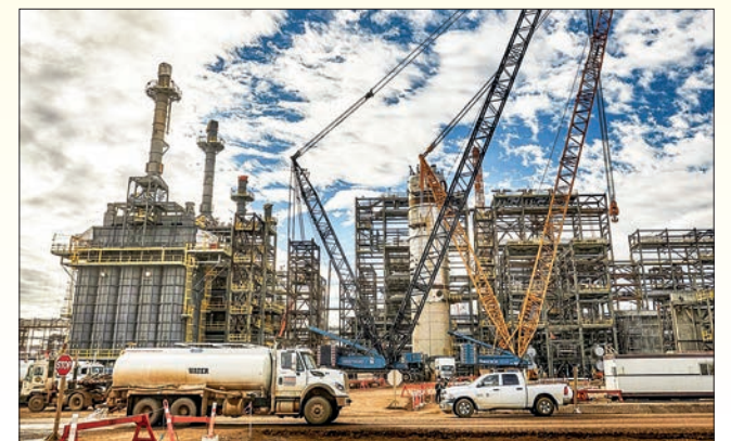
Canada's oil and natural gas industry is active in 12 of 13 provinces and territories.

CANADA'S environmental watchdog on Tuesday slammed the government for bungling a transition to a low-carbon economy, accusing it of providing no support for energy workers facing job losses and overestimating the role of hydrogen fuel.