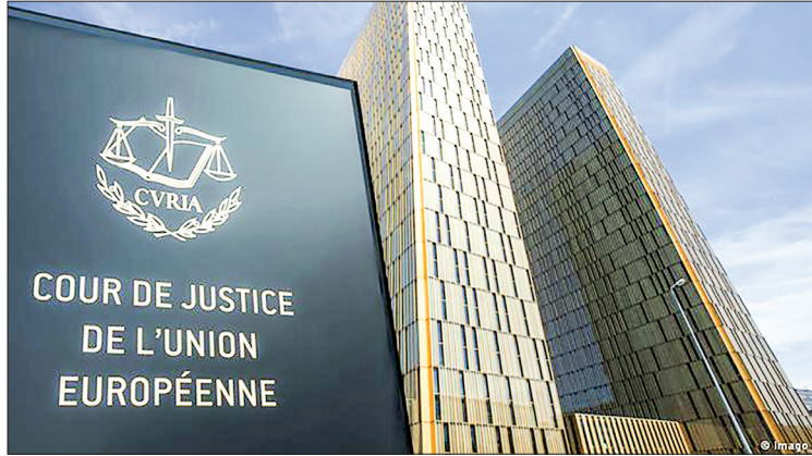
The EU wanted the copyright legislation to be brought into law by 2021.

A top European Union court on Tuesday dismissed Poland's complaint against the bloc's copyright reform, ruling that it does not threaten freedom of expression as feared by Warsaw.