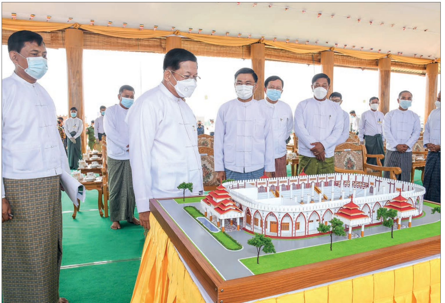
State Administration Council Chairman Prime Minister Senior General Min Aung Hlaing views the scale model of the ordination hall at the event in Nay Pyi Taw on 27 April 2022.