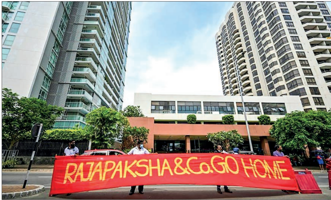
Protesters have demanded President Gotabaya Rajapaksa's resignation over Sri Lanka's crippling economic crisis.