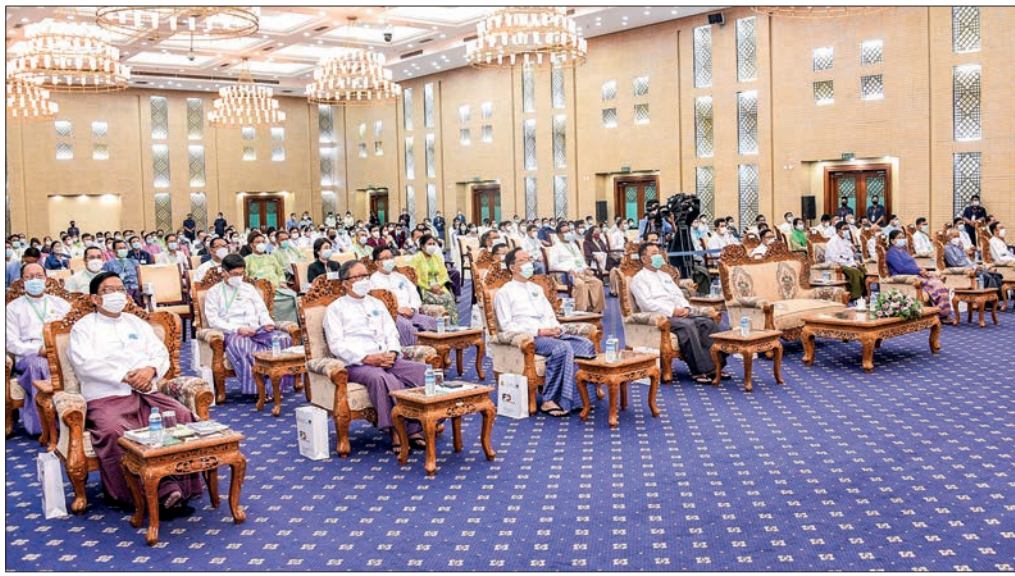
State Administration Council Vice-Chair Deputy Prime Minister Vice-Senior General Soe Win addresses the ceremony to introduce the National Food Safety Policy in Nay Pyi Taw yesterday.

Departments under the Ministry of Agriculture, Livestock, and Irrigation supervise the production of basic foodstuffs in line with the agricultural and livestock practices. Moreover, these departments transfer technologies to producers to abide by the good agriculture practices and issue the certificates. Following the Myanmar GAP will be a per-