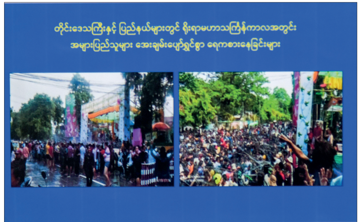
One of the photo panels at the 13 th press conference.

The press conference was also attended by members of the Information Team of the State Administration Council, officials of the Tatmadaw Information Team, guests and reporters from local news agencies, daily newspapers, and local TV channels and local-based foreign news agencies. —MNA